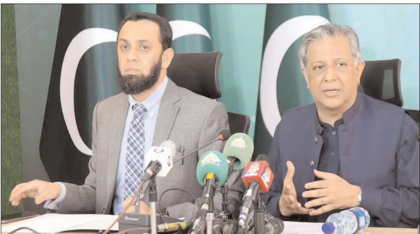
ISLAMABAD: Federal Minister for Law and Justice, Senator Azam Nazeer Tarar and Federal Minister for Information and Broadcasting, Attaullah Tarar addressing during a press conference.

She called for the international community's efforts to prevent Israel from committing the egregious crimes in Palestine and the UN Security Council to impose an immediate prominent ceasefire, urge Israel to lift the siege of Gaza, facilitate humanitarian assistance, protect the civilians, and hold the perpetrators of the genocide accountable. Reiterating Pakistan's full support to the people of Palestine, she called for the establishment of an independent, viable, and contiguous Palestinian state with pre-1967 borders and Quds Al-Sharif as its capital.