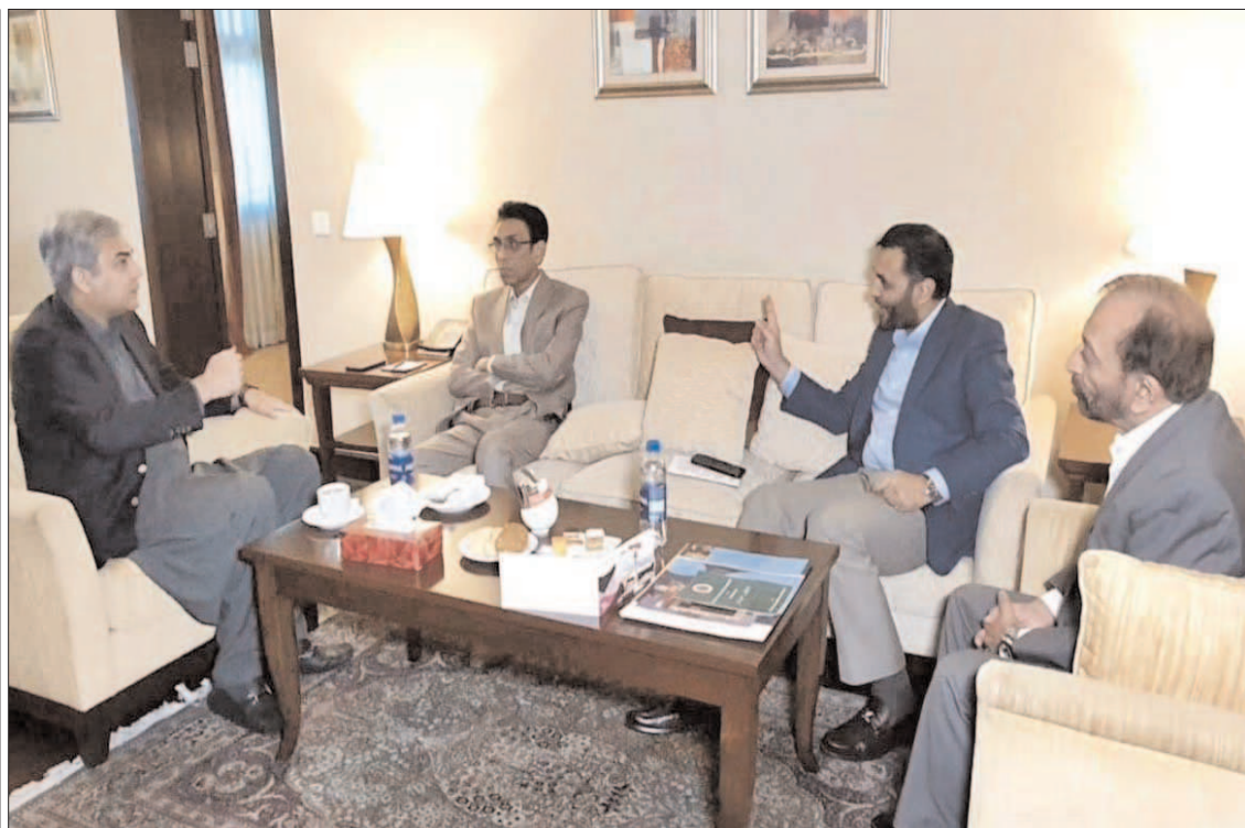
KARACHI: A delegation of Muttahida Qaumi Movement Pakistan (MQM-P) meets with Federal Minister for Interior Mohsin Naqvi.

The meeting decided that the IT board would be registered as a company. The Secretary of IT was directed to develop a plan to make the provincial government departments paperless. "There must be an E-file system in all the departments so that a paperless digital filing system could be evolved," he said, and he directed him to submit the proposals.