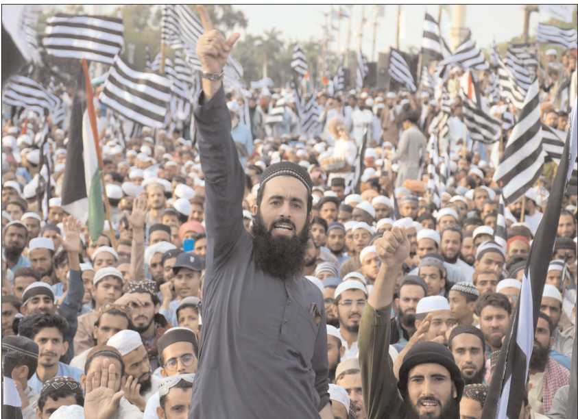
KARACHI: Supporters of JUI-F holding a protest against alleged rigging in general elections, and show solidarity with Palestinian people during Million March.

The women were heard alleging that the Motorway personnel hurt one of the women while trying to "snatch" her mobile phone as she was making the cops' video. Furthermore, one of the women alleged that the Motorway cop demanded a bribe from them.