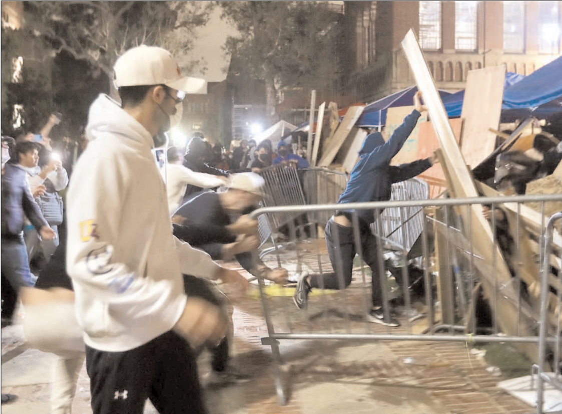
LOS ANGELES: Students of University of California clashing with supporters of Israel during a protest in favour of Palestinians.

Efforts to resolve the standoff have been made with a delegation of provincial ministers and MPAs, led by Minister for Home Mir Ziaullah Langove and Minister for Agriculture Haji Ali Madad Jattak, engaging in talks with the All Balochistan Transport Alliance.