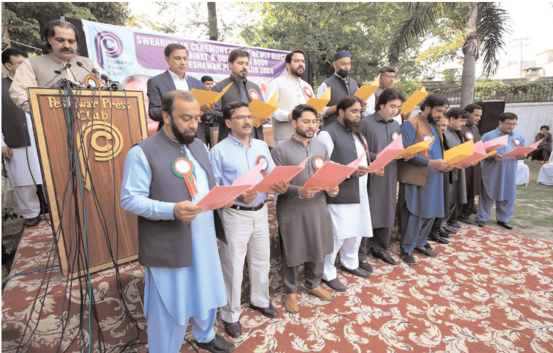
PESHAWAR: Khyber Pakhtunkhwa Chief Minister Sardar Ali Amin Gandapur administering oath to newly elected office bearers of Peshawar Press Club.