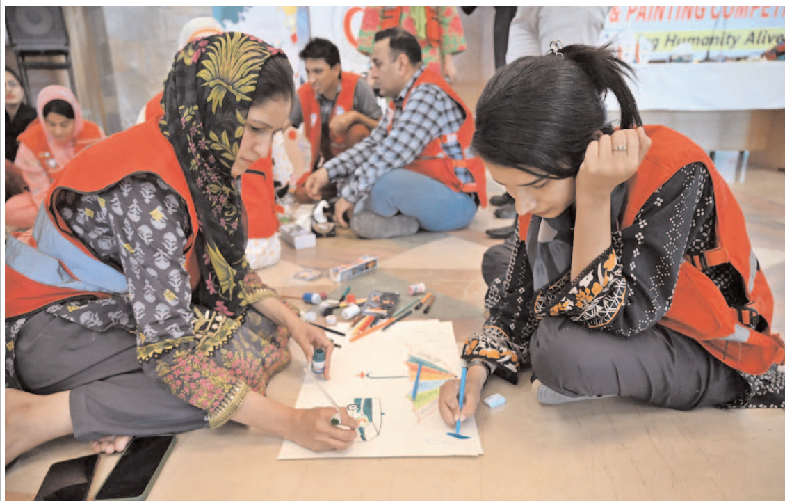
ISLAMABAD: Students participating in Arts & Painting Competition under the theme "Keeping Humanity Alive" in connection with World Red Cross and Red Crescent Week Celebration at Cüzten's Club, F-9 Park.

For doctoral students, dissertation/thesis prepared for obtaining the Master's degree and the doctoral thesis proposal.