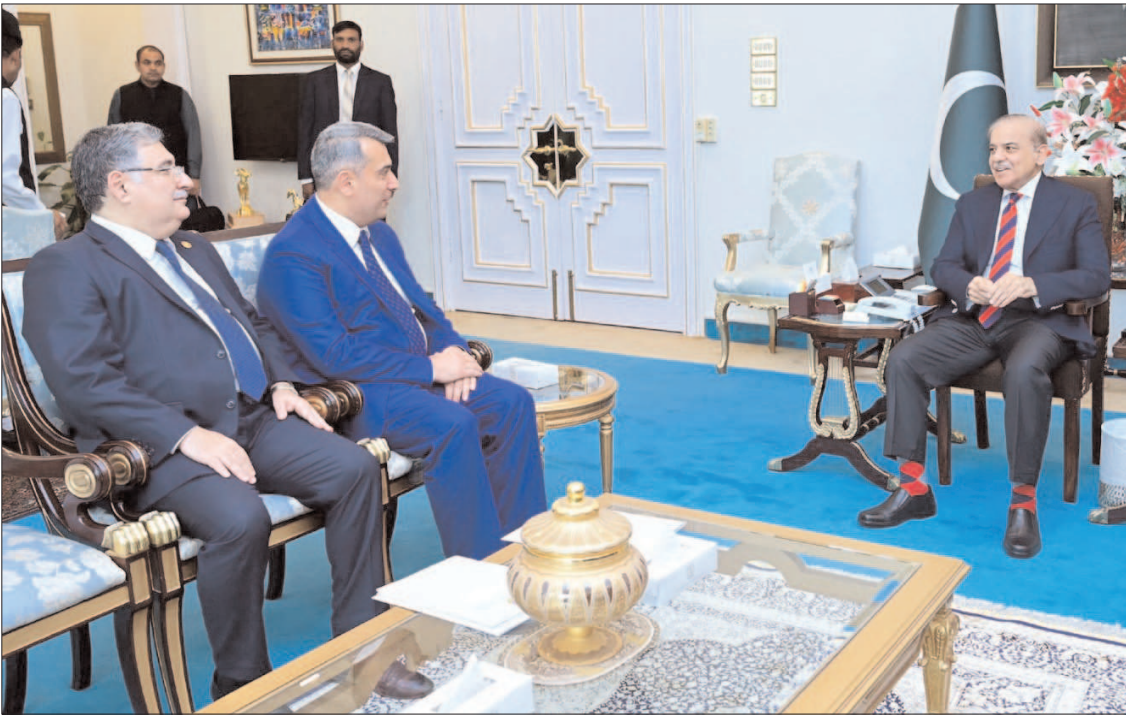
ISLAMABAD: Ambassador of Azerbaijan, Khazar Farhadov called on Prime Minister Shehbaz Sharif.

Asif Zardari's resignation from the party comes at a time when some quarters are criticising him for leading a political party despite being the President of the country. On March 9, Asif Zardari was elected as the president of the country for a second time, securing 411 votes. He received 156 electoral votes from the four provincial assemblies and 255 votes from Parliament. — Agencies