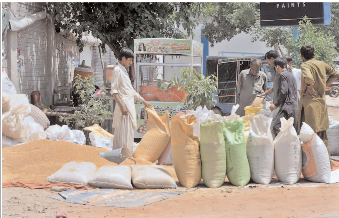
MULTAN: People busy in purchasing wheat from roadside vendor.