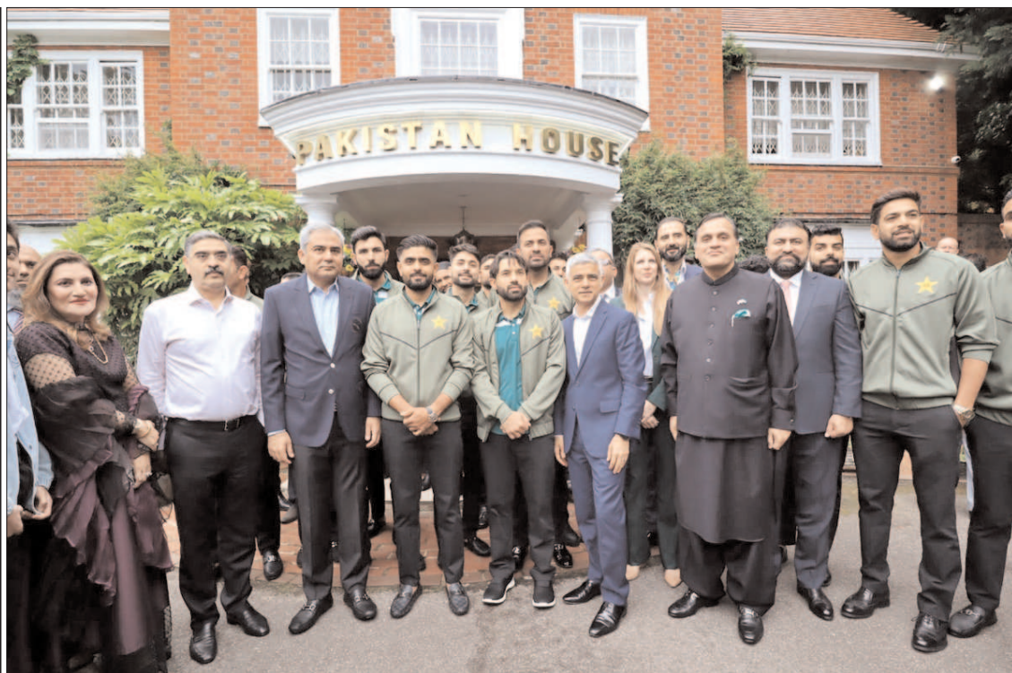
LONDON: Interior Minister Mohsin Naqvi in group photo during a reception hosted by Pakistani High Commissioner in honor of Pakistan Cricket team.