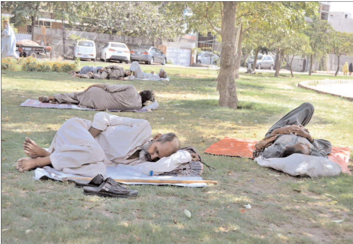
LAHORE: Labourers enjoying nap under the shade of trees in a local park during hot weather in Provincial Capital.