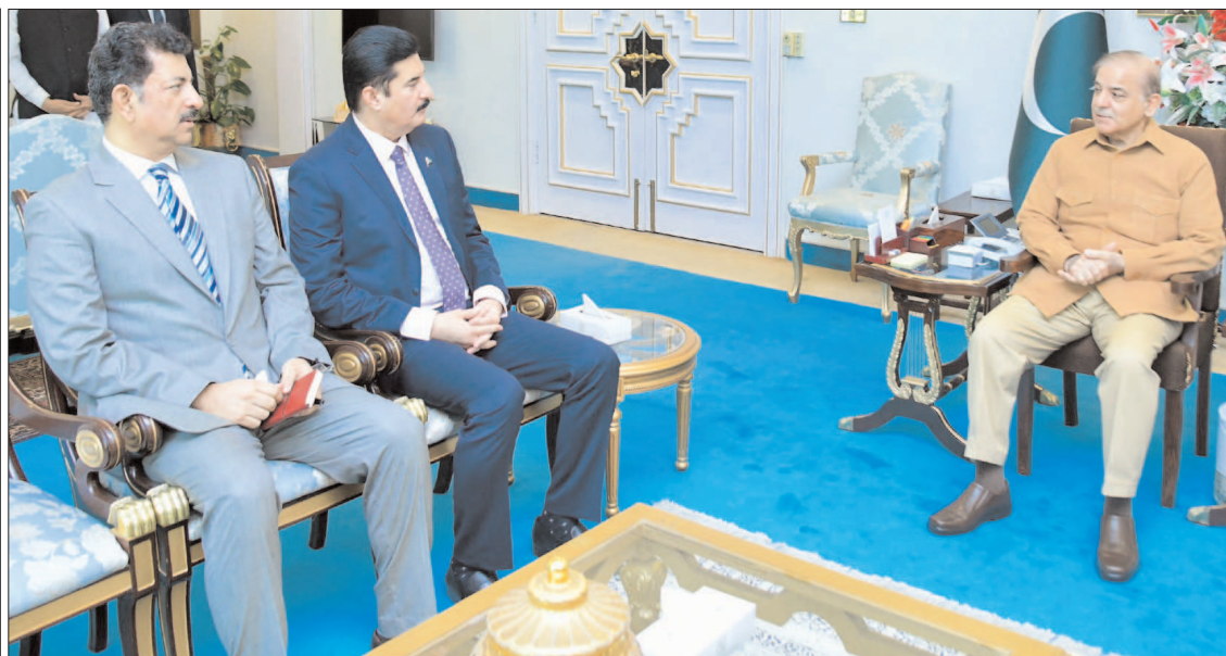
ISLAMABAD: Governor Khyber Pakhtunkhwa, Faisal Karim Kundi called on Prime Minister Shehbaz Sharif.

In article for the New York Times, he said Israeli officials were "delegitimizing UNRWA by effectively characterizing it as a terrorist organization," and he described a "dangerous precedent of routine targeting of UN staff and premises." His comments followed allegations by Israel in January that 12 of UNRWA's 13,000 staff in Gaza took part in the Oct. 7 attack on Israel.