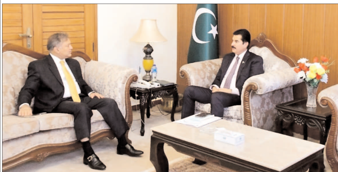
ISLAMABAD: President Zarai Taraqiati Bank Limited (ZTBL) Tahir Yaqoob Bhatti calls on Governor of Khyber Pakhtunkhwa Faisal Karim Kundi.

of the organization active role in solution of human problems created due to environmental changes and climate variations, the Governor suggested establishment of a mechanism for strengthening of linkages of the provincial branches with local and international donors.