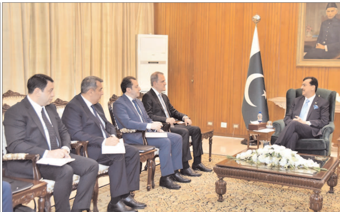
ISLAMABAD: Foreign Minister of Azerbaijan, Jeyhun Bayramov along with his delegation called on Acting President Syed Yousuf Raza Gillani at Aiwan-e-Sadr.

It is pertinent to mention here that the third polio case of 2024 was reported in Pakistan as a minor girl from Kila Abdullah was diagnosed with the virus. The girl, from Balochistan's Kila Abdullah, showed symptoms of paralysis on April 20. The health ministry said that genetic testing of the affected girl's samples is still underway. All of the three cases reported this year are from Balochistan.