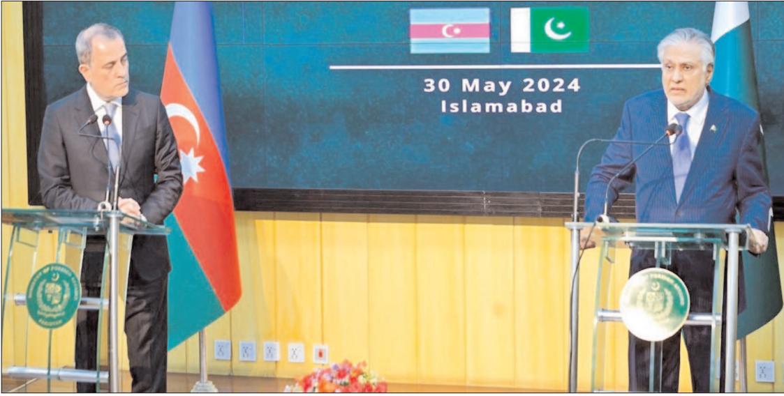
ISLAMABAD: Deputy Prime Minister and Foreign Minister, Senator Ishaq Dar and Minister of Foreign Affairs of Azerbaijan, Jeyhun Bayramov addressing a joint press conference.

Daytime temperature is likely to remain above normal all over the country during start of the forecast period but the expected rains towards the end of the season will normalize the high temperature. Strong winds, dust storms, and gusts are highly likely in the season. Flash flooding is anticipated in hill torrents of Koh-e-Suleman and urban flooding in major cities in Sindh, Punjab, AJK, and KP due to heavy rainfall during the season. The weather department outlook also stated that the atmospheric conditions are supportive for the likelihood of heat-wave in the plain areas of the country, especially over the southern half in June.