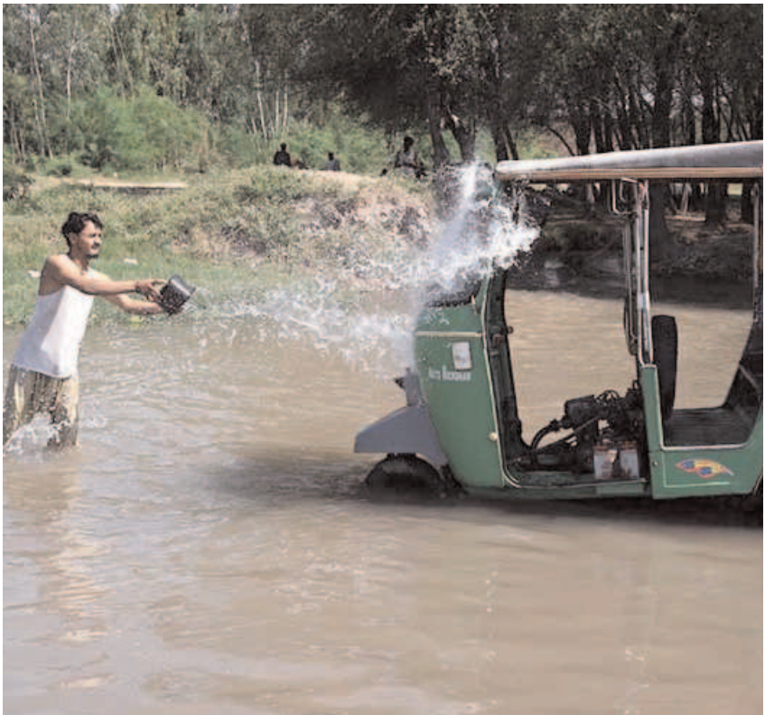
PESHAWAR: A person washing his rickshaw in a local stream at Charsadda Road.

PAF pilots maneuvered through the treacherous terrain, their actions a testament to the ethos of the PAF - "Second to None". In the aftermath of the firefighting operation, as the smoke cleared and the embers smoldered, a sense of gratitude and admiration filled the hearts of all who witnessed the PAF's heroic efforts. The forests of Sakesar, once engulfed in flames, now stand as a symbol of resilience and hope, a testament to the unwavering spirit of the Pakistani people and the indomitable courage of the PAF. As I looked up at the clear skies, now free from the pall of smoke that had once darkened them, I couldn't help but feel a sense of pride and gratitude towards the Pakistan Air Force. In the face of adversity, they had emerged as true guardians of the skies, their legacy of service and sacrifice shining brightly in the hearts of all who had witnessed their heroic deeds.