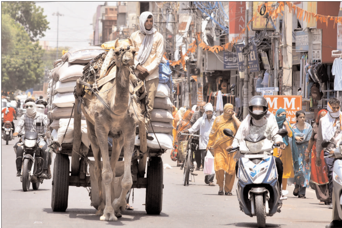
RAJASTAN: Commuters cover their faces with scarves to protect themselves from the harsh heat in Bikaner.

The state court in Halle scheduled the proceedings for June 24 and 26 against Björn Höcke, who plans to run for the governor's job in the eastern state of Thuringia in a state election in September. The charge of using symbols of an unconstitutional organization can carry a fine or up to three years in prison. On May 14, the same court convicted Höcke of that charge and imposed a fine of 13,000 euros ($14,100). The first case centered on a speech in Merseburg in May 2021 in which Höcke used the phrase "Everything for Germany!" Judges agreed with prosecutors' argument that he was aware of its origin as a slogan of the Nazis' SA stormtroopers. Höcke, a former history teacher, has said that he's innocent and argued that it was an "everyday saying." His lawyers are appealing against the verdict. The second count against Höcke was added to his first trial shortly before it opened, but judges then decided to try it separately because his defense team had recently changed.