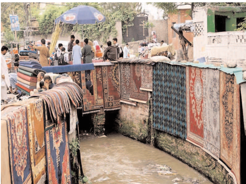
PESHAWAR: Vendor selling and displaying traditional carpets to attract the customers at Shahi Katha.

Chairman stating that trades should be introduced there according to local needs. For resolving issues related to temporary employees in TEVTA, a committee comprising representatives from the Industries, Law, Finance, and KP-TEVTA departments was formed, and the committee was directed to identify the perpetrators of irregularities in this regard. Expressing his views on the occasion, the Special Assistant stated that TEVTA needs to be taken towards sustainability and improvements in all operational matters within the timeline. He emphasized the importance of fulfilling the gaps in the path of TEVTA's progress and placing the institution on the right track. He also mentioned the efforts of the institution to find dignified employment opportunities in the market for the unemployed students.