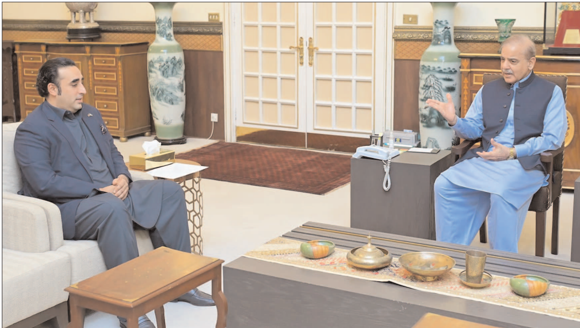
ISLAMABAD: Chairman Pakistan People's Party Bilawal Bhutto Zardari called on Prime Minister Shehbaz Sharif.