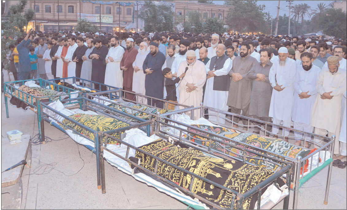
FAISALABAD: People offering funeral prayer of a family. A man committed suicide after killing his two wives and four children.