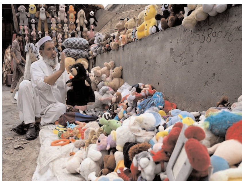
PESHAWAR: An old man is selling and displaying second hand imported toys to attract the customers at Kohati area.

taken by her husband after their divorce. The husband has been disappeared with the child since then. The court has adjourned the hearing till May 7 and directed the IGP to produce the child in court by then.