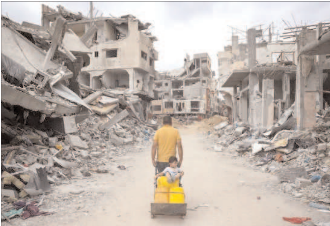
GAZA: A Palestinian man and child pass by the rubble of destroyed buildings.