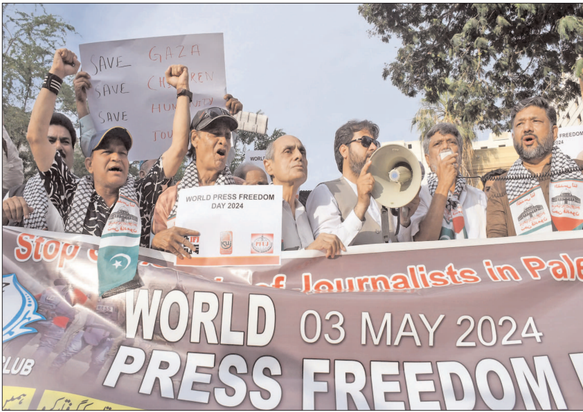
KARACHI: Journalists holding placards during a rally in connection with World Press Freedom Day.

Calling Pakistan's development in science and technology, modern sciences and skill development the need of the hour, the prime minister reiterated the resolve to uplift the youth in the said fields to ensure that the country achieved excellence in the field of inventions. In a separate statement, Deputy Prime Minister and Foreign Minister Ishaq Dar also congratulated the young Pakistani students and scientists on the launch of lunar orbital mission ICUBE-Q. "Today's launch from Hainan in China, is a good example of countries and organizations coming together for space cooperation and shared benefits. It shows the promise of Pakistani youth," he added.