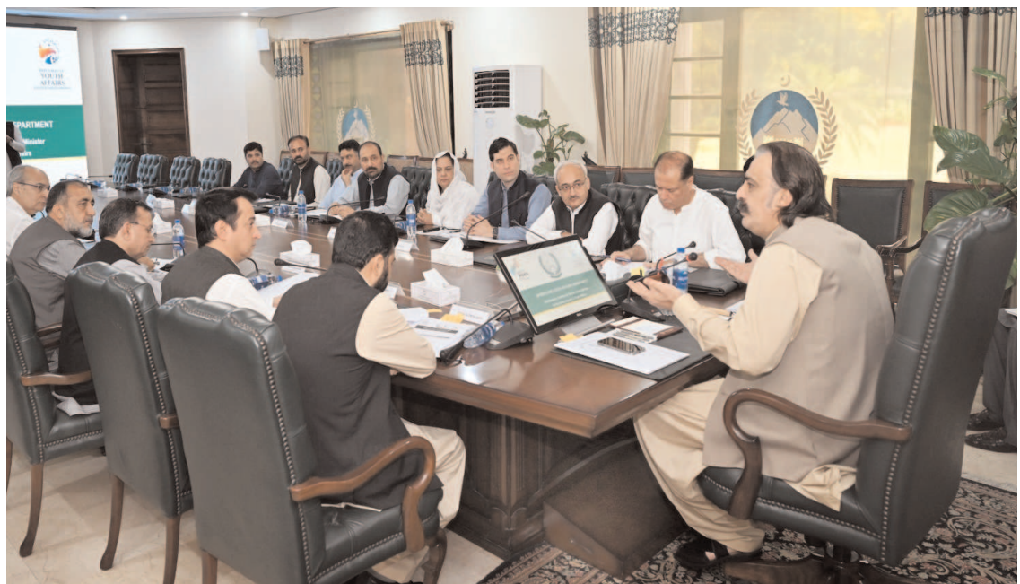
PESHAWAR: Khyber Pakhtunkhwa Chief Minister Sardar Ali Amin Gandapur chairing a meeting of Sports and Youth Affairs Department

Forest Institute Peshawar holds historical significance throughout Pakistan, providing students with the best and modern education. He expressed that granting university status to the institute is a significant gift for the future of students. He emphasized that providing the youth with quality education is among the top priorities of the PTI government. He further stated that their endeavor and desire are to implement this important step as soon as possible.