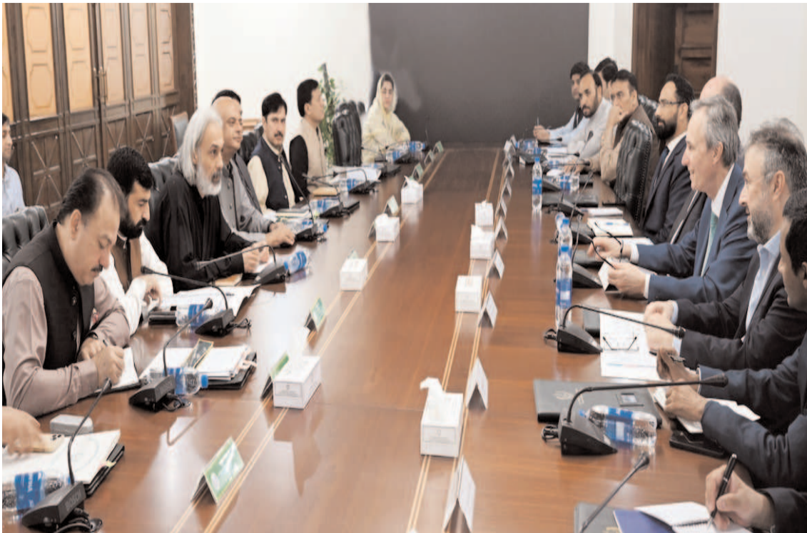
PESHAWAR: A joint meeting was held between delegation of World Bank and high ups of the Khyber Pakhtunkhwa government on Tuesday.