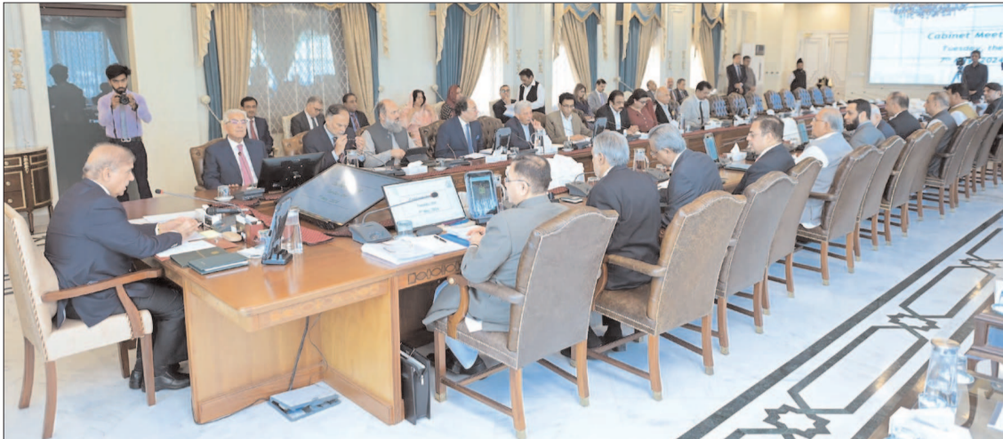
ISLAMABAD: Prime Minister Shehbaz Sharif chairing the meeting of federal cabinet.