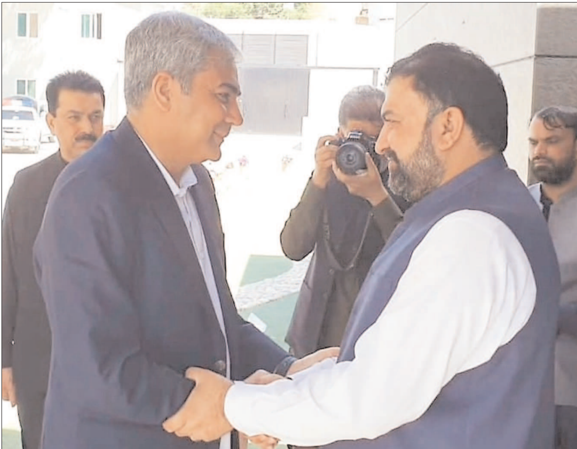
QUETTA: Chief Minister of Balochistan, Mir Sarfraz Bugti welcoming Federal Minister, Syed Mohsin Naqvi upon his arrival at CM's House.