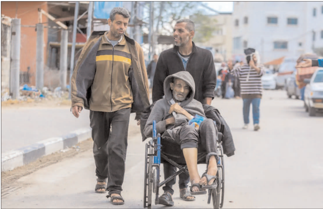
GAZA: People flee the eastern parts of Rafah.