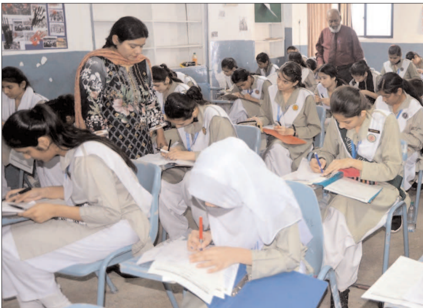
HYDERABAD: Students solving their first paper of class ninth in examination centre.