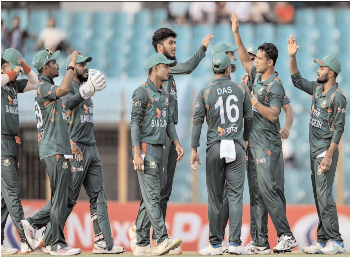
CHATTOGRAM: Mohammad Saifuddin struck twice in the powerplay, Bangladesh vs Zimbabwe, 3rd T20I.

ROME (AFP): Coco Gauff said on Tuesday she was dedicating training time prior to her second-round start at the ATP and WTA Italian Open to cleaning up her serve. The American third seed was plagued by multiple double-faults in a fourth-round defeat last week to compatriot Madison Keys in Madrid. And the reigning US Open winner said she plans to fix that delivery problem in Rome before heading to Roland Garros from May 26. "I had like 14 double-faults - that's four or five games," she said. "(If I) just fix that detail, it will save me. "Maybe those matches would turn into winning in straight sets instead of losing in three sets." She added: "For me it's just serving better than I did last week. Honestly, I feel the other parts of my game are improving in the right direction. "If I can work through, it will set me up for a very good Roland Garros." Both Gauff and defending champion Elena Rybakina expressed pleasure at returning to the Foro Italico and preparing for the last big event prior to Paris. "It's nice to be here. (I've seen) some improvements on-site," the Kazakh said. "I'm looking forward to this event. "I didn't practice for three, four days (after a Madrid semi-final loss to Aryna Sabalenka). Today I managed to hit a bit. "That's the way to keep on going because it's not easy with our schedule." Gauff paid tribute to Rafael Nadal, who is likely playing his final Rome event as he nears retirement sometime this season.