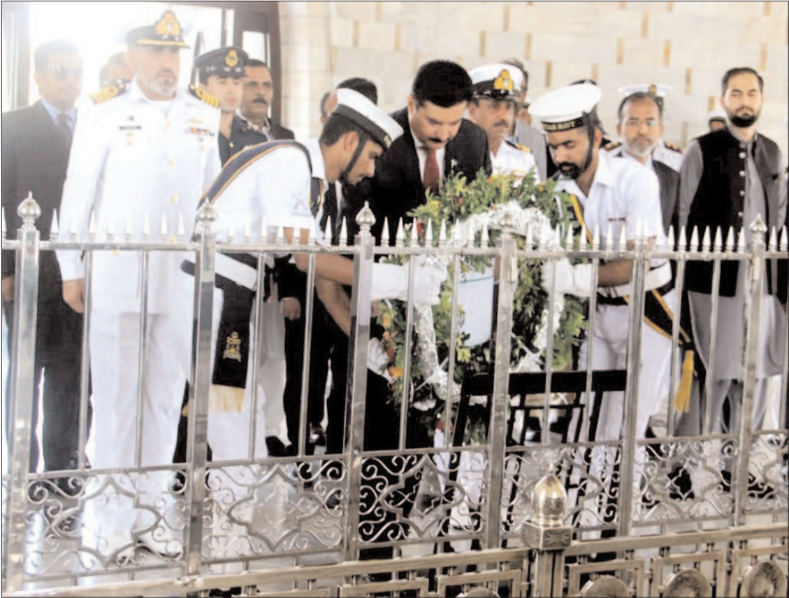
KARACHI: Governor of Khyber Pakhtunkhwa, Faisal Karim Kundi floral wreath at Mazar-e-Quaid.