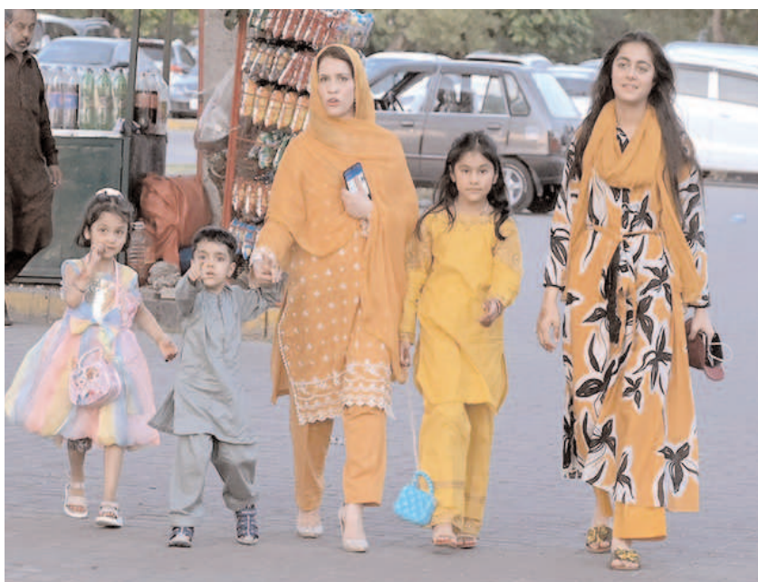
ISLAMABAD: A family members visiting Lake View Park on the second day of Eid ul Azha celebrations in the federal capital. The park is restricted just for families during Eid holidays.

The camel's owner, peasant Soomar Behan did not report the matter to the police but was contacted by authorities after the matter came to light.