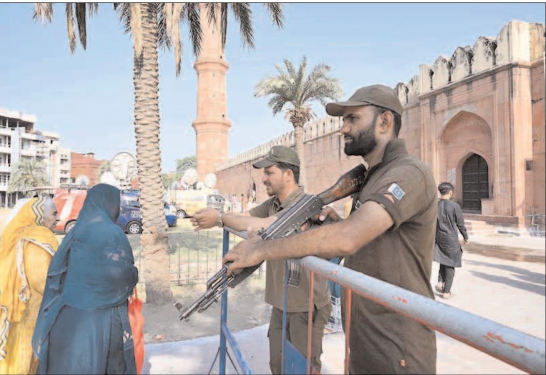
LAHORE: Security official standing high alert outside Badshahi Masjid during Eidul Azha prayers.

LAHORE (APP): The district government departments and waste management companies disposed of 1.36 million ton waste during first two days of Eid-ul-Adha. In accordance with the grand waste management plan, operational report for the first two days released here on Wednesday. The district government and waste management companies conducted uninterrupted cleaning operations for 48 hours, and disposed of 86,000 tons of waste while local governments managed to dispose of 50,000 tons of waste in two days. The Lahore Waste Management Company disposed of 18,500 tons of waste on the second day while collectively, over 50,000 workers remained in the field during both days of Eid. The waste management companies resolved 21,000 complaints and local governments resolved 8,000 while zero waste operation will take place on the third day of Eid, Secretary local government Shakil Ahmad Mian said in a statement, and added that central control room remained active on the third day as well and effective implementation of the grand waste management plan had been ensured.