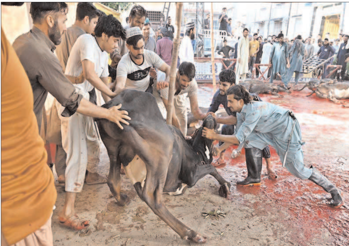
RAWALPINDI: Butchers busy in slaughtering sacrificial animals at Jamia Masjid Zia ul Aloom Satellite Town on the first day of Eidul Azha.

The spokesman said that Rawalpindi district police, City Traffic Police, and Murree tourism police were working round the clock to facilitate the tourists, adding that visitors, in case of any emergency, could contact Police Helpline 15 or Murree Tourism Police Helpline 1757.