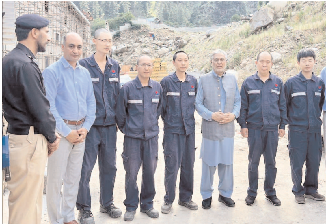
NEELUM VALLEY: Group photo of Deputy Prime Minister, Ishaq Dar with Chinese engineers and Pakistani team during his visit to under construction Jagran-2 hydropower plant.

At the end of the visit, PNS Babar participated in a naval exercise with Royal Saudi Naval Forces ship HMS Al Riyadh. The aim of the exercise is to promote mutual cooperation and strengthen friendly relations between the two countries.