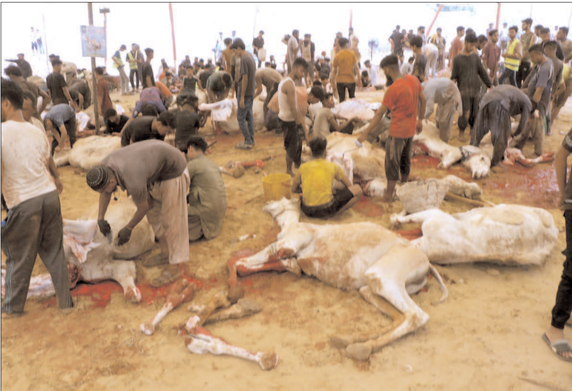
KARACHI: Workers slaughtering camels organized by JDC Welfare Organization, sacrificed 200 camels and cow meat to distribute among the deserving people on the Eid-ul-Azha festive.