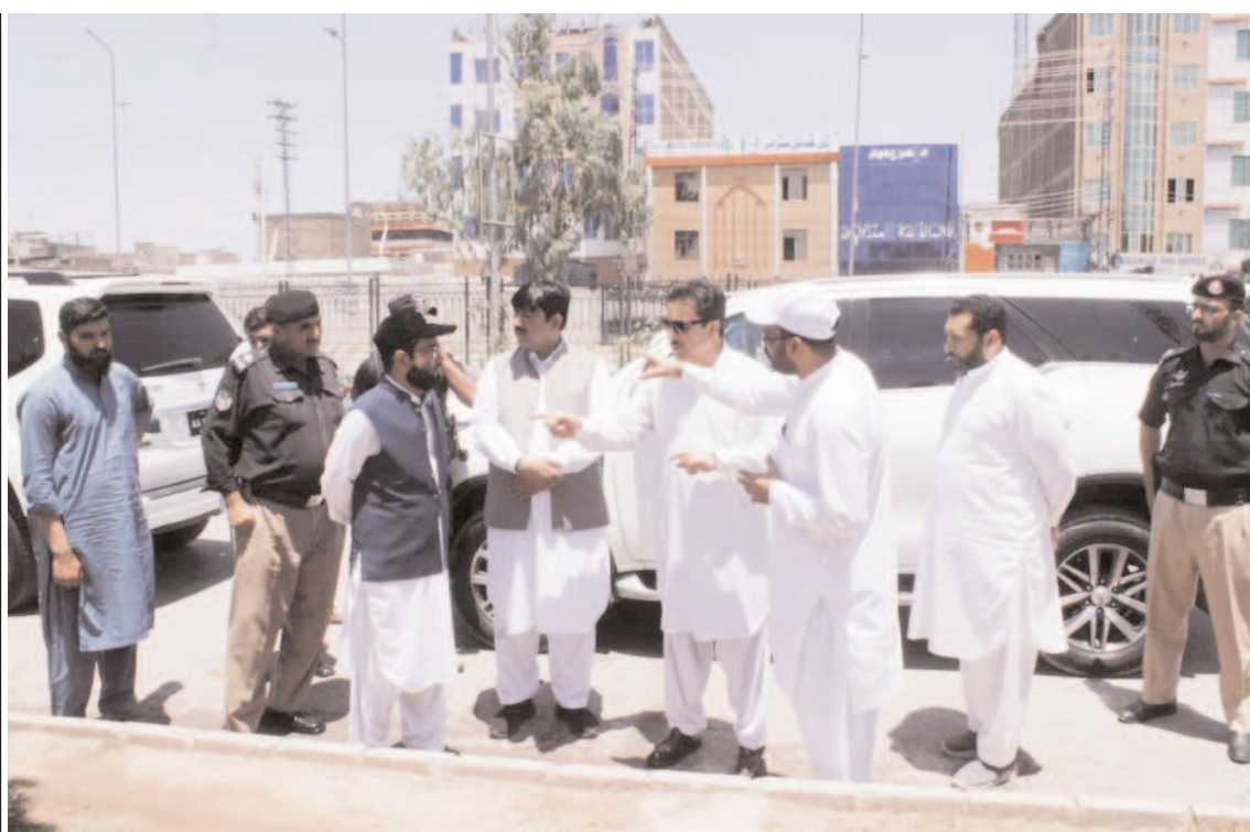
PESHAWAR: Provincial Minister Arshad Ayub Khan inspecting sanitation work in City during his visit.