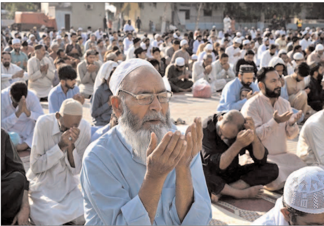
RAWALPINDI: A large number of faithful offering dua after Eidul Azha prayers at Eidgah Sharif.