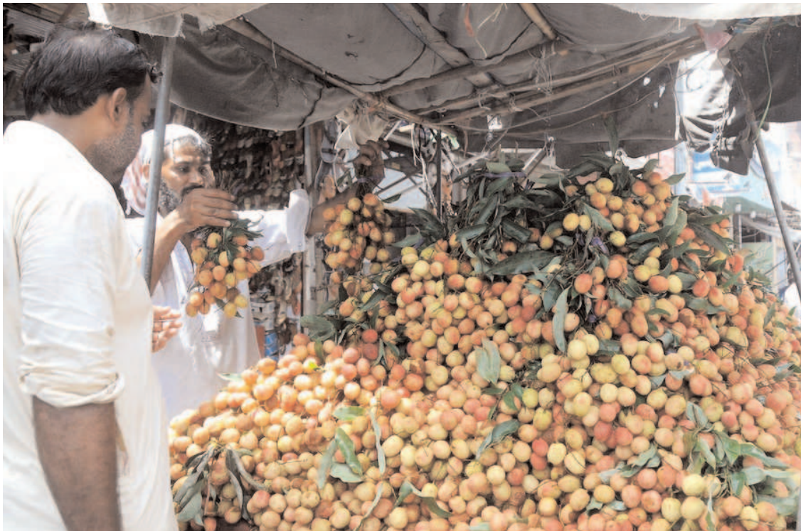
MULTAN: Vendor displaying fruit Lychee to attract customers at Abdali Road.

"We are committed to making Pakistan a leader in economic innovation and sustainable development. The NETU will be at the forefront of this transformation, guiding our nation towards a brighter and more prosperous future," he added.