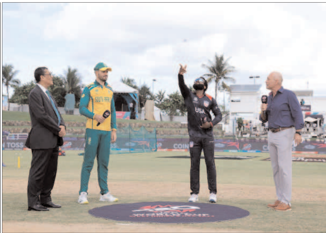
ANTIGUA: Aaron Jones of USA tosses the coin at the coin toss as Aiden Markram of South Africa looks on ahead of the ICC Men's T20 Cricket World Cup West Indies & USA 2024 Super Eight match.

Sixth-seeded American Ben Shelton was ousted by French qualifier Giovanni Mpetshi Perricard while Italy's Matteo Arnaldi eliminated eighth seed Ugo Humbert.