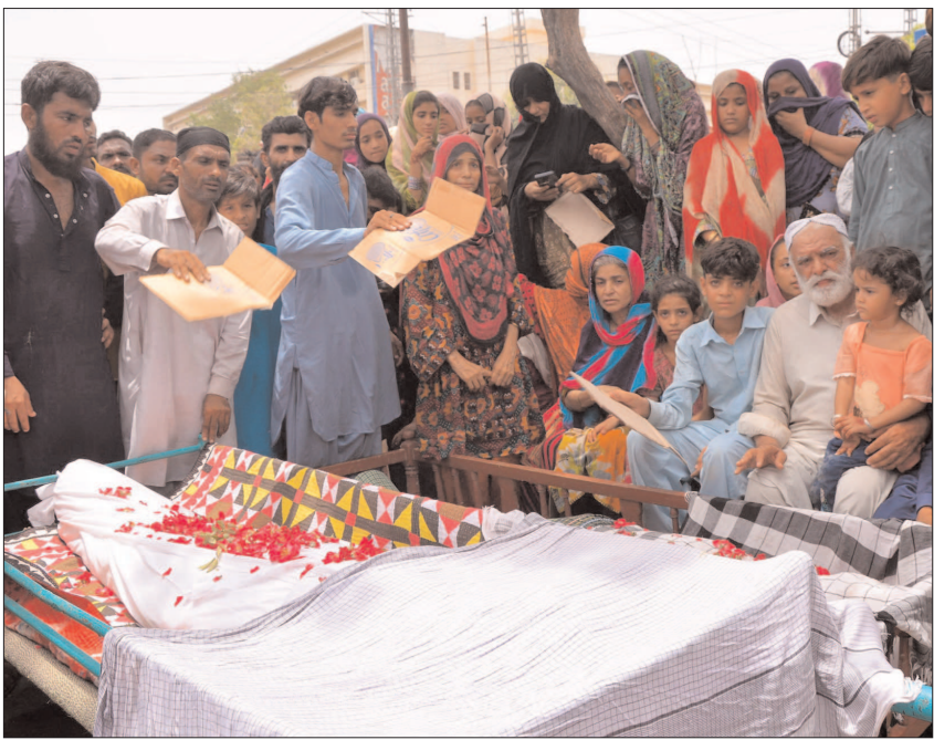
HYDERABAD: Relatives of two brothers, who was killed by unknown persons holding a protest, as they demand arrest of killers.