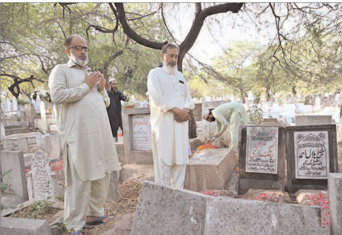
LAHORE: People offering Fateha on the graves of their family members in graveyard on the first day of Eid-ul-Adha.