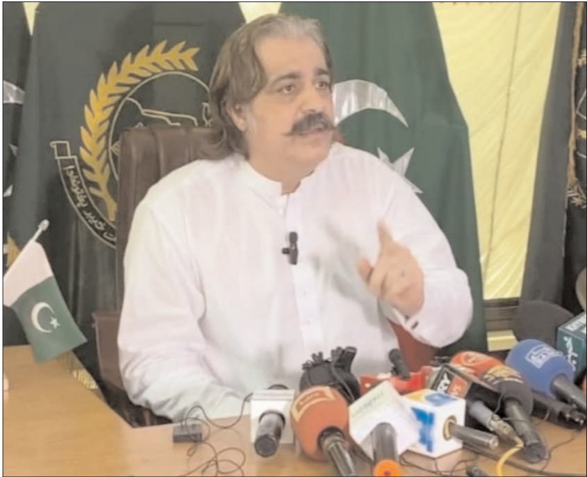
D I KHAN: Chief Minister of Khyber Pakhtunkhwa, Ali Amin Gandapur talking to media persons regarding load shedding issue.

Meanwhile, PTI leader Asad Qaiser joined a protest against power loadshedding in Swabi. He criticised the federal government and announced plans to protest in the National Assembly and on the streets against the discriminatory electricity supply to Khyber Pakhtunkhwa. In Karak, women protesters demonstrated against unannounced power cuts, blocking Shagai Road to traffic.