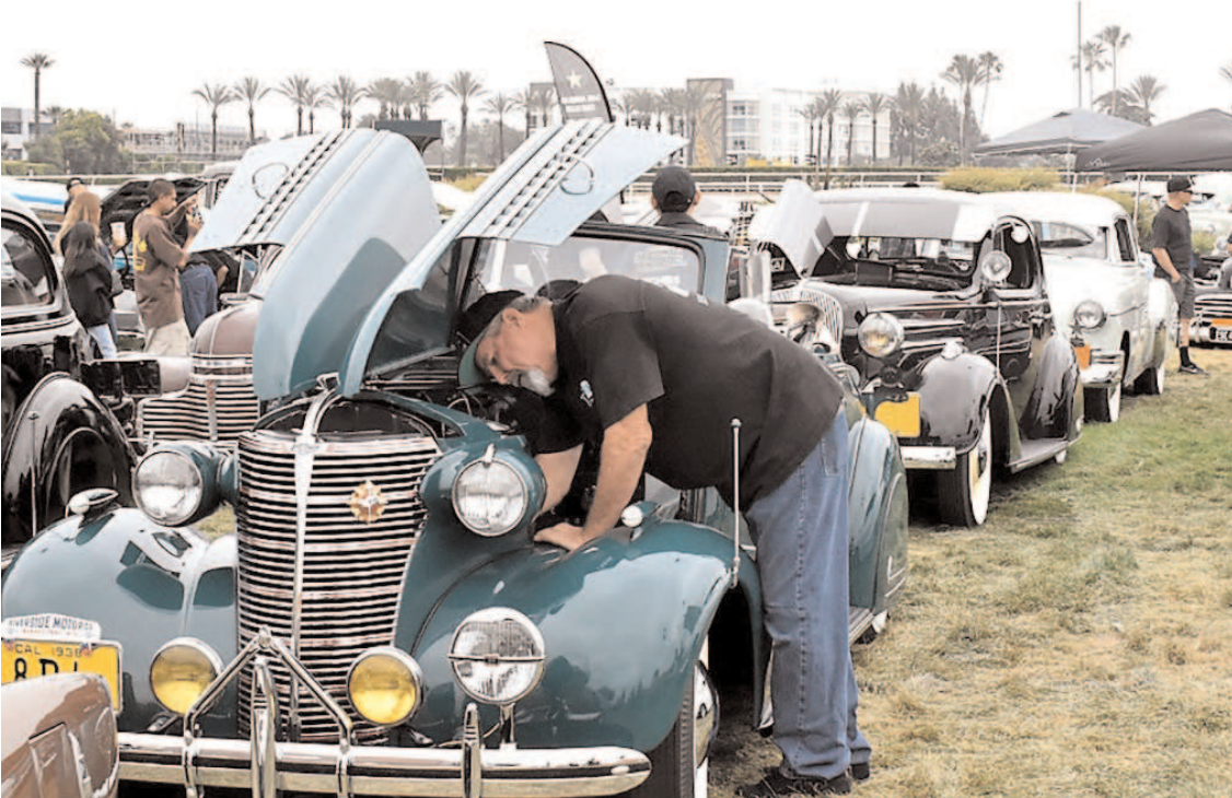
CALIFORNIA: A man inspecting a vintage care during the annual classic car show.

Other plum posts are those of European Council president, who chairs summits of presidents and prime ministers, and EU foreign policy chief, the bloc's top diplomat. Unofficial estimates are due to trickle in from 1615 GMT. Official results of the polls, which are held every five years, will be given to be published after the last polling stations in the 27 EU nations close in Italy at 11 p.m. (2100 GMT), but a clear picture of what the new assembly might look like will only emerge clear on Monday.