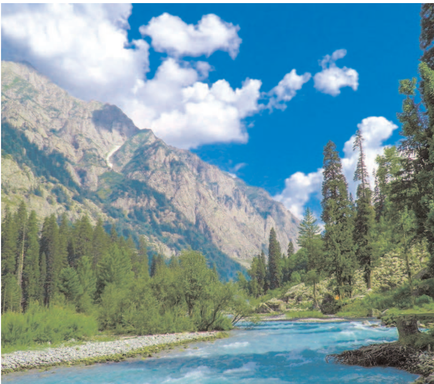
DIR: A beautiful view of the scenic Kumrat Valley. Kumrat is one of the fast-growing tourists spot in Khyber Pakhtunkhwa.