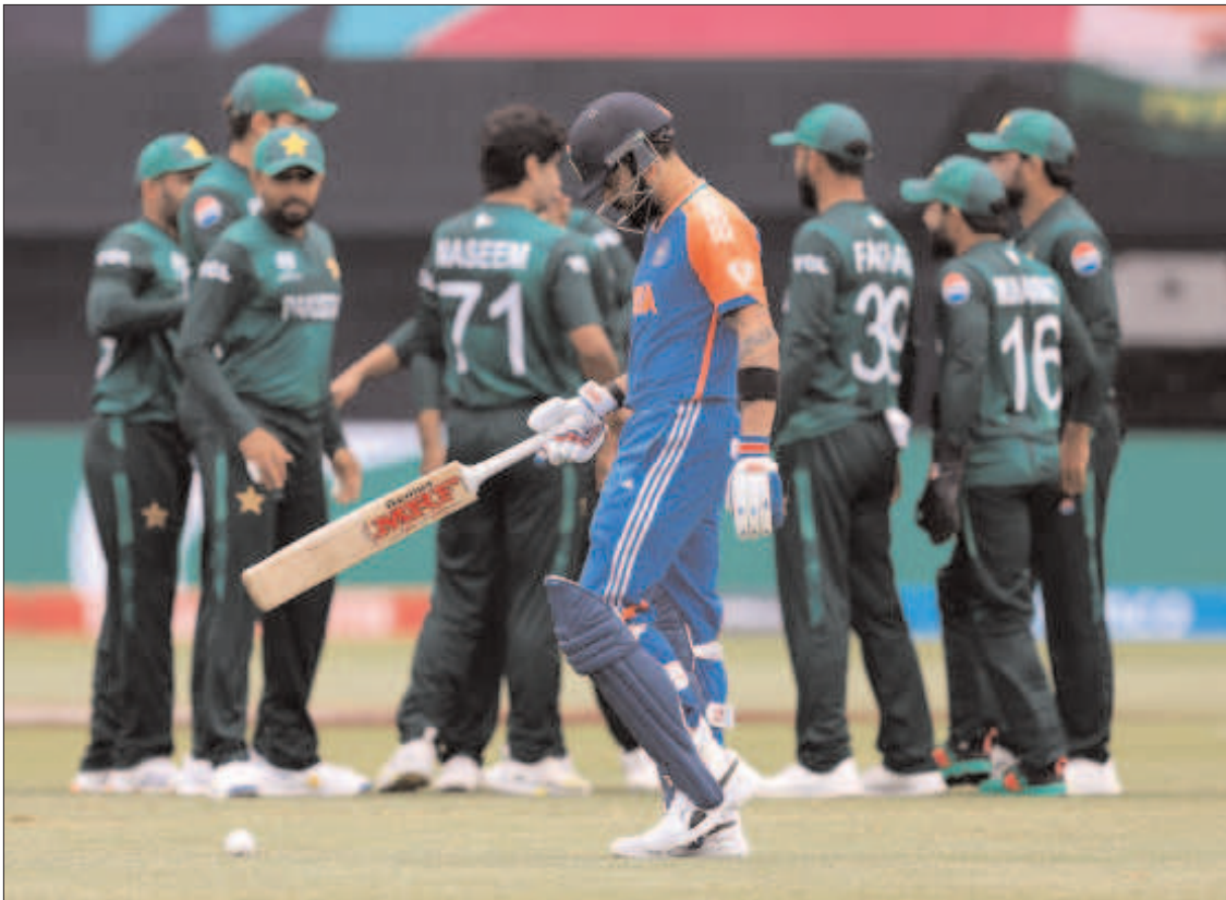
NEW YORK: Virat Kohli of India makes his way off after being dismissed during the ICC Men's T20 Cricket World Cup West Indies & USA 2024 match between India and Pakistan.

UYO (INP): South Africa held Nigeria for a 1-1 draw at Godswill Akpabio International Stadium to keep the Super Eagles without a victory in the FIFA World Cup 2026 Qualifier. The stalemate saw Nigeria drop to fourth in Group C with three points from six matches with South Africa third on four points. Minnows Lesotho ranked 149th in the world, are top of the Group C standings with five points on the back of a 2-0 win over Zimbabwe earlier on Friday. Rwanda are second with four points and a better goal difference than both Benin and South Africa. Friday's match in the southern Nigerian town of Uyo was a repeat of the 2024 Africa Cup of Nations semi-final in the Ivory Coast, which also ended 1-1 before Nigeria won on penalties.