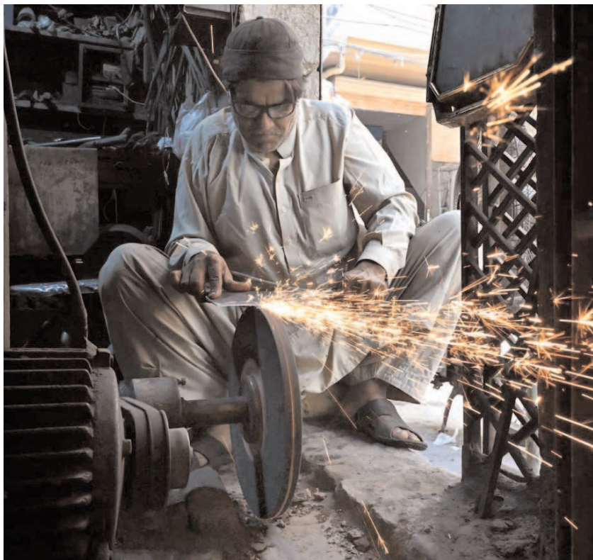
RAWALPINDI: A blacksmith busy in sharpening knives to be used for slaughtering sacrificial animals during upcoming Eid ul Azha.

He said the registration of producers and distributors would be accompanied by an affidavit stating that they would not produce or distribute plastic bags of less than 75 microns and would phase out their stock in 45 days in an environment-friendly manner. After 45 days, he said, the existing stock of producers and distributors would be confiscated. "Producers, distributors, recyclers, and collectors who do not register themselves in 15 days from June 5 will be sealed on June 21," he said, adding that the Punjab government had imposed a ban on the manufacturing, sale, and use of polythene and plastic bags.