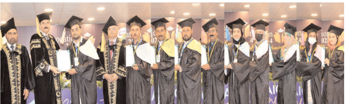
PESHAWAR: Khyber Pakhtunkhwa Governor Faisal Karim Kundi giving away degrees to graduating students at the Convocation of Allama Iqbal Open University.

"He left for his eternal abode in the year 1980. May Allah swt bless his soul in the highest level of Jannatul Firdous. Aameen summa Aameen