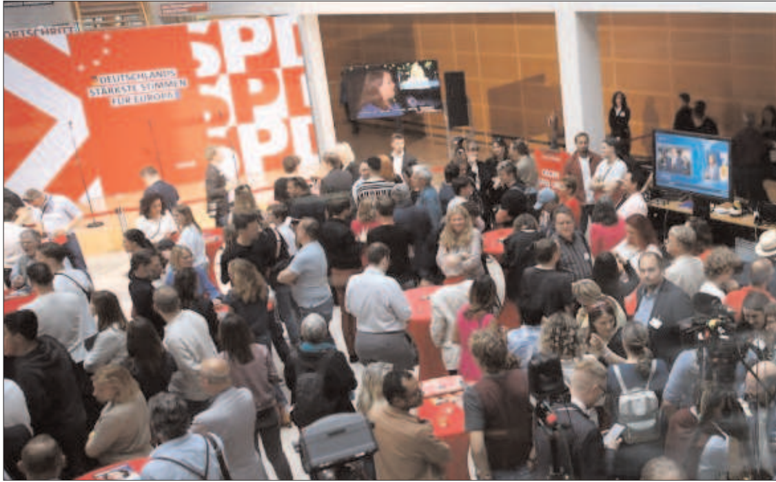
BERLIN, GERMANY: Supporters of the German Social Democrats (SPD) react at SPD headquarters to initial election results in the European parliamentary elections which currently show the SPD in third with 14 percent of the votes, on Sunday in Berlin, Germany.

Chinese companies to small banks on the border and stoked the use of underground financing channels or banned cryptocurrency. Western officials are concerned that some Chinese financial institutions are still facilitating trade in goods with dual civilian and military applications. Beijing has accused Washington of making baseless claims about what it says are normal trade exchanges with Moscow. The Biden administration this year began probing which sanctions tools might be available to it to thwart Chinese banks, a U.S. official previously told Reuters, but had no imminent plans to take such steps. In December, President Joe Biden signed an executive order threatening sanctions on financial institutions that help Moscow skirt Western sanctions. The U.S. has sanctioned smaller Chinese banks in the past, such as the Bank of Kunlun, over various issues, including working with Iranian institutions. China and Russia have fostered more trade in yuan instead of the dollar in the wake of the Ukraine war, potentially shielding their economies from possible U.S. sanctions.