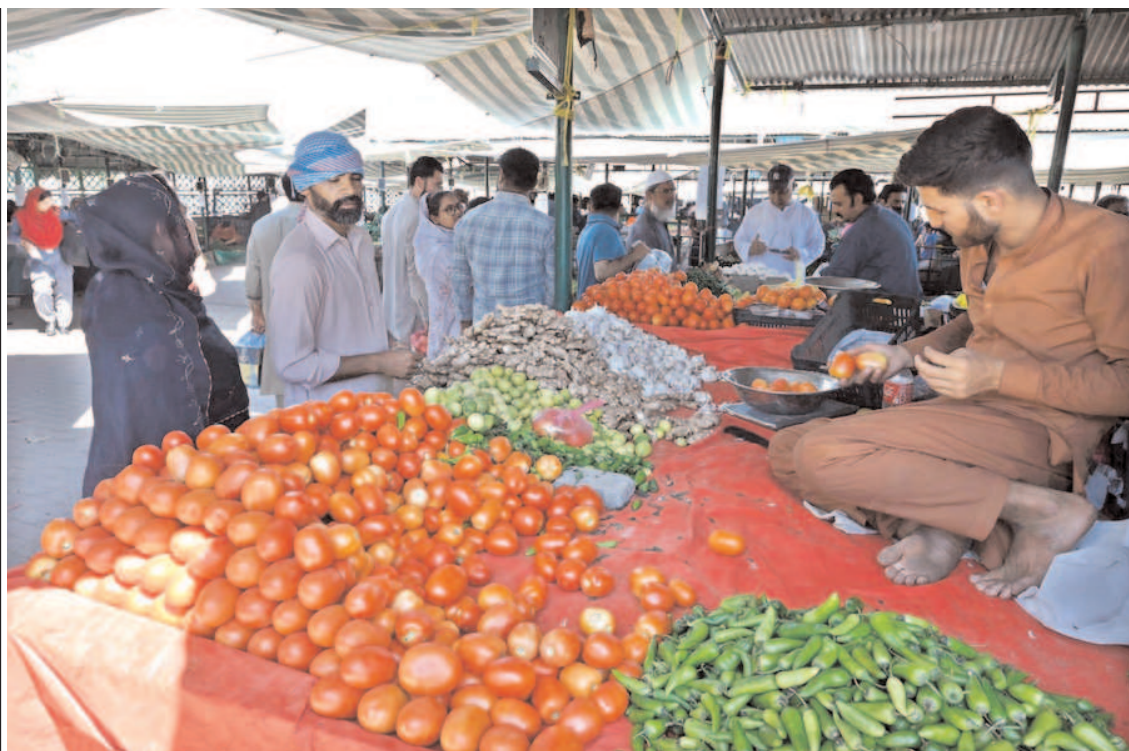
ISLAMABAD: People busy in purchasing vegetables from vendor in weekly Sunday Bazaar.

He said that the PIAF, in its budget proposals, also urged the government to reduce sales tax to single digit and also cut corporate tax to make the upcoming budget business-friendly.