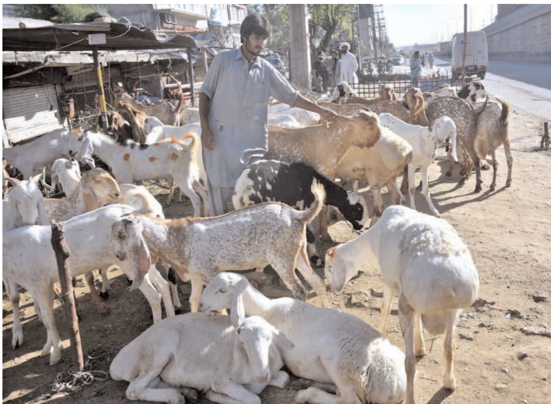
ISLAMABAD: A vendor displaying sacrificial animals to attract the customers at along IJP Road in connection with upcoming Eid ul Azha.

ISLAMABAD (APP): The electricity demand in Islamabad Electric Supply Company (IESCO) on Sunday stood at 1,997 megawatts (MW) at 06:00 pm against the allocation quota of 2,100 MW from the national grid system. According to Chief Engineer Operation Director Muhammad Aslam Khan, currently there was zero shortfall of electricity in IESCO and zero load management was being observed across all the six circles including Azad Jammu and Kashmir. Smooth and uninterrupted power supply was being supplied in Islamabad, Rawalpindi City.