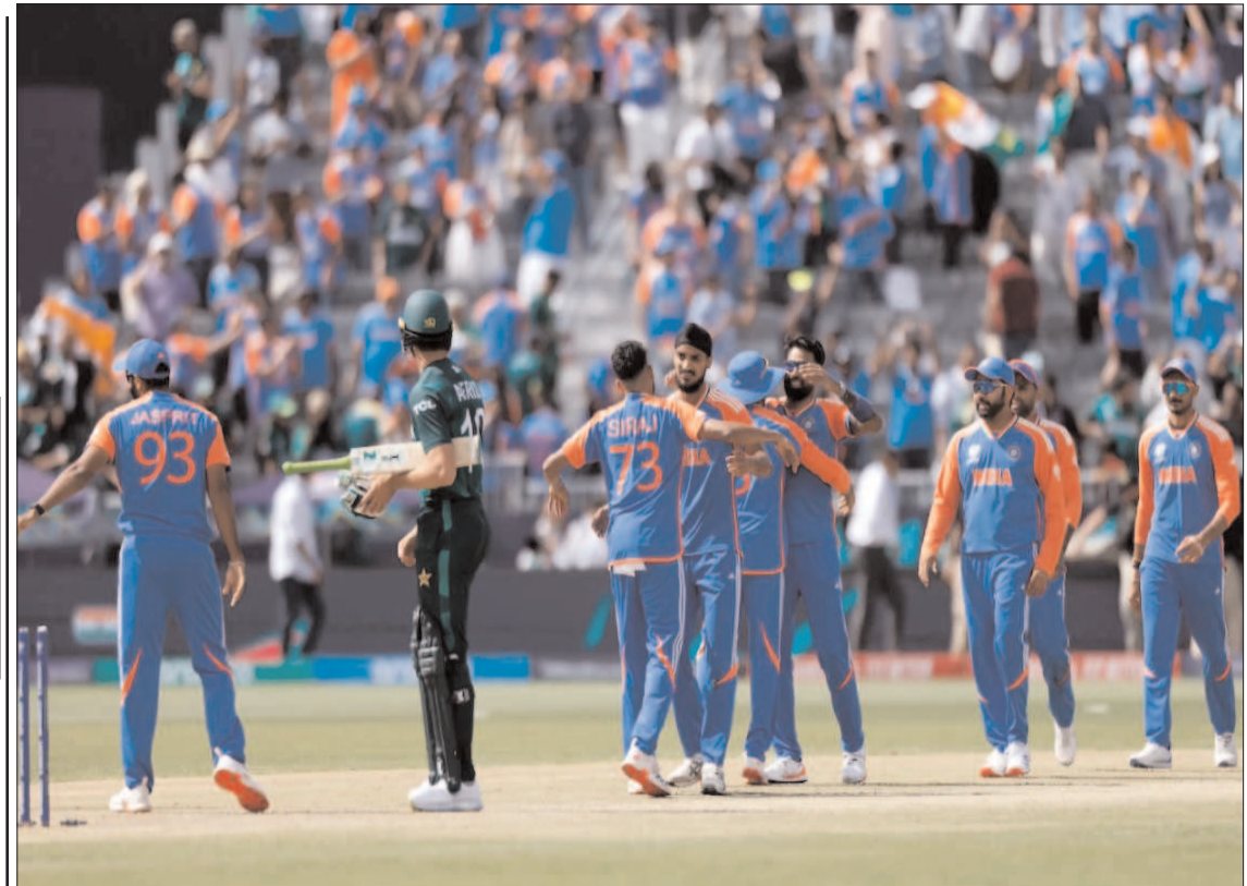
NEW YORK: Indian players celebrating at the end of the match to beat Pakistan in Group A match of the ongoing T20 World Cup.