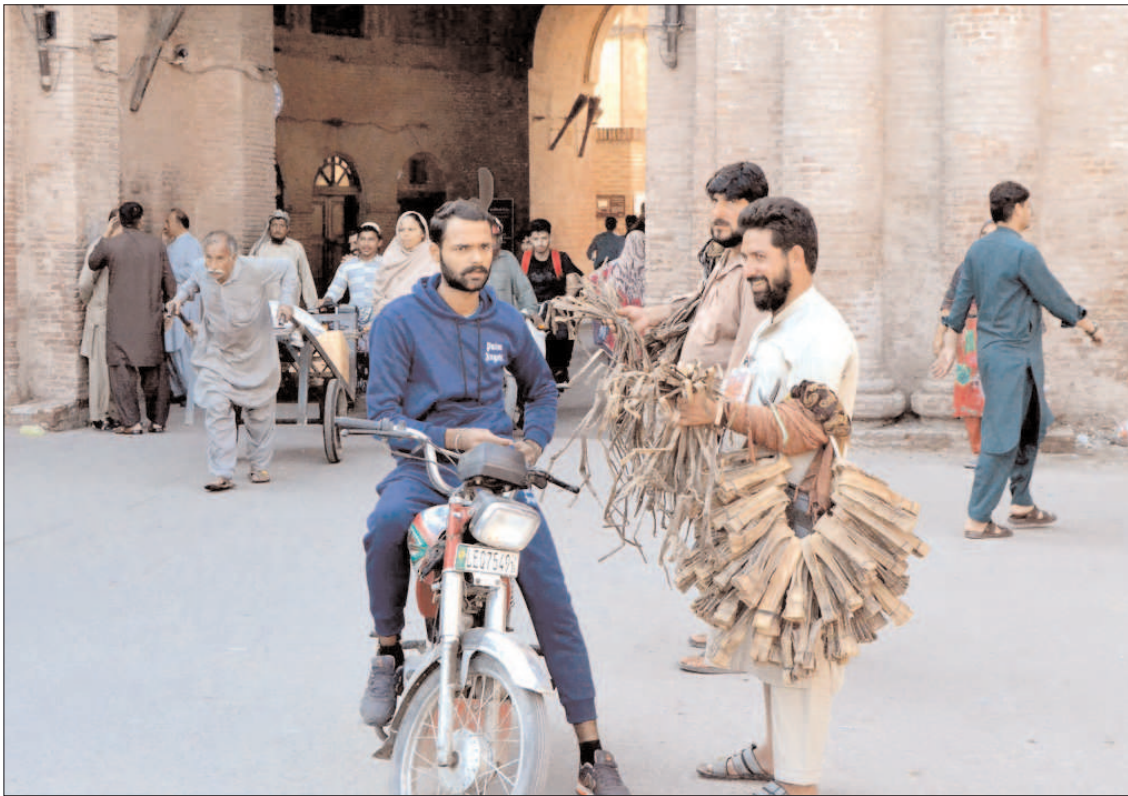
LAHORE: A vendor diligently sells walnut tree peel, a traditional teeth-cleaning remedy, to eager customers seeking oral hygiene solution at outside the Dehli Gate.