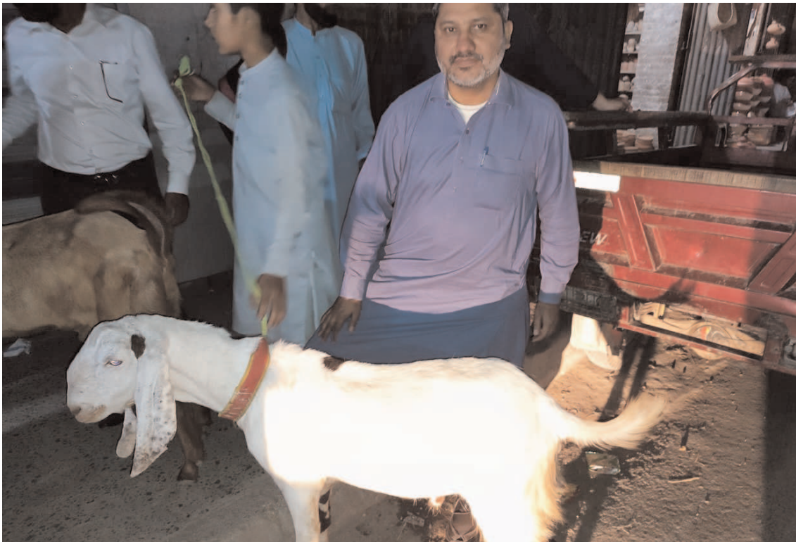
PESHAWAR: A man buying a goat from Yaqatoot area to be sacrificed on Eidul Azha. The sale and purchase of the sacrificial animals have gained momentum in city markets.