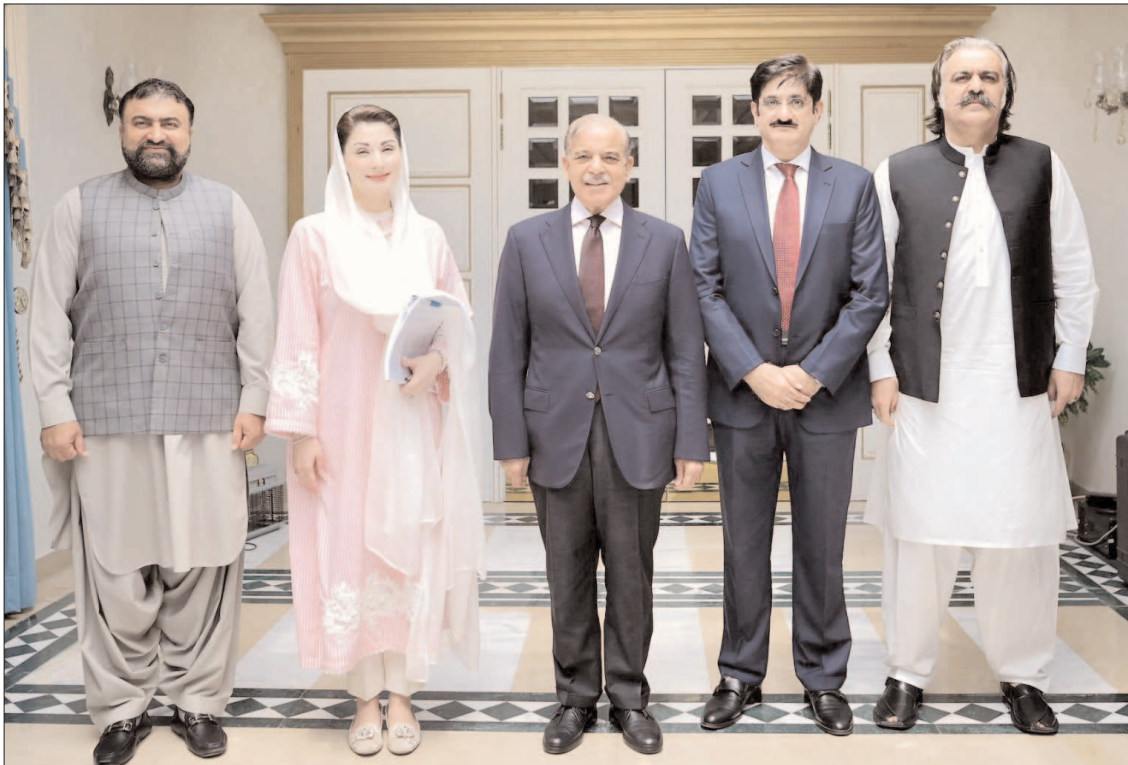
ISLAMABAD: Prime Minister Shehbaz Sharif in a group photo with the Chief Ministers of all four provinces prior to the meeting of National Economic Council.

Vol. XXXIXI No. 139 Regd. No. 241 ZIL-HAJJ 04 1445 -- TUESDAY, JUNE 11 2024 PESHAWAR EDITION 12 PAGES PRICE. 30