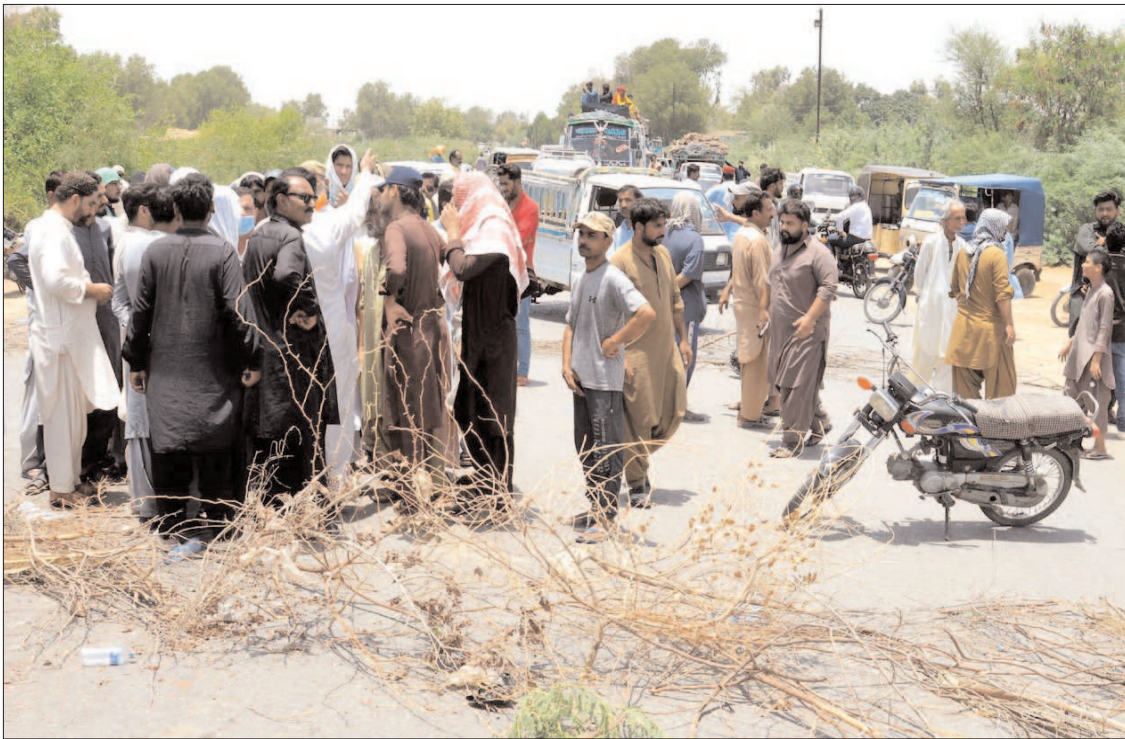
HYDERABAD: Residents closed road during a protest against electricity cut off.

NARAN: The Babusar-Naran highway was opened for all traffic after six months of closure. The local administration said that police and local volunteers will continue to patrol for the safety and convenience of tourists. Babusar-Naran highway is closed every year for several months due to heavy snowfall, which now has been opened. It is pertinent to note that earlier in Mansehra district after a long closure of six months all the obstacles were removed and the touristy area Naran was opened for tourists.