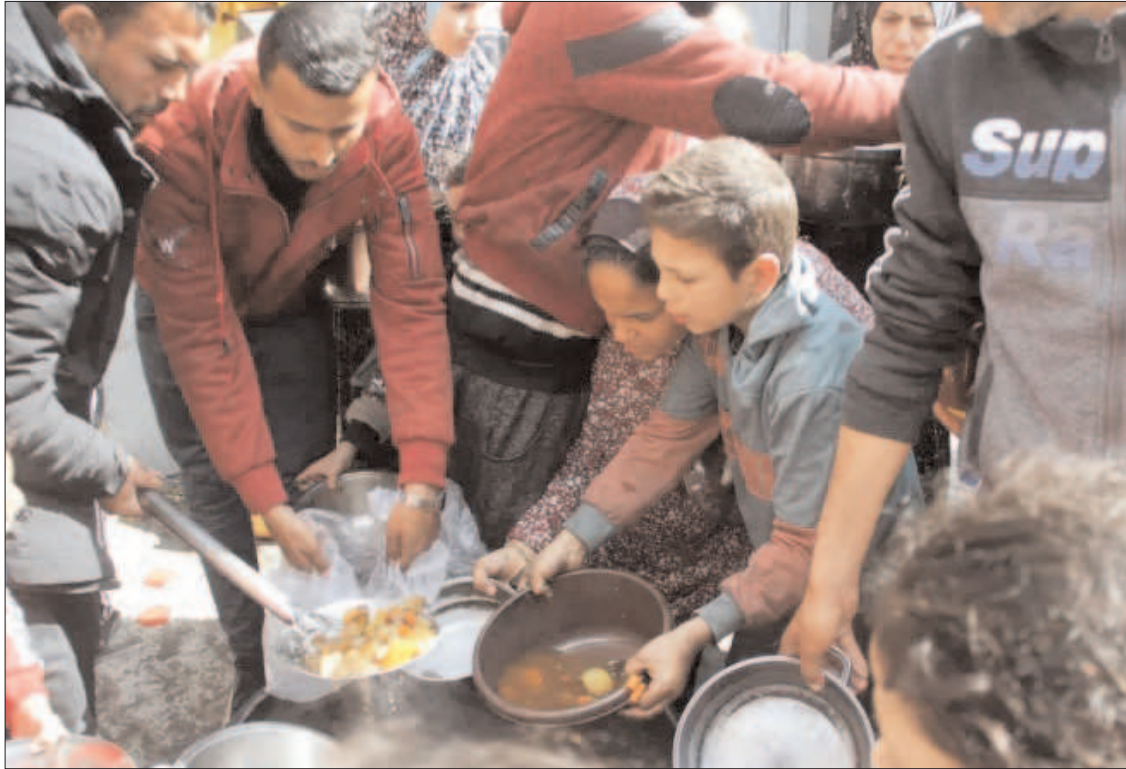
GAZA: Palestinians gathered to receive free food in Jabalia.

Pilgrimages to Makkah are a financial windfall for Saudi Arabia, generating billions of dollars as the world's biggest crude oil exporter tries to develop its tourism sector. Umrah, the pilgrimage which can be performed throughout the year, drew 13.5 million worshippers last year, and authorities are targeting 30 million Hajj and umrah pilgrims by 2030.