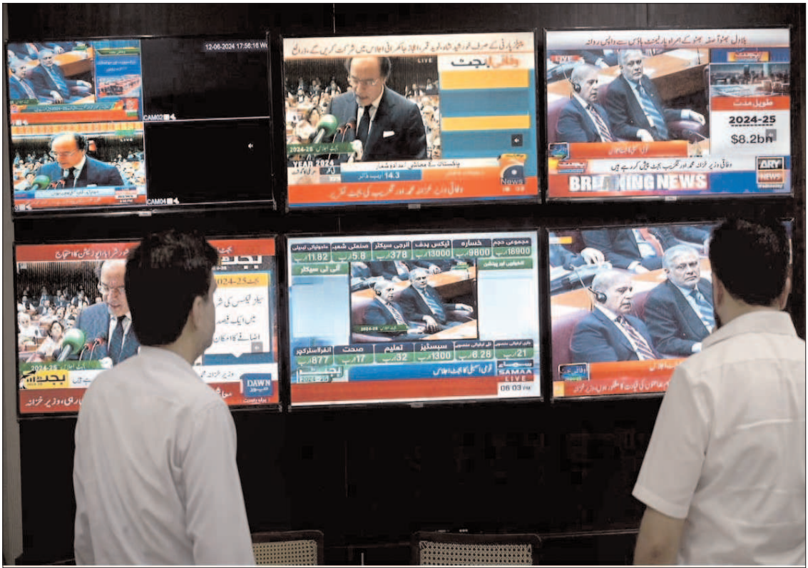
ISLAMABAD: From every corner of the nation, eyes are fixed on TV screens as Finance Minister Muhammad Aurangzeb delivers the federal budget speech for the fiscal year 2024-25.