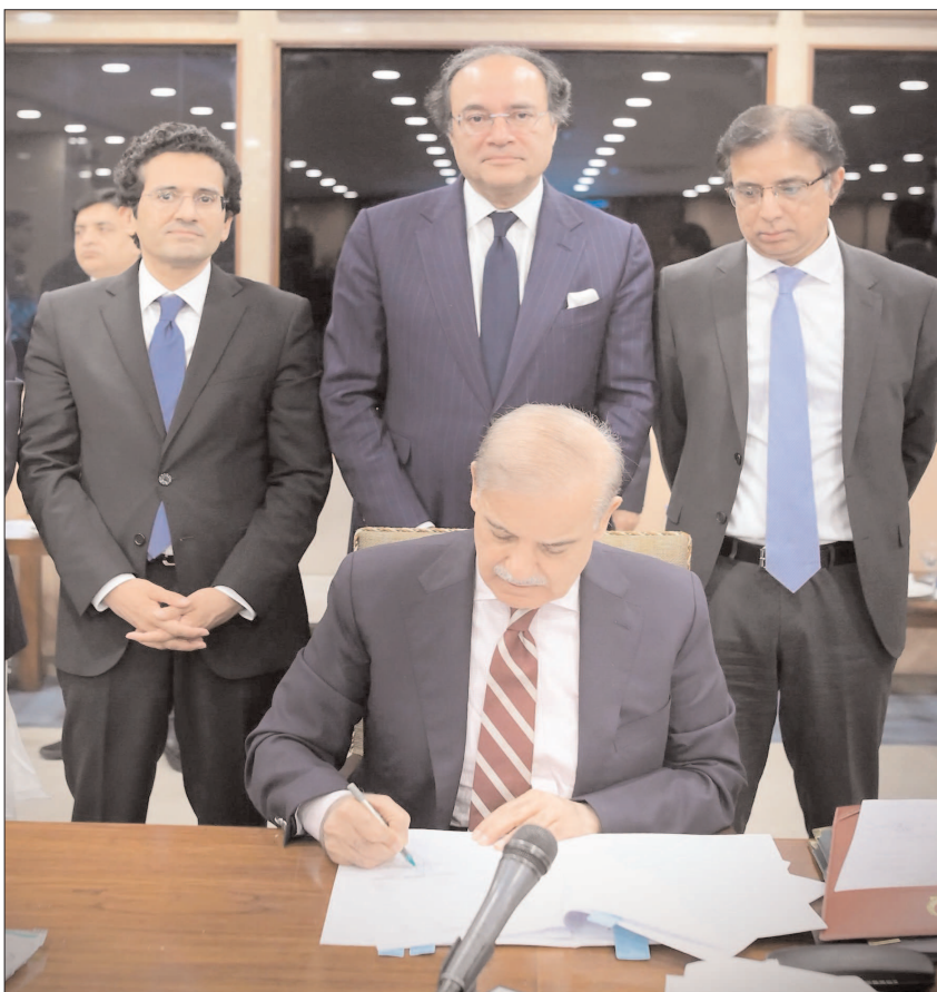
ISLAMABAD: Prime Minister Shehbaz Sharif signing the documents of Federal Budget 2024-25 after its approval from federal cabinet.