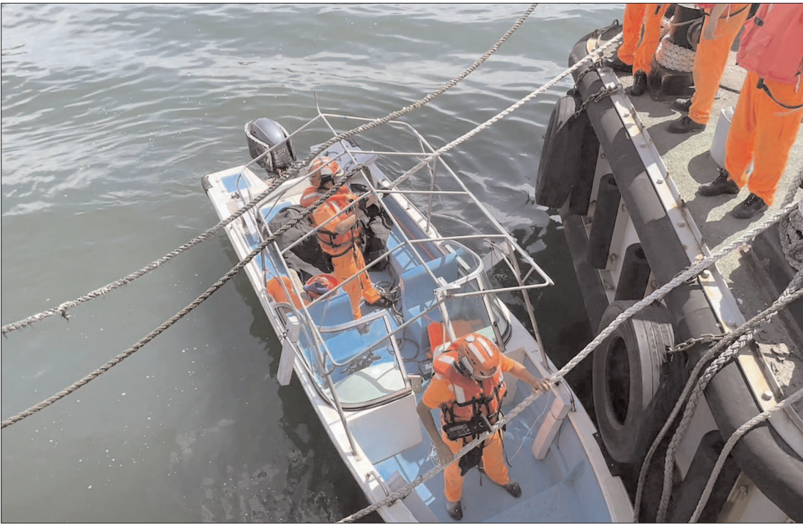
TAIPEI CITY: Taiwan's coast guard officials are seen on board a speedboat that an alleged former Chinese naval officer used to enter a harbor in Taiwan.

And the party is demanding that the president call another election within 90 days. It is unclear whether this legal move will have any impact. Parliamentary officials had previously dismissed the MK's objections, saying its interpretation of the constitution was incorrect, and the chief justice went ahead with announcing a date for the first sitting.