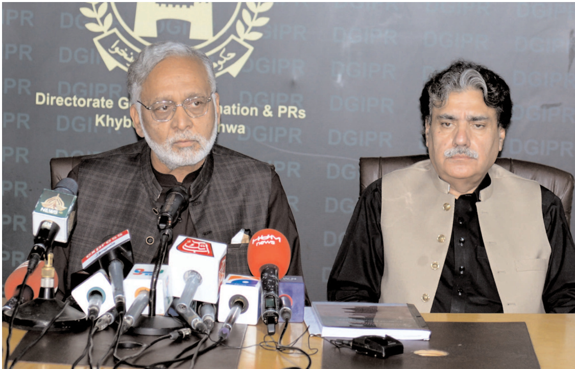
PESHAWAR: Brigadier (ret) Muhammad Mussaddiq Abbassi, Special Assistant to the Chief Minister of Khyber Pakhtunkhwa for Anti-Corruption addressing a press conference. DG Information Muhammad Imran is also present.

They welcome the announcement of health insurance scheme for journalists and media workers undewhich 5,000 journalists and media workers would be given health insurance under the scheme in first phase, while 10,000 more would get the facility under its second phase.