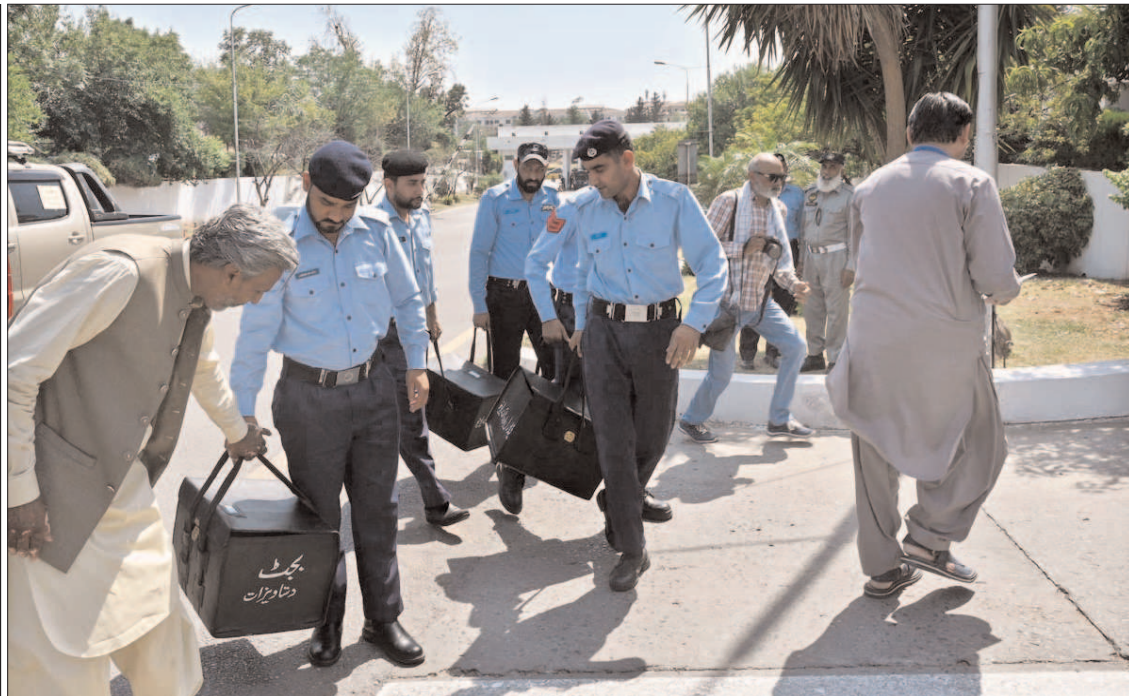
ISLAMABAD: Police officials carrying bags of budget documents arrive at the National Assembly before Finance Minister Muhammad Aurangzeb presents the country's annual budget for fiscal year 2024-25.

"It has come to our attention that the previous requirement of producing Form B as a condition for admission in federal government schools has inadvertently restricted access to education for underprivileged children," the min-