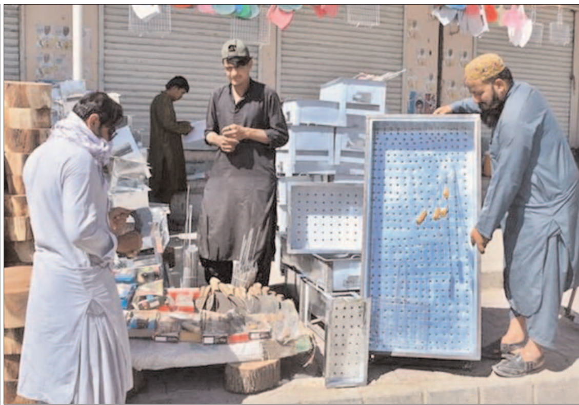
QUETTA: A vendor selling barbeque items at Sariah Road ahead of Eidul Azha.