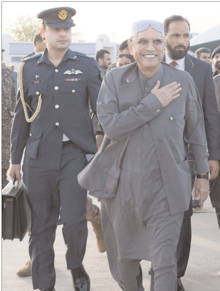
NAWAB SHAH: President Asif Ali Zardari arriving at airport.