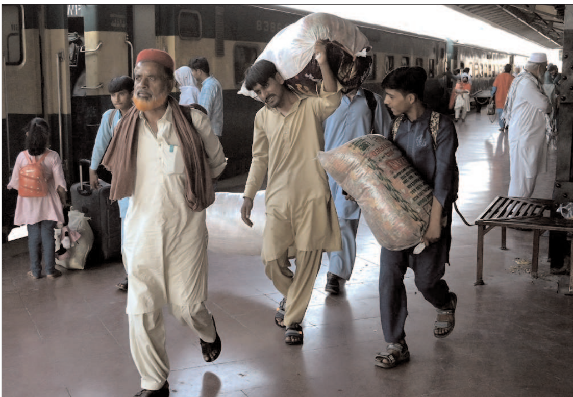
RAWALPINDI: People arriving at Railway station depart their hometowns to spend Eid ul Azha holidays with their loved ones.

ISLAMABAD (APP): The Capital Development Authority (CDA) has established a helpline and WhatsApp contact for residents to report issues regarding cleanliness in the federal capital. According to the spokesperson, citizens can send their messages to the number 0335-5001213 through What's App Message or SMS. Citizens can send messages via WhatsApp or SMS to the number 0335 5001213. Citizens can call the sanitation helpline numbers 1334 or 9213908, and also contact 9203216, 9211555, or 9223171 to report issues or complaints related to urban sanitation.