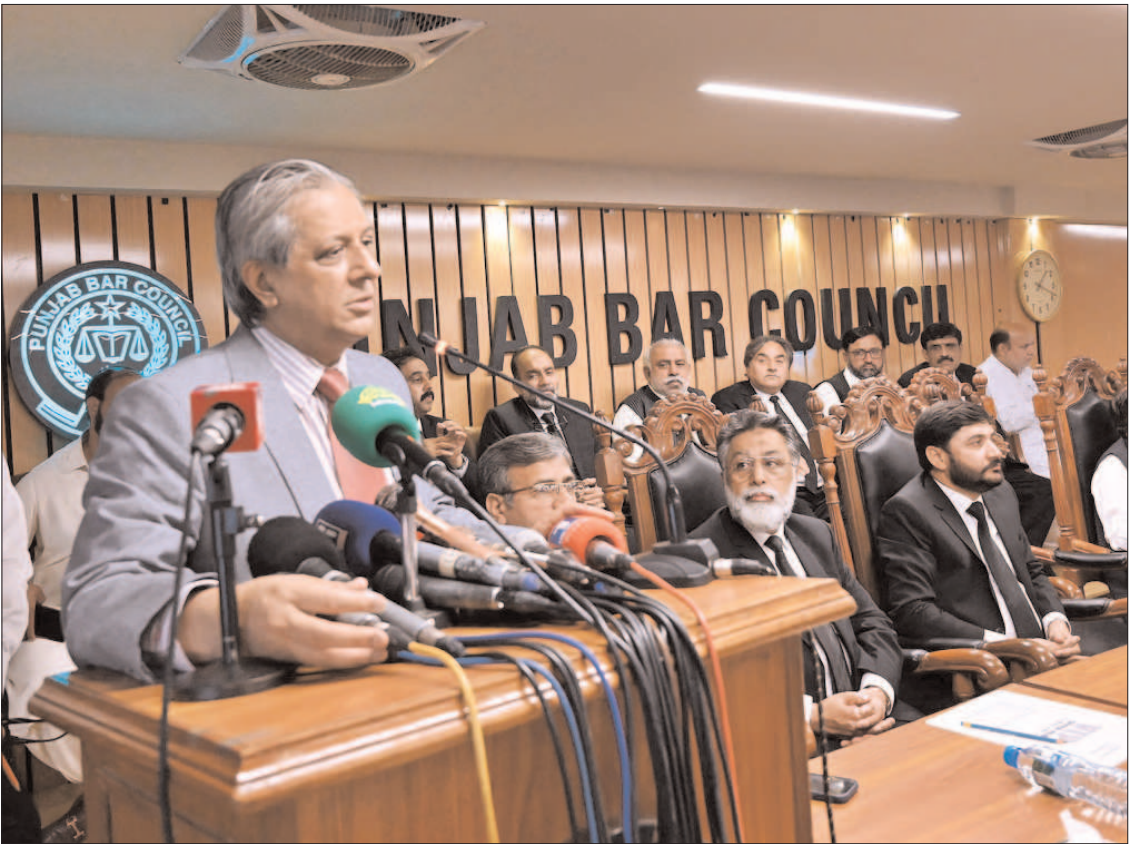
LAHORE: Law Minister, Azam Nazeer Tarar addressing the Cheque distribution ceremony at Punjab Bar Council.