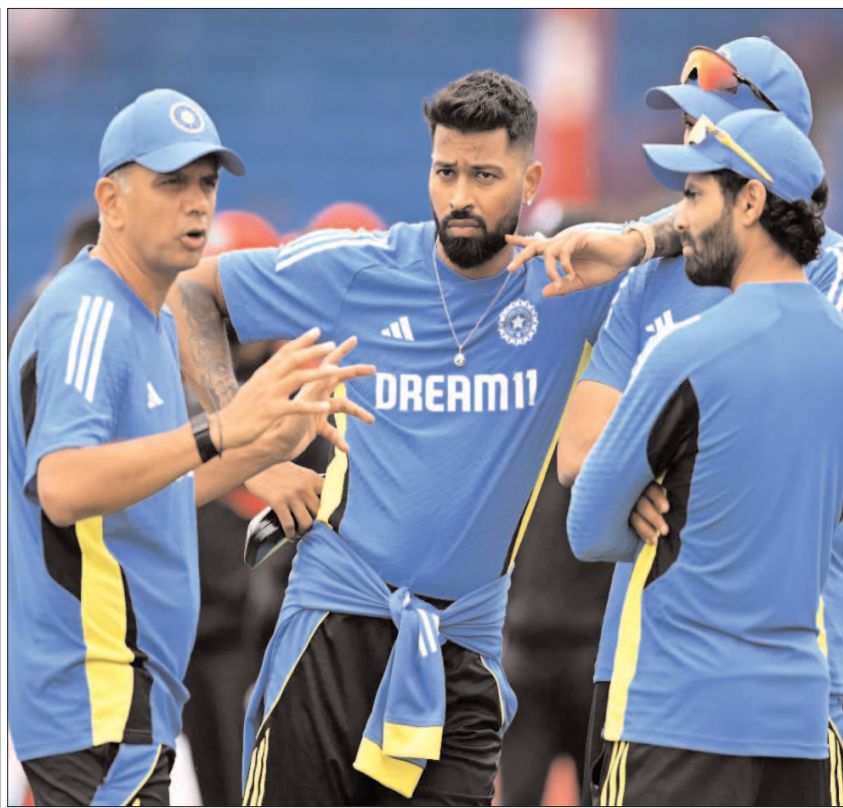
LAUDERHILL: India coach Rahul Dravid has a chat with his players.

Messi claimed his second in the 77th minute after a superb pass from substitute Angel di Maria. The tournament runs in the United States from 20 June to 14 July, with coach Lionel Scaloni's side starting their campaign against Canada on Thursday before group games against Chile and Peru. "We're going to keep trying to do our best, we still want to keep winning titles," added Messi. "It will be harder and harder, the games are getting tougher, winning [the Copa] again is hard, but we will try again."