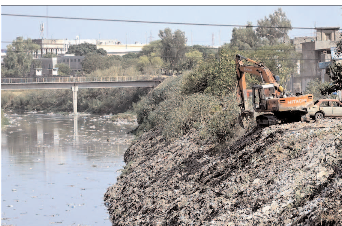
RAWALPINDI: Worker busy cleaning garbage with the help of machine from 'Nullah Lai' before monsoon season.

DG RDA Kinza Murtaza said that on the orders of the Commissioner, the crackdown against illegal housing societies would continue and strict action would be taken without any discrimination against the rules violators. She advised the citizens not to invest in illegal housing schemes. The citizens can visit the RDA website, www.rda.gop.pk or the RDA office to get information about legal and illegal housing societies.