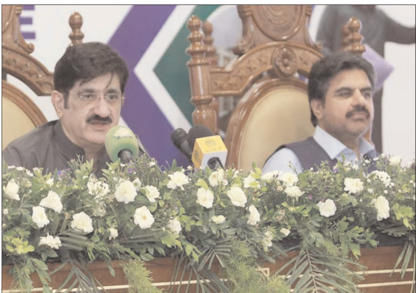
KARACHI: Sindh Chief Minister Syed Murad Ali Shah addressing post-budget press conference.

On a question alleging that no work is done in Sindh without corruption and "commission", Shah said problems are everywhere. "The people [of this province] do not agree with you [as] they have elected us [in polls]," he said. Speaking on the issue of water security, the chief minister said that the federal government has allocated less budget for connecting Keenjhar Lake to the K-IV project. "The federal government has allocated Rs25 billion for the K-IV project [whereas] the Sindh government will spend Rs170 billion of its own," he said, adding that Prime Minister Shehbaz Sharif has promised that the disbursement of the concerned amount will be approved by June 17.