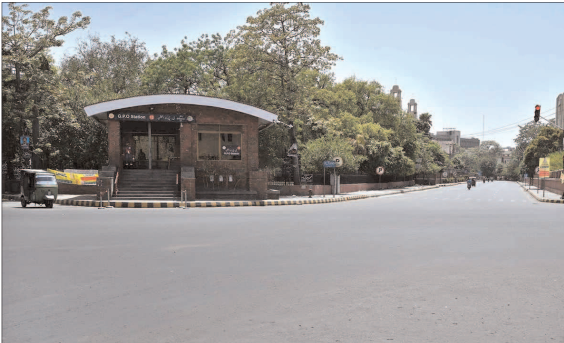
LAHORE: A deserted view of GPO Chowk, Mall Road due to Eid-ul-Adha holidays.