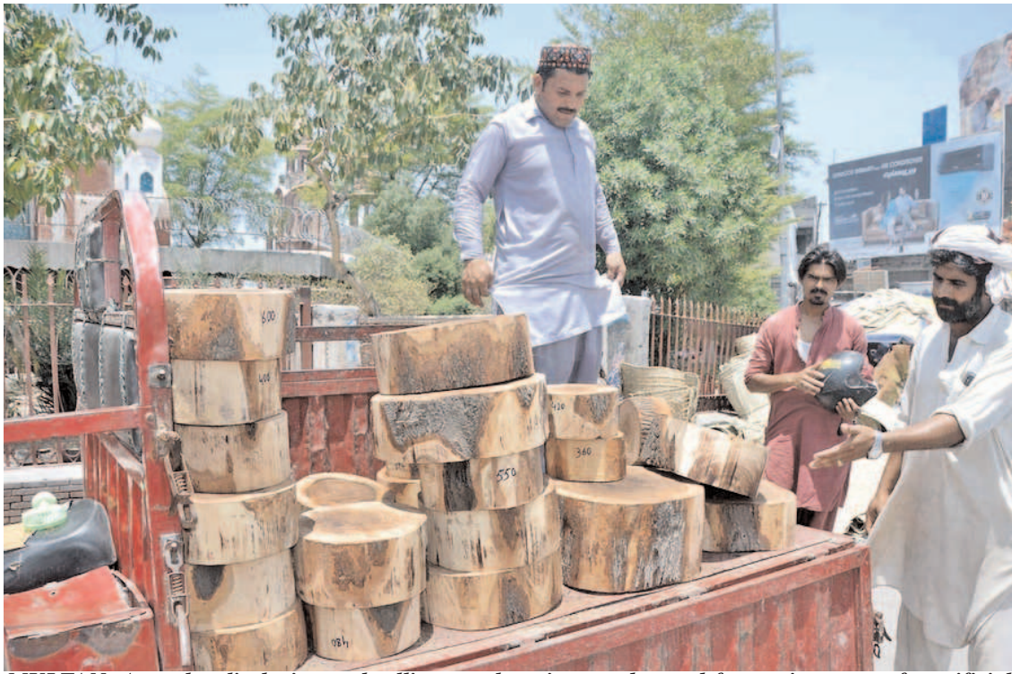
MULTAN: A vendor displaying and selling wooden pieces to be used for cutting meat of sacrificial animals during Eid-ul-Adha.

"This approach provides hoteliers with a strategic advantage in a competitive market. AI-driven revenue management systems can predict demand with higher accuracy, allowing hotels to