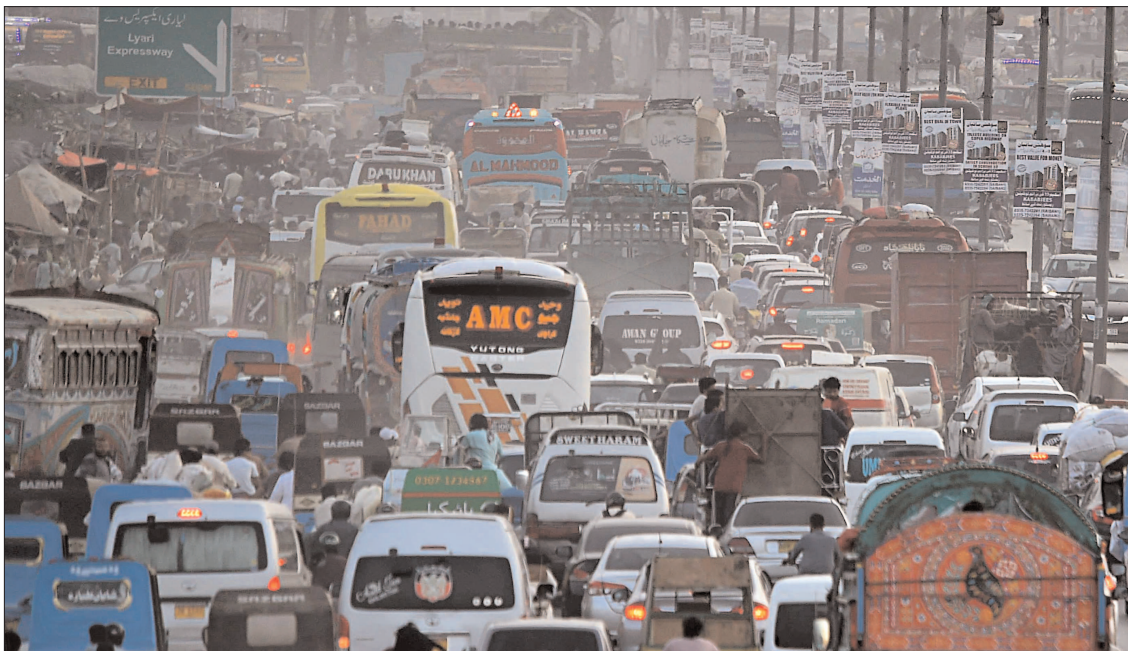
KARACHI: A view of massive traffic jam at Sohrab Goth Road ahead of Eidul Azha.