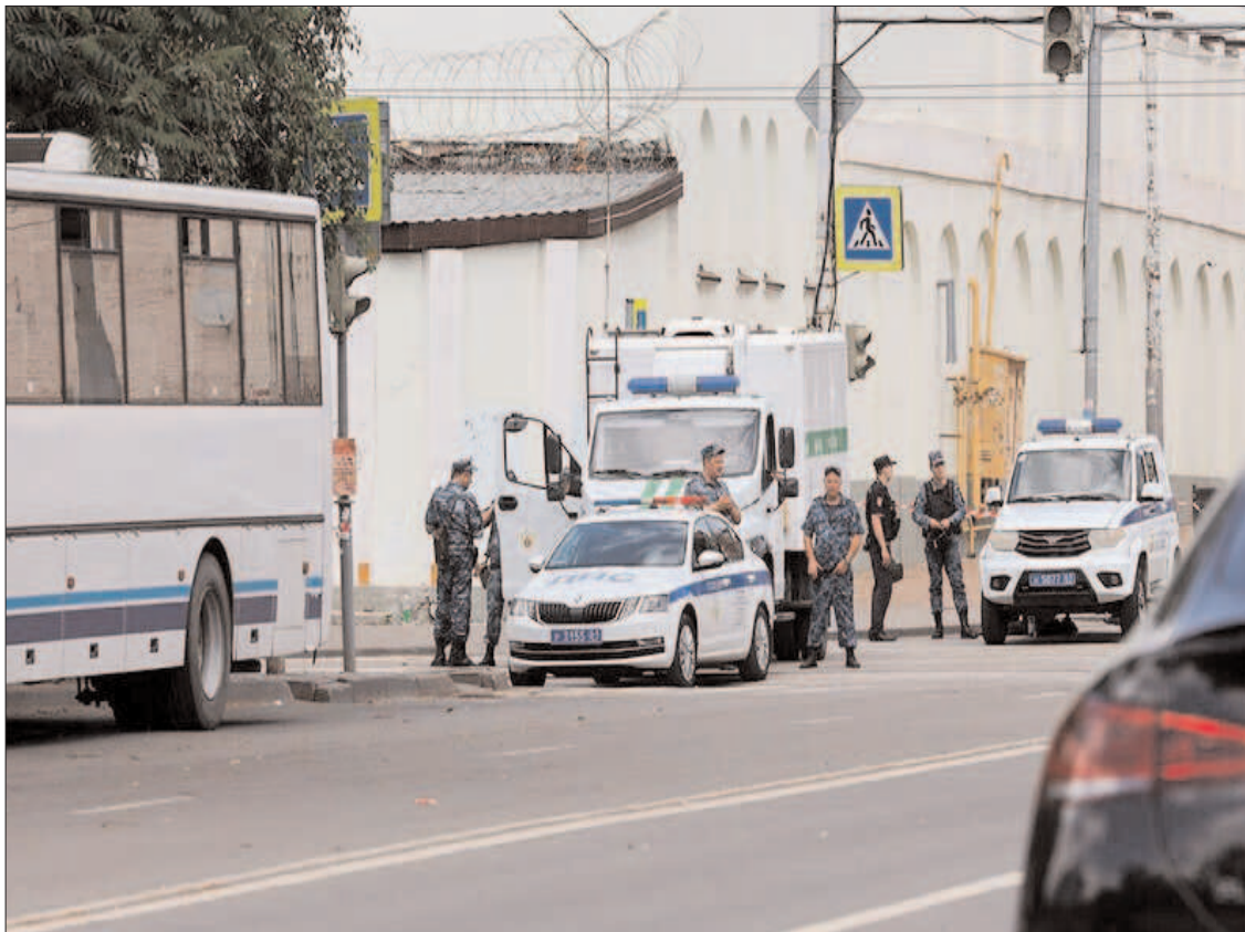
MOSCOW: Russian police in Moscow stand guard after two inmates took guards hostage in a detention centre in Rostov on Sunday.

The incident comes nearly three months after gunmen killed at least 144 people when they opened fire inside a concert hall near Moscow in an attack claimed by the group. Hundreds more were injured in the March 22 attack at the Crocus City Hall, the deadliest on Russian soil for two decades. More than 20 people have since been arrested, including the four suspected gunmen, all from the former Soviet republic of Tajikistan, an impoverished country on Afghanistan's northern border. Russia has been repeatedly targeted by attacks claimed by IS militants, though the jihadist group's influence in the country remains limited. Russian media reports speculated that the attackers at the Rostov detention centre could be among those arrested in 2022 for allegedly planning an attack on the Supreme Court of Karachay-Cherkessia, a Muslim-majority Russian republic in the Caucasus. Nearly 4,500 Russians, mainly from the Caucasus, travelled to Iraq and Syria to fight with IS, according to official figures. In April, two armed men who authorities said were members of "an international terrorist organisation" were shot dead by Russian forces near Nalchik in the Caucasus.