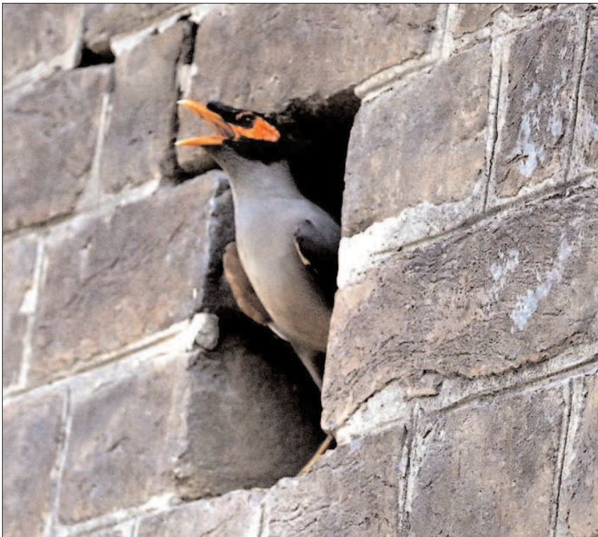
RAWALPINDI: A view of myna bird with his open beak during hot weather in the city.

The livestock department was ensuring the supply of anti-tick spray, antibiotics, and other necessary drugs, he informed. Solid steps were taken to ensure the establishment of inter-provincial check posts, he said, adding that inter-district check posts were also set up to complete the task of spraying animals to prevent the Congo virus and segregating sick animals.