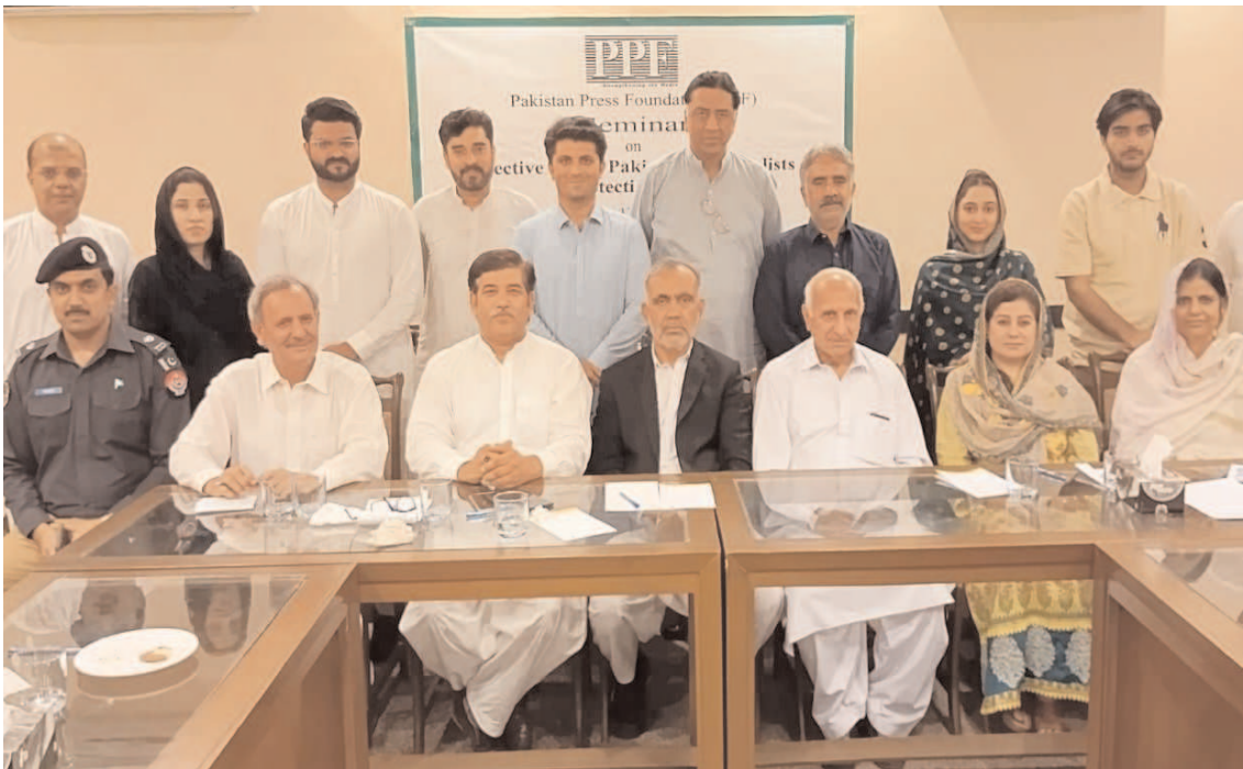
PESHAWAR: Participants of the seminar on protection of journalists organized by Pakistan Press Foundation, posing for photographers at the end of the seminar.