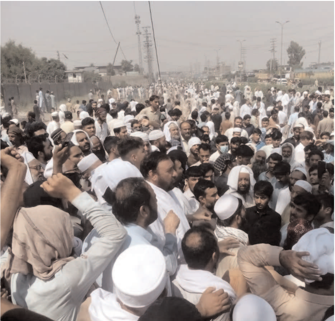
PESHAWAR: Residents of PK-84 staging a protest in front of Rahman Baba Grid Station on Ring Road, where they have been facing load shedding for over 18 hours.