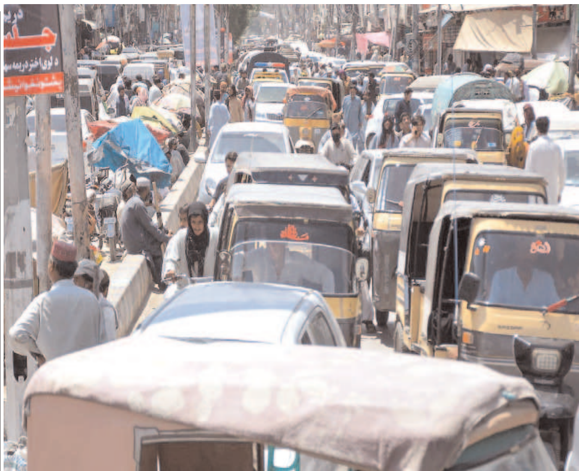
QUETTA: A view of massive traffic jam at Bacha Khan Chowk in provincial capital.

Dr Jamshaid Akhtar observed that livestock can perform far better than its present capacity in poverty alleviation and milk and meat production. "The Punjab Livestock department has launched different programs like calf fattening, save buffalo calf, advisory service and provision of free of cost animals. We should also promote use of Silage, Rhodes grass and new animal breeds to further enhance milk and meat production."