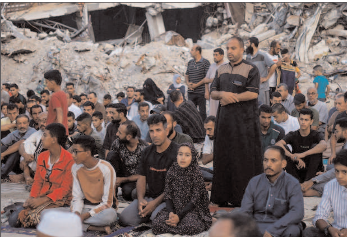
GAZA STRIP: Palestinians hold Eid Al-Adha prayers by the ruins of Al-Al Rahma mosque destroyed by Israeli air strikes in Khan Younis, southern Gaza Strip on Sunday.