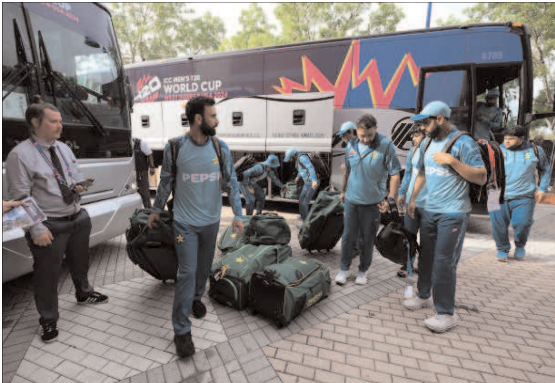
LAUDERHILL: Pakistan player arrive at the stadium ahead of the ICC Men's T20 Cricket World Cup West Indies & USA 2024 match between Pakistan and Ireland.

Players will compete across five medal events: women's singles, men's singles, women's doubles, men's doubles and mixed doubles.