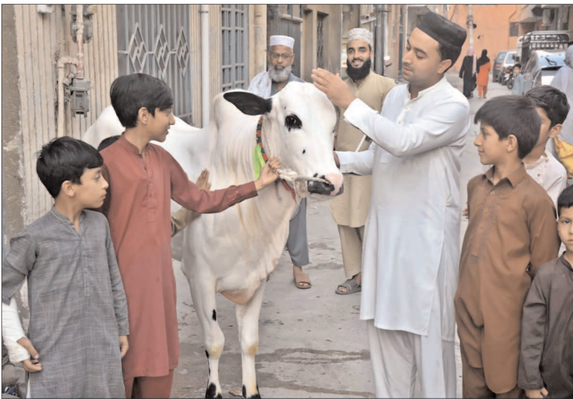
RAWLPINDI: People touch a bull to show their love for the sacrificial animal in connection with Eidul Azha.

ISLAMABAD (APP): The International Islamic University (IU) has asked interested students to submit applications for admission to the summer Arabic language learning courses by June 28, 2024. According to an official, the 8-week course, with separate classes for male and female students, will begin on July 1, 2024. The university has offered courses in certificates, diplomas, and advanced diplomas in three categories, separately for male and female aspirants. The Certificate in Arabic Language is designed for students with no prior understanding of Arabic. The Diploma in Arabic Language is intended for those who have completed the Certificate program. At the same time, the Advanced Diploma course is available to students who have completed the Diploma program at IU or any other recognised institute.