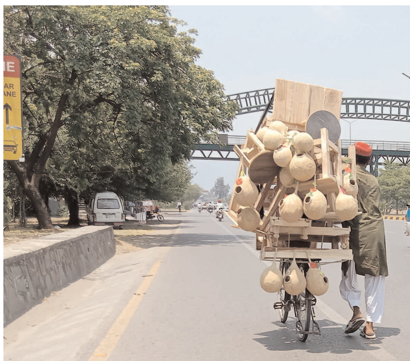
ISLAMABAD: A vendor on his way at Islamabad Highway selling birds' nests during a hot and humid day in federal capital.

Therefore, the launch of MM-1 is seen as a testament among the locals to the strong collaboration and partnership between Pakistan and China in the field of space technology. They believe this partnership will continue to benefit both countries in the future.