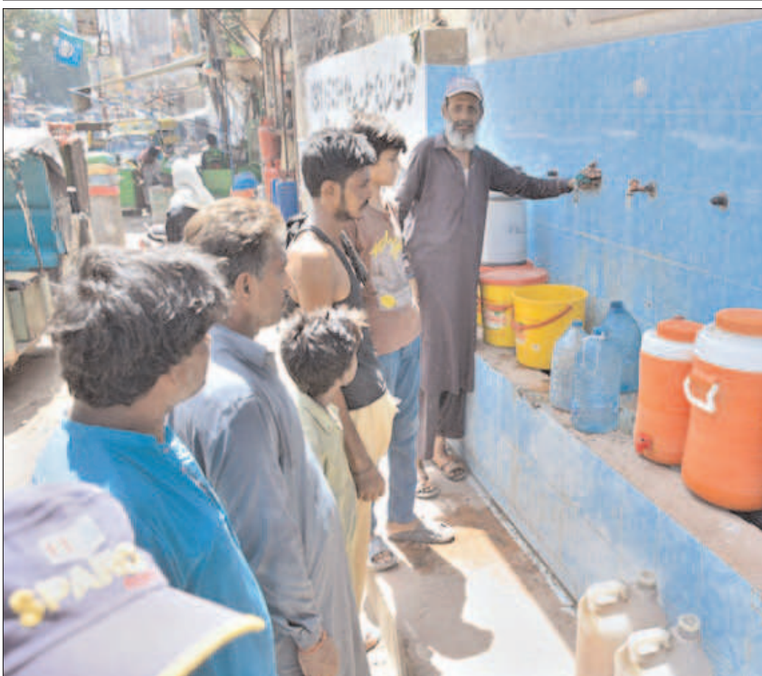
HYDERABAD: People busy in filling their pots with drinking water from water filtration plant at Phulile area.