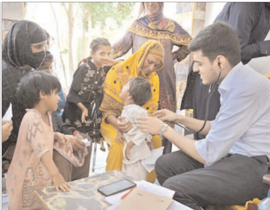
SARGODHA: A doctor examining patients during free medical camp organized by NCHD in collaboration with different organization at Dindaar Colony.