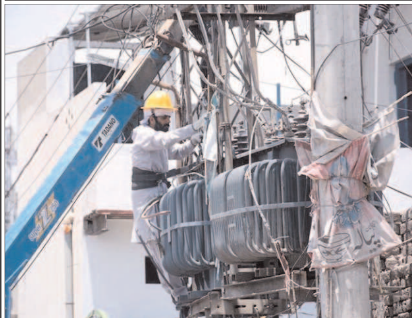
FAISALABAD: FESCO workers removing fault from electricity transformer.

"Without a peaceful heart and mind, journalists would not be able to do balanced news stories," said a Korean instructor while emphasizing the importance of forgiving, which, she added, will be easy if "we first understand the situation of people with whom we are working." The Koreans also gave the example of Nelson Mandela for his epic struggle for peace which, she said, became possible after the great South African leader announced amnesty while implementing the policy of national reconciliation.