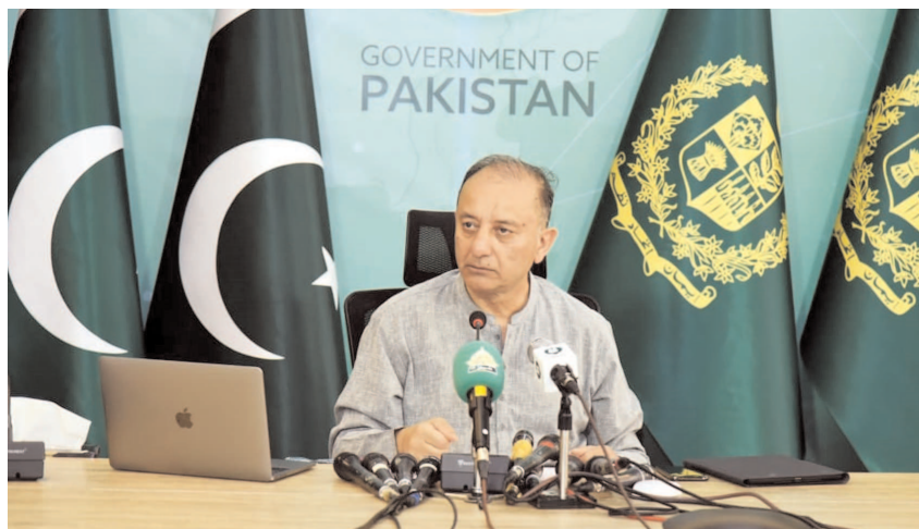
ISLAMABAD: Federal Minister for Petroleum Dr Musadik Malik addressing a press conference.

ECE is crucial for developing cognitive abilities, communication skills, creativity, problem-solving, and social skills, setting the stage for enhanced learning outcomes in subsequent grades. Children who receive ECE before enrolling in primary school exhibit lower dropout rates, improved attendance, better retention, and completion, and smoother transitions to higher educational levels.