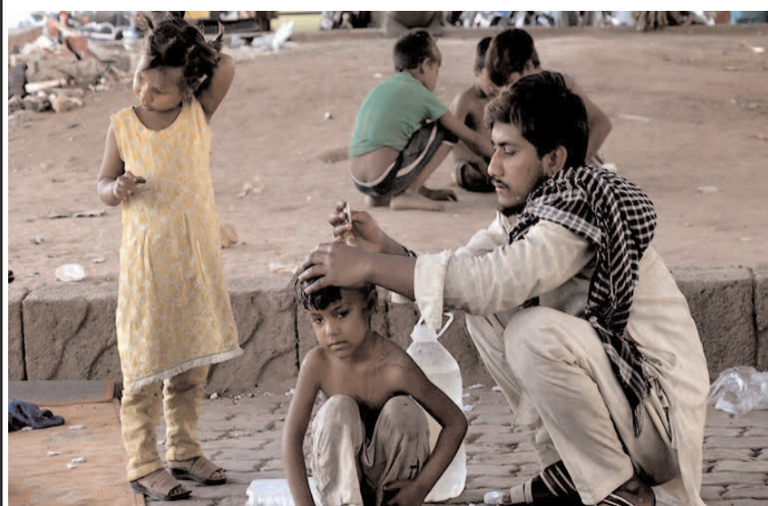
RAWALPINDI: A Gypsy father carefully cuts his son's hair at their roadside temporary home.

sumers complaints. Meanwhile, the IESCO has already canceled all approved development and scheduled maintenance programmes due to severe heatwave. The consumers could lodge their complaints at helpline 118 or send their SMS number 8118.