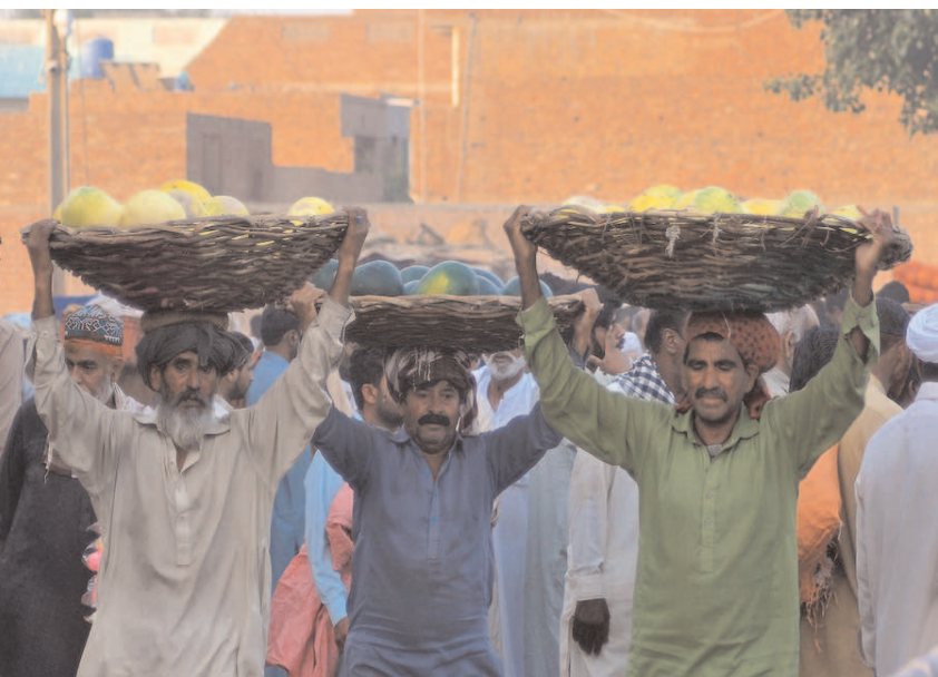
MULTAN: Labourers carrying seasonal fruit baskets on their heads at fruit market.

This strategic move is expected to boost trade and investment, opening new avenues for both nations to benefit from shared expertise and resources.