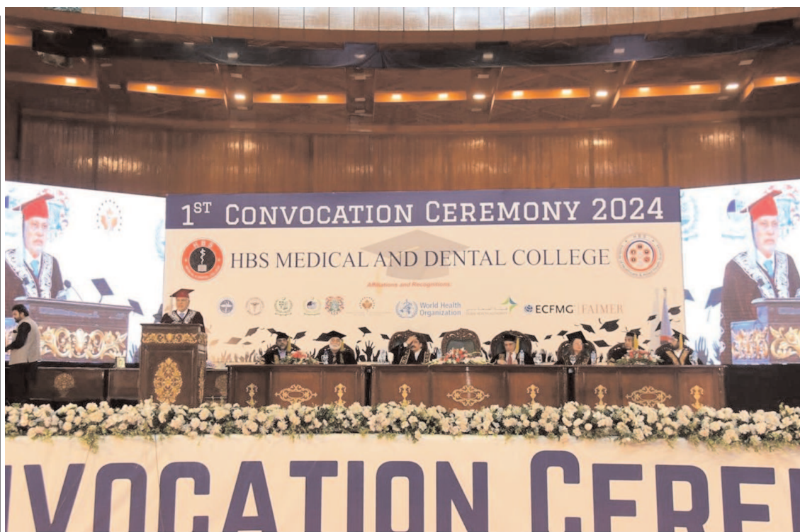
ISLAMABAD: Deputy Prime Minister and Foreign Minister Senator Ishaq Dar delivering speech as chief guest at the 1st convocation of HBS Medical and Dental College.

They had chosen a noble duty and profession as under Islamic teachings 'saving a life tantamount to saving the whole humanity', he advised.