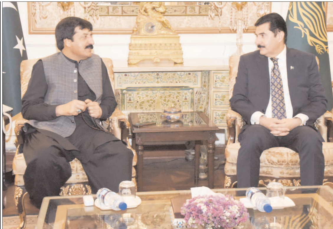
LAHORE: KP Governor, Faisal Karim Kundi meeting with Punjab Governor, Sardar Saleem Haider Khan.