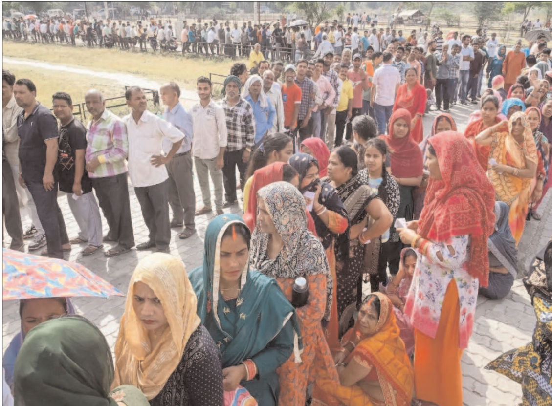
CHANDIGARH: Voters queue up at a polling station in last phase of Indian general elections.

Israel's retaliatory offensive has killed at least 36,284 people in Gaza, mostly civilians, according to the Hamas-run territory's health ministry. In northern Gaza, witnesses said that after carrying out a three-week operation in the town of Jabalia and its neighboring refugee camp, troops had ordered residents of nearby Beit Hanun to evacuate ahead of an imminent assault. The Israeli army said troops "completed their mission in eastern Jabalia and began preparation for continued operations in the Gaza Strip."