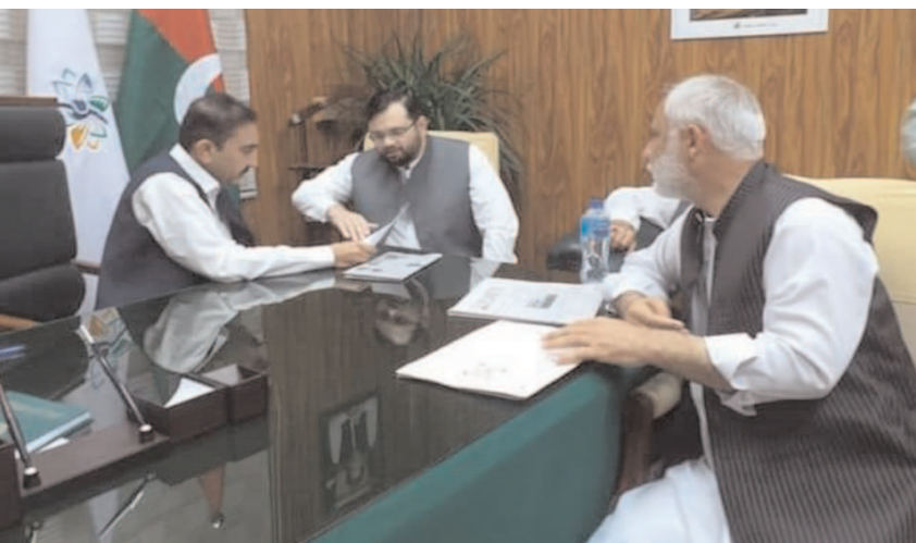
PESHAWAR: Advisor to Chief Minister KP on Tourism and Culture Zahid Chanzeb meeting with a delegation from Chitral in his office.

It was told that consumers of these areas also owe a significant amount to Wapda and load shedding has been continued in these areas to reduce line losses while remaining 500 feeders are free from any kind of load shedding. Meeting also urged elected representatives to play their role in ending power theft and support efforts of government to end load shedding.