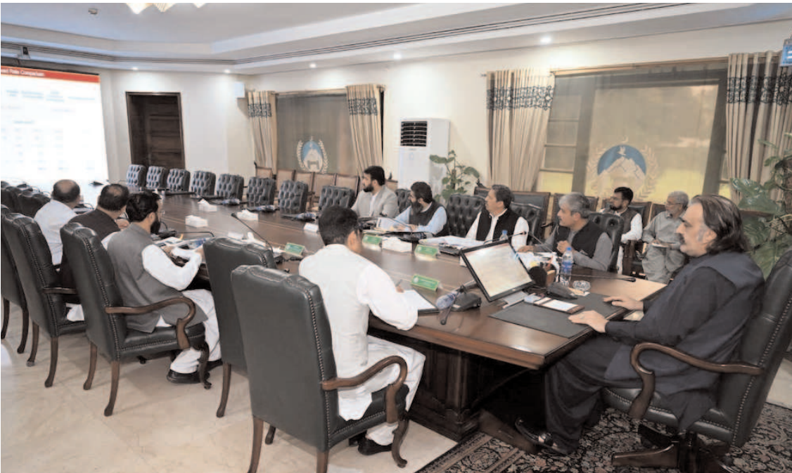
PESHAWAR: Chief Minister Khyber Pakhtunkhwa Sardar Ali Amin Khan Gandapur chairing a meeting of Mineral Investment Facilitation Authority.

The PESCO need to take a strict action against the defaulters and Kunda culture through police or any other government agency and registered FIRs against the defaulters. Even collect their dues with fines from the defaulters. The residents threatened that if their demands regarding provision of electricity and ending of load shedding in the area were not fulfilled then they shall be compelled to arrange sit-in in front of Khyber Pakhtunkhwa Assembly to approach legislators for their basic right.