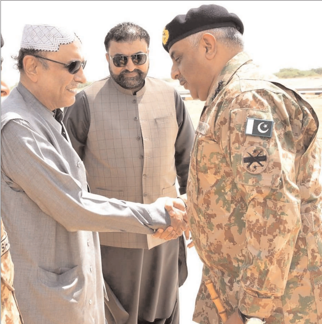
GWADAR: President Asif Ali Zardari welcomed by Chief Minister of Balochistan, Mir Sarfraz Ahmed Bugti and Commander 12 Corps Lt. Gen. Rahat Naseem Ahmed Khan, upon his arrival.