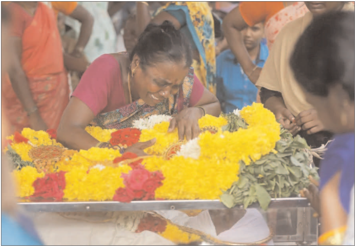
NEW DELHI: A relative of a man, who died after drinking illegally brewed liquor, cries over a casket containing his body in Kallakurichi district of the southern Indian state of Tamil Nadu.