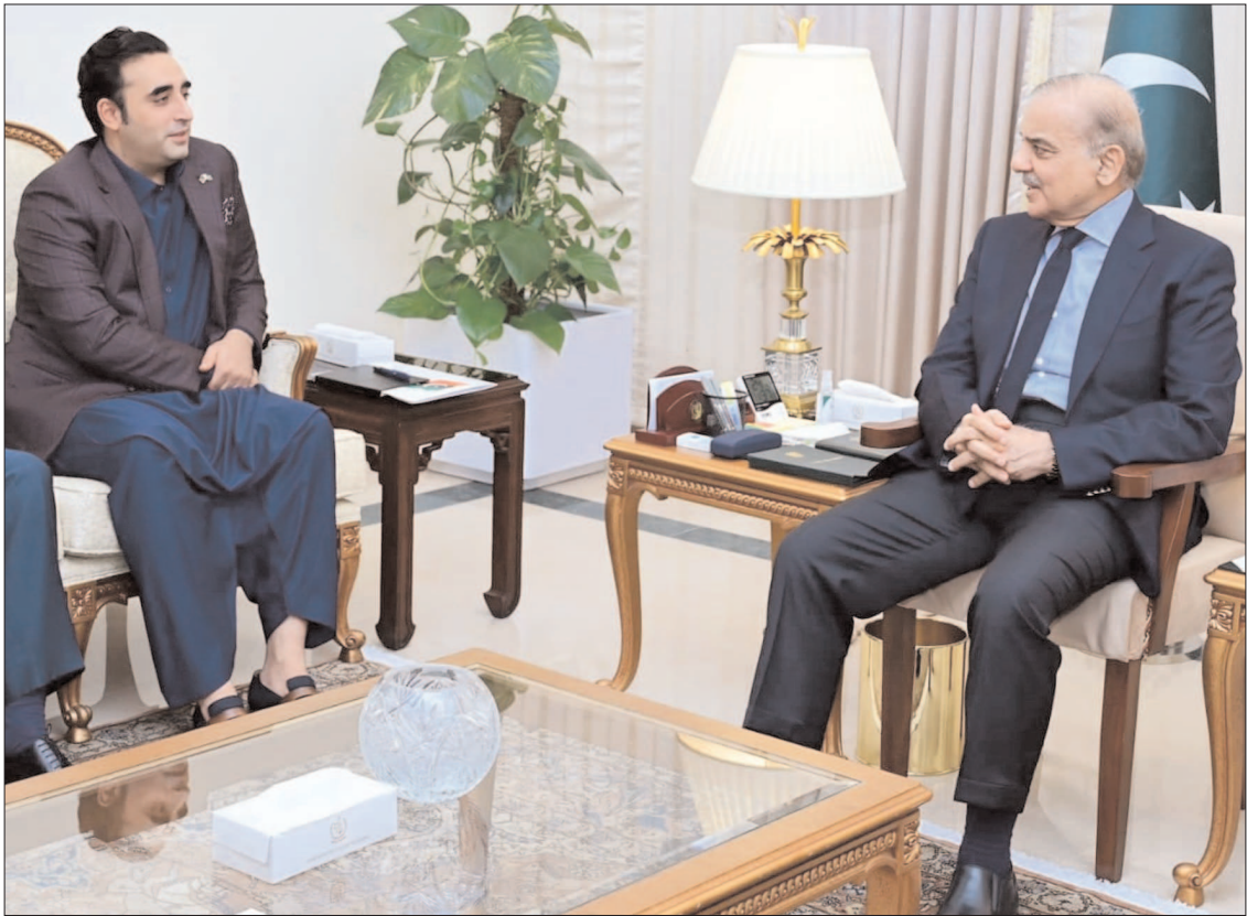
ISLAMABAD: PPP Chairman, Bilawal Bhutto Zardari called on Prime Minister, Shehbaz Sharif.