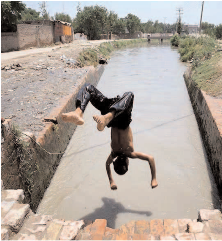
PESHAWAR: Youngster diving in a canal for bath to get relief from hot weather.

PESHAWAR (APP): The Hayatabad Medical Complex provided medical treatment to 5,219 patients during the three-day Eid-ul-Azha holidays, according to the hospital's spokesperson. Among the treated patients, 548 were for food poisoning and overeating, 80 for traffic accidents, six for gunshot wounds, and 91 trauma cases. Additionally, 289 patients received ECG facilities, and 264 underwent operations across various departments. The hospital administration ensured the presence of doctors, paramedics, nurses, and support staff, providing medicines without delay. Regular updates were received from the on-duty team to manage the increased patient load effectively. Thousands of patients treated Lady Reading Hospital Thousands of patients were treated at Lady Reading Hospital during the Eid holidays, Spokesman Muhammad Asim told media men here on Thursday. He said that more than 1000 patients complained of back diseases in three days. Giving details, he said that more than 300 injured people were brought to LRH due to stabbing by animals. And around 200 injured in road traffic accidents were also treated while more than 100 patients were given free dialysis during the Eid holidays. He said, about 50 C-sections while more than 100 babies were born and arrival of thousands of patients in gynecology and children's emergencies were also looked after. He said 100 other small and big operations were also conducted.