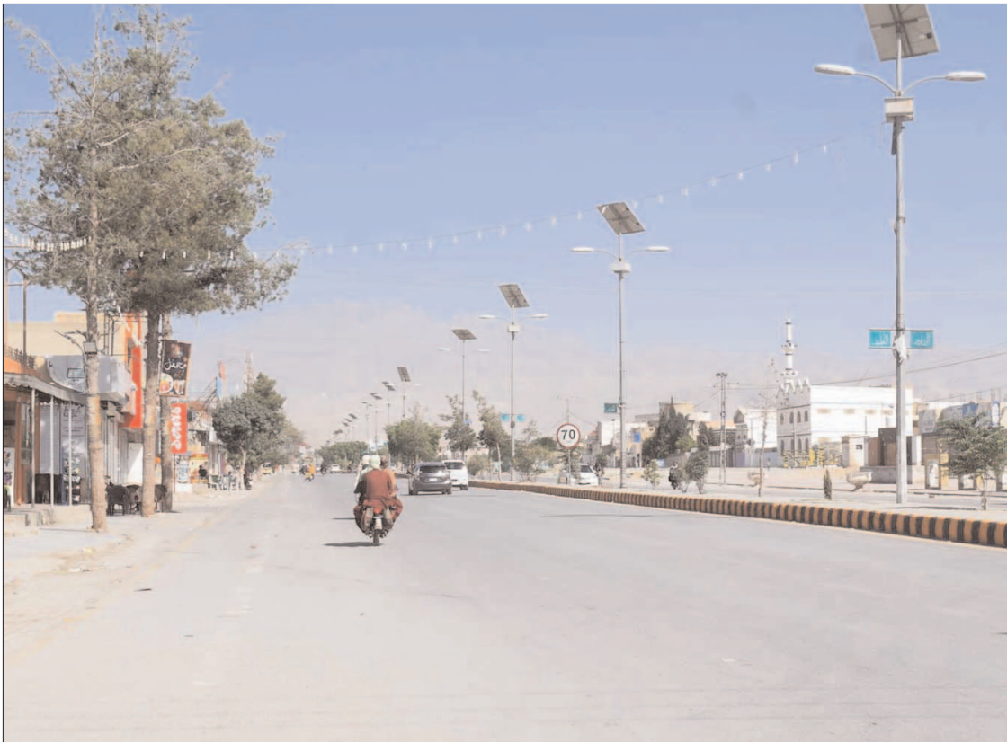
QUETTA: A deserted view of busy road after end of Eid holidays.