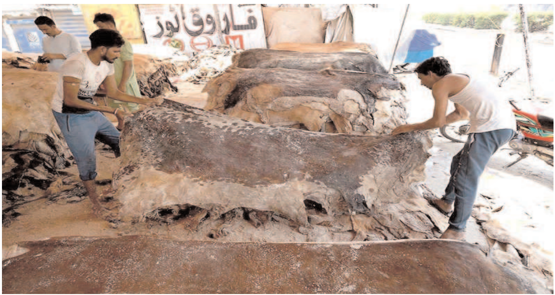
PESHAWAR: Workers preserving the hides of sacrificial animals at their warehouse at Ring Road.