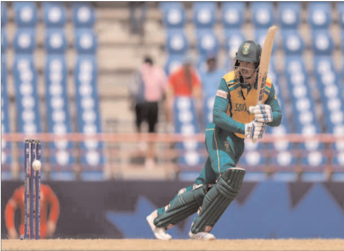
GROS ISLET: Quinton de Kock of South Africa plays a shot during the ICC Men's T20 Cricket World Cup West Indies & USA 2024 Super Eight match between England and South Africa.

NEW YORK (Agencies): Ryan Garcia has been handed a one-year ban from boxing by the New York State Athletic Commission after failing a drugs test. The 25-year-old tested positive for banned substance ostarine in two separate tests taken before his fight with Devin Haney on 20 April. Garcia's victory against Haney will now be recorded as a no-contest - meaning Haney's undefeated record is restored. As well as the ban, Garcia must forfeit his $950,000 ($1.2m) contract purse from the Haney fight and pay a £7,900 ($10,000) fine. The New York State Athletic Commission confirmed Garcia would be suspended until 20 April 2025 and would need to provide a clean urine test before his licence could be reissued.