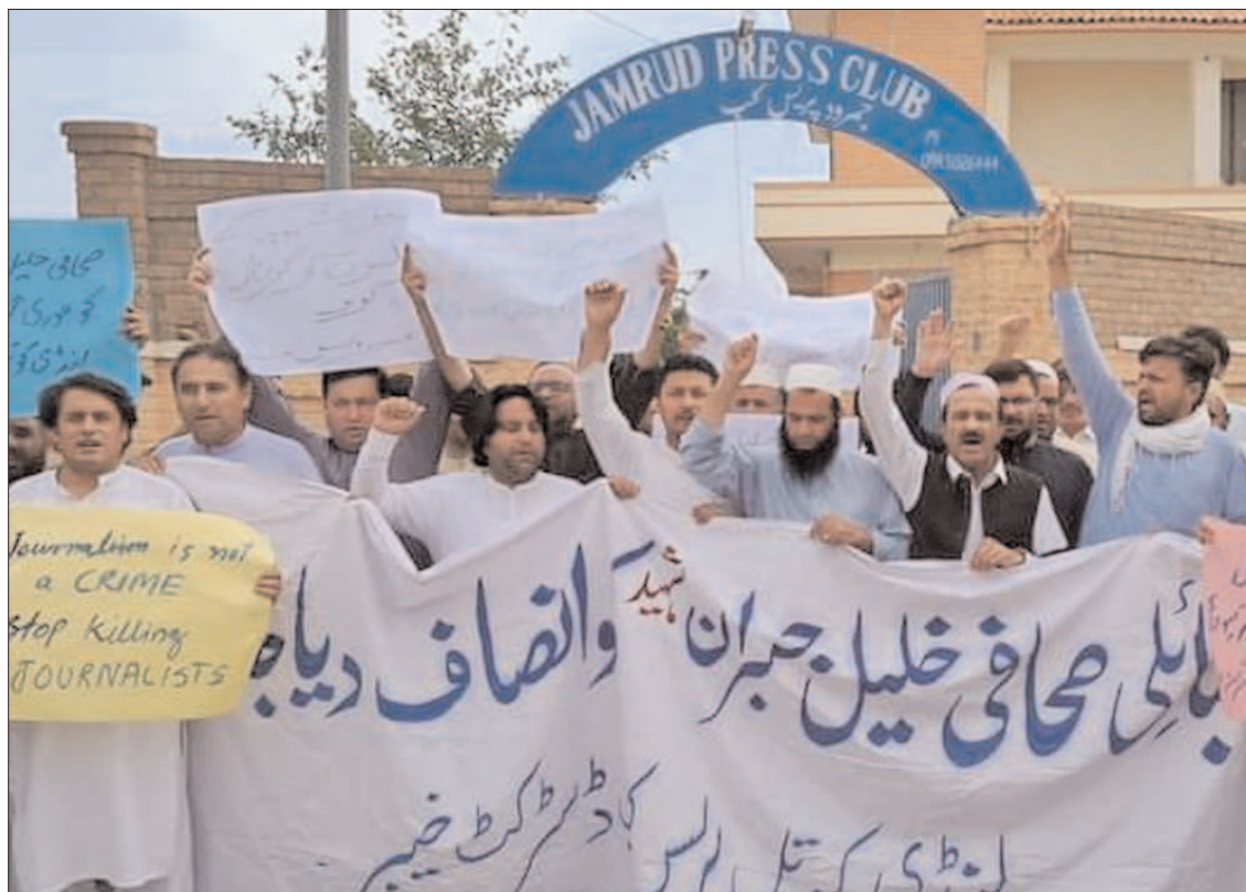
JAMRUD: Journalists holding banner and placards during a protest against killing of their colleague.

The temperature in Lahore was forecasted between a minimum of 28 degrees and a maximum of 38 degrees. Residents of Lahore anticipated cooler conditions and possible thunderstorms, offering a respite from the typically high summer temperatures.