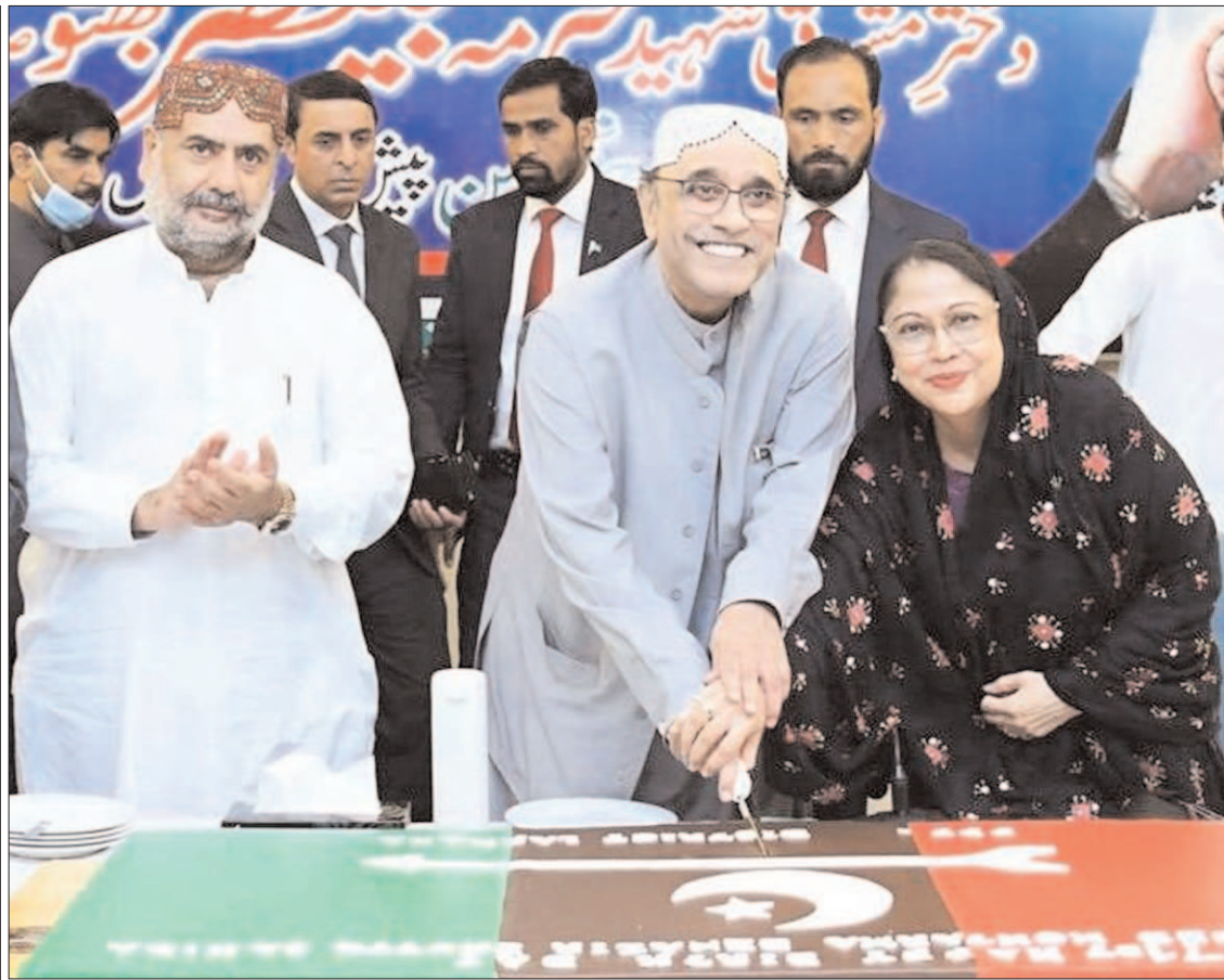
GARHI KHUDA BAKSH: President Asif Ali Zardari cutting cake on the 71st birth anniversary of Shaheed Benazir Bhutto.

At present the total cost of a power unit consists of 72 percent fixed charges and 28 percent variable charges. Still, on the revenue side, fixed charges are only two percent and variable charges are 98 percent. Officials said that the authorities concerned have found a mismatch between the cost and revenue structure in the electricity tariff.