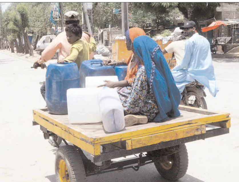
HYDERABAD: Gypsy people traveling on their motorcycle rickshaw loaded with water canes after filling from a tap.

The authors explained the content of the book and said that it comprised contributions of local villagers for the country and social development, their struggle, dedication and the city concept of voluntarism. The book also carries history of Aga Khan Family and that led the journey of Village,s development besides Waris Fadu and other major contributors.