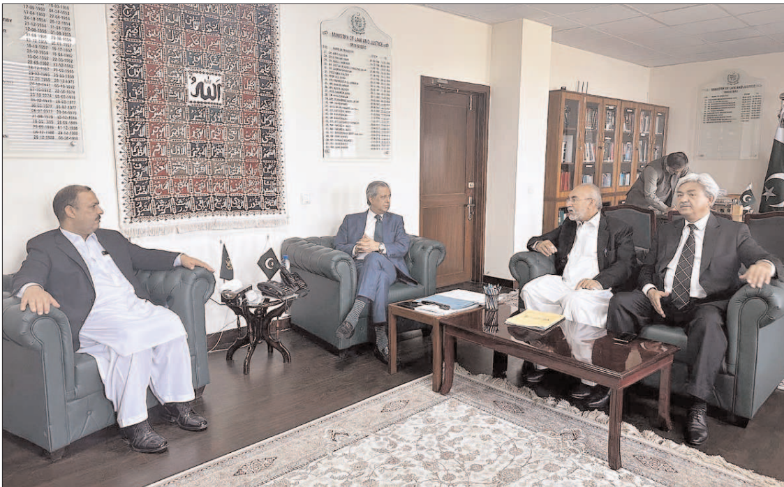
ISLAMABAD: A delegation of Lawyers from Khyber Pakhtunkhwa Bar Council calls upon Minister for Law and Justice Azam Nazeer Tarar.

The Speaker address reaffirmed the resolve of the Parliament, Government, and people of Pakistan to build on past successes and in ensuring that CPEC reaches its full potential.