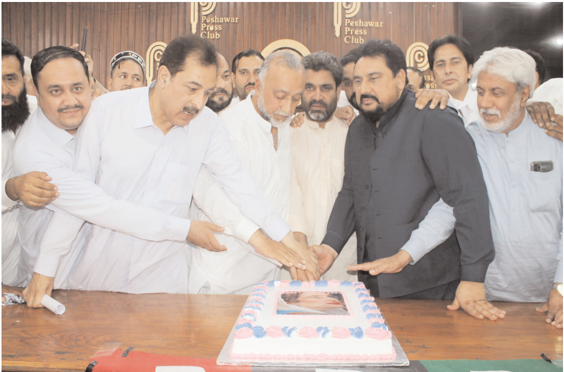
PESHAWAR: Leaders of PPP cutting the cake to celebrate 71st birth anniversary of Benazir Bhutto Shaheed.