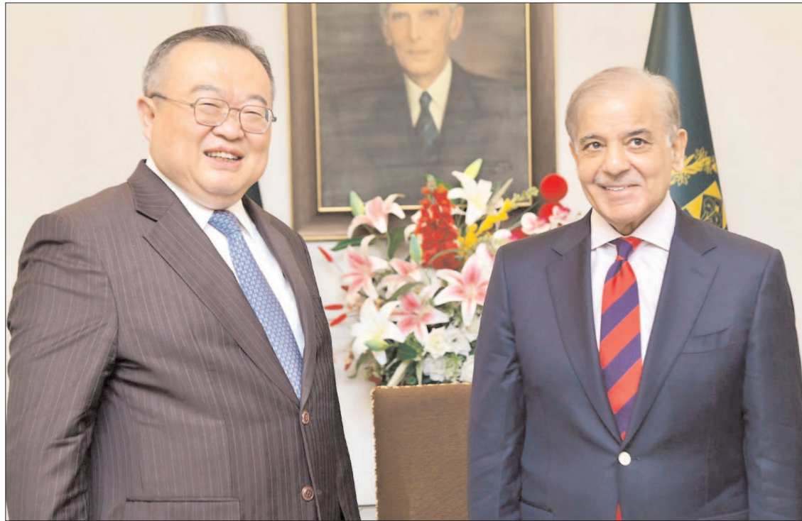
ISLAMABAD: China's Minister of Central Committee of International Department of Communist Party of China, Liu Jianchao called on Prime Minister Shehbaz Sharif.