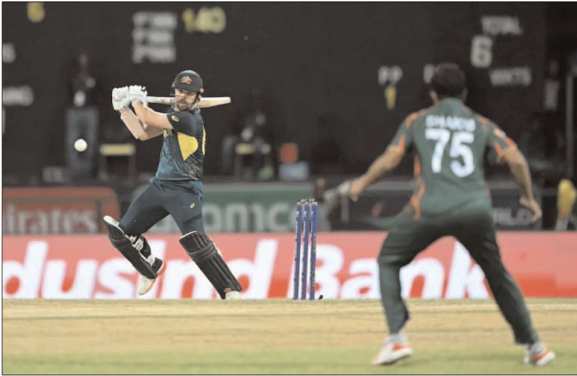
Travis Head got off to a sedate start against Bangladesh in T20 World Cup game.

Australia, who are bidding to complete a historic treble of World Test Championship, ODI World Cup and T20 World Cup titles, were awarded the victory under the Duckworth-