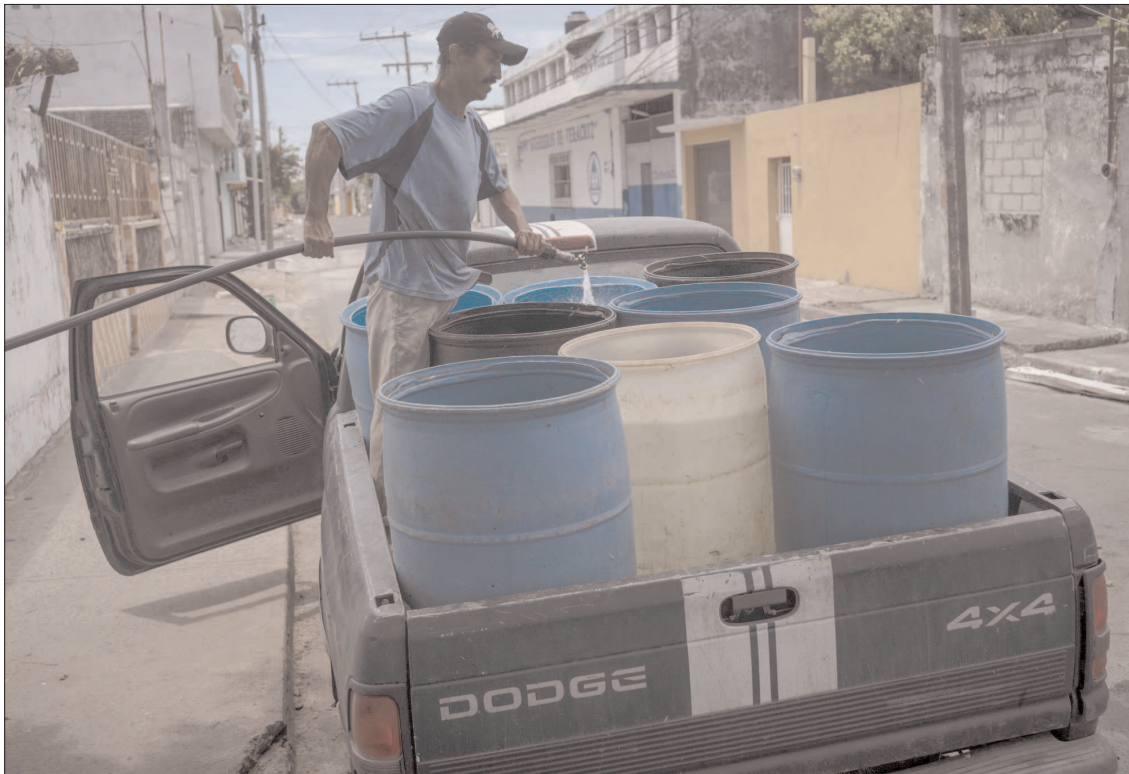
MEXICO CITY: A man fills containers with water due to shortages caused by high temperatures and drought in Veracruz.

The pier has been temporarily removed several times from Gaza's coast. At one point rough seas damaged the pier, forcing repairs. The US military estimates the pier will cost more than $200 million for the first 90 days and involve about 1,000 service members. Ryder said the Pentagon had not yet established an end date for the pier, but officials have said it is likely to be a sustainable option only until August or September because the sea state in the region usually worsens after that.