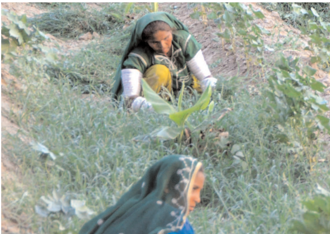
HYDERABAD: Farmer women working in the field.

This partnership marks a significant step towards mutual growth and the enhancement of corporate and educational frame-