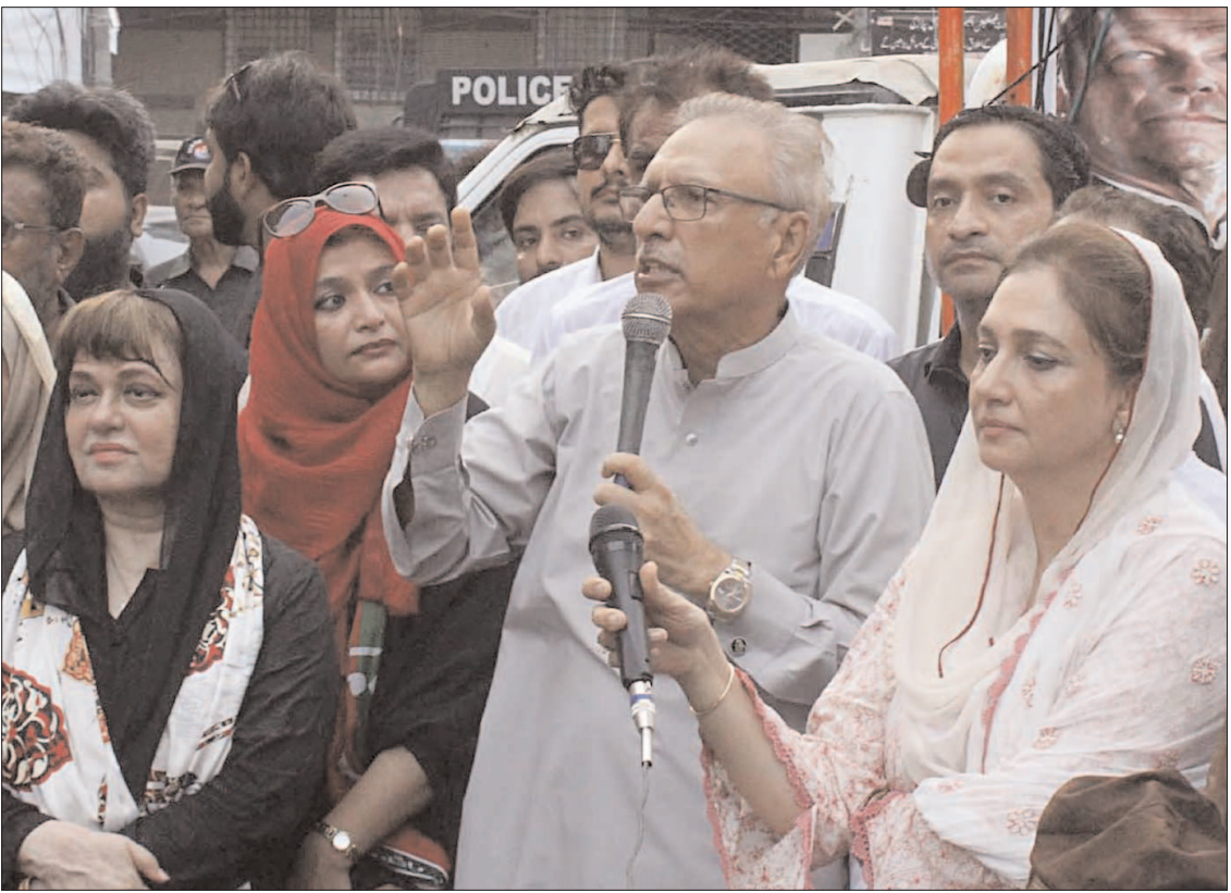
KARACHI: Former President and PTI leader Dr Arif Alvi addressing to protestors outside KPC.