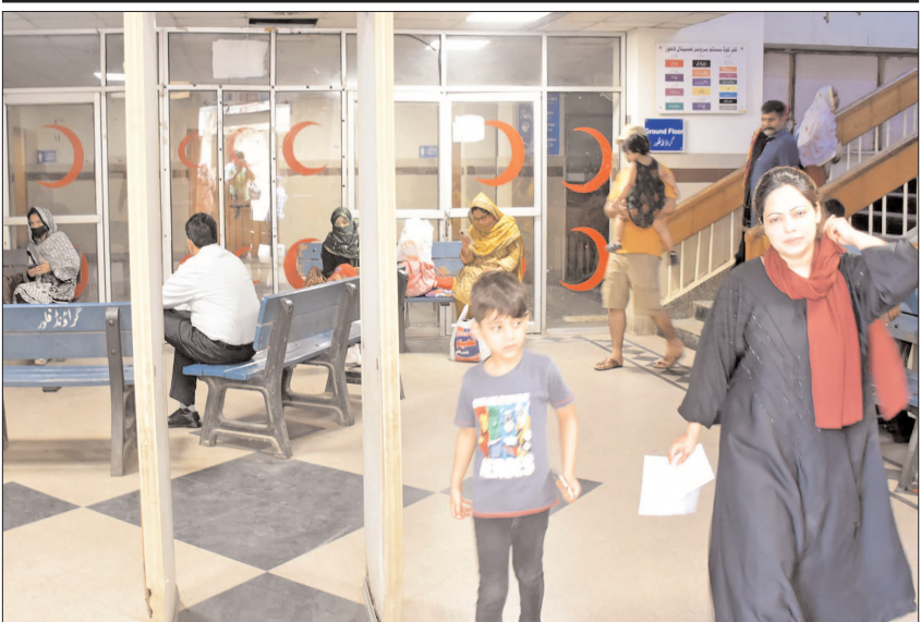
LAHORE: People suffering during closed OPD at Services Hospital, due to young doctor's strike.

Trump said this should include "anybody who graduates from a college", including those who complete two-year programs, known as junior colleges, and doctoral graduates. Asked initially on the podcast if he would promise to help import the "best and the brightest around the world to America", Trump replied: "I do promise." He added: "I know of stories where people graduated from a top college, or from a college, and they desperately want to stay here... and they can't."