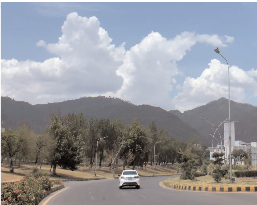
ISLAMABAD: A view of clouds hovering on the sky of Capital city.

Sagarpur, Sagarpur, Hasal, Danda Shah Bilawal, Dhok Ghazan, GPO Chowk, Malkwal, Akwal, Bilalabad, Multan Khard, CS Shah Feeders, GSO Circle, from 08:00 AM to 12:00 Noon, Dhirkot, Chamankot, Dana Express, Dhalla, Manhasa, Suhawa, Nimble, Birut, Gujjar Kohala Feeders, from 06:00 AM to 09:00 AM, Kalal, Shah Pur, Adiala, Khasala, Humayun-I, Dhok Noor, Gulshanabad, Rose Line, Adiala Jail, Shahigan, Defense Road, Askari-14, PGHS Feeders, On Sunday from 07:00 AM to 12:00 PM, GSO Circle, Gulbarg, 8, 5, 9 & 7, Residency-17, RIU, OPF Feeders, from 06:00 AM to 08:00 AM, Shams Colony, Azharabad, CWO, Golar, Charing Cross, Westridge Feeders, from 08:00 AM to 10:00 AM, Jhangi, Peshawar Road, P&T, EME, Quaid-e-Azam, Sehama, Rajahabad Feeders, from 06:00 AM to 11:00 AM, City No. 1, OPF, AS Mill, PS Mill, City Industrial, HPT Mirpur, City 3 feeders and surroundings.