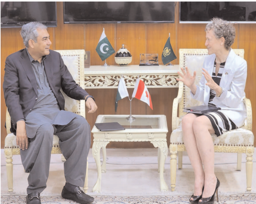
ISLAMABAD: Federal Minister for Interior Mohsin Naqvi presenting souvenir to Canadian High Commissioner Leslie Scanlon.

The Council urged the government and all state institutions, particularly the police and judiciary, to handle such cases decisively and without any compromise, vested interests, or fear.