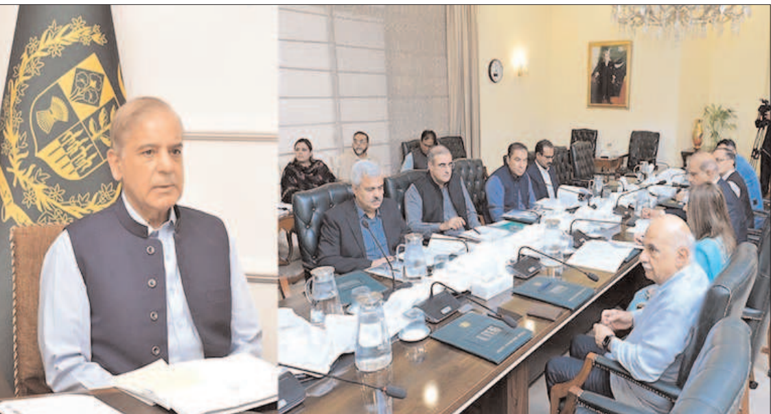
LAHORE: Prime Minister Muhammad Shehbaz Sharif chairs a meeting regarding law & order and security projects.

Russia and the United States are by far the world's biggest nuclear powers, holding about 88% of the world's nuclear weapons, according to the Federation of American Scientists, opens new tab. Both are modernising their nuclear arsenals while China is rapidly boosting its nuclear arsenal. Putin said this month that Russia had no need to use nuclear weapons to secure victory in Ukraine, the Kremlin's strongest signal to date that Europe's deadliest conflict since World War Two will not escalate into nuclear war.