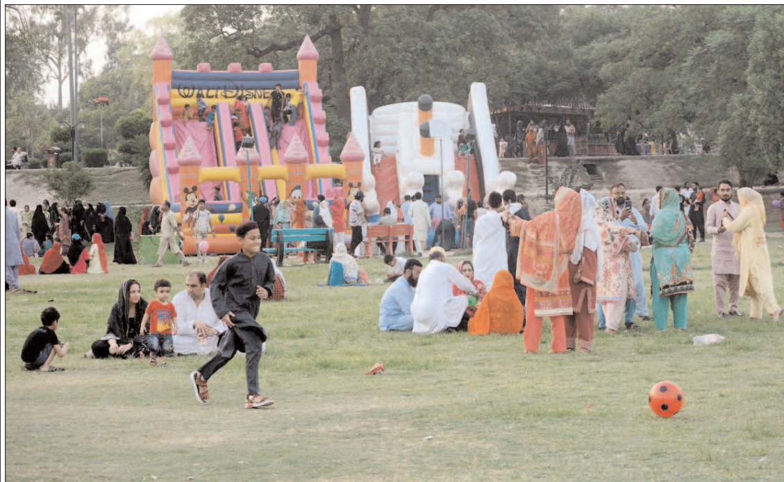
LAHORE: A large number of people visiting Gulshan e Iqbal Park to spend their holiday in Provincial Capital.

"Visitors can expect to embark on educational journeys through themed gardens, each representing distinct ecosystems from around the globe," the DG said and emphasised that the initiative underscores Punjab government's commitment to environmental stewardship and sustainable tourism development.