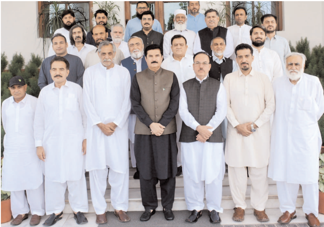
PESHAWAR: Khyber Pakhtunkhwa Governor Faisal Karim Kundi in a group photo with delegation of Peoples Doctors Forum at Governor's House.