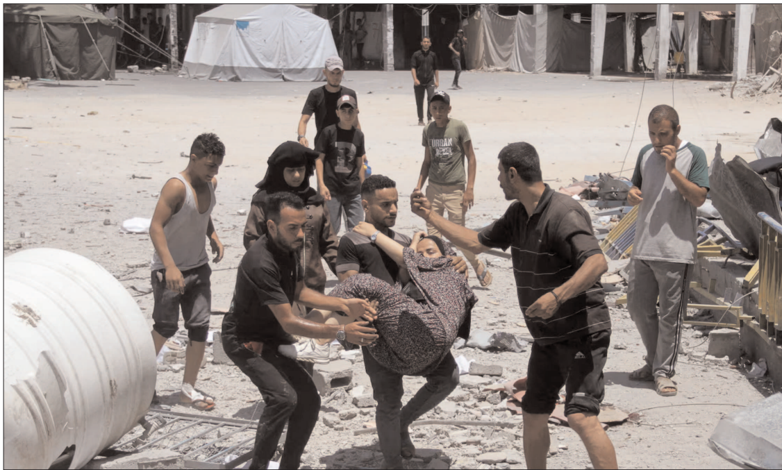
GAZA: People carrying an injured girl after Eight Palestinians were killed on Sunday in an Israeli airstrike on a training college near Gaza City.

Nasrallah's speech in which he says "if war is imposed on Lebanon, the resistance will fight without restrictions or rules." Days earlier, it had circulated a nine-minute video showing aerial footage purportedly taken by the movement over northern Israel, including what it said were sensitive military, defense and energy facilities and infrastructure in the city and port of Haifa. The cross-border violence has killed at least 480 people in Lebanon, most of them fighters but also 93 civilians, according to an AFP tally. Israeli authorities say at least 15 soldiers and 11 civilians have been killed in the country's north.