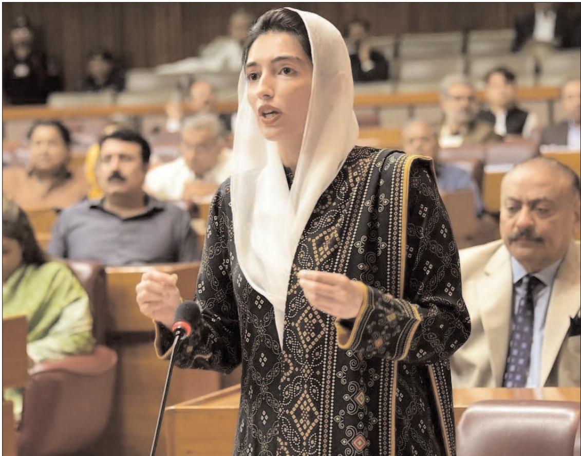
ISLAMABAD: PPP leader MNA Bibi Aseefa Bhutto Zardari, daughter of Shaheed Benazir Bhutto and President Asif Ali Zardari addressing in NA session on Sunday.