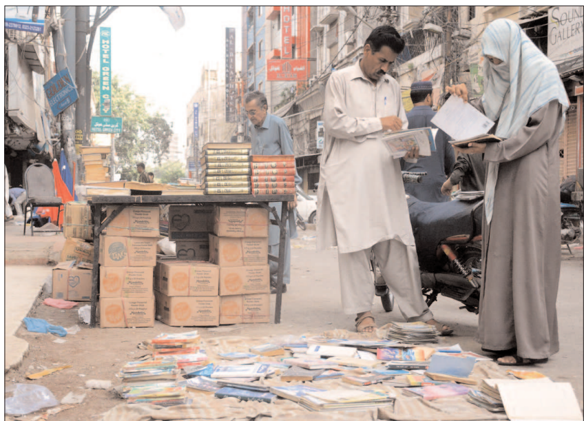
KARACHI: People selecting used books at Reagal Chowk.

Aftab ur Rehman Rana also proposed that provincial governments implement robust waste management systems at tourist sites and enforce strict anti-littering measures, including fines, to curb environmental degradation caused by tourism activities.