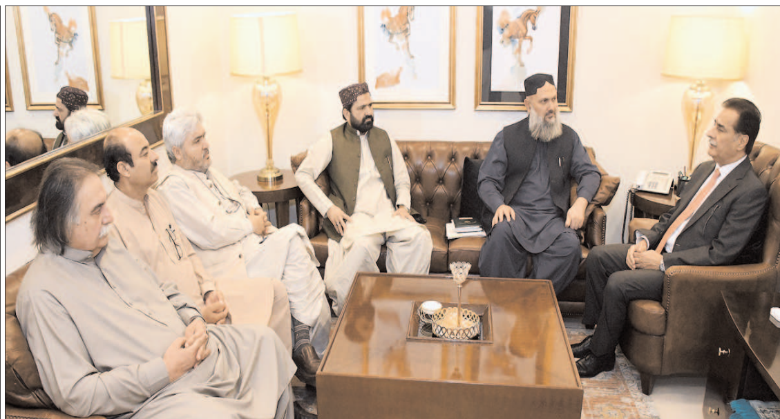
ISLAMABAD: Delegation of Member National Assembly belonging to Balochistan led by Federal Minister for Commerce Jam Kamal Khan in a meeting with Speaker National Assembly Sardar Ayaz Sadiq at Parliament House.

The commissioner ordered the authorities of all the government departments to fully cooperate with the Rescue-1122 personnel and WASA in the pre-monsoon measures. The health department should finalize all the arrangements to ensure the provision of adequate medical facilities to the citizens in case of any untoward situation, he instructed.