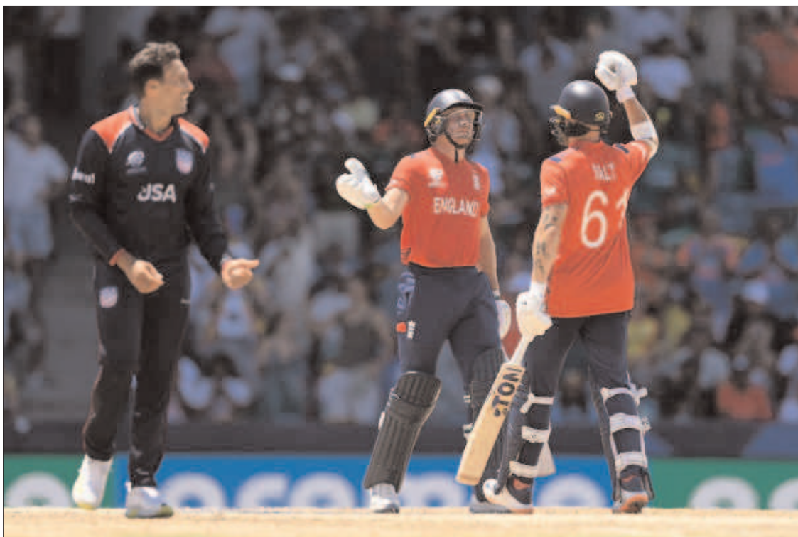
BRIDGETOWN: Jos Buttler and Phil Salt of England after winning the ICC Men's T20 Cricket World Cup West Indies & USA 2024 Super Eight match between USA and England.

Buttler's side came into this game needing to win and boost their net run-rate to ensure another nervy night awaiting the outcome of West Indies's meeting with South Africa was not needed. In truth such a victory was never in doubt.