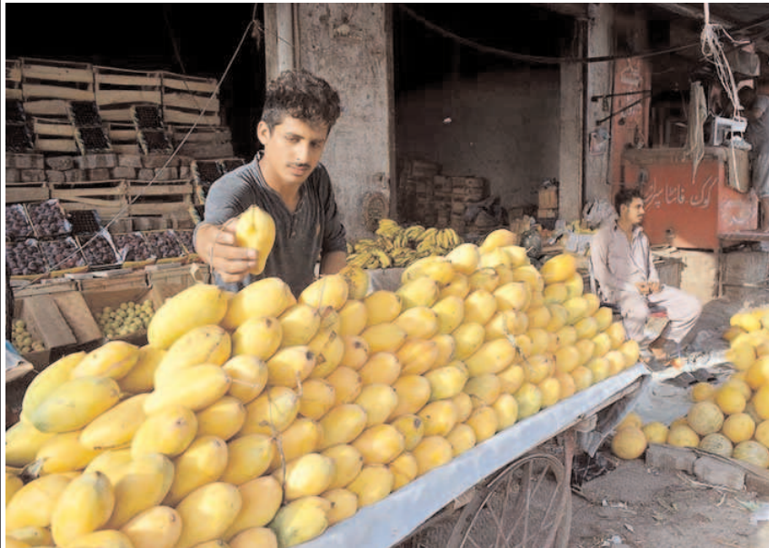
SIALKOT: A vendor displaying and selling Mango at his roadside setup.

DC directed the officers of health department Municipal Committees and other departments to continue inspections and survey of public parks, graveyards and public places so that dengue larva could not be breed beside all departments be ensure cleanliness of offices and surroundings and also continue awareness campaign.