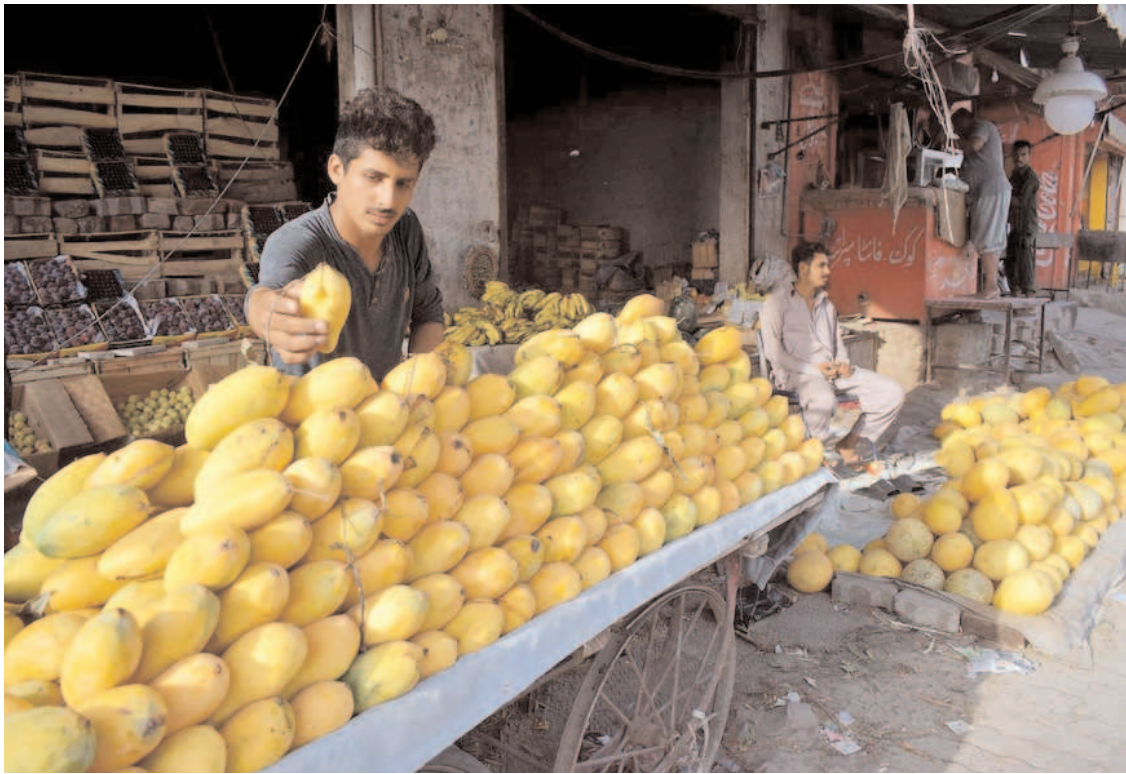
SIALKOT: A vendor displaying and selling Mango at his roadside setup.

He said that coordination between the government and the private sector was vital for economic growth, proposing the government to develop policies that could provide environment conducive to business in the country.