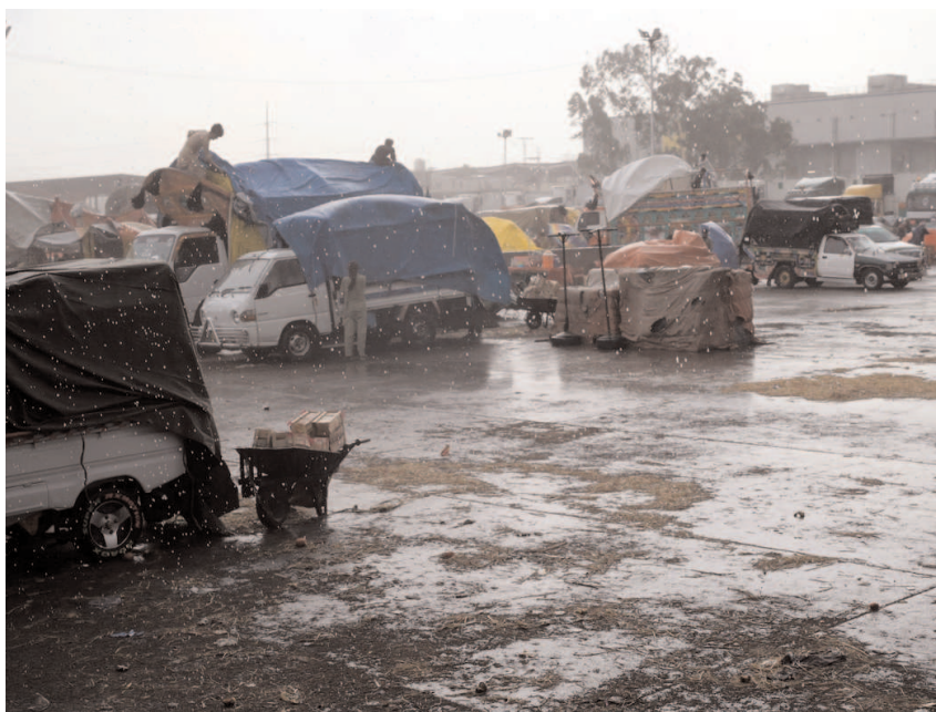
ISLAMABAD: A view of rain in the Federal Capital.

Meanwhile, PM's aide Romina Khurshid Alam urged businesses and industries to adopt sustainable practices and reduce plastic usage in their operations as a part of the corporate social responsibility and to support the government's efforts to make the country plastics free.