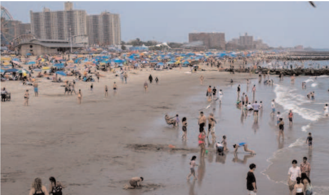
NEW YORK: People visit the beach at Coney Island on a sweltering afternoon on the first weekend of summer in the Brooklyn borough of New York City.

64%, which would be much higher than the 47.5% seen at the last general election in June 2022. The RN's lead in polls ahead of the election that will take place in two rounds, on June 30 and July 7, is unlikely to win the party an absolute majority. Macron called the ballot after his alliance's crushing defeat at EU elections earlier this month. In a separate Ipsos survey, published by the Financial Times, the National Rally is seen as the most trustworthy when it comes to managing the economy and public finances. According to the survey, 25% of respondents trust Marine Le Pen's RN the most to take the right decisions on economic issues, versus 22% for the New Popular Front and 20% for Macron's alliance.