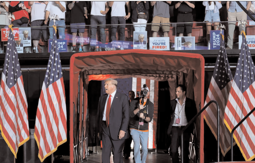
PHILADELPHIA: Former US President Donald Trump arriving to address his voters.

LAHORE (APP): Punjab Chief Minister Maryam Nawaz Sharif has said that the government and civil society have to work together to empower widows. In her message on International Widows Day, the CM said it is difficult to raise children without the shadow of a father. It is a day to understand difficulties of women who are raising their children alone after the death of their husbands. The CM said the discriminatory social attitude towards widows is unfortunate, adding that Islam for the first time gave social status and respect to widows. "I pay tribute to the widows who are raising their children by working hard." "Thanks Allah Almighty, For the first time in Punjab, widows and destitute women got the blessing of Hajj," she said.