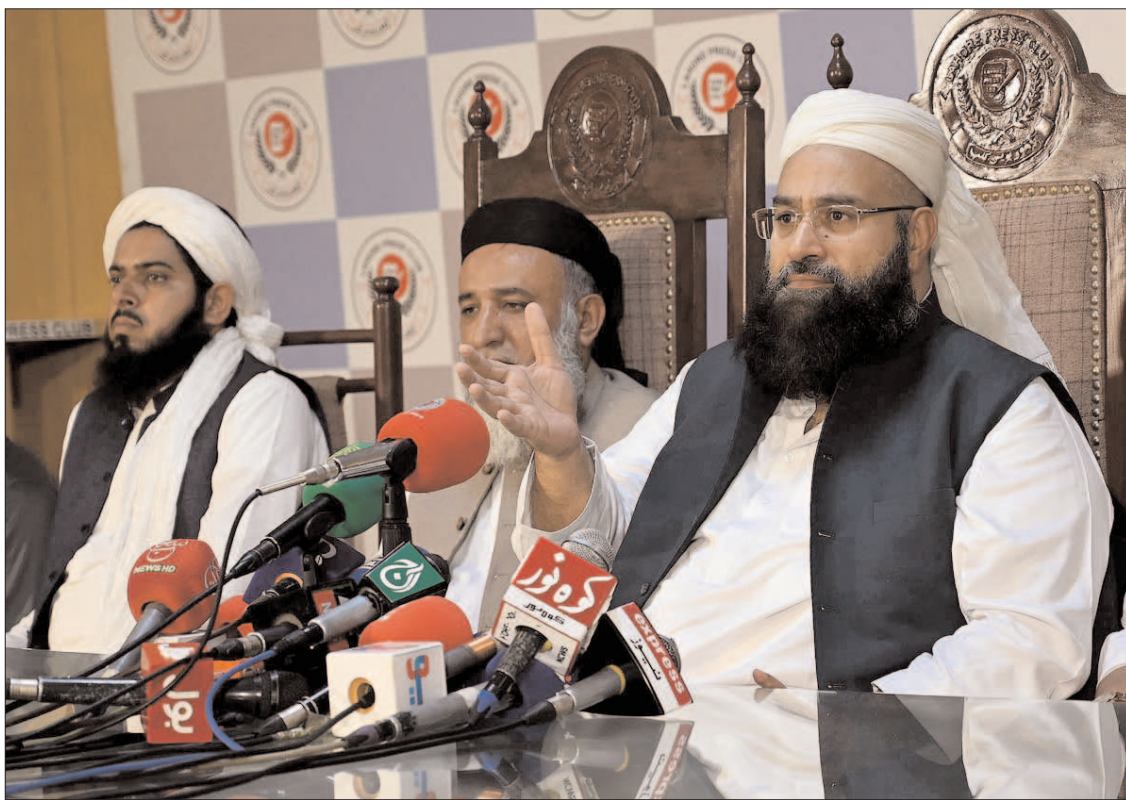
LAHORE: Chairman Pakistan Ulema Council, Allama Tahir Ashrafi is addressing a press conference at the Press Club.

Regarding complaints from pilgrims, Pakistani officials are present in Saudi Arabia to address them. Ashrafi assured that any grievances would be resolved and that the facts about the challenges faced in the government system would soon be made public.