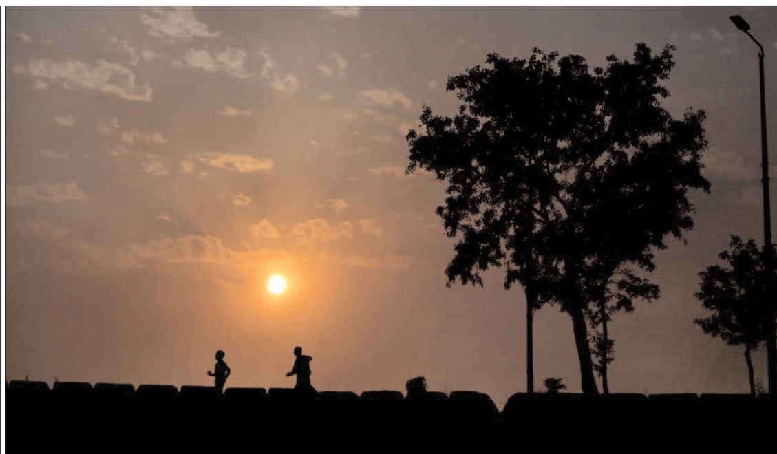
ISLAMABAD: A beautiful view of sunset in the Federal Capital.

Muhammad Ali also directed the immediate activation of all emergency response centers in Islamabad and the issued the helpline numbers for citizens in case of emergencies.