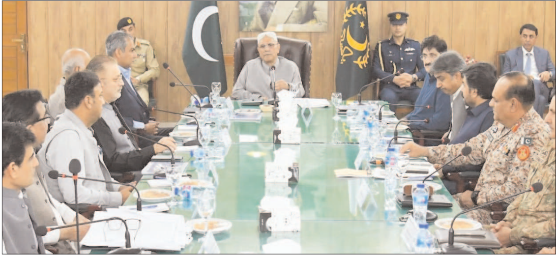
SUKKUR: President Asif Ali Zardari chairing a meeting on security, law and order situation in Sindh.