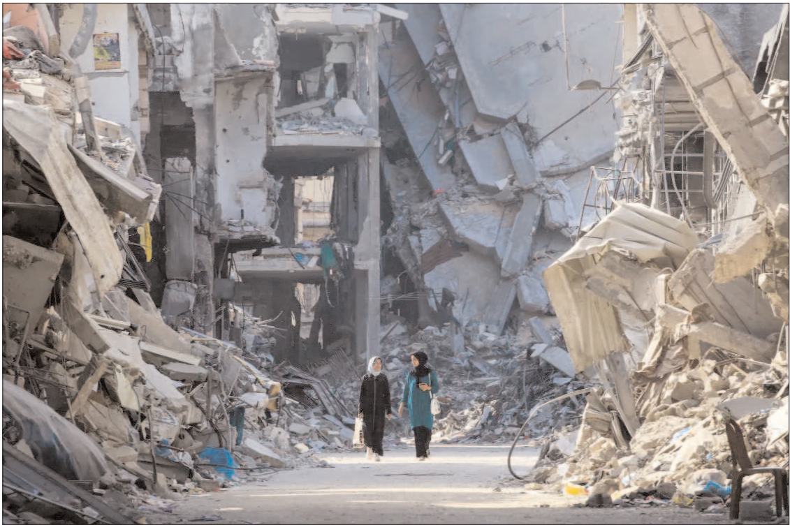
GAZA: Palestinian women make their way past destroyed buildings in Khan Younis.