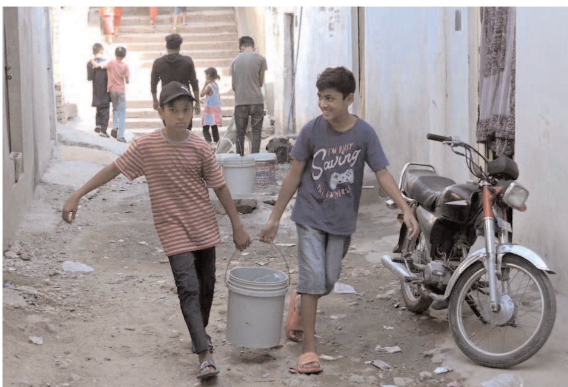
ISLAMABAD: Youngsters taking water buckets for home use at G 7 in the Federal Capital.

Local departments are urged to sensitize residents living along riverbanks and associated nullahs about the expected increase in water flows, and to facilitate timely evacuation of at-risk populations from low-lying and flood-prone areas as per evacuation plans. Additionally, citizens are advised to take extreme precautionary measures, such as staying away from electric poles and weak infrastructure, and refraining from driving or walking in waterways.