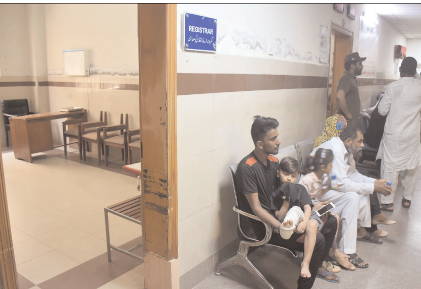
LAHORE: Patient waiting for doctors as young doctors strike continue for the last 9 days in Punjab hospitals.

The accused were produced in the court under high security and after getting physical remand, they were shifted to an undisclosed location for further investigation. Action is on to arrest 2500 other suspects including 39 nominated accused in the FIR and 5 more suspects have been taken into custody and the investigation is ongoing.