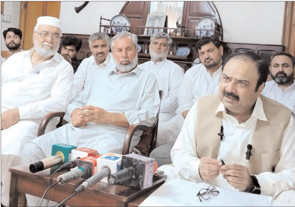
CHARSADDA: QWP leader, Sikandar Hayat Khan Sherpao addressing a press conference.

DERA BUGTI (INP): A group of armed villagers in Balochistan's Dera Bugti killed a rare leopard after finding the animal in the vicinity of Sui. As per details, the villagers after spotting the leopard chased it and killed it in its den. After killing the predator, the villagers dragged its body from the den and filmed it. The villagers said they killed the predator because it was attacking their goats. The district administration has so far not taken any action regarding the killing of the endangered species, but people on social media have expressed sorrow over the villagers' act of killing the rare animal. Back in April, a Persian leopard was found at the Nani Mandir, located in Hinglaj, a town in the Lasbela district of Balochistan province. The predator was located by a pilgrim visiting the temple inside the Hingol National Park along the Balochistan coast.