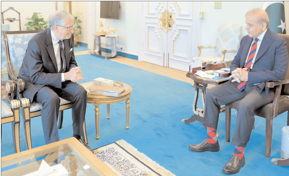
ISLAMABAD: Chairman Gates Foundation, Mr. Bill Gates called on Prime Minister Shehbaz Sharif.