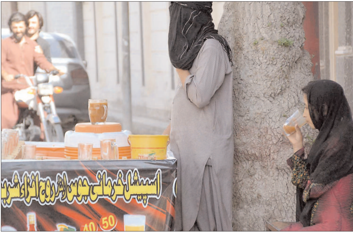
QUETTA: A girl drinking apricot juice from a roadside vendor during hot weather.