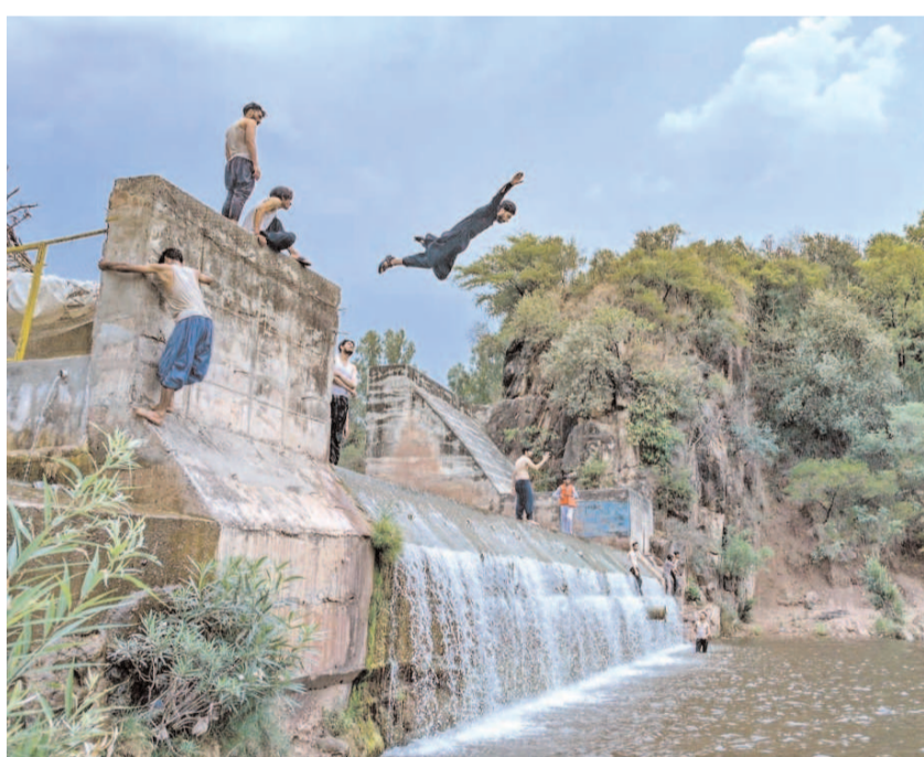
ISLAMABAD: A youngster jumping into a stream of water to cool himself off at Angoori during a hot weather as temperatures soared 42°C in federal capital.

We urge all citizens to actively participate in this campaign. Sharing these animations on social media and within personal networks can help disseminate the message and foster collective action against child labour and abuse while promoting education. If you witness or instances or any other forms of exploitation, please report them immediately at 1099 or 1121 as your prompt action can save a life.