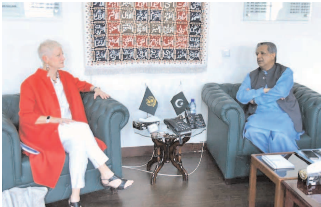
ISLAMABAD: H.E. Dr. Riina Kionka, Ambassador of the European Union (EU) to Pakistan called on the Federal Minister for Law and Justice and Human Rights Senator Azam Nazeer Tarar.

These strategic pillars serve as the foundation of our endeavors to counter the spread of narcotics and controlled substances within our nation's borders, he maintained.