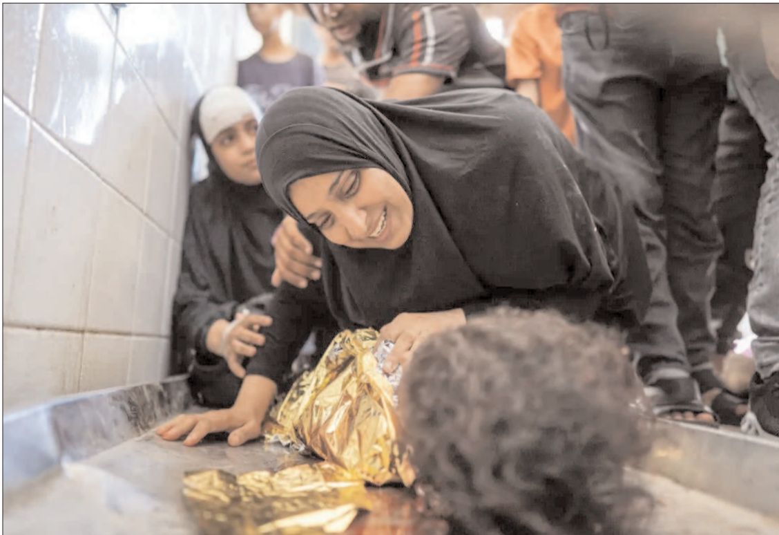
GAZA STRIP: A woman bids farewell to her child, who was killed in an overnight Israeli bombardment in Maghazi, at the morgue of the Al-Aqsa Martyrs Hospital in Deir el-Balah.