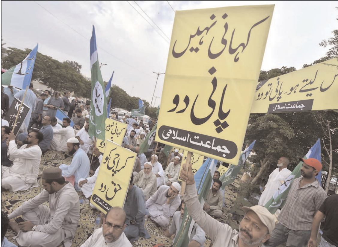
KARACHI: Activists of Jamat-e-Islmi holding placards during a protest for acceptance of their demands.