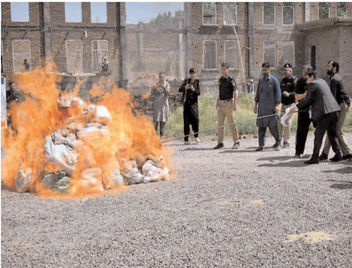
PESHAWAR: Excise and Narcotics Department set on fire contraband items worth 290 million rupees on World Narcotics Day near Motorway toll Plaza.