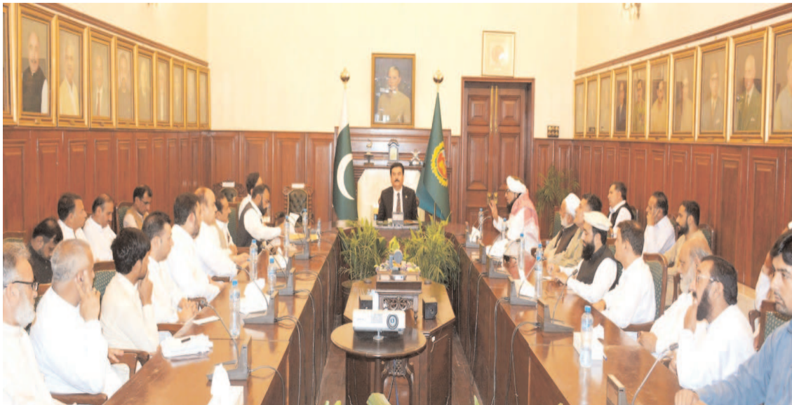
PESHAWAR: Khyber Pakhtunkhwa Governor Faisal Karim Kundi presiding over a meeting of Frontier Mines Association.