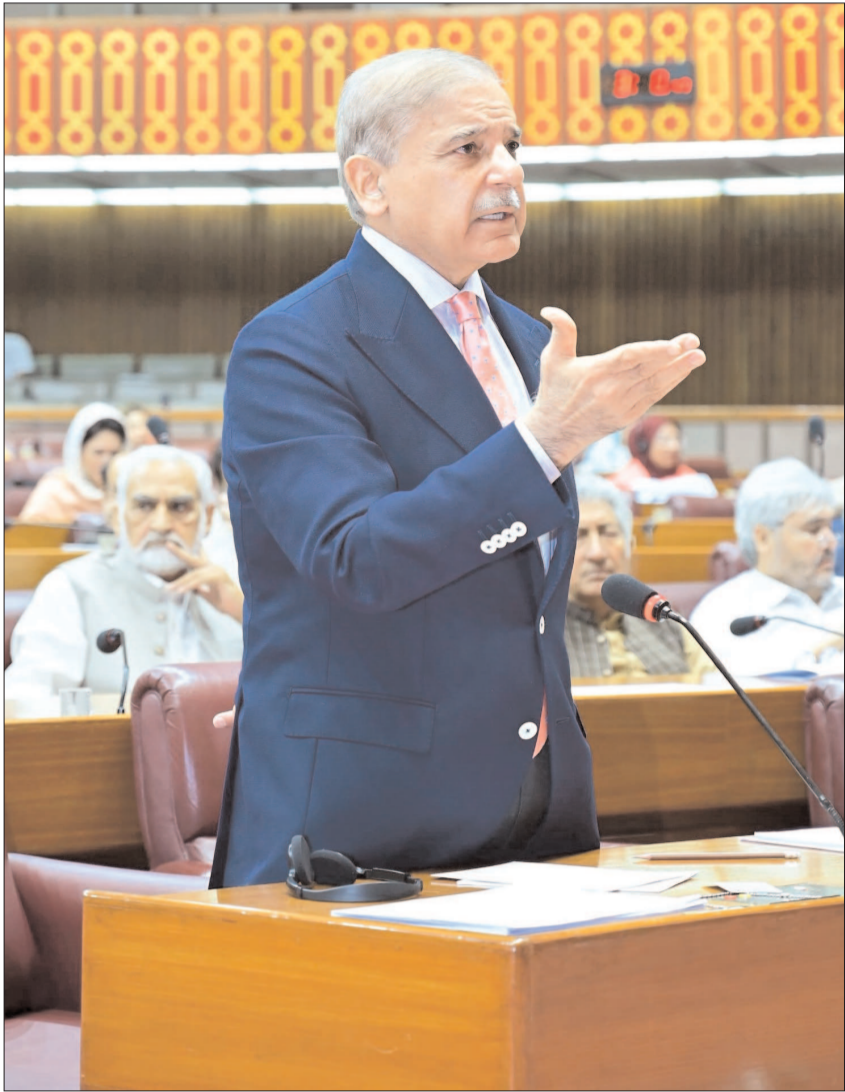
ISLAMABAD: Prime Minister Shehbaz Sharif addressing budget session of National Assembly.