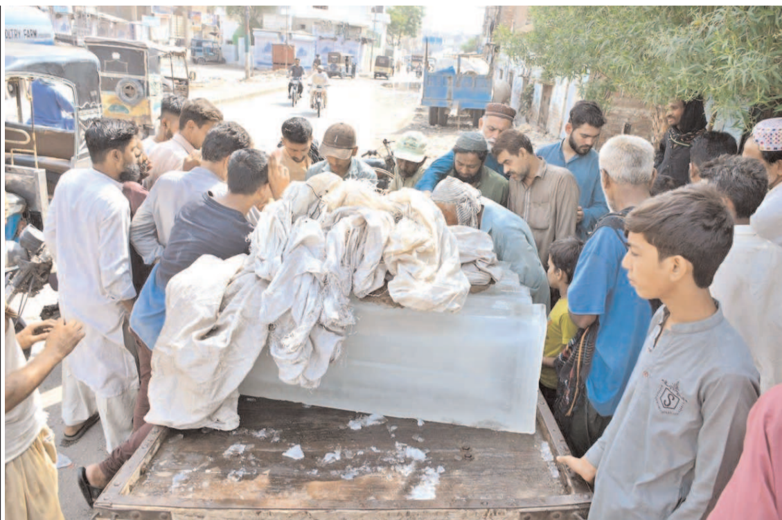
HYDERABAD: People crowded around ice vendors to purchase ice.

Salahuddin Hanif, Secretary General PCJCCI, also urged efforts to accelerate the establishment of a national computing network and data circulation infrastructure and said that digital technologies are finding a wide range of applications across various industries in Pakistan.