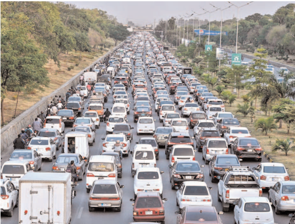
ISLAMABAD: A view of a massive traffic jam clogs the Islamabad Expressway, with a seemingly endless queues of cars, buses, and motorcycles stretching as far as the eye can see.