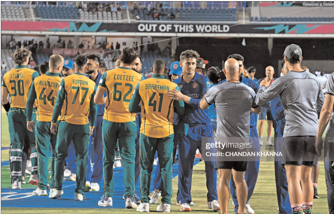
TAROUBA: South Africa's players greet Afghanistan's players after South Africa's victory in the ICC men's Twenty20 World Cup 2024 semi-final cricket match between South Africa and Afghanistan.

E A S T B O U R N E (AFP): French Open finalist Jasmine Paolini ended home hope Katie Boulter's fine run on grass at Eastbourne on Thursday, winning their quarter-final 6-1, 7-6 (7/0). The Italian third seed broke twice as she dominated the first set but the second set was more even as the players swapped breaks. However, Paolini, who lost to Iga Swiatek at Roland Garros earlier this month, stepped up a gear in the tie-break, winning the first seven points to seal victory. "Today, I played a really good match," Paolini, 28, said in her on-court interview. "She's a really good player on grass, of course she's British, so it's tough to beat her here, especially. I'm happy, I'm enjoying the grass here in Eastbourne." Boulter, ranked 32nd in the world, came to Eastbourne in good form after retaining her Nottingham Open crown earlier this month.