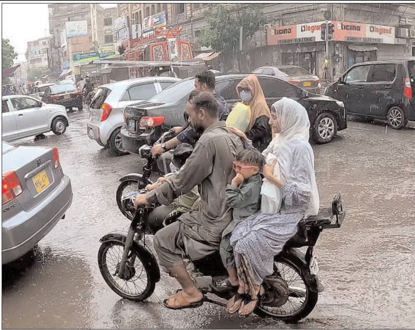
KARACHI: A view of light rain in the Port City after hot days.

Famine can be declared if at least 20 percent of the population in an area are suffering extreme food shortages, with at least 30 percent of children acutely malnourished and two people out of every 10,000 dying daily from starvation or malnutrition and disease. Since the IPC warning system was created 20 years ago, famines have only been declared twice — in parts of Somalia in 2011 and in parts of South Sudan in 2017.