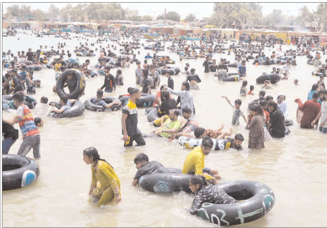
THATTA: A view of large number of people suffering from hot days visits Keenjhar Lake to take some sign of relief.