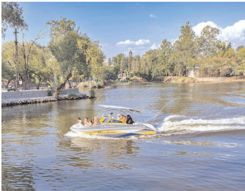
RAWALPINDI: People enjoying a ride on boat in water pond at Ayub National Park.

Dr Sajjad, DCP and Focal Person Dengue Prevention and Control in a brief interaction with APP said that continued surveillance for dengue control was underway to maximize awareness dengue issue among the masses. He informed that all DDHOs and filed teams have been actively engaged in surveillance and creating general public awareness.