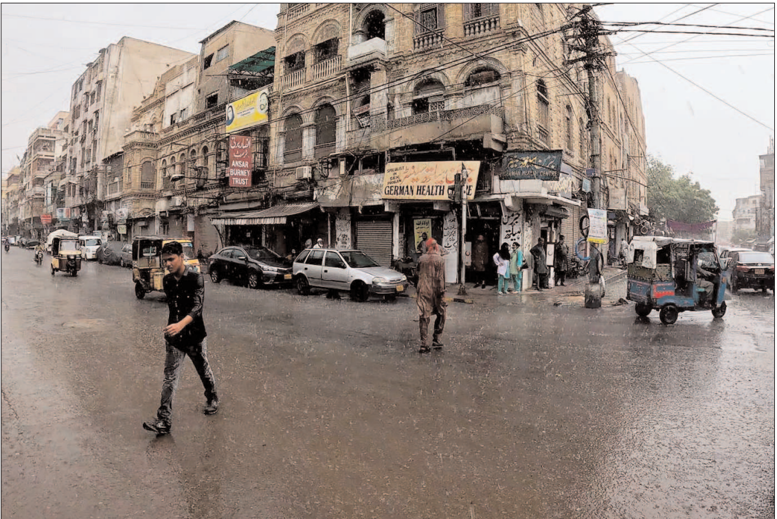
KARACHI A view of light rain in Provincial Capital after hot days.

LAHORE (APP): On the direction of Deputy Commissioner Lahore Rafia Haider, the district government launched a crackdown to implement new prices of roti and naan and imposed heavy fines on violators. The teams on Thursday got arrested 13 persons (Naanbais) over violating official order. The teams, according to an official spokesperson, inspected 3,699 roti/naan points (tandoors) in the city, six cases were registered, besides imposing more than Rs 800,000 fine on violators. The teams inspected 174 points in various areas of the city and imposed Rs 500,000 fine over violations of not listing the official price of roti/naan. The teams also checked 806 roti/naan shops, registered a case, and imposed a Rs 200,000 fine on 44 violators. On the other hand, the DC made a surprise visit to fruit and vegetable markets and checked the prices as well. The DC ordered the ACs to monitor the prices of basic commodities in tehsil as well as the district.