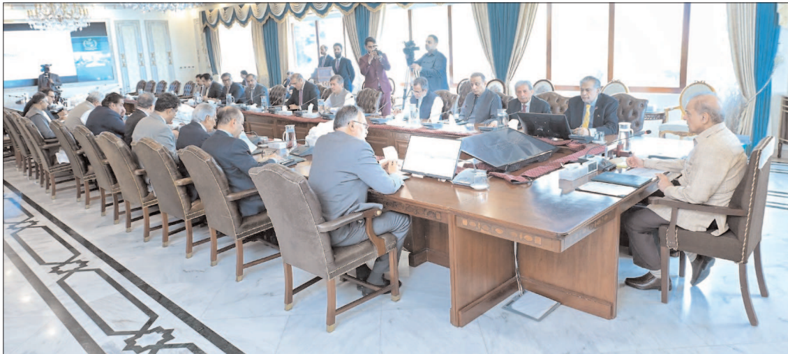
ISLAMABAD: Prime Minister Shehbaz Sharif chairing a meeting regarding promotion of Pakistan-Azerbaijan economic ties.