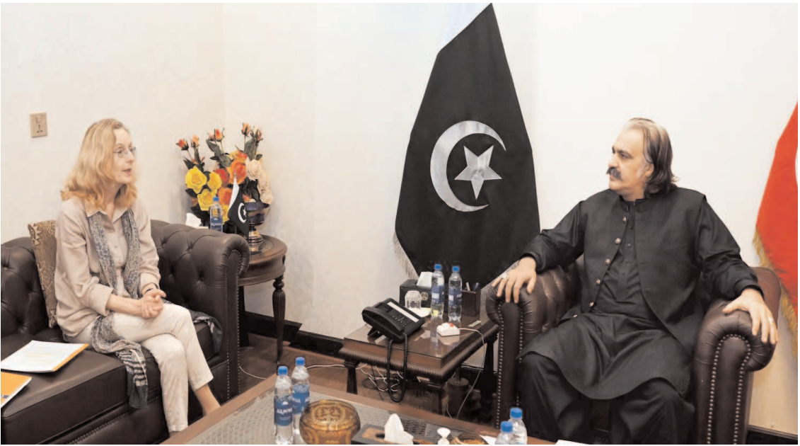
PESHAWAR: Khyber Pakhtunkhwa Chief Minister Sardar Ali Amin Khan Gandapur talking to Ambassador of the Netherlands to Pakistan Henny Fokel de Vries.

along with the Deputy Commissioners and District Police Officers, participated in the meeting through video link. During the meeting Instructions were issued to PESCO and TESCO authorities to take steps to ensure an uninterrupted power supply on the 9th and 10th of Muharram. Instructions were also issued to all the district officers to stay in the districts during Muharram and keep a close watch on all matters. While proper instructions were given to take solid steps against hateful content on social media. On this occasion, IG Police Khyber Pakhtunkhwa told the meeting that the availability of security forces will be ensured in all districts as per requirement and strict security arrangements will be made in sensitive districts regarding Muharram.