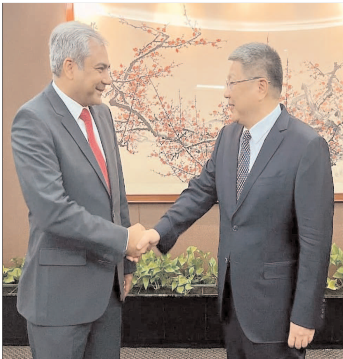
NEW YORK: Federal Minister for Interior, Mohsin Naqvi shaking hands with his counterpart from China, Qi Yanjun.

The court sent the matter of reserved seats to the Judges Committee to decide whether the case would be heard by the same bench or a larger bench would be constituted. The court also ordered the ECP to suspended victory notifications of 77 lawmakers [on reserved seats], causing the ruling coalition to lose its two-thirds majority in the National Assembly. In late May, a full court was constituted to hear the case.