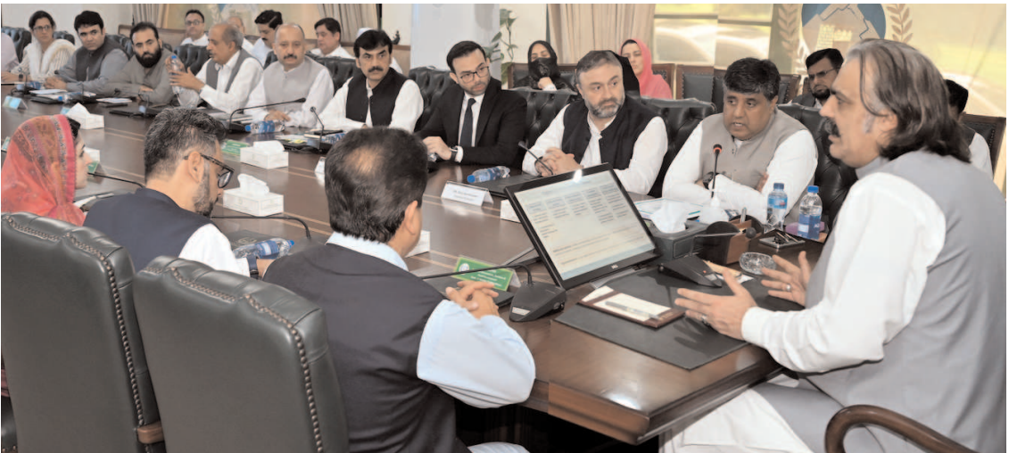
PESHAWAR: Chief Minister Khyber Pakhtunkhwa Sardar Ali Amin Khan Gandapur chairing a meeting with a delegation of World Bank.

Governor Khyber Pakhtunkhwa Faisal Karim Kundi on Saturday expressed deep sorrow over the outbreak of fire that engulfed shops and cabins in Peshawar’s Nauthia Bazar. The blaze resulted in significant financial losses for traders and shop owners, prompting Governor Kundi to sympathize with them. “The incident of the fire is extremely tragic,” said Faisal Karim Kundi. Governor Kundi emphasized the need for a thorough investigation into the incident. “The affected shopkeepers have suffered a considerable financial loss due to the fire,” highlighted Governor Faisal Karim Kundi. Governor Kundi assured that the provincial government would ensure financial assistance to the affected traders and shopkeepers. Governor expresses condolence over ambulance accident: The Governor Khyber Pakhtunkhwa Faisal Karim Kundi on Saturday expressed grief and sorrow over the Ambulance accident near DI Khan Motorway Hakla Interchange. In a condolence message, the Governor Faisal Karim Kundi expressed regret over the death of five persons in the accident. He expressed heartfelt sympathy to the affected family and relatives. The Governor prayed for the departed soul of the deceased persons and the speedy recovery of the injured in the accident.