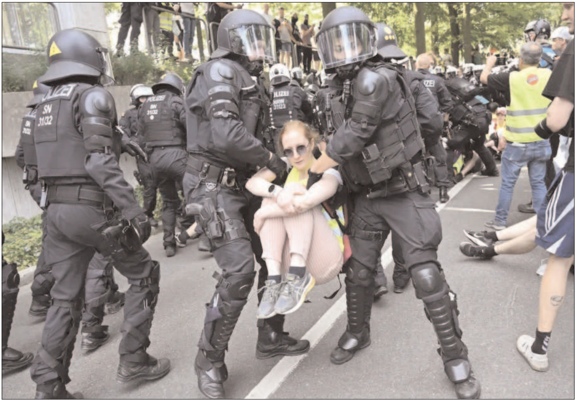
BERLIN: Police break up a sit-in blockade not far from the Grugahalle, in Essen, Germany.