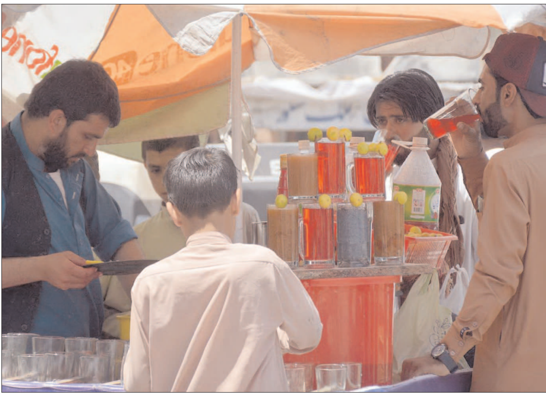
QUETTA: People drinking fresh juices from a roadside vendor.