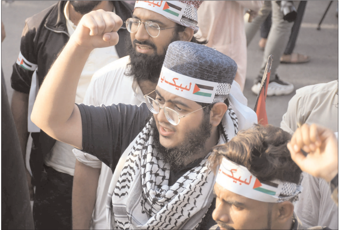
KARACHI: Activists of Jamaat-e-Islami holding a protest against Israeli airstrikes on Gaza