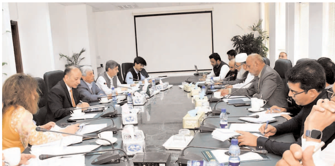
ISLAMABAD: The Federal Minister for Industries and Production Rana Tanveer Hussain chairing a review meeting on fertilizer industry.

He said that even though Pakistan's economic crisis is a recurring factor in the country's political unrest, it has a history of ignoring the nation's true issues, which include poor governance, a broken judicial system, outdated laws, complicated tax system, lack of transparency, duplication in the government system, ineffective bureaucracy, improper use of our human, natural and water resources, lack of efficient local government, inadequate/unreliable data for country's planning, and the consistent flaws in policies in execution by the government departments.