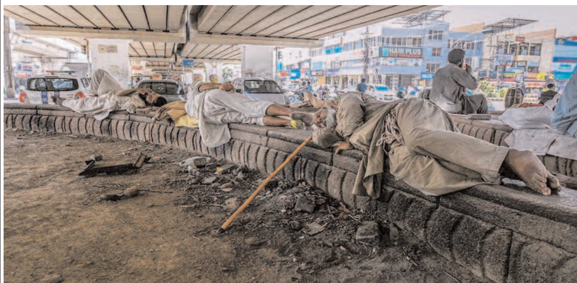
RAWALPINDI: People take a nap under a metro bridge in Chandni Chowk to escape the scorching heat.

The data center would be the first of its kind in Pakistan and is expected to significantly boost technological development in the country.