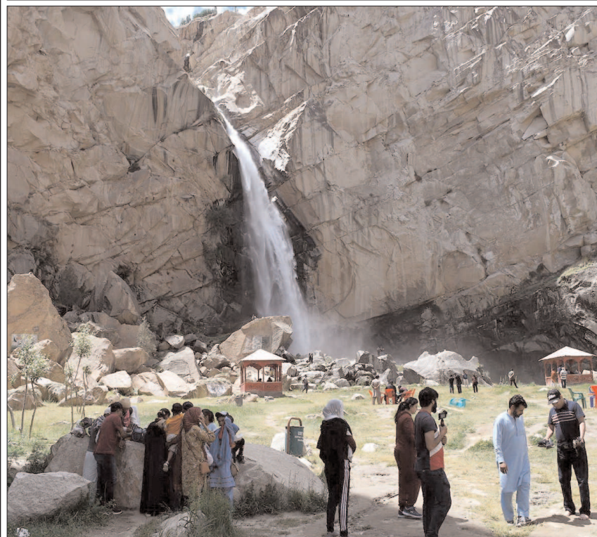
BALTISTAN: A view of beautiful Khamosh Water Fall at Kharmon.

He also criticized the Pakistan Peoples Party and the Pakistan Muslim League (Nawaz), accusing them of past massacres of Pashtuns. Additionally, he demanded that Khyber Pakhtunkhwa Governor Faisal Karim Kundi to withdraw his support for the operation.