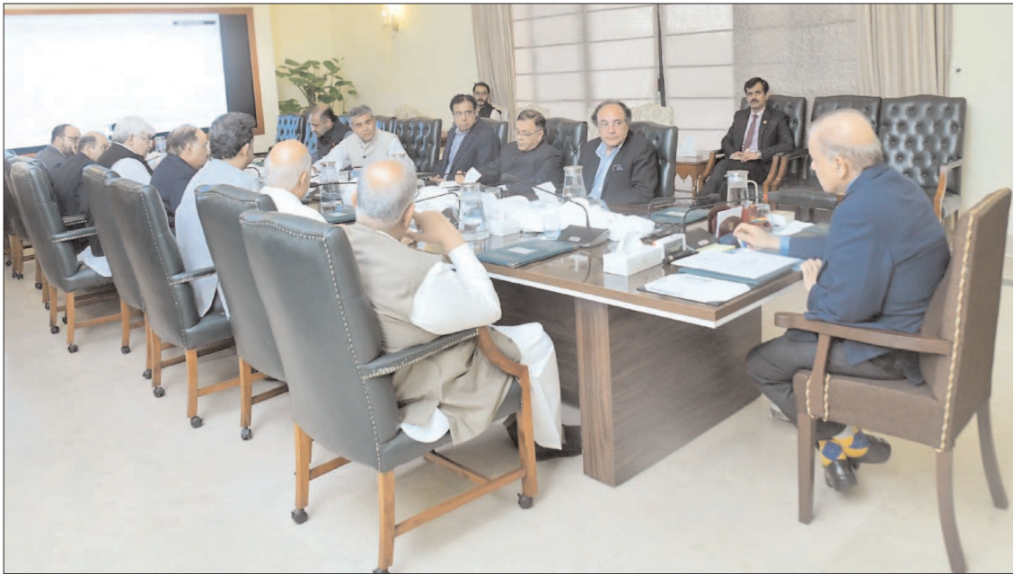
ISLAMABAD: Prime Minister Shehbaz Sharif chairing a meeting regarding winding up of PWD.

Vol. XXXIXI No. 156 Regd. No. 241 ZIL-HAJJ 23 1445 -- SUNDAY, JUNE 30 2024 PESHAWAR EDITION 12 PAGES PRICE. 30