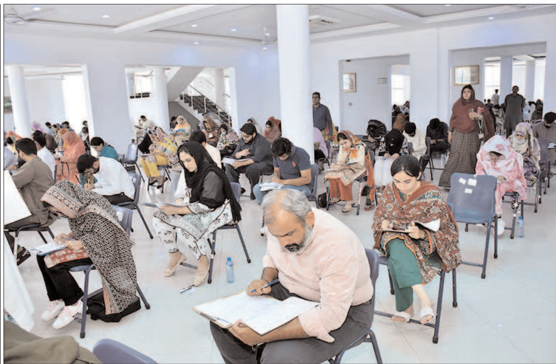
FAISALABAD: University of Agriculture Faisalabad conducted the first entrance test for the postgraduate admissions in which about 4000 students appeared.

Since 2012, JPMC has been the only centre in the world to offer free treatment of cancer with Cyberknife and Tomotherapy, regardless of nationality, religion, or ethnicity. Up to now, patients from 15 countries and 167 cities in Pakistan have benefited from this free service. Globally, these expensive treatments cost millions of rupees.