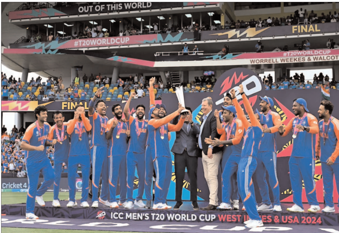
BRIDGETOWN: Rohit Sharma of India lifts the ICC Men's T20 Cricket World Cup Trophy following the ICC Men's T20 Cricket World Cup West Indies & USA 2024 Final match between South Africa and India at Kensington Oval.

Prior to Saturday's showpiece match at the Kensington Oval, he had managed just 75 runs in seven innings during the competition at a woeful average of 10.71 But after he was dismissed for just nine in a semi-final win over England, the defending champions, current India skipper Rohit Sharma said: "Virat is a quality player. 'Any player can go through that (a run of low scores). 'We understand his class. When you have played for 15 years, form is never a problem. He's probably saving it for the final.'"