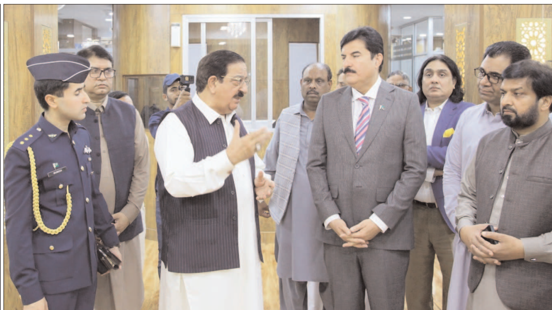
LAHORE: Nazim-e-Ala of Minhaj-ul-Quran giving briefing to Governor KP Faisal Karim Kundi at Farid Milat Research Institute.

tivity, educational linkages, and trade routes. The roundtable also highlighted the necessity of a comprehensive approach rather than reactive measures, advocating for strategies that 'compartmentalise' various aspects of the Pak-Afghan relationship to prevent escalation and ensure cooperation across multiple domains.