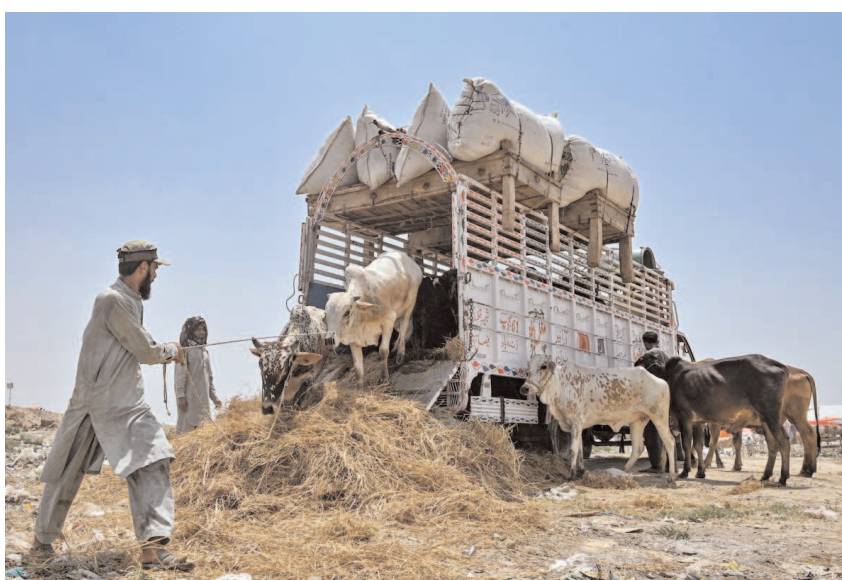
RAWALPINDI: Vendors busy in unloading sacrificial animals from a truck at Bhatta Chowk Animal Market for upcoming Eidul Azha.