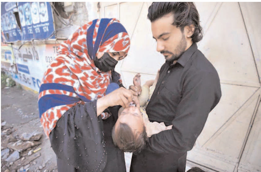
PESHAWAR: Lady Health Worker administering polio drops to a child during anti polio campaign in t Provincial Capital.

They also asked questions to cover various aspects and work directions of CTD. At the end of the session a group photo was arranged.