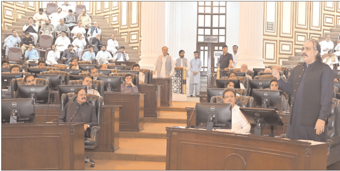
PESHAWAR: Chief Minister of Khyber Pakhtunkhwa, Ali Amin Gandapur addressing during provincial assembly session.