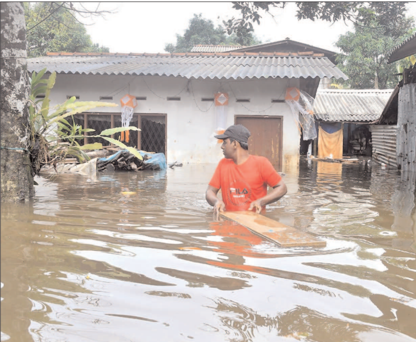
COLOMBO: A local busy to save his belonging during heavy floods in Sri Lanka.