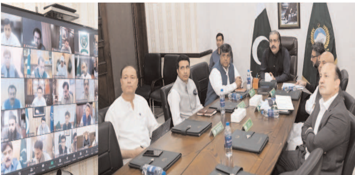
PESHAWAR: Khyber Pakhtunkhwa Chief Minister Sardar Ali Amin Khan Gandapur chairing a meeting of Division Commissioners and Deputy Commissioners via video link.