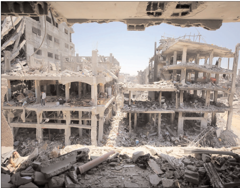
GAZA: Palestinians walking amid destroyed buildings as they return home to Jabalia following the withdrawal of Israeli forces.