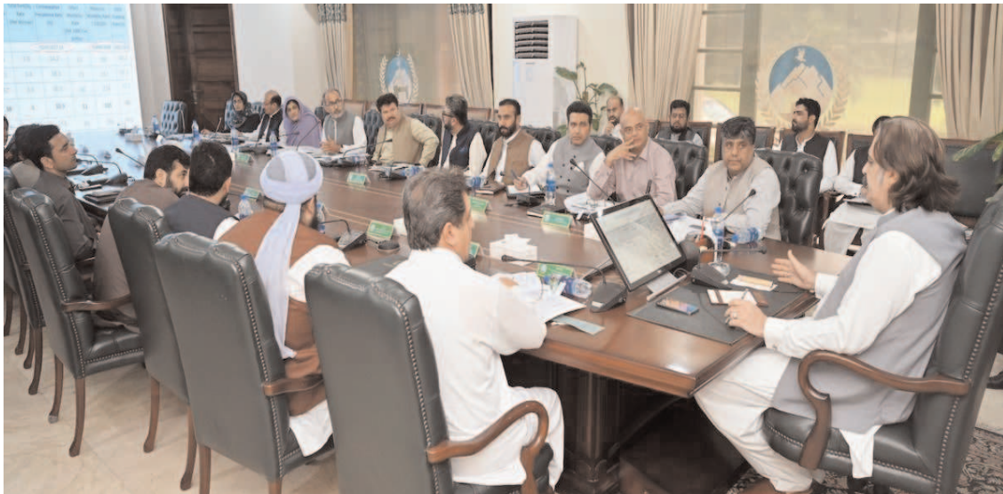
PESHAWAR: Khyber Pakhtunkhwa Chief Minister Sardar Ali Amin Khan Gandapur chairnig 4th meeting of Provincial Task Force on Population Welfare.

PESHAWAR (APP): The National Commission for Human Rights (NCHR) KP strongly condemned brutal attack on Nazir Masih, in Sargodha's Mujahid Colony. In a press statement issued here on Tuesday, NCHR says it is deeply disturbing that Masih succumbed to his injuries after being severely beaten by a violent mob. This heinous act of violence resulted in the loss of a precious life. Such targeted attacks based on religion or belief are a clear violation of human rights and must be met with swift and decisive action by the authorities, it demanded.