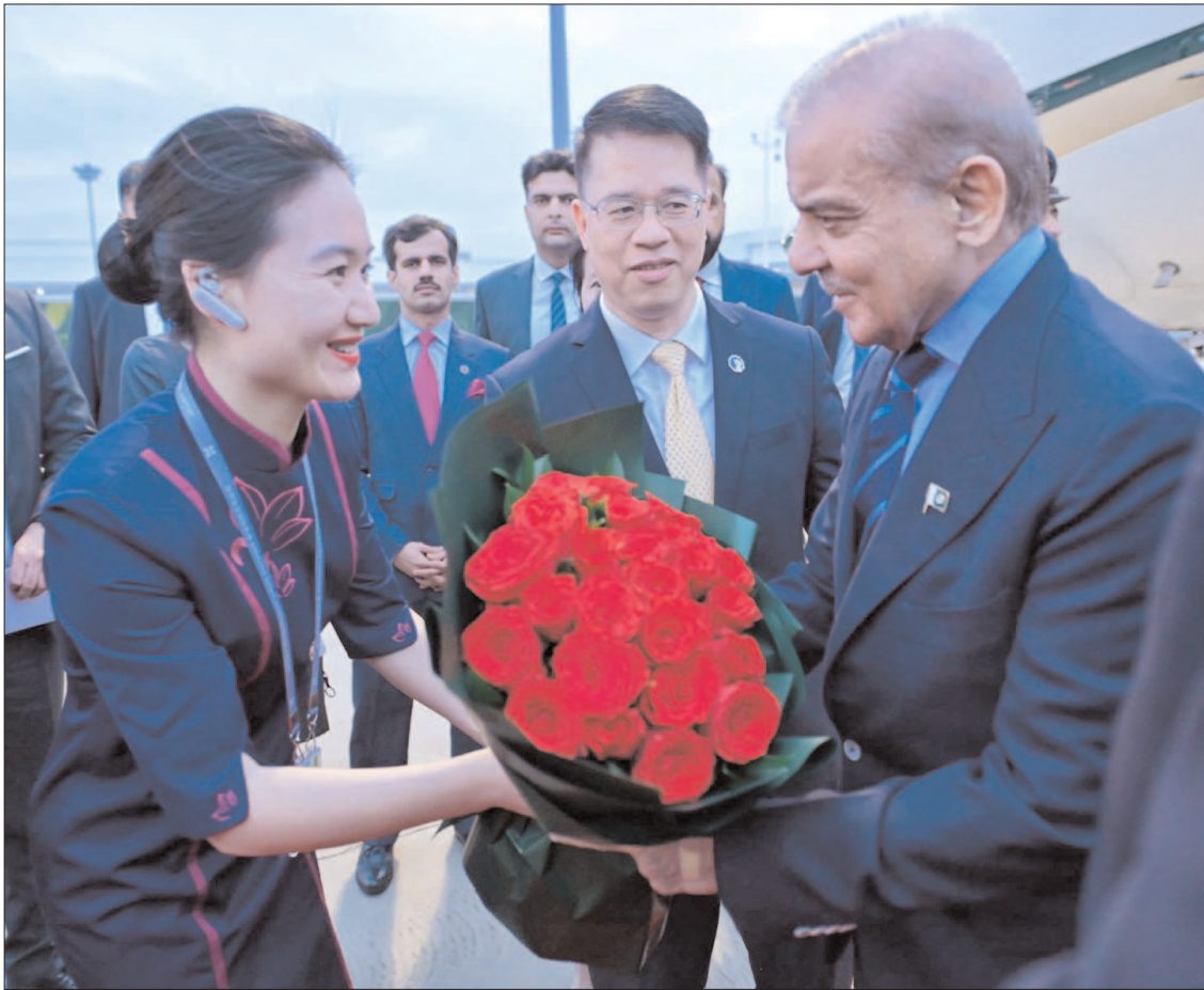
BEIJING: Prime Minister Shehbaz Sharif arrives in Shenzhen on his 5-day official visit to China.