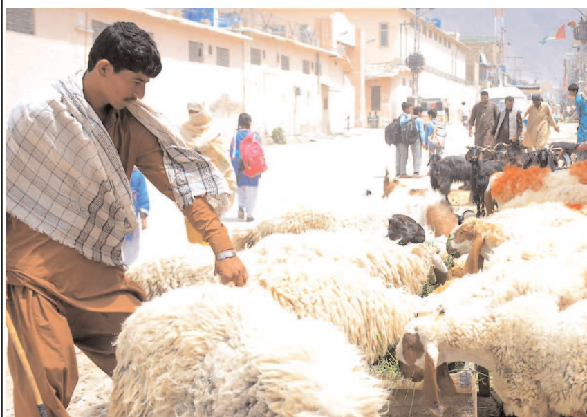
QUETTA: A man, with his sacrificial animals at his roadside setting, is waiting for the customers.