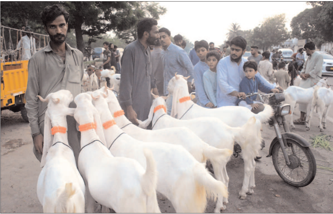
KARACHI: Vendors display sacrificial animals in connection with upcoming Eid al-Adha near Mazar-e-Quaid.