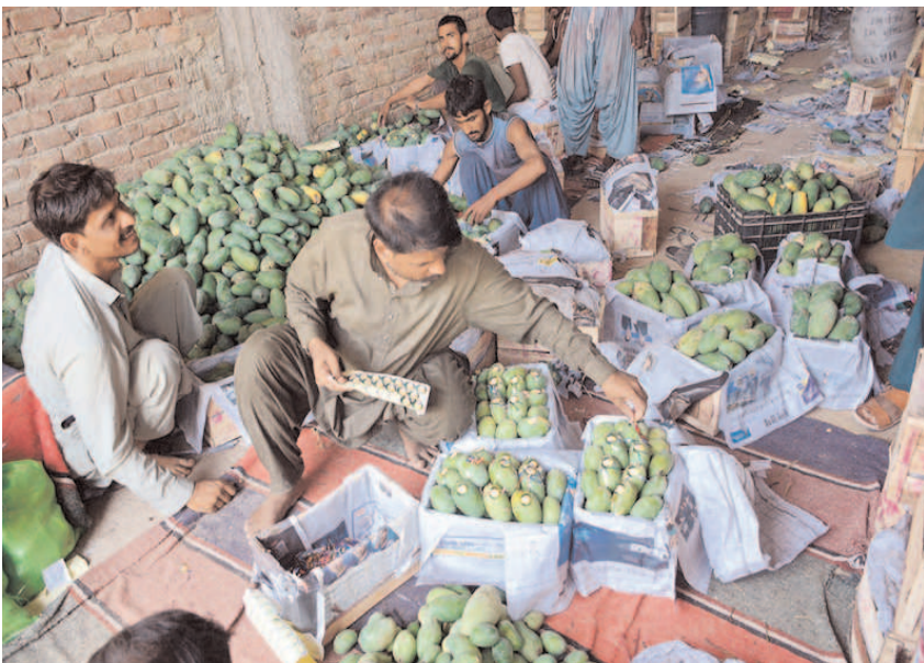
HYDERABAD: Workers are packing and marking best quality mangoes into crates at fruits market in the city for export.

Geo-mapping of water resources in the division's forests has also been carried out. The commissioner directed officials to impose a ban on lighting fires within 500 meters of forests under Section 144 and form separate committees to investigate forest fire incidents also monitor temperature levels in each district. Identify locations for setting up camps near hotspots to ensure timely response to forest fires.