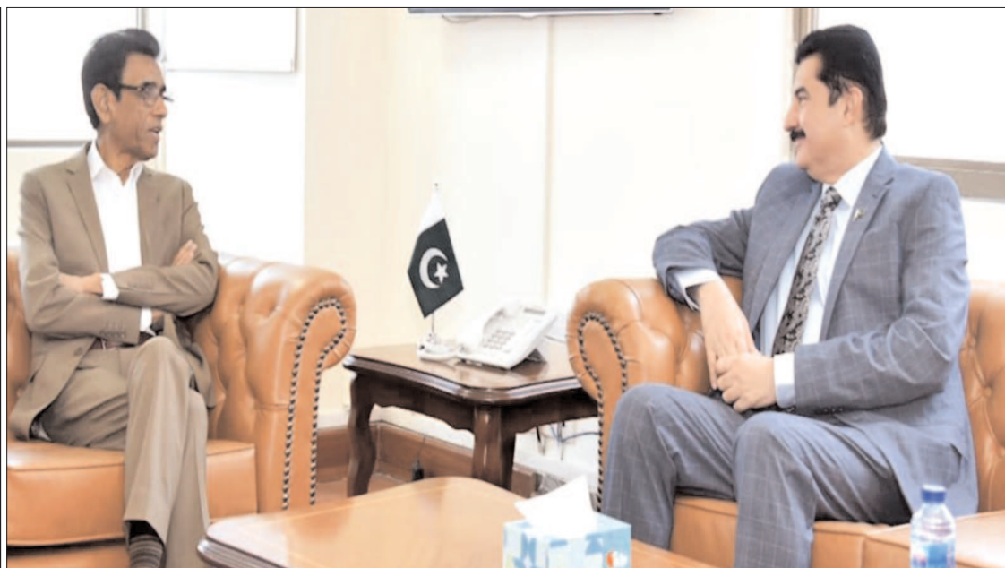
ISLAMABAD: Governor Khyber Pakhtunkhwa Faisal Karim Kundi calls on Federal Minister Science and Technology Dr. Khalid Maqbool Siddiqui in Islamabad.

The consumers will also be able to control their electricity bills by monitoring their electricity consumption daily through a mobile application, he remarked.