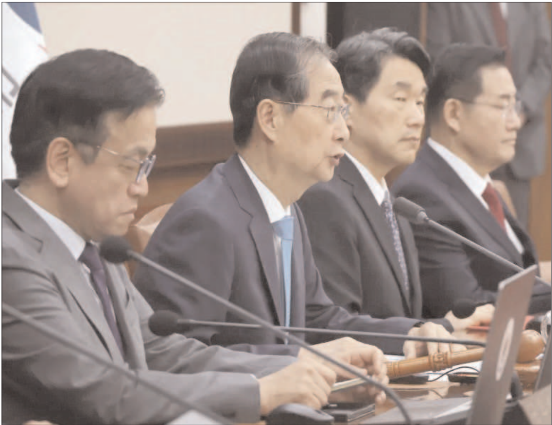
SEOUL: South Korea's Prime Minster Han Duck-soo, speaks during a cabinet meeting at the government complex.