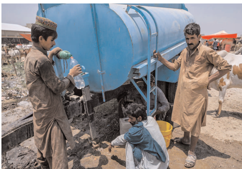
RAWALPINDI: People filling their bottles with water from a water tanker at Bhatta Chowk Livestock market.

Giving details of the penalty actions, the health officer briefed that the health authority, in collaboration with allied departments, had lodged 113 FIRs, sealed 107 premises, issued tickets to 443 and a fine of Rs 527,000 was imposed on violations of dengue SOPs from January 1 to date.