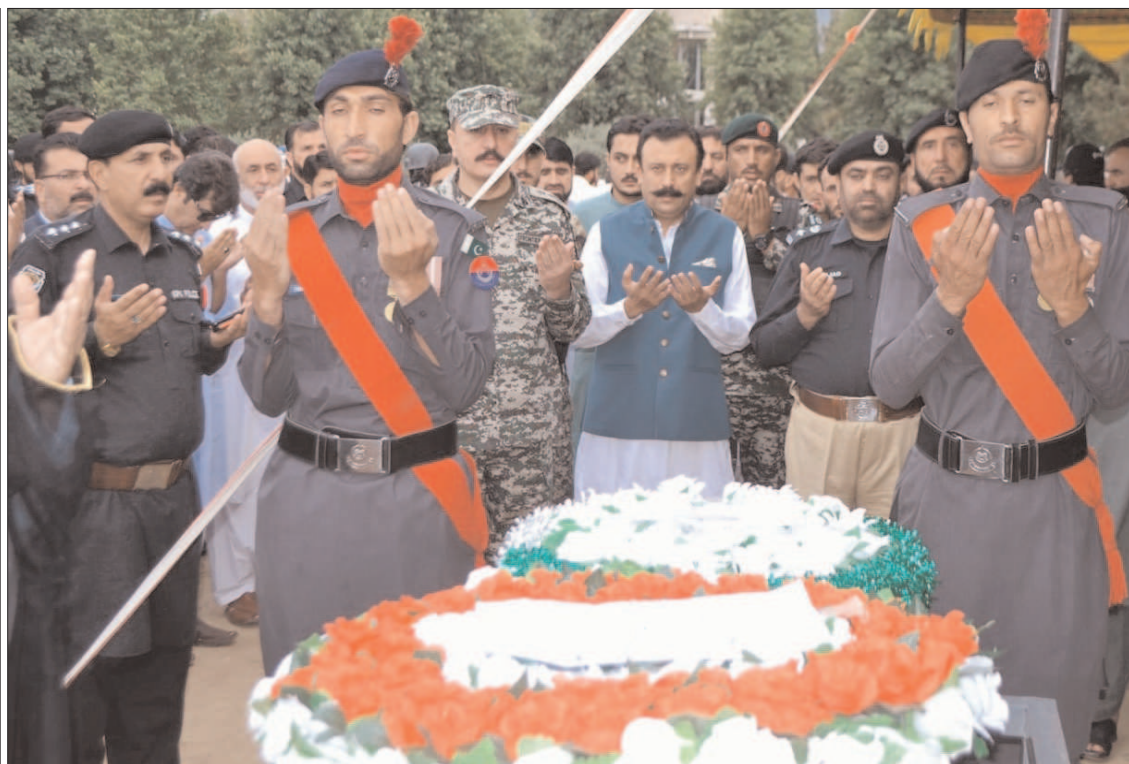
KHAR: Officials offering fateha for the departed soul of Shaheed policeman after funeral prayer in Bajaur.

Sources said that acting on a tip-off, patrolling staff of the National Highway and Motorway Police intercepted a car near the Chach interchange and, during the search, recovered 153.60 kilograms of narcotics, including 117.60 kilograms of hashish and 36 kilograms of opium.