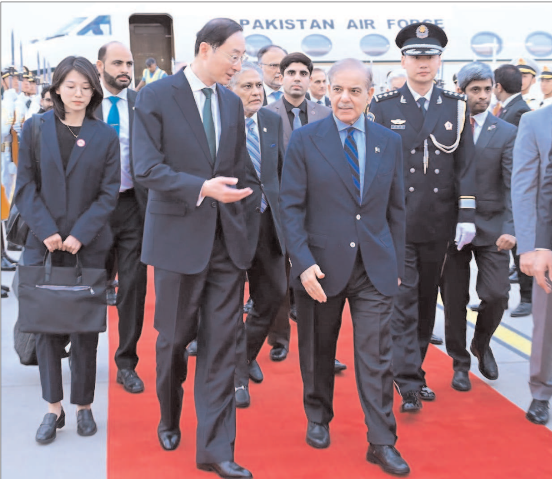
BEIJING: Vice Foreign Minister of China, Sun Weidong receiving Prime Minister Shehbaz Sharif at airport.

He urged the Chinese businessmen to look into Pakistan's potential and told them that the labor costs in Pakistan were very competitive. Besides, for facilitation and smooth processing of investment, the Special Investment Facilitation Council has been formed under the prime minister with all relevant ministries and provincial chief ministers working under one umbrella for the purpose.