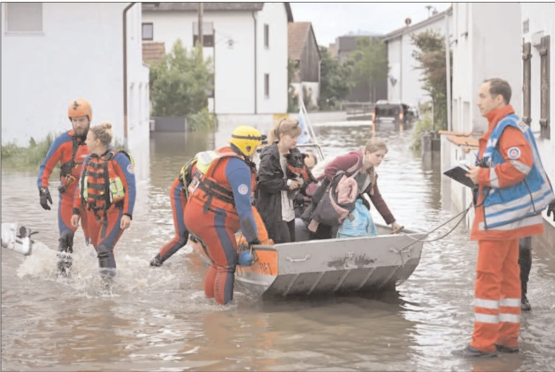
BERLIN: A flooded street in Baar-Ebenhausen, Bavaria in southern Germany.

A statement from Interpol said the agency has taken steps to prevent further "misuse of its systems." "Our robust monitoring systems identified suspicious activity," said Interpol Secretary General Jürgen Stock. "We took immediate action, including reporting the issue to law enforcement authorities in our host country France." Stock highlighting the vast number of individuals subject to Red Notices - over 70,000 people - but did not elaborate on the attempted sabotage. When reached by The Associated Press, Interpol said because it was a Moldovan-French probe, it would not be appropriate for the agency to elaborate on an ongoing investigation.