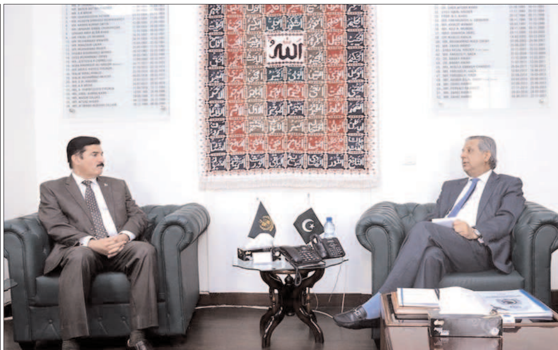
ISLAMABAD: Governor KPK, Faisal Karim Kundi calls on Federal Minister for Law and Justice Senator Azam Nazeer Tarar.

He hoped that RWMC would succeed in achieving the first position over the best cleanliness arrangements on Eid-Ul-Azha across Punjab.