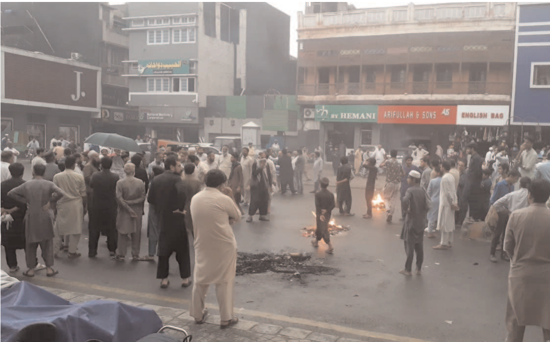
PESHAWAR: Residents of Peshawar Saddar blocked the main Saddar Road in protest against hours long electricity load shedding in the area. They protested and chanted slogans against Cantonment Board Peshawar.

The crackdown has led to the arrest of 250 suspects from 94 uncovered gangs, with recoveries amounting to over 13.7 million rupees, 181 stolen mobile phones, 38 motorcycles, 12 cars, and six rickshaws, along with gold jewelry. SSP Kashif Zulfiqar reaffirmed the commitment to uncompromising efforts in ensuring the safety and security of the public.