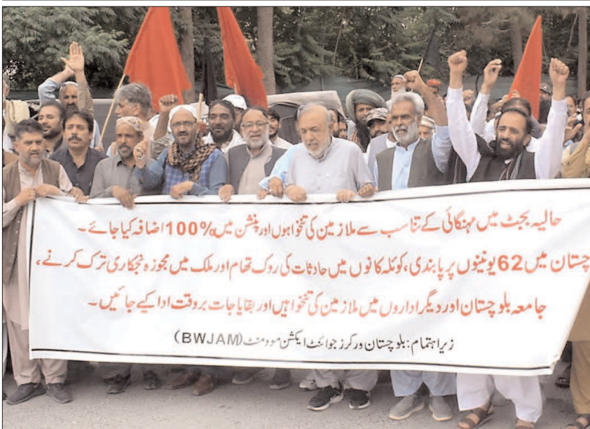
QUETTA: Activists of Balochistan Workers Joint Action Movement holding a protest in favour of their demands.

Private schools play a key role in spreading education in the locality; they added and said they will foil miscreant activities by standing stern with the security agencies to wipe out militancy. Peace is the guarantee of every positive development therefore the government should ensure it for smooth flow of education in private schools. They demanded the authorities concerned to probe into the matter and punish those who were found guilty in the bomb blasts.