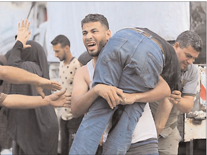
GAZA STRIP: An Palestinian man carrying an injured person towards hospital after Israeli bombardment at a refugee camp.

He also discussed the possible role of the China EXIM Bank in financing Pakistan-China joint venture projects and trade financing as part of efforts to boost Pakistan's exports to international markets.