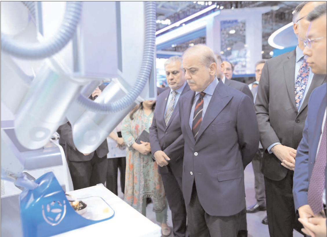
BEIJING: Prime Minister Shehbaz Sharif being briefed on Zhongguancun Science Park.