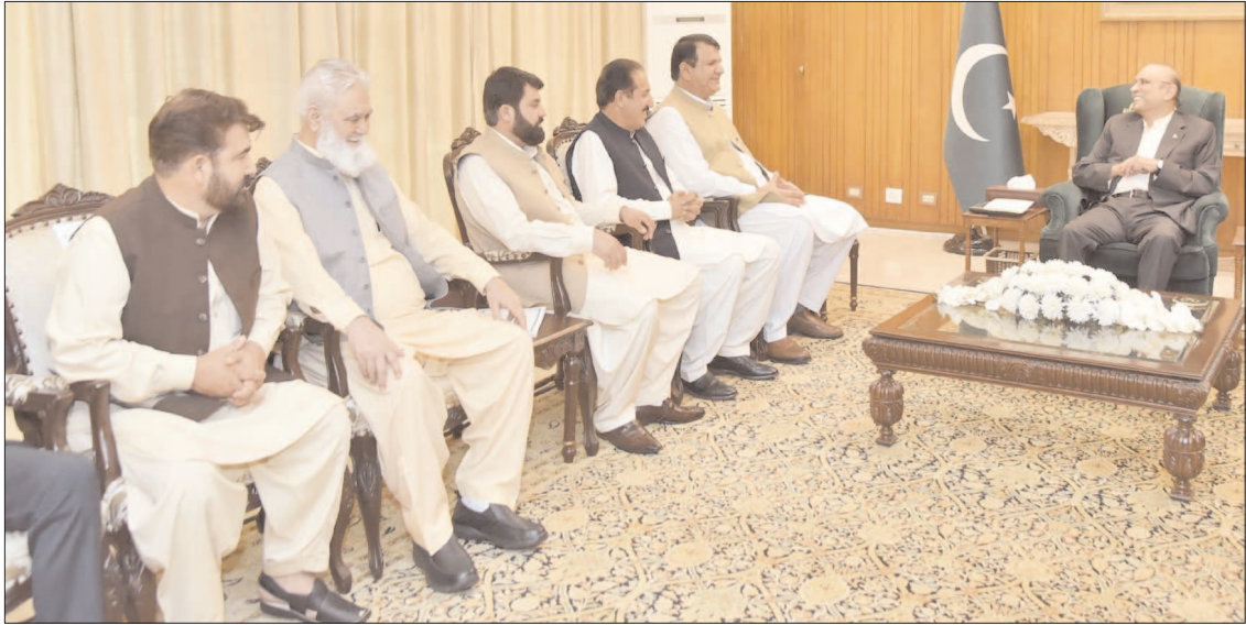
ISLAMABAD: A delegation of members of Gilgit-Baltistan Council called on President Asif Ali Zardari, at Aiwan-e-Sadr.