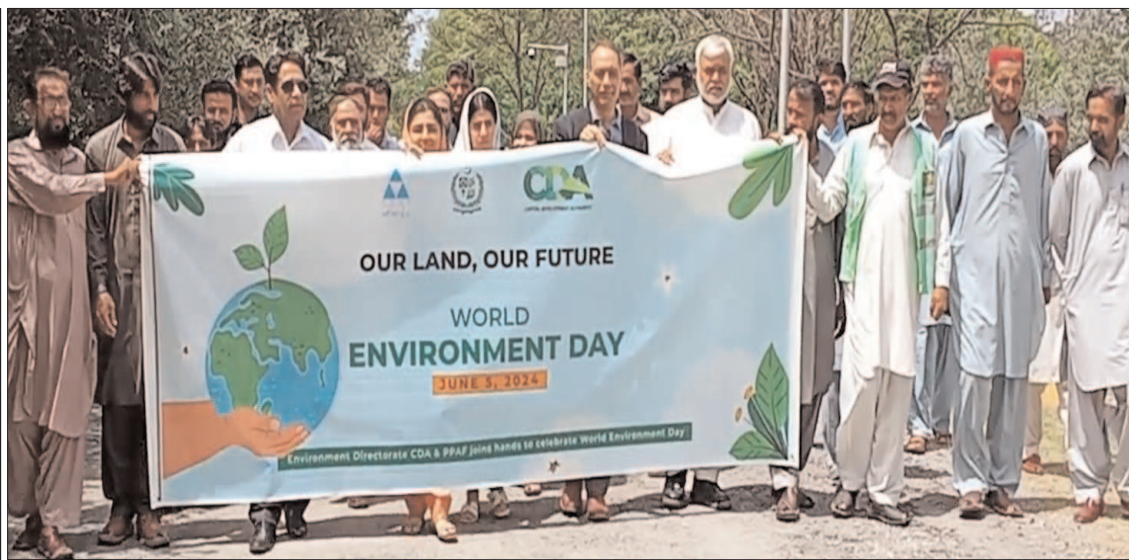
ISLAMABAD: Pakistan poverty alleviation fund (PPAF) and Environment Directorate of Capital Development Authority (CDA) Islamabad jointly organized a walk to raise awareness on climate change to mark World Environment Day.

The NIH emphasized the individual preventive measures including washing hands frequently with soap and water, especially after using the toilet, changing diapers, and before preparing or eating food.