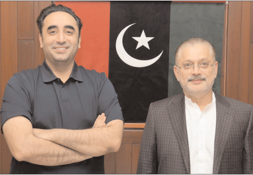
KARACHI: Sindh Minister for Information, Sharjeel Inam Memon posing a photo with Chairman PPP, Bilawal Bhutto Zardari.

"We have passed through the furnace of fire to become solid iron, now none of us will return back. We are facing cases and go to jail if the bail cancels," he said. "If the IMF contacted us, we will only demand supremacy of the constitution and the law in the country," he added.