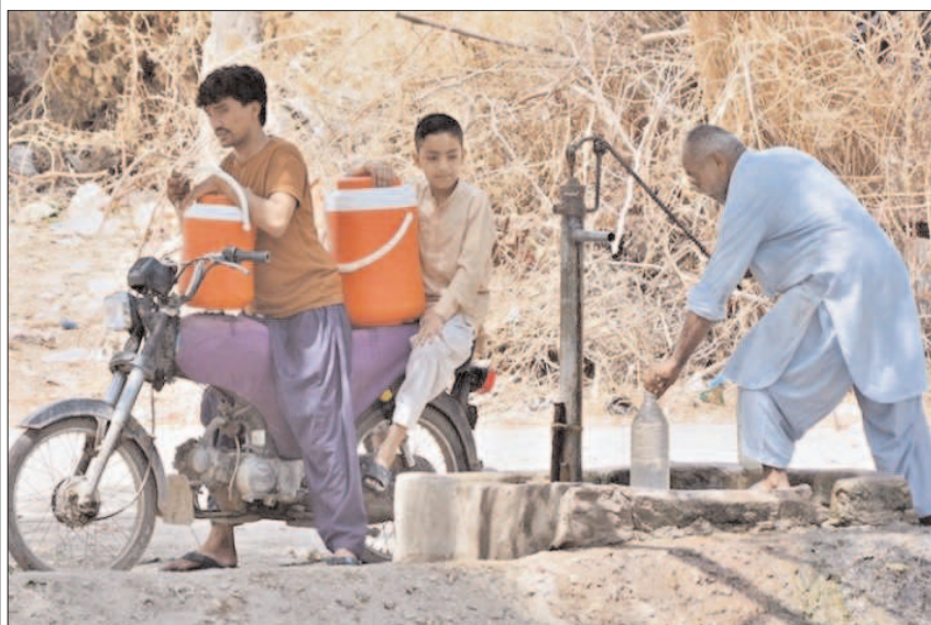
HYDERABAD: In Hala Naka, city dwellers gather around hand pump, filling their pots with clean water for drinking.

Speaking on the occasion, Ambassador Kijun said that Republic of Korea was interested in investing in different sectors of Balochistan, including tourism and IT sectors.