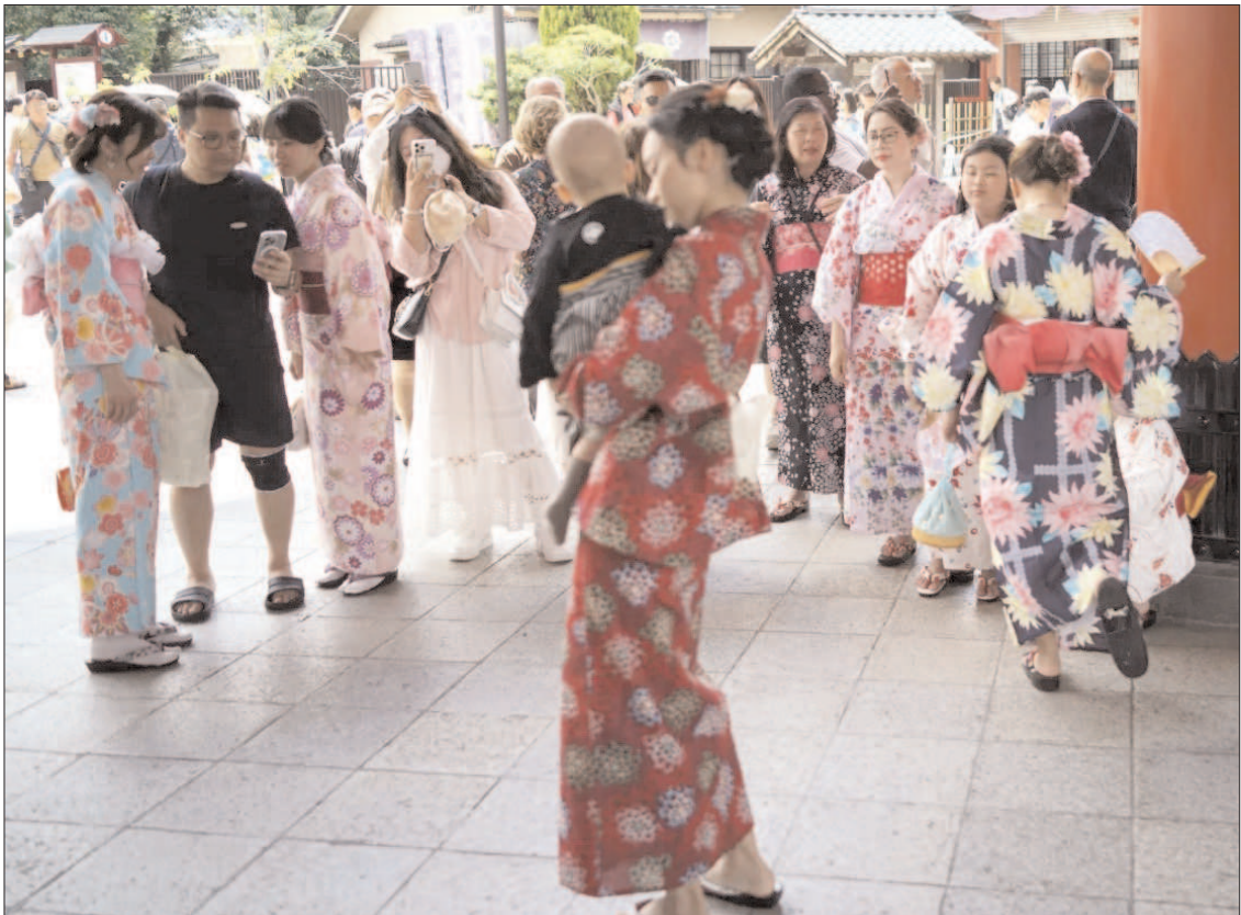
TOKYO: Foreign visitors in traditional Japanese 'kimono' stand at Sensoji Temple at Asakusa district.