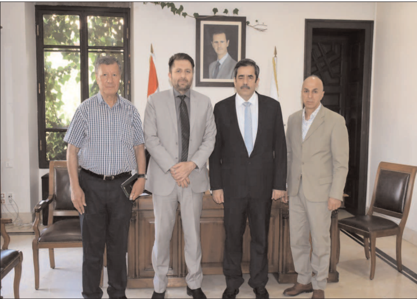
IT centre and think tank in Damascus University. During the meeting, the