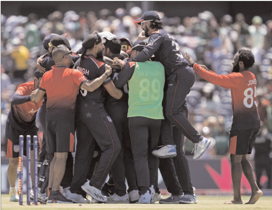
DALLAS: USA beat Pakistan in the first upset of the World Cup.