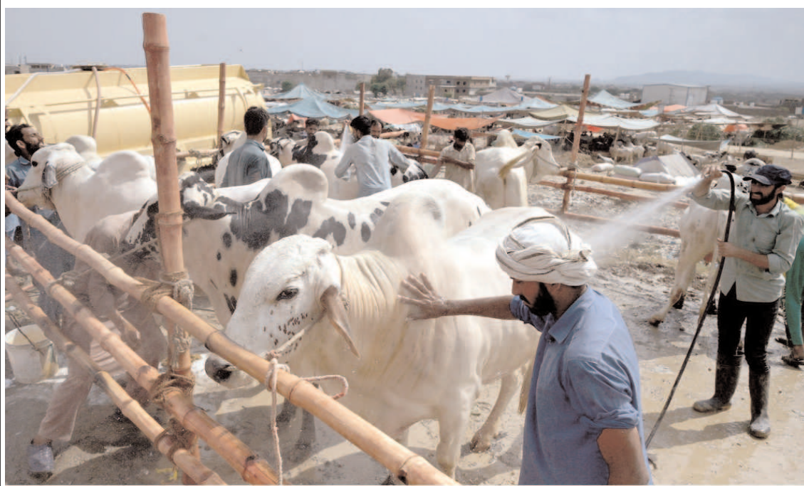
RAWALPINDI: Vendors washing a sacrificial animal to attract the customers at Bata Chowk.

They said the leadership of Saudi Arabia has previously warned that all Hajj arrangements must be made through approved companies and they have announced heavy fines and legal consequences for those attempting to perform Hajj without proper authorization. They reiterated this warning and encourages all pilgrims to comply with these regulations to ensure a peaceful and lawful pilgrimage.