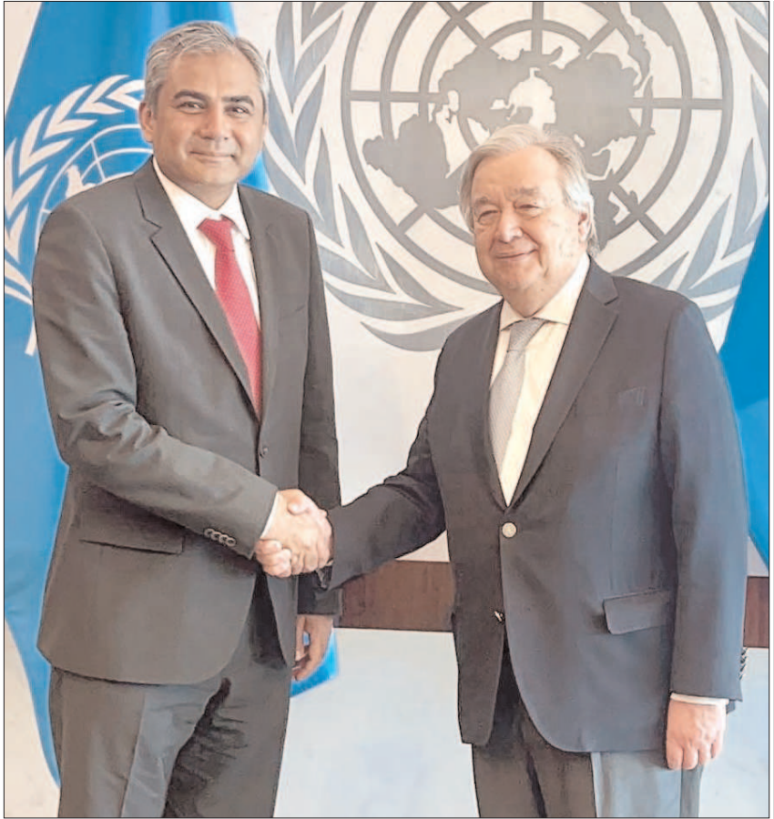
NEW YORK: Federal Minister for Interior, Mohsin Naqvi shaking hands with UN Secretary General Antonio Guterres.