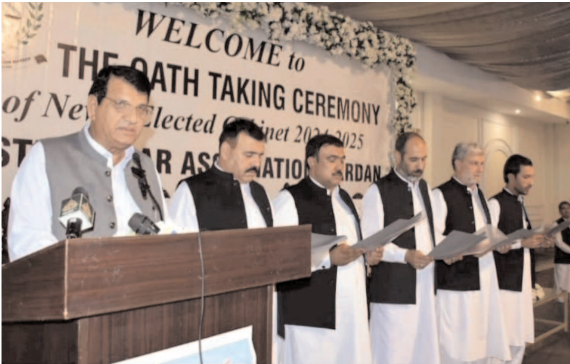
PESHAWAR: Federal Minister for SAFRON, Kashmir and Gilgit Baltistan Affairs Engineer Amir Muqam administering oath of newly elected cabinet of District Bar Association Mardan.