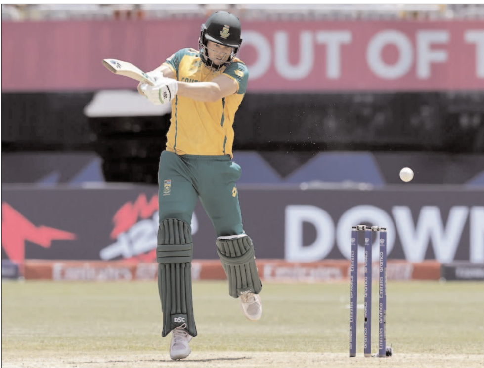
David Miller took South Africa out of trouble.

Swiatek dominance underlined in style and stats. Coming into the clay-court major, everyone wondered who could stop Swiatek winning the title again. Ultimately, nobody was able to provide an answer. Along with her formidable history at Roland Garros she arrived in hot form, having already won prestigious WTA titles in Madrid and Rome. Former world number one Naomi Osaka came closest to beating Swiatek, troubling her with powerful returning and holding a match point in their second-round encounter before the top seed recovered. Since then it has been plain sailing for Swiatek. A 40-minute 'double bagel' over Anastasia Potapova in the fourth round laid down a significant marker, before she dropped just two games against 2019 finalist Marketa Vondrousova in the quarter-finals. US Open champion Coco Gauff offered more resistance in the semi-finals before Swiatek asserted control against an opponent she has dominated in their previous meetings. Few people gave Paolini hope of causing what would have been an almighty shock. After a sloppy start, Swiatek found her rhythm, crushing Paolini in a devastating performance which showcased her ability and authority on the red dirt. The statistics also under-