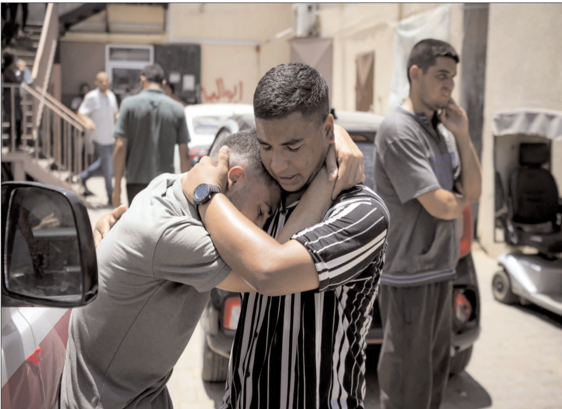
DEIR AL-BALAH: Palestinians mourn relatives killed in Israeli bombardment of the Gaza Strip at a hospital morgue on Tuesday.

The Israeli military has said it had intelligence showing that militants from Hamas and the smaller Islamic Jihad group were regrouping in central Gaza City. Israel accuses Hamas and other militants of hiding among civilians. In Shijaiyah, a Gaza City neighborhood that has seen weeks of fighting, the military said it had destroyed 6 kilometers (3 miles) of Hamas tunnels.