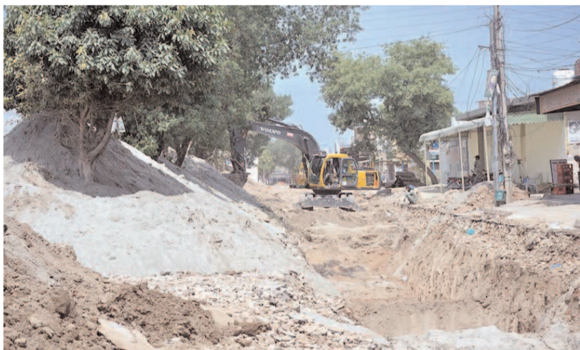
MULTAN: A view of construction work of Piran Ghaib Road during development work in the city.

The Dopa chief thanked the Dir Motorway project director for participating in the meeting and sharing his valuable thoughts.