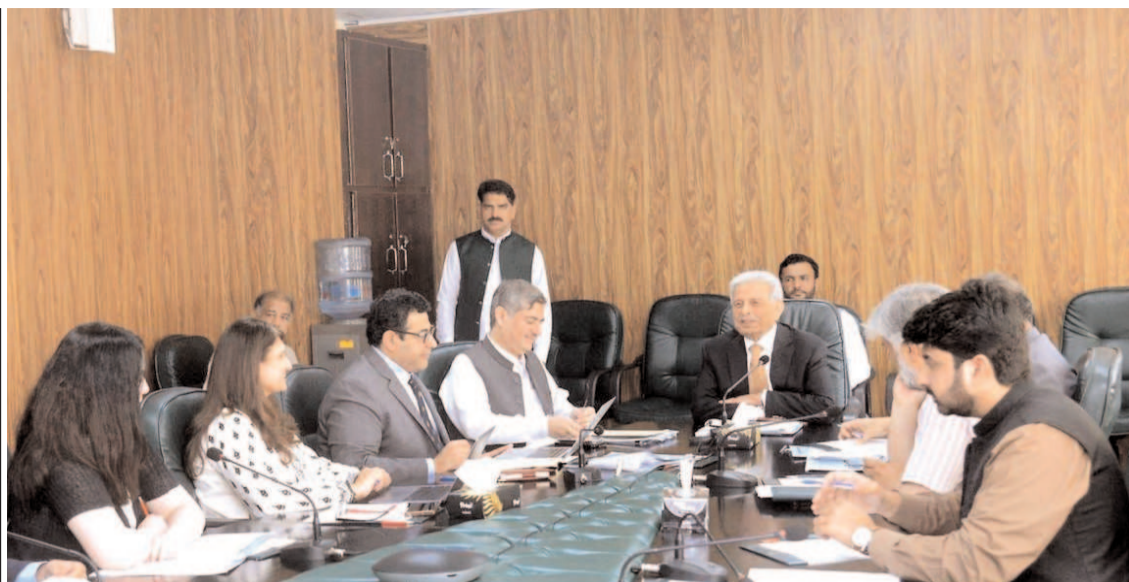
ISLAMABAD: Federal Minister for Industries and Production Rana Tanveer Hussain chairing 11th meeting of National Coordination Committee on Small Medium Enterprises Development.

Taipei, Seoul, Singapore, Kuala Lumpur, Jakarta, Manila and Mumbai were also in the green with Bangkok the sole decliner across the region while Hong Kong ended flat.