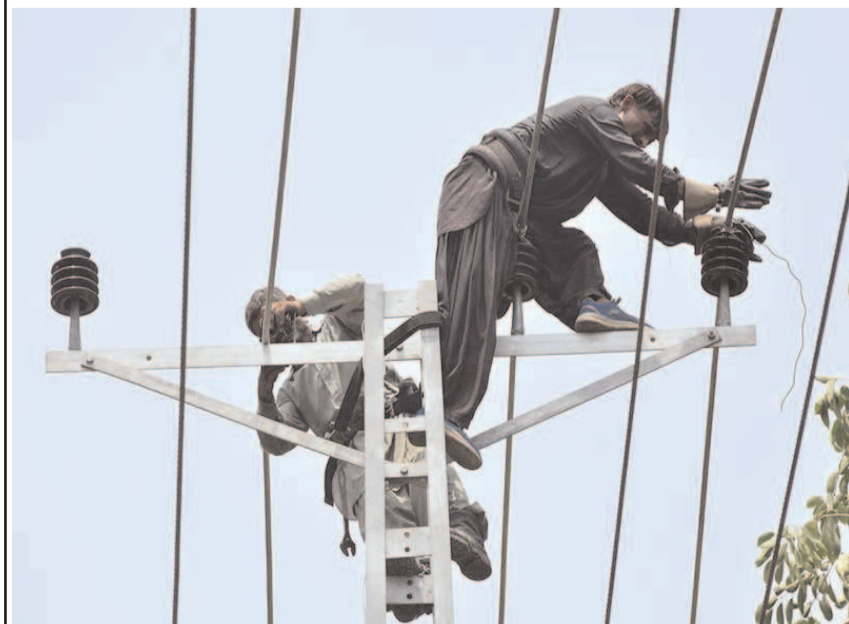
HYDERABAD: HESCO workers busy in installing new electric wire on the electric pole at Fatima Jinnah Road.

He asked Additional Director to form a committee that should check the vaccination process on the basis of 15 per cent sampling of the animals claimed to be vaccinated.