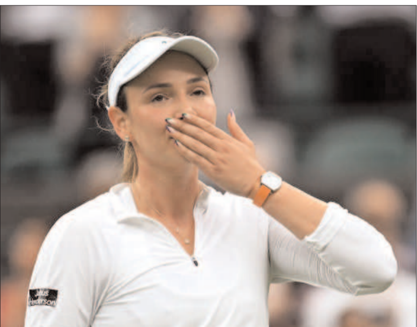
LONDON: Donna Vekic of Croatia celebrates winning match point against Lulu Sun of New Zealand in her Ladies' Singles Quarter Final match.