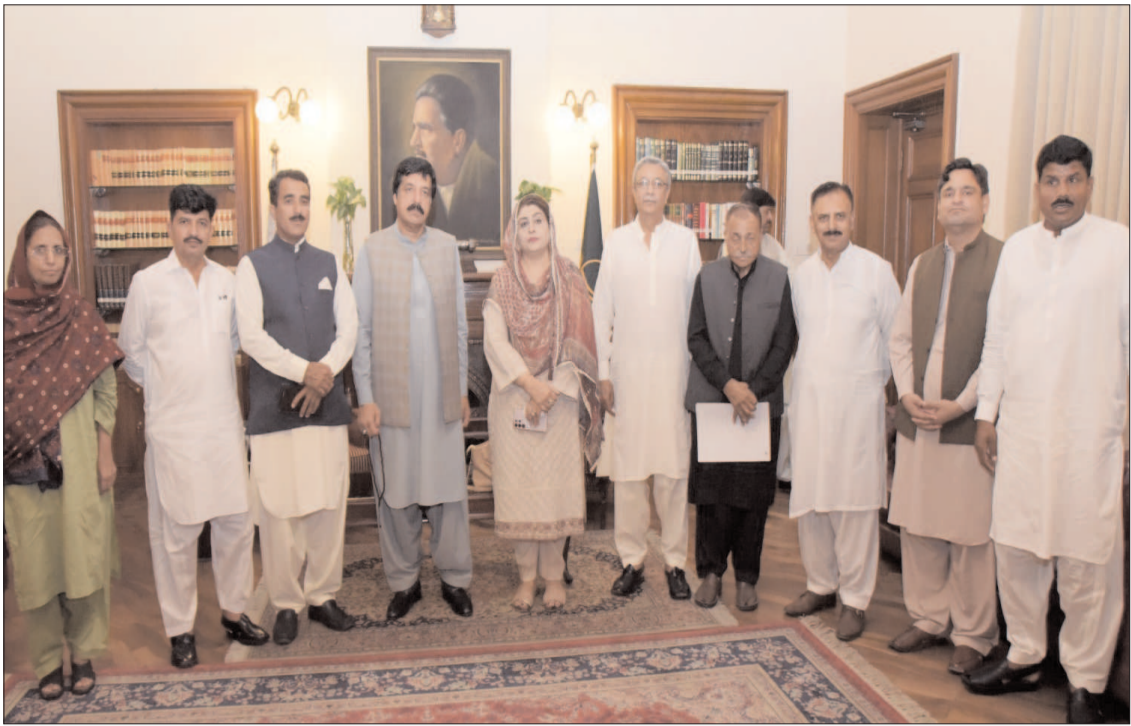
LAHORE: Delegation of Pakistan Peoples Party (PPP) meets Governor Punjab Sardar Saleem Haider Khan at Governor House.