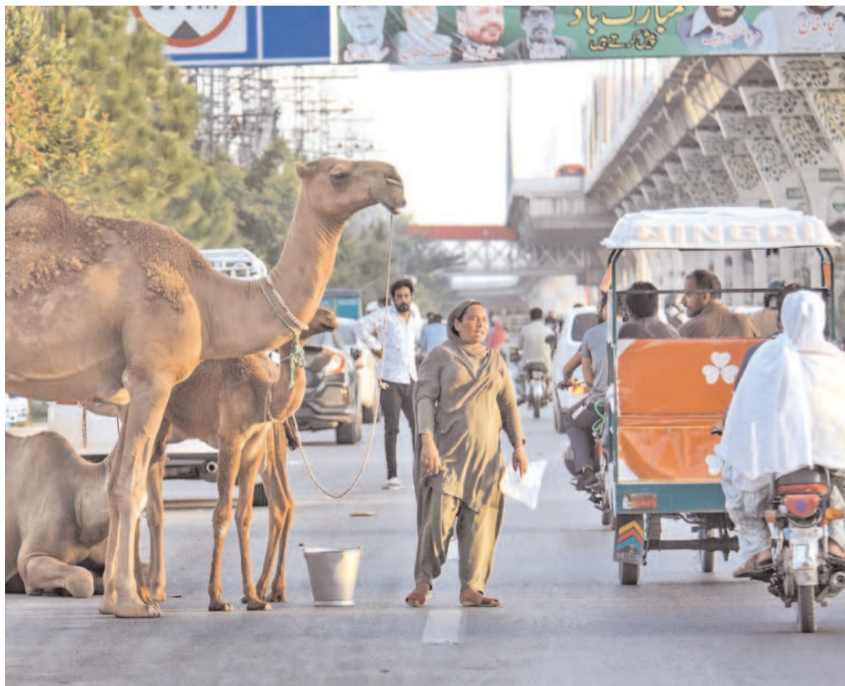
RAWALPINDI: A nomad woman waiting for customers to sell camel milk at Shamsabad.