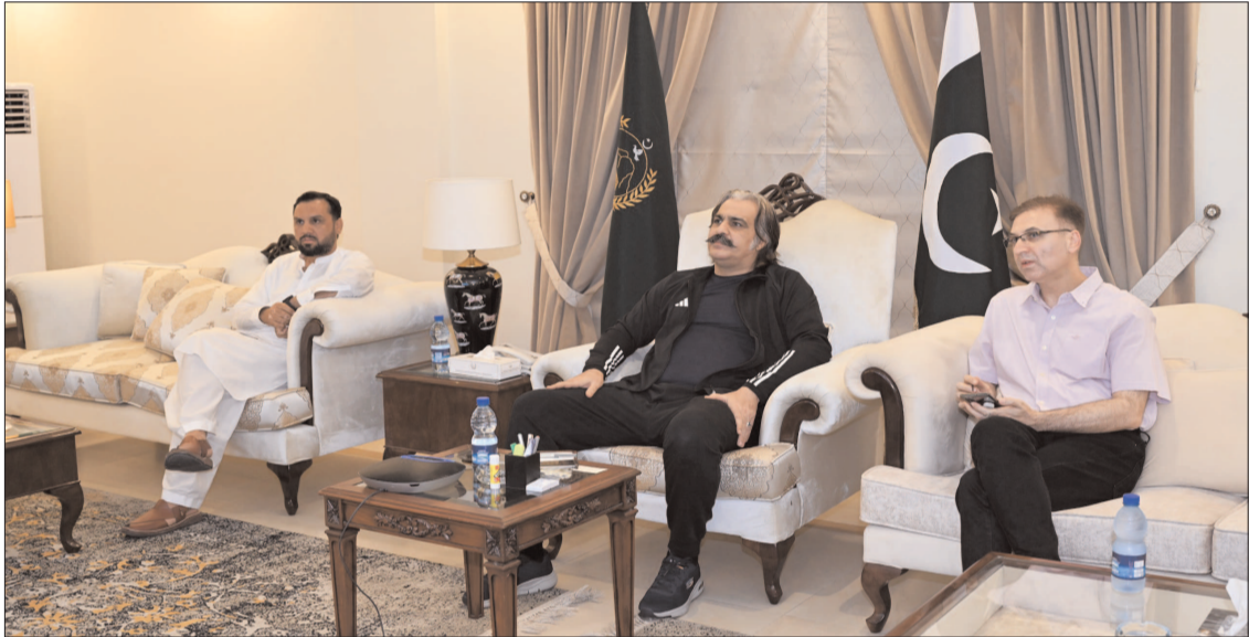
PESHAWAR: Khyber Pakhtunkhwa Chief Minister Sardar Ali Amin Khan Gandapur chairing a video link meeting regarding establishment of Cyber Security Institute.

This move highlights the WSSP's dedication to ensuring a clean and healthy environment for the residents of Peshawar, while also holding its employees accountable for their responsibilities.