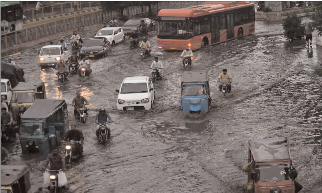
KARACHI: A view of vehicles passing through accumulated rainwater after Karachi witnessed heavy rainfall on Tuesday.

As domestic pressure builds in Israel over Hezbollah's barrages, the IDF has highlighted its ability to hit the group's operatives across the border.