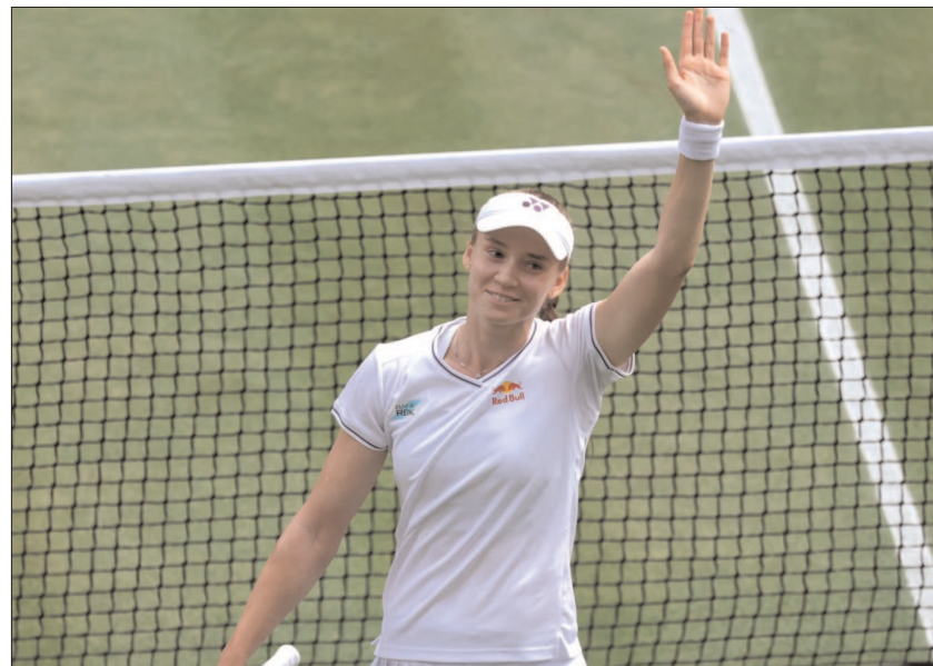
Elena Rybakina celebrates winning match point against Elina Svitolina in the Ladies' Singles Quarter Final match.

Wimbledon and move level with Roger Federer. He has now moved into a 13th Wimbledon semi-final - a joint Open era record with Federer. Djokovic has looked in excellent form at SW19, despite undergoing knee surgery just three