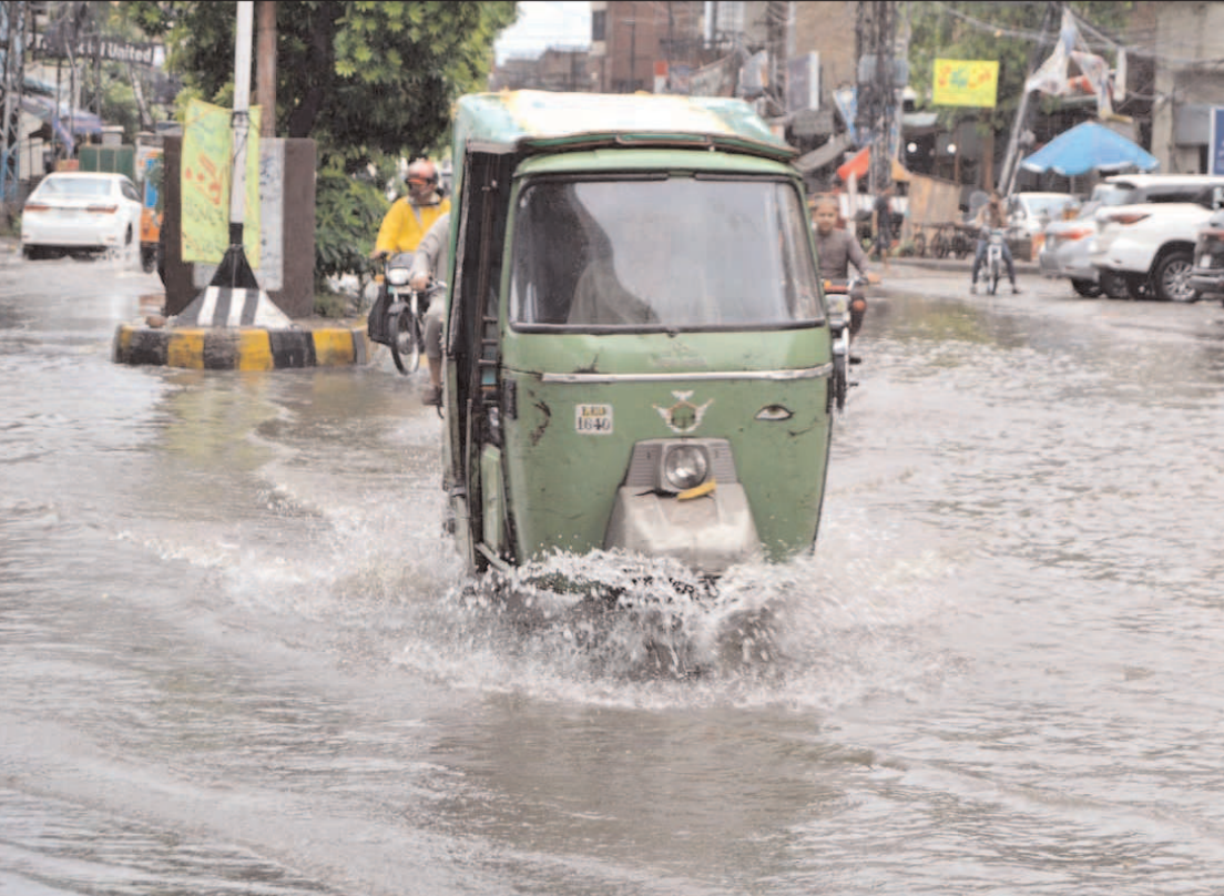
LAHORE: Rickshaw passing through rain water accumulated on road in Provincial Capital during heavy rain in the city.