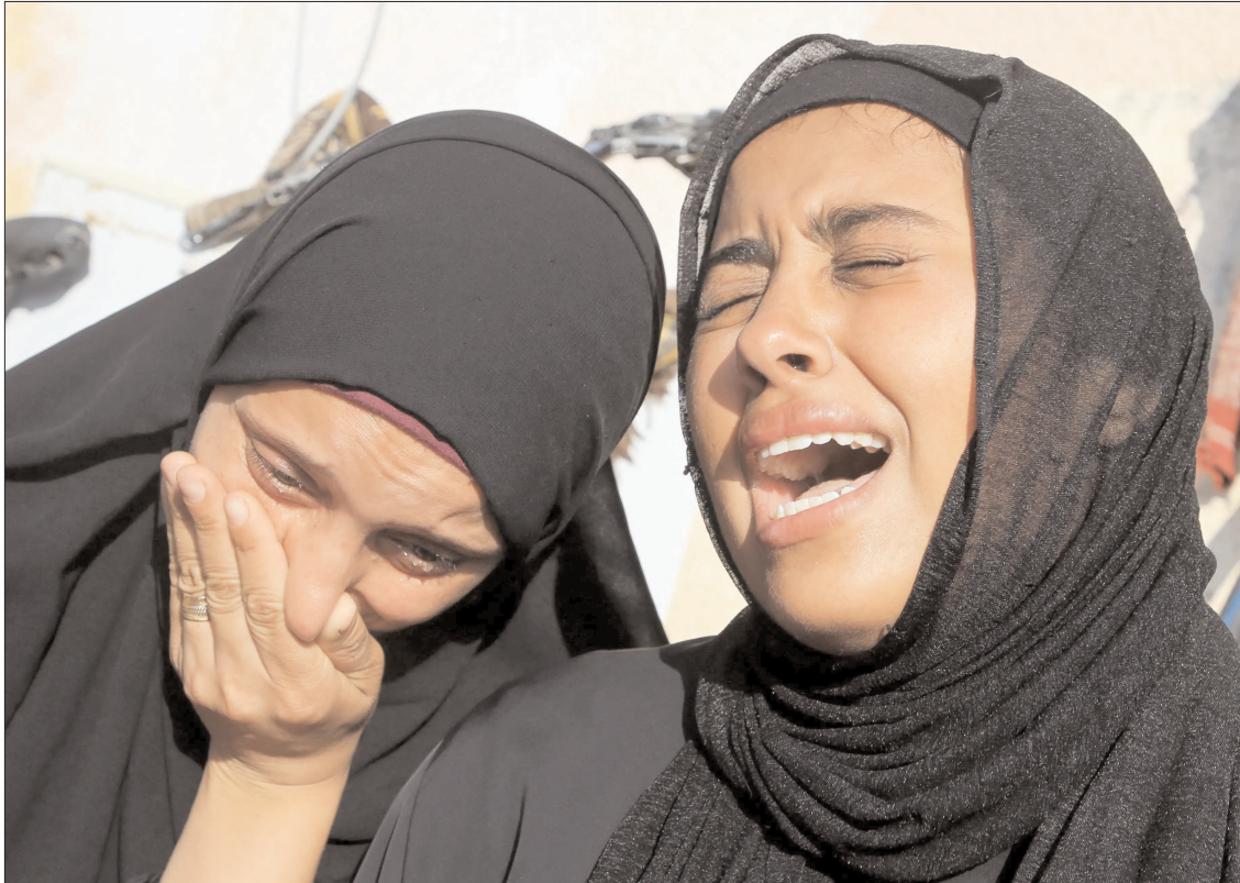
GAZA: Relatives of a Palestinian killed in an Israeli attack on a school sheltering displaced people in Khan Younis.