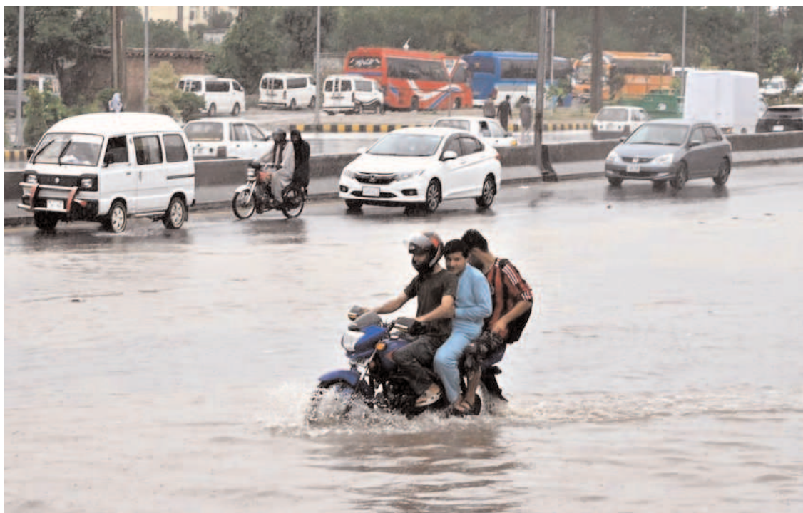
ISLAMABAD: A motorcycle passing through rain water accumulated on IJP Road after heavy rain in the twin cities.

The Committee directed that priority be given to expanding the rail network to enhance regional connectivity and maximize financial benefits. Additionally, the committee recommended creating a think tank to strategize future projects, taking into consideration future trends and climate changes, and presenting a report at the next meeting.