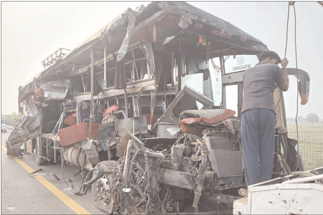
LUCKNOW: A roadside assistance worker tows away the mangled remains of a double-decker passenger bus that collided with a milk truck, near Unnao, in northern India state of Uttar Pradesh.