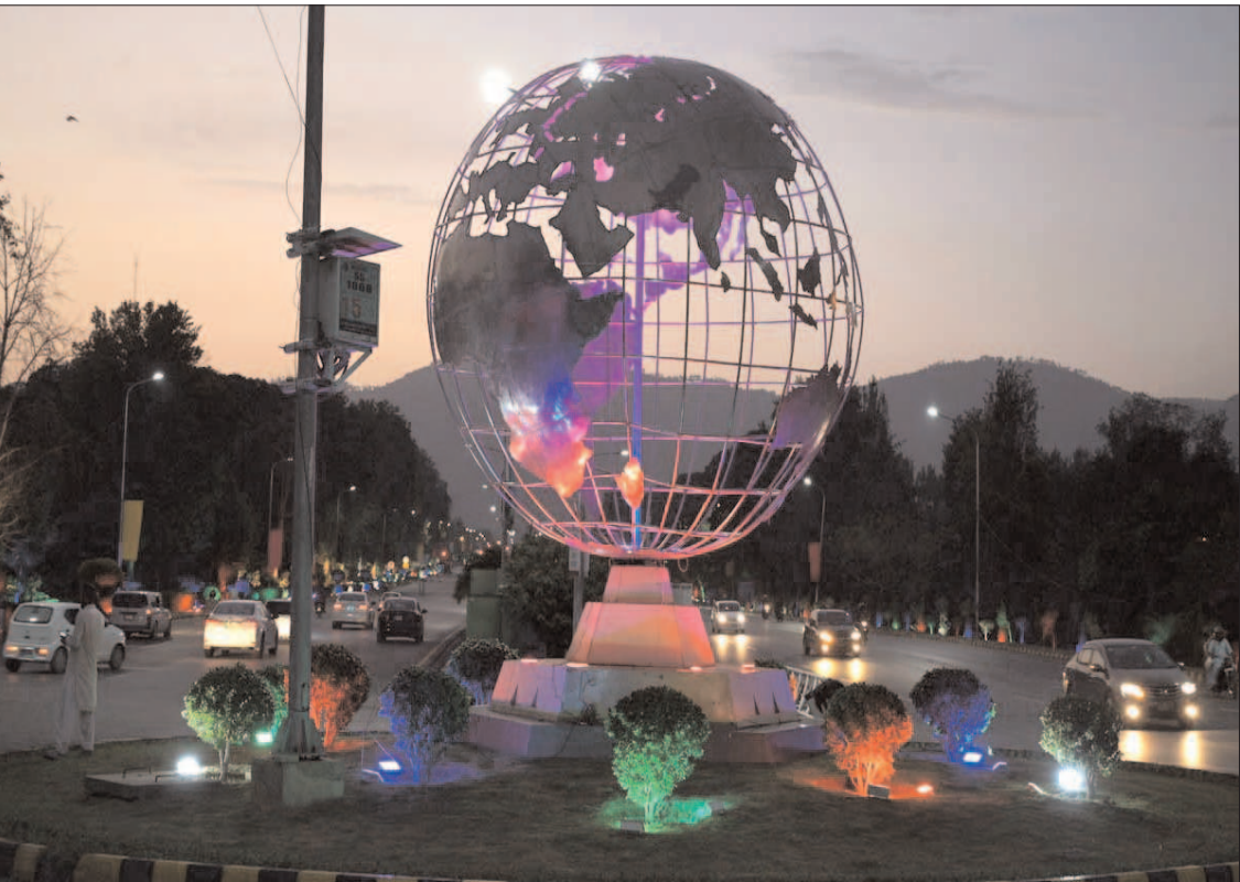
ISLAMABAD: Constitution Avenue decorated with colorful lights in connection with the arrival of President of Azerbaijan on his official visit to Pakistan.