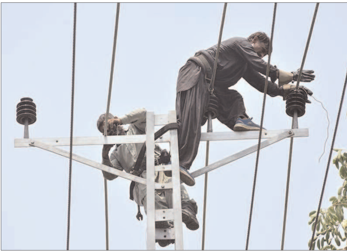
HYDERABAD: HESCO workers busy in installing new electric wire on the electric pole at Fatima Jinnah Road.

QUETTA (INP): Security forces in Balochistan have successfully intercepted a significant smuggling operation, seizing a variety of contraband items. At a checkpoint in Kalat-Quetta, forces stopped and searched a container, discovering smuggled goods including 400 tyres, 250 cloth sacks, 500 blankets, as well as weapons and ammunition.