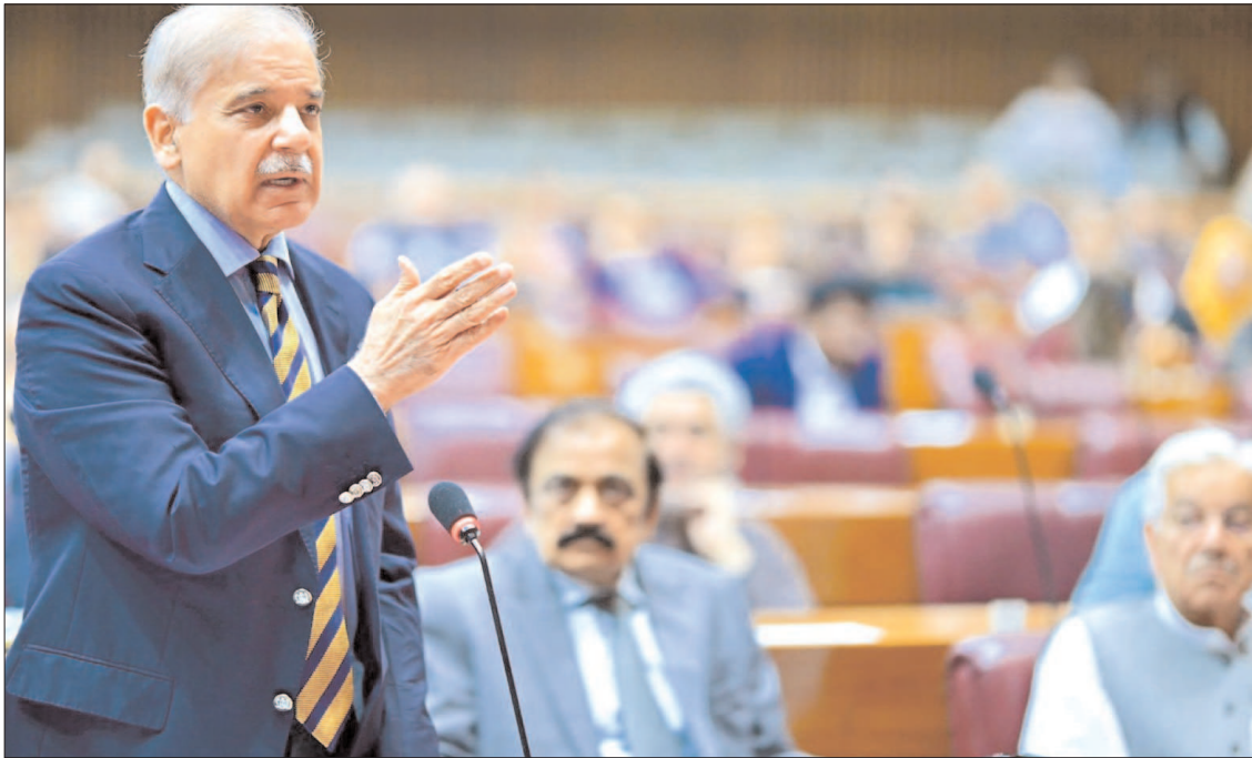
ISLAMABAD: Prime Minister Shehbaz Sharif addressing National Assembly session.