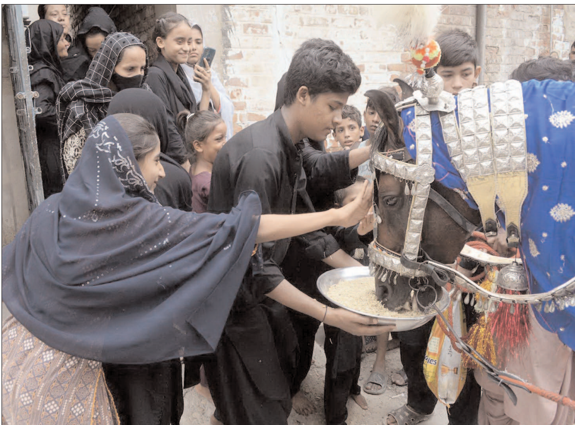
HYDERABAD: Shiites mourners touching Zuljinnah during procession on 6th Muharram-ul-Harram.