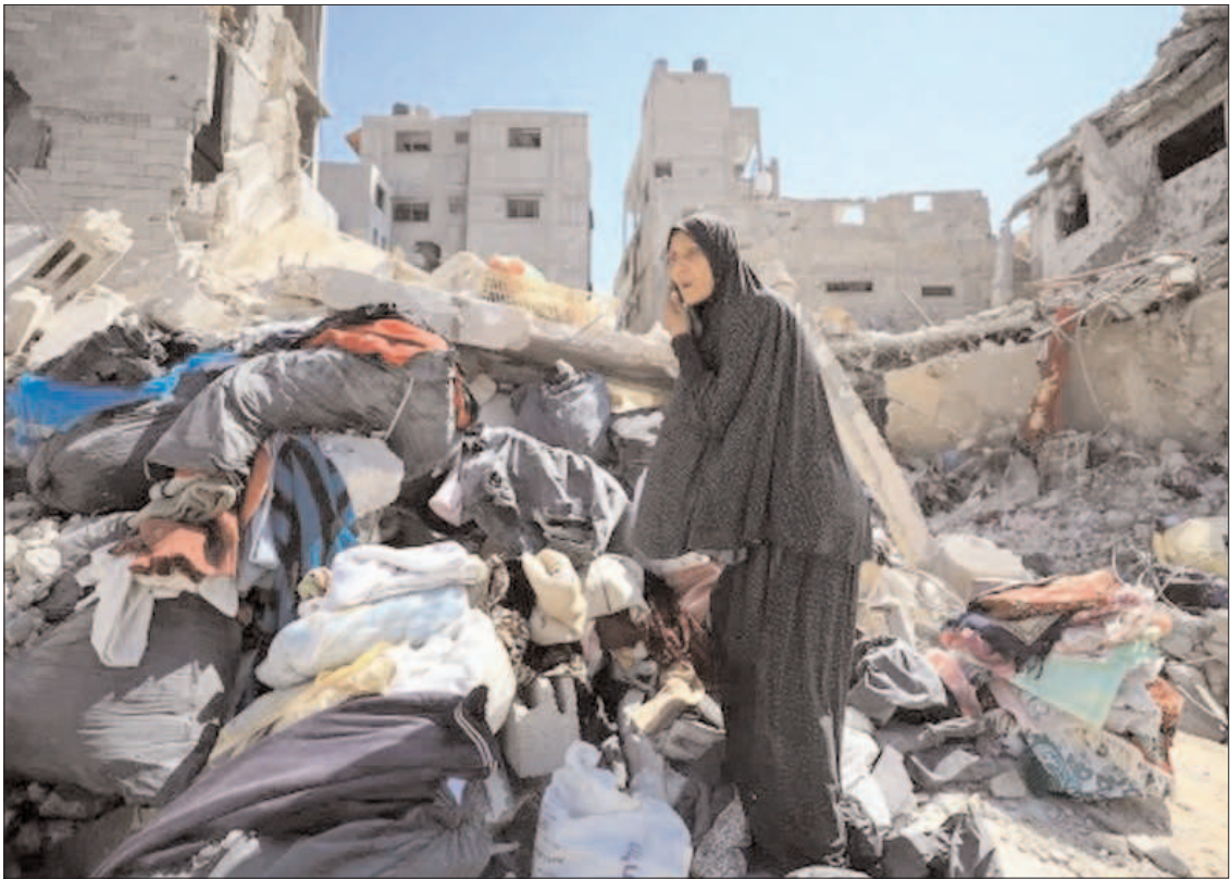
GAZA: A Palestinian woman inspecting the damage, after Israeli forces withdrew from Shujayea neighborhood, following a ground operation.