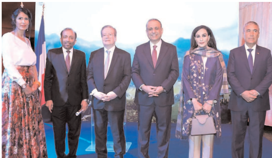
ISLAMABAD: Federal Minister for Board of Investment, Communications and Privatization Abdul Aleem Khan in a group photo during The French Embassy in Islamabad hosted a special event.