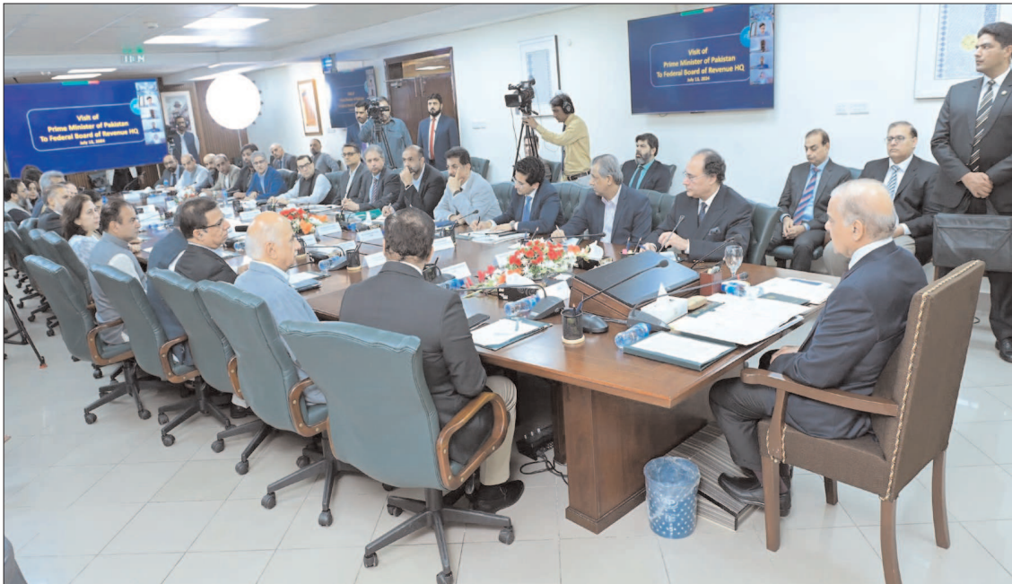
ISLAMABAD: Prime Minister Shehbaz Sharif addressing officers during his visit to headquarters of Federal Board of Revenue.

Man killed in IED blast F.P. Report QUETTA: One person was killed and another injured in improvised explosive device (IED) blast near a vehicle in the provincial capital on Saturday. According to details, an IED went off in Akhtarabad near Western Bypass in Quetta. A vehicle was damaged in the explosion resulting in death of one person and leaving another serious injured.