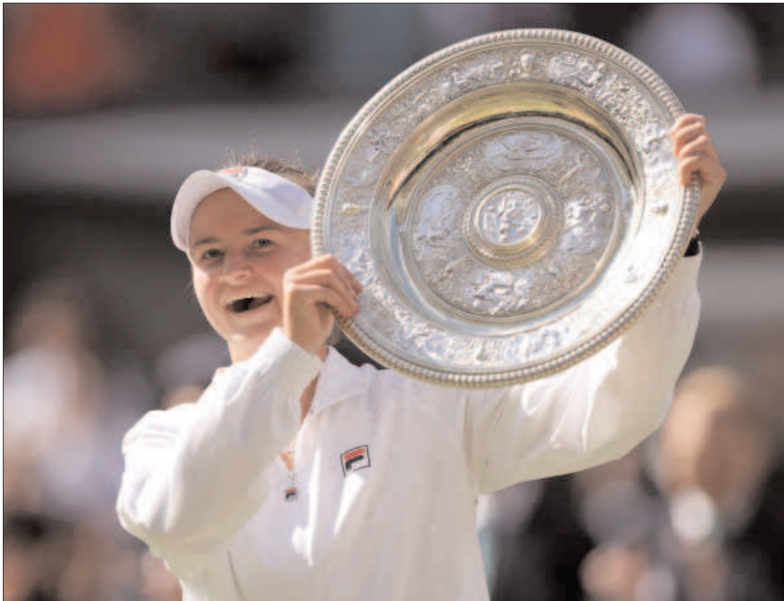
LONDON: Barbora Krejcikova lifts the Ladies' Singles Trophy following victory against Jasmine Paolini during her Ladies' Singles Final match during day thirteen of The Championships Wimbledon 2024.

hold to love. Nervy conclusion Paolini, the first Italian woman to reach a Wimbledon singles final, had to save two break points in the third game but she cracked under the strain again as the composed Czech stormed into a double-break ahead for 4-1. Krejcikova moved to three set points in the eighth game and only needed one as Paolini dumped a backhand return into the net. The nerve-wracked Italian managed to claim just four points on the Czech's serve in the 35-minute opener. Krejcikova hit 10 winners to the Italian's five. Paolini dashed off Centre Court for a bathroom break and returned re-energised. She had also dropped the first set in her marathon semi-final triumph over Donna Vekic and on Saturday she launched another second set fightback. Breaks in the second and eighth games levelled the final after a set in which Krejcikova made 14 unforced errors to seven for her opponent, taking her double-fault count to a tournament-high of 33. The Czech managed just four winners in the set as she went spectacularly off the boil.