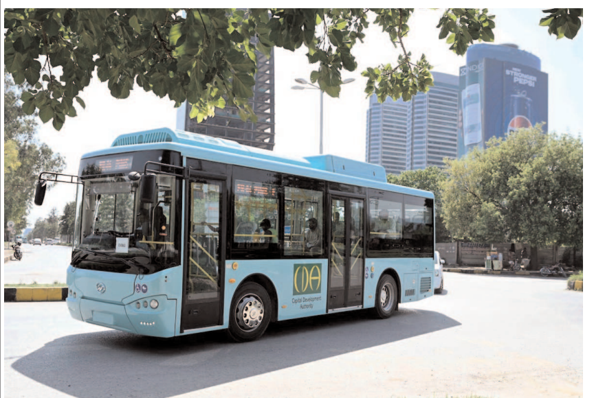
ISLAMABAD: A view of New Electric Bus on the way in the Federal Capital.

Cases under the Anti-Narcotics Act have been registered against the arrested accused and further investigations are under process.