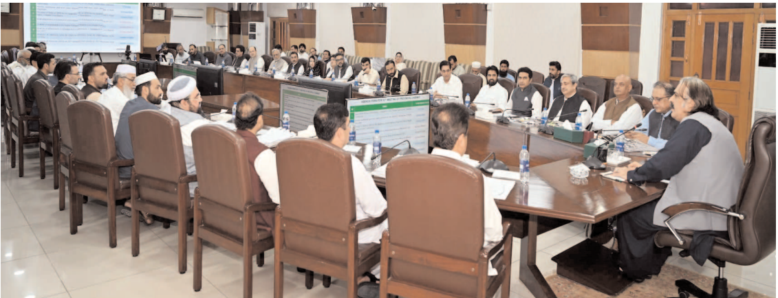
PESHAWAR: Chief Minister Khyber Pakhtunkhwa Sardar Ali Amin Khan Gandapur chairing 10th meeting of Provincial Cabinet.

PESHAWAR: Demanding the resignation of the chief election commissioner, Qaumi Watan Party (QWP) Chairman Aftab Ahmad Khan Sherpao on Saturday hailed the decision of the Supreme Court in the reserved seats case. In a statement, he said that the resignation of the chief election commissioner and other members of the Election Commission of Pakistan (ECP) would pave the way for ensuring the holding of the free and fair elections in future. Aftab Sherpao said that the Supreme Court's decision was a no-confidence against the ECP the way it conducted the general election 2024. "The apex court decision has proved that the ECP did not act as an impartial body in conducting the last general election in a free and fair manner," the QWP leader remarked, adding that the election watchdog had acted against the relevant laws and the Constitution. He called for bringing electoral reforms with the consensus of all the political parties as it was the only way and democratic solution to steer the country out of the prevailing challenges. He said that all the political parties were dissatisfied with the performance of the ECP, therefore, the chief election commissioner should resign as he failed to ensure free and fair election. Aftab Sherpao said that the Supreme Court decision also served as a reality check for the political parties that should realize that they should deliver and serve the people to remain relevant.