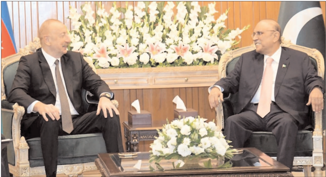
ISLAMABAD: President of Azerbaijan, Ilham Aliyev, called on President Asif Ali Zardari, at Aiwan-e-Sadr.

Vol. XXXIXI No. 169 Regd. No. 241 MUHARRAM 06 1446 -- SATURDAY, JULY 13 2024 PESHAWAR EDITION 12 PAGES PRICE. 30