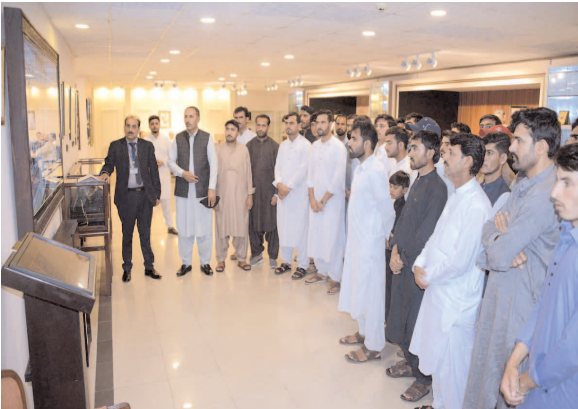
ISLAMABAD: Students and faculty members of government boys degree college Harnai visiting Senate Museum at Parliament House.

ISLAMABAD (APP): Department of Computer Science, Allama Iqbal Open University on Friday organized the "Open House 2024," where final year BS (Computer Science) students showcased their projects addressing societal needs. A total of 77 students participated, presenting 27 projects. These included a gas leakage detection project, a rural emporium (e-commerce platform), a system for cleaning and protecting wheat from pests, a battery-powered modern wheat harvesting machine, a PC watch tower, and a 3D driving tutor, among others. The exhibition was inaugurated by the Dean of the Faculty of Sciences, Professor Dr. Hajra Ahmed. On this occasion, Dr. Hajra inspected all the projects, and the students gave presentations and demonstrated their projects. Dr. Hajra stated that all these projects were useful and aligned with today's societal needs. She mentioned that the students' projects demonstrated that they possessed ample talent. Dr. Saleem Iqbal mentioned that under the guidance of Vice-Chancellor, Professor Dr. Nasir Mahmood, they organized this event to showcase the students' projects with the primary aim of informing market.