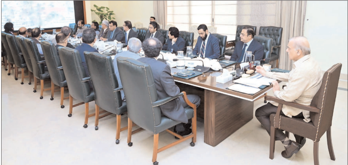
ISLAMABAD: Prime Minister Shehbaz Sharif chairing a meeting on restructuring of Wheat Board and matter related to PASSCO.