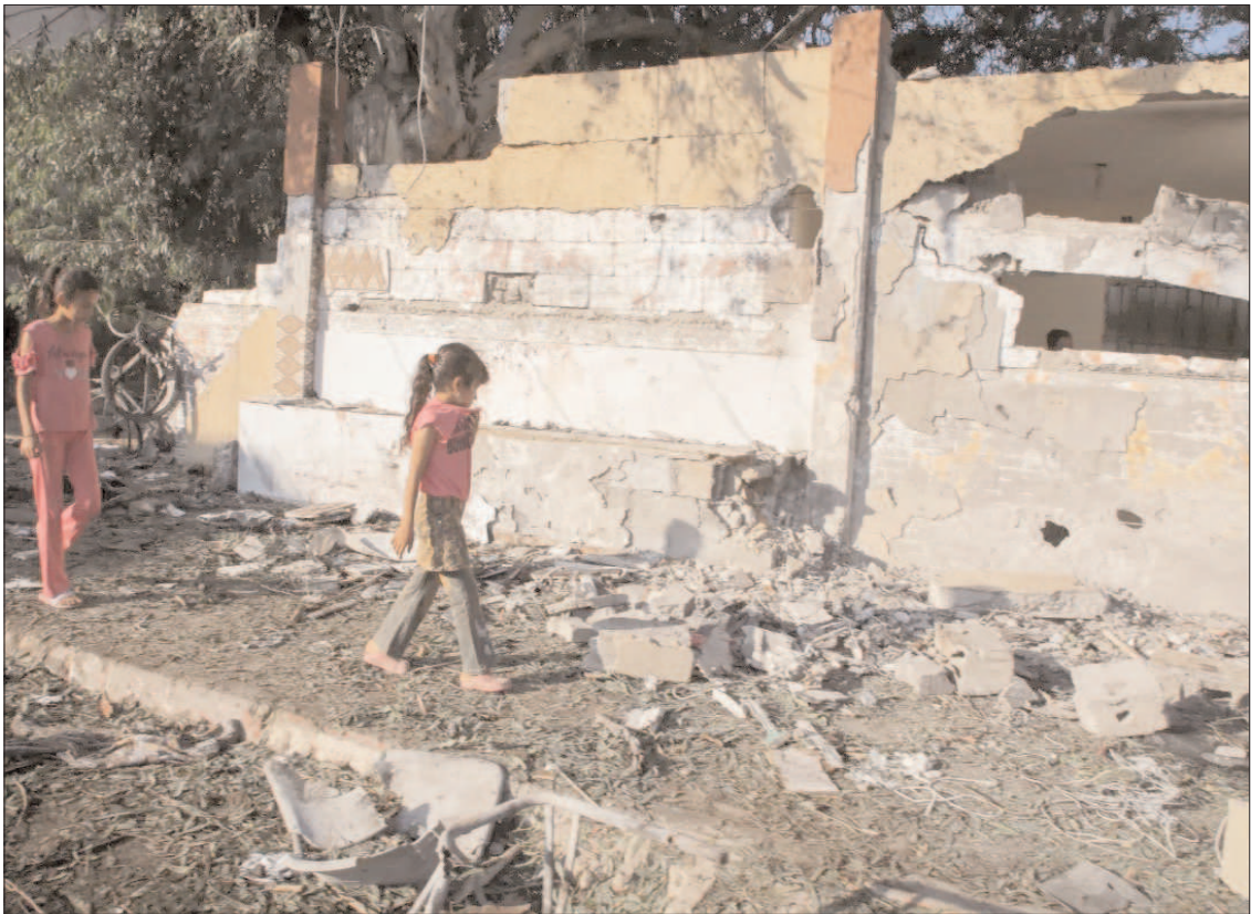
GAZA: Palestinian girls walk past the school hit by an Israeli strike in Khan Younis.