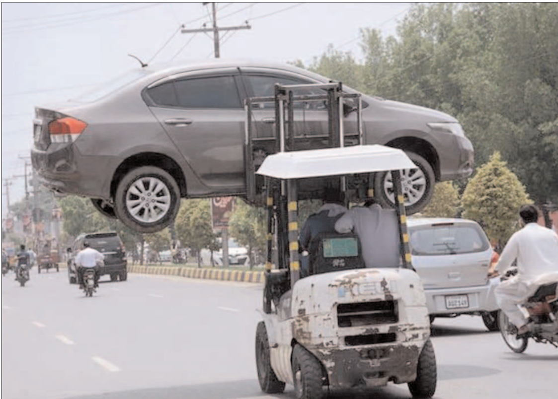
FAISALABAD: A traffic warden moving an illegally parked car with the help of lifter.

BAHAWALPUR: Provincial Minister for Irrigation Muhammad Kazim Ali Pirzada presided over a meeting held in the committee room of the Commissioner's Office. The meeting reviewed the steps taken regarding the arrangements for Muharram Majalis and processions in the Bahawalpur Division. The Provincial Minister emphasized ensuring full-proof security arrangements for Muharram processions and gatherings in different locations. It was directed to ensure the cleanliness of routes for processions and Majalis and the availability of other facilities. Various officials including Commissioner Bahawalpur Division Nadir Chatha, Regional Police Officer Rai Babar Saeed, Additional Commissioners, Deputy Commissioners, DPOs, and officers from relevant departments were present at the meeting. Commissioner Bahawalpur Division mentioned the importance of cleanliness and better arrangements of Muharram procession routes, along with the active participation of officers and staff from various departments. The meeting was informed that all arrangements for 1409 Majalis and 514 processions in Bahawalpur Division are complete. Moreover, during the Ashura of Muharram, over 17,000 police personnel will perform their duties, and from the 7th to 10th of Muharram, army and rangers companies will also be assigned security duty.