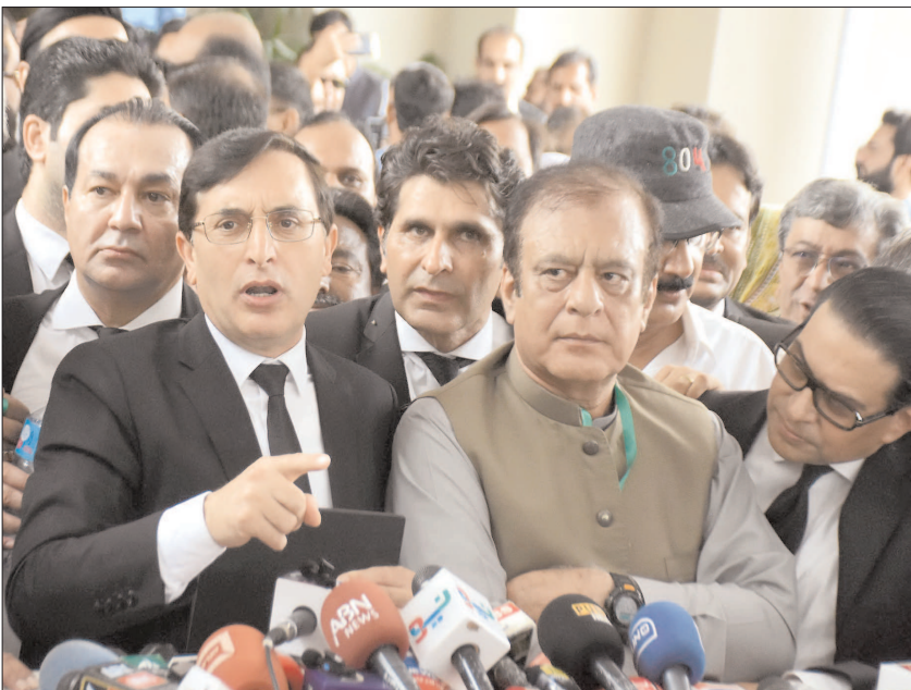
ISLAMABAD: Chairman of Pakistan Tehreek-e-Insaf Gohar Ali Khan talking to media persons outside Supreme Court.

The military said it responded with air and ground strikes after five rockets were fired from the area toward Israel on Thursday. The military separately acknowledged Thursday it had "failed" to protect Kibbutz Beeri, where more than 100 people died during Hamas's October 7 attacks. A summary of the inquiry, made public after being presented to kibbutz residents, said there had been a "lack of coordination" in the military response.