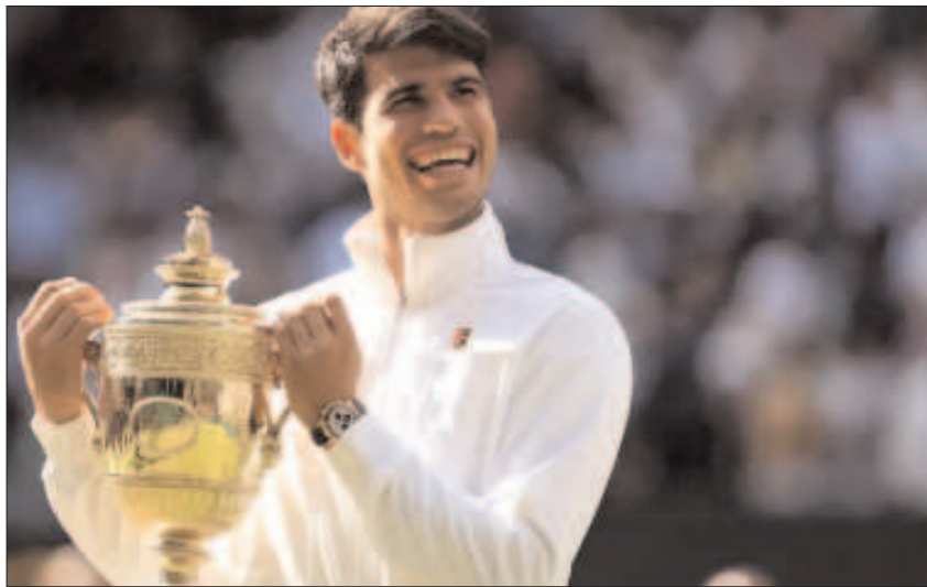
LONDON: Carlos Alcaraz with his Wimbledon Tennis Championship trophy.

"I am making good progress, but as anyone going through chemotherapy will know, there are good days and bad days.