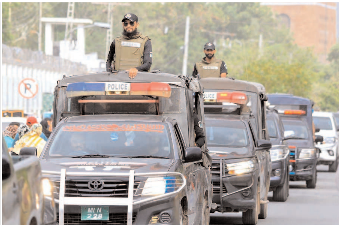
MULTAN: Security officials holding a flag march to develop a sense of protection among masses and maintain law and order.