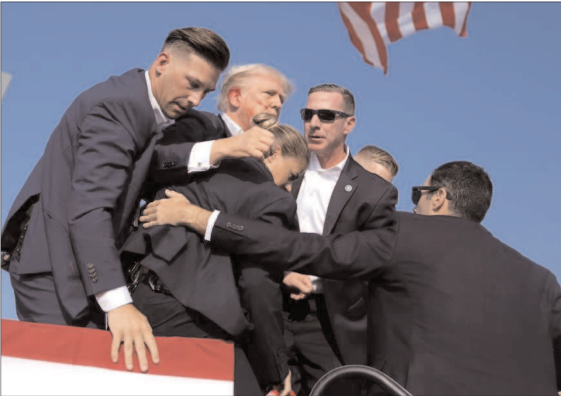
PENNSYLVANIA: Republican presidential candidate and former President Donald Trump is surrounded by US Secrete Service agents at a campaign rally after he was shot injured.

"My heart is with the former President, those injured, and the family of the spectator killed in this horrific attack," Garland said in a statement. "We will not tolerate violence of any kind, and violence like this is an attack on our democracy."