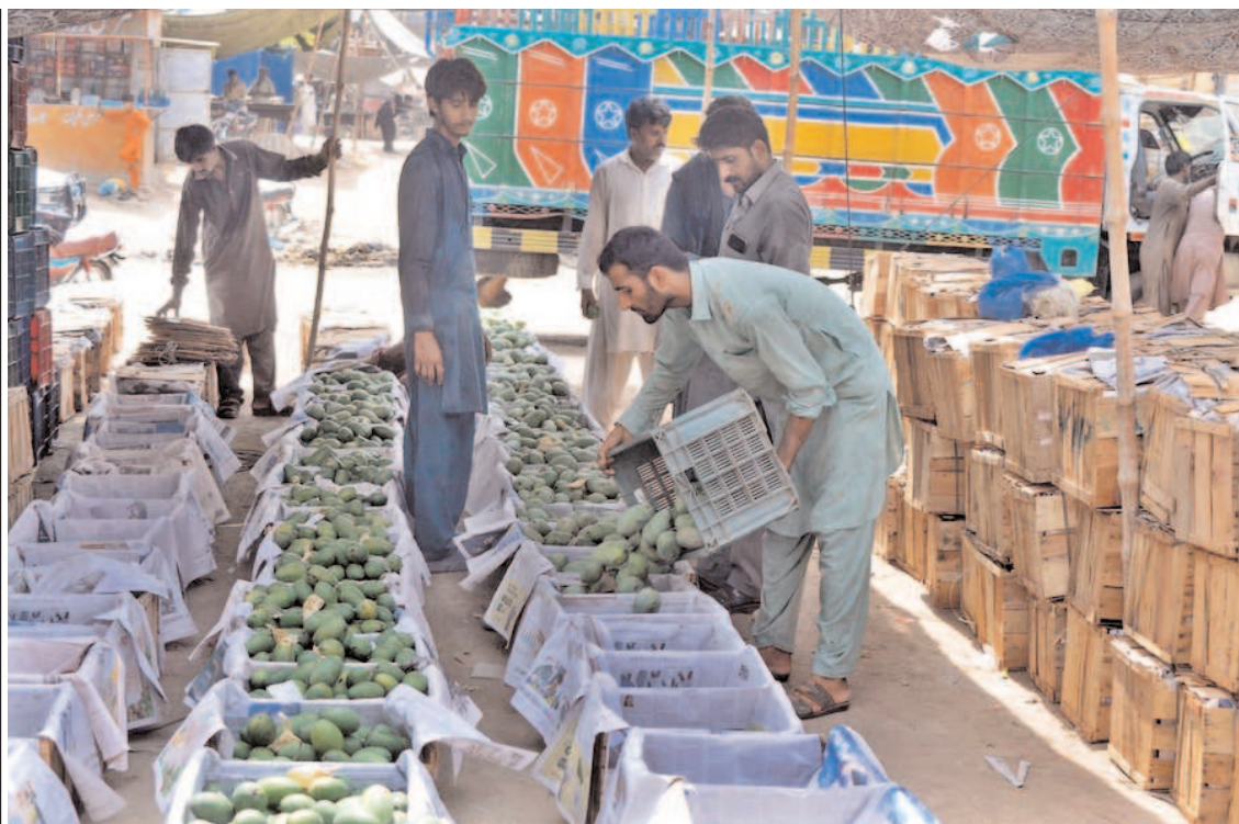
MULTAN: Labourers packing seasonal fruit mangoes in wooden box to deliver in market.

The country could save Rs5,400 billion only with change of currency in the agreement, instead of Take or Pay contract. The government is suggested to revoke the practice of capacity payment based on 'Take or Pay' with the owners of IPPs. The report also claimed that the IPPs' owners showed extra cost to get extra tariff at the time of the contract, with NEPRA failing to check the veracity of cost. The cost of the power plant prepared by the companies was also accepted by the authorities, it further reveals.