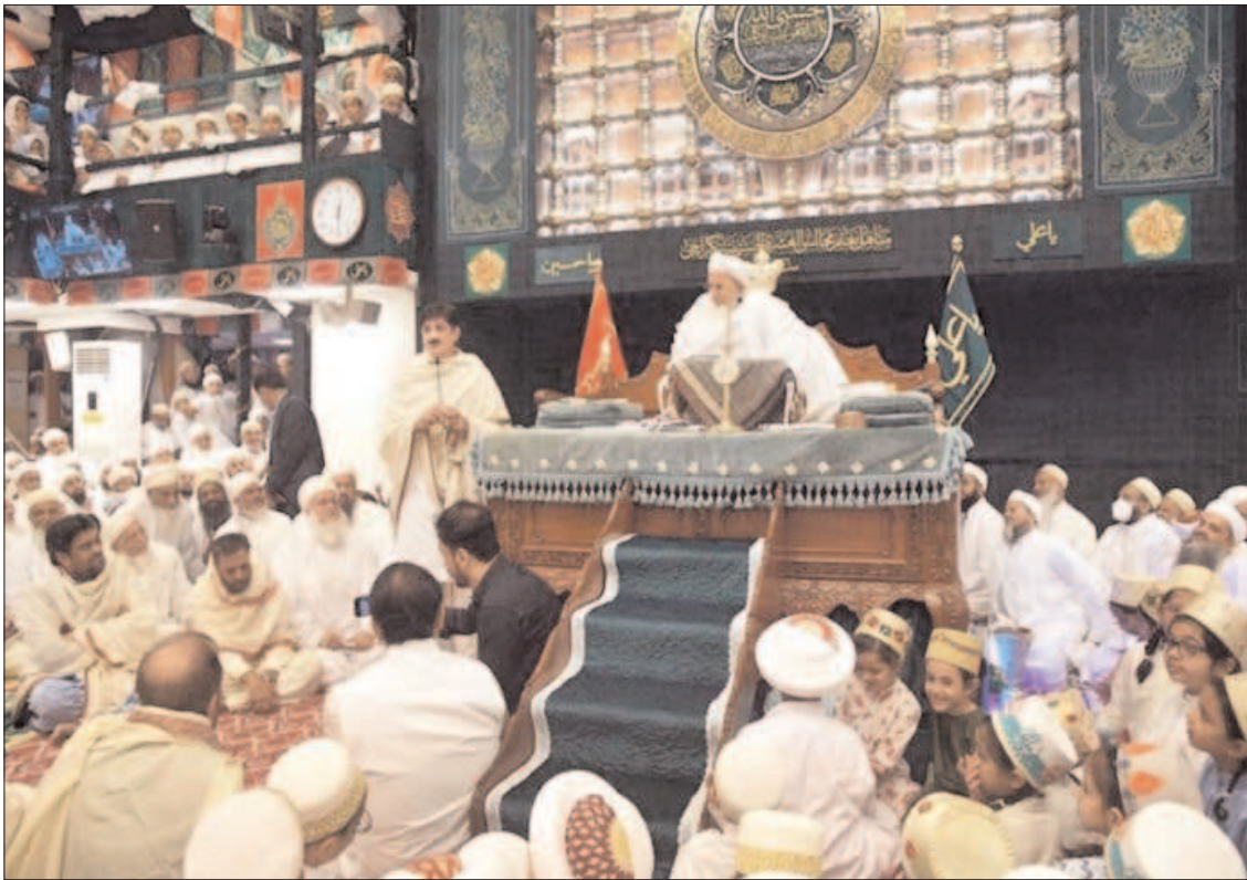
KARACHI: Sindh Chief Minister Syed Murad Ali Shah joins the Bohra community at Taheri Masjid to hear the sermon of Syedna Mufaddal Saifuddin, the spiritual leader of the Bohra community.