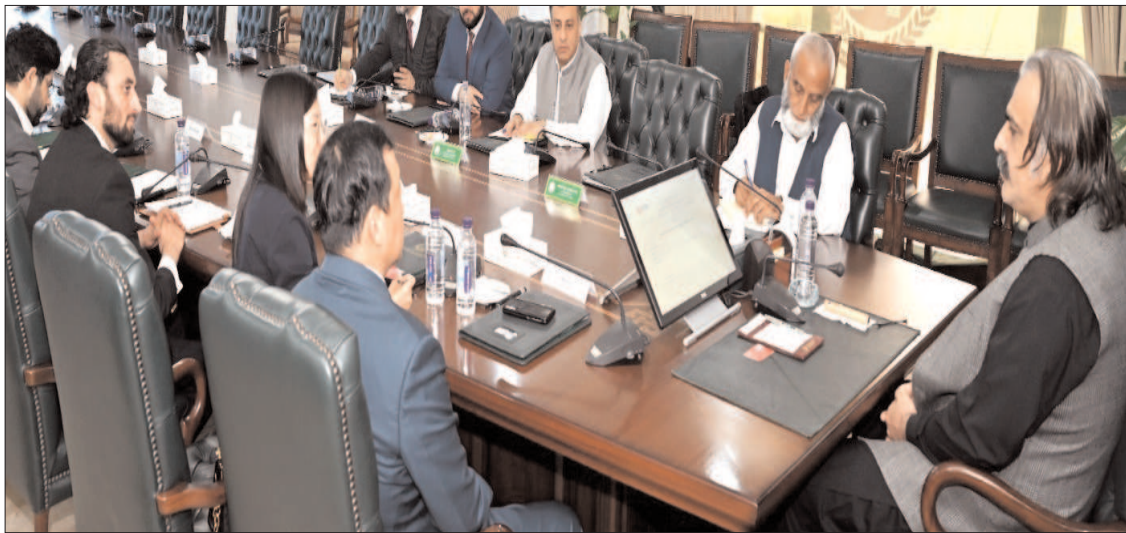
PESHAWAR: Chief Minister Khyber Pakhtunkhwa Sardar Ali Amin Khan Gandapur meeting a delegation of Chinese private sector Investment Company at Chief Minister's House Peshawar.