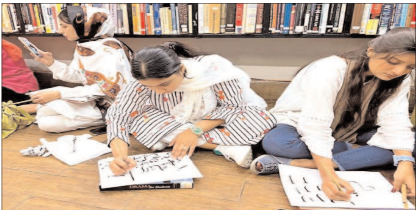
LAHORE: Female students participating in calligraphy workshop at The Book Studio organized by The Knowledge of Art Academy.

CM Maryam Nawaz Sharif appealed to citizens to support the government in its efforts for resolving a serious and hazardous issue of smog. She urged to undertake maximum plantation along with mitigating smoke emission from the vehicles and factories. CM Maryam Nawaz Sharif exhorted to reduce the usage of plastic and refrain from burning the crops stubble and residue.