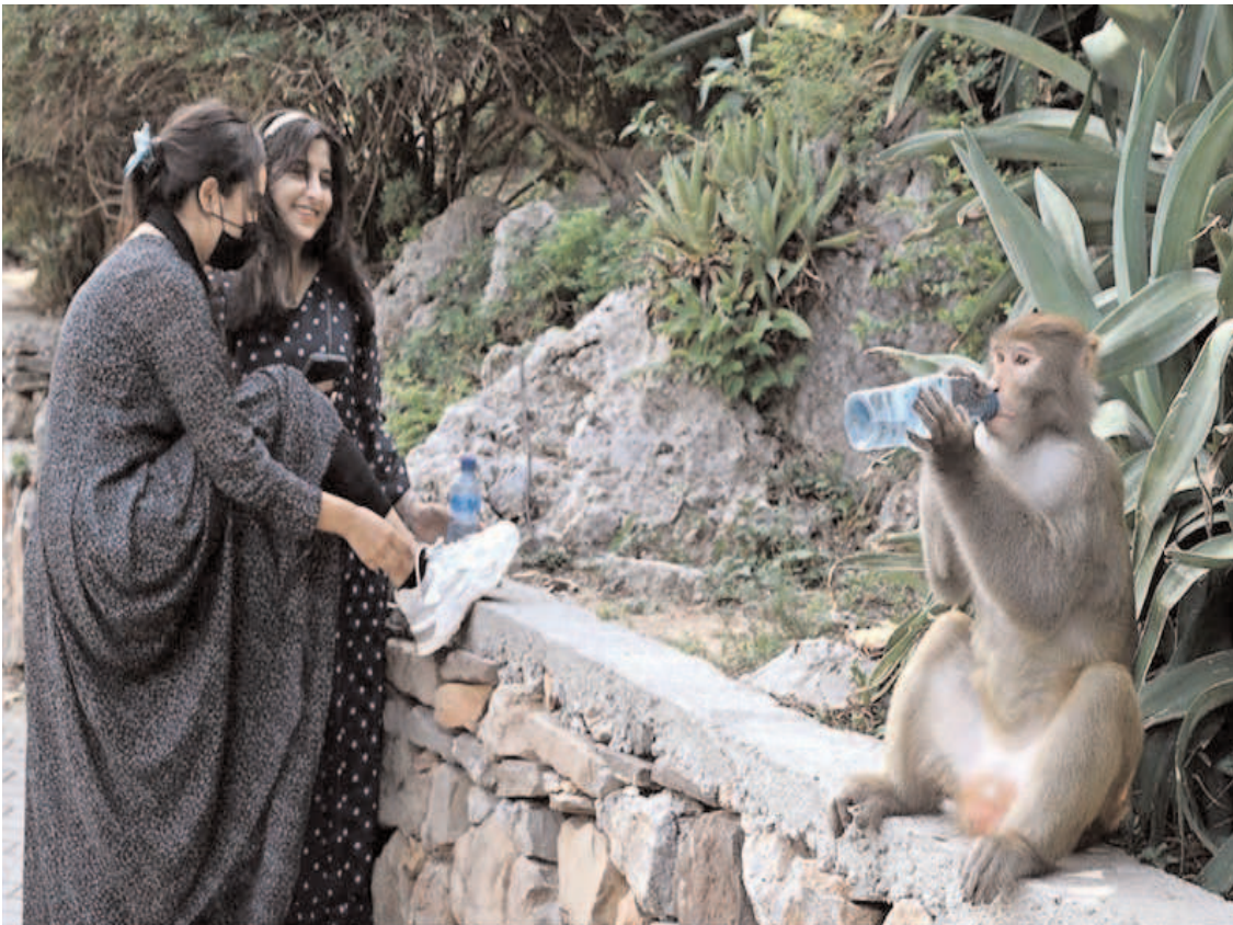
ISLAMABAD: A monkey is drinking water through water bottle that take from girl at famous picnic point Daman-e-Koh.