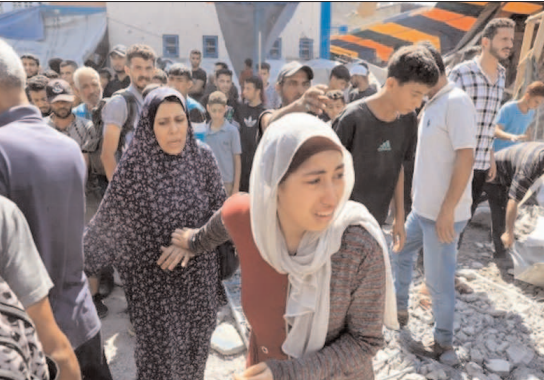
GAZA: A Palestinian woman reacts after Israel's military bombed UN-run Abu Oreiban school-turned-shelter.

Shells rained down on the neighborhoods of Tal Al-Hawa, Sheikh Ajlin and