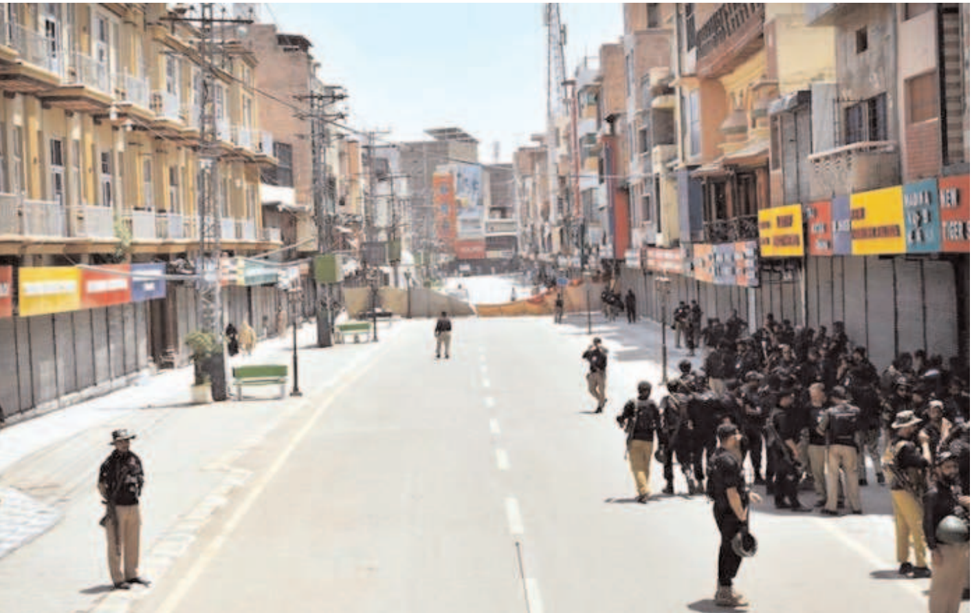
PESHAWAR: A view of Qissa Khawani Bazaar closed for Muharram procession.

PESHAWAR (APP): Police on Monday arrested four accused including a wanted Afghan ring-leader of an international drugs supply gang during a raid in Tadjabad area here. Police said, a team of Pishakhara police raided a house in Tadjabad area and unearthed a heroin producing factory. Four accused were arrested from the factory. The arrested accused were involved in supplying drugs to Dubai, Afghanistan and other countries. During the intelligence-based raid, police also recovered 60 kilograms of heroin from the factory, police said, adding that a most wanted Afghan drug dealer was among the four accused arrested from the factory. Police also recovered 24kg of chemicals used in manufacturing of heroin and later shifted the accused and recovered items to the police station for further investigation.