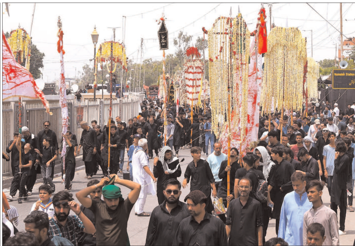
KARACHI: Pakistani Shiite Muslims attend the Muharram procession during the Muslim holy month of Muharram.

Similarly, under the health insurance scheme, police personnel will be given Rs 10 lakh each for medical treatment. The Safe City Project has been launched to ensure the safety of the city.