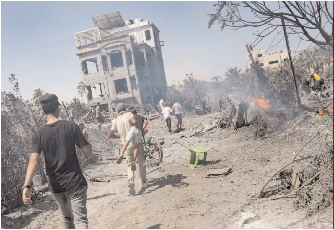
WEST BANK: Palestinians evacuate from the site hit by Israeli bombardment in the al-Mawasi camp.