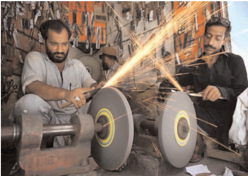
PESHAWAR: Blacksmith busy in sharpening knives to be used during the procession of Muharram at Kohati area.