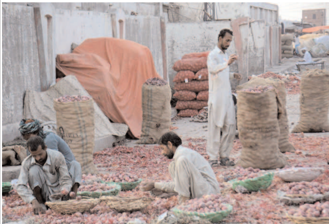
LAHORE: Focused on quality: Laborers sort and pack high-quality onions to deliver in market at the provincial capital's vegetable market.

The Vice President of SCCI also addressed the attendees, highlighting Sialkot as the industrial hub of Pakistan.