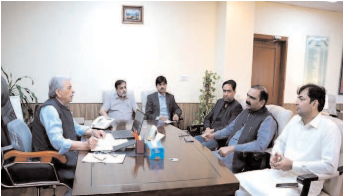
ISLAMABAD: A delegation of the Pakistan Cotton Ginners Association, called on the Federal Minister for National Food Security and Research.