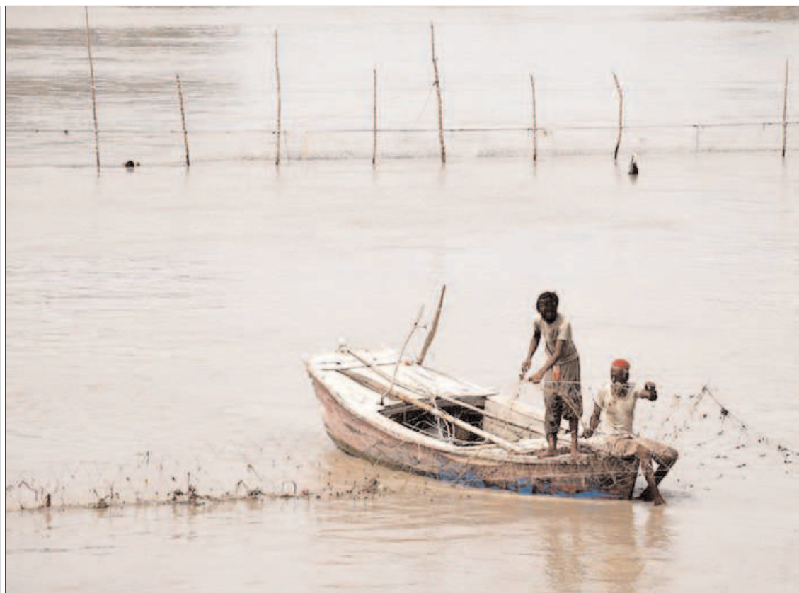
LARKANA: Fishermen setting net for catching fishes at Rice Canal.

BS level admissions in the departments of English, Computer Science, Management Sciences and Psychology for Fall Semester 2024 have also started in Temergarh, Pabbi Campuses and University College for Women of the University. Online system for submission of admission form has been introduced for the convenience of students seeking admissions where students can register themselves and send admissions online.