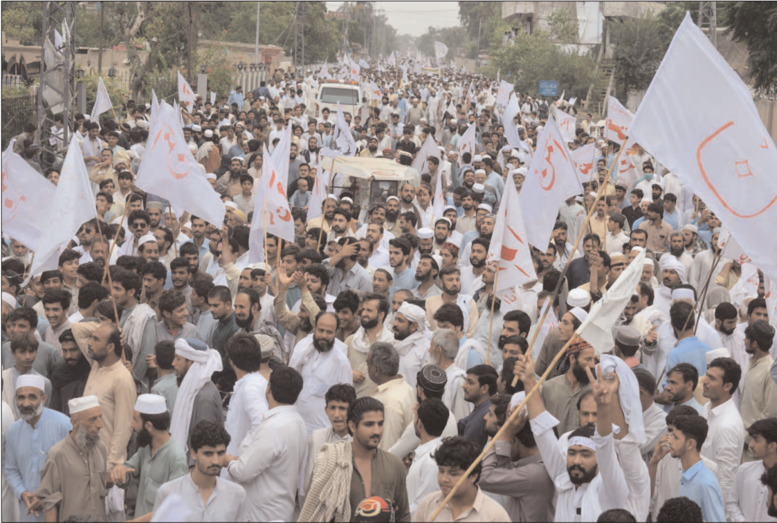
BANNU: A large numbers of people holding white flags during Aman March.