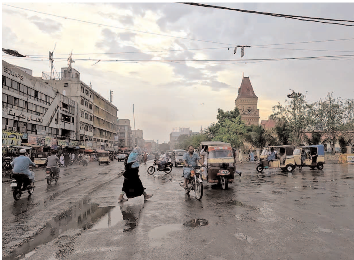
KARACHI: A view of rainy weather in provincial capital.

The CM directed Minister Energy to prepare proposals for Solar Parks and Solar Home Systems so that one of both proposals could be discussed and approved. Meanwhile, the CM directed the chief secretary to collect data for SHS consumers from the data. "This will help to make decisions."