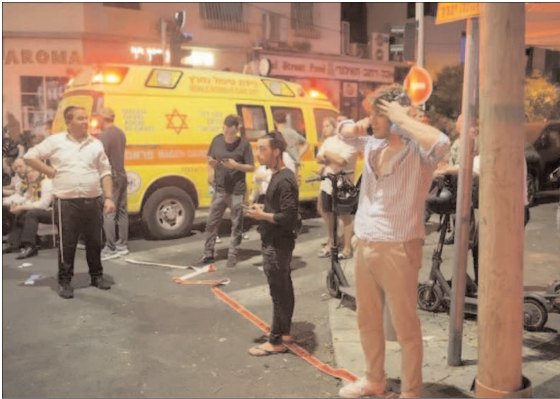
TEL AVIV: People gathered at the scene of a deadly explosion in Israel.