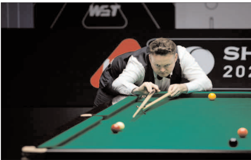
SHANGHAI: Shaun Murphy of England plays a shot in the Semifinal match against Mark Selby of England on day 5 of World Snooker Shanghai Masters.

month in Barbados. The match was also Rahul Dravid's last as head coach and Gambhir was handed the job last week to build on the team's World Cup win. Suryakumar, who previously captained Mumbai in domestic cricket, last year led India to a 4-1 T20 series win over Australia and followed it up with a 1-1 result in South Africa. T20I squad: Suryakumar Yadav (capt), Shubman Gill (vice-capt), Yashasvi Jaiswal, Rinku Singh, Riyan Parag, Rishabh Pant (wk), Sanju Samson (wk), Hardik Pandya, Shivam Dube, Axar Patel, Washington Sundar, Ravi Bishnoi, Arshdeep Singh, Khaleel Ahmed, Mohammed Siraj. ODI squad: Rohit Sharma (capt), Shubman Gill (vice-capt), Virat Kohli, KL Rahul (wk), Rishabh Pant (wk), Shreyas Iyer, Shivam Dube, Kuldeep Yadav, Mohammed Siraj, Washington Sundar, Arshdeep Singh, Riyan Parag, Axar Patel, Khaleel Ahmed, Harshit Rana.