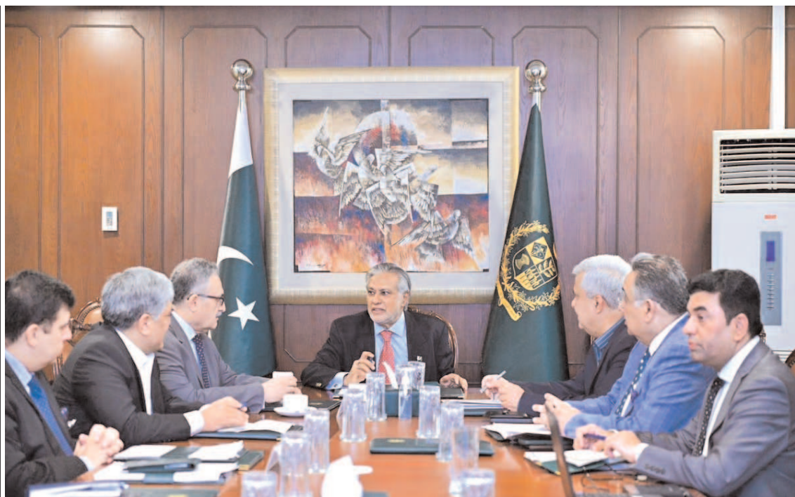
ISLAMABAD: Deputy Prime Minister and Foreign Minister Senator Mohammad Ishaq Dar, chairs high level meeting on the welfare of overseas Pakistanis.

Assistant Commissioners in their respective areas conducted a surprise inspections and got arrested 12 individuals involved in 64 profiteering activities while a fine totaling Rs 200,000 was also imposed. The district administration officers are currently mobilized in the field to enforce stringent measures against hoarding and ensure availability.