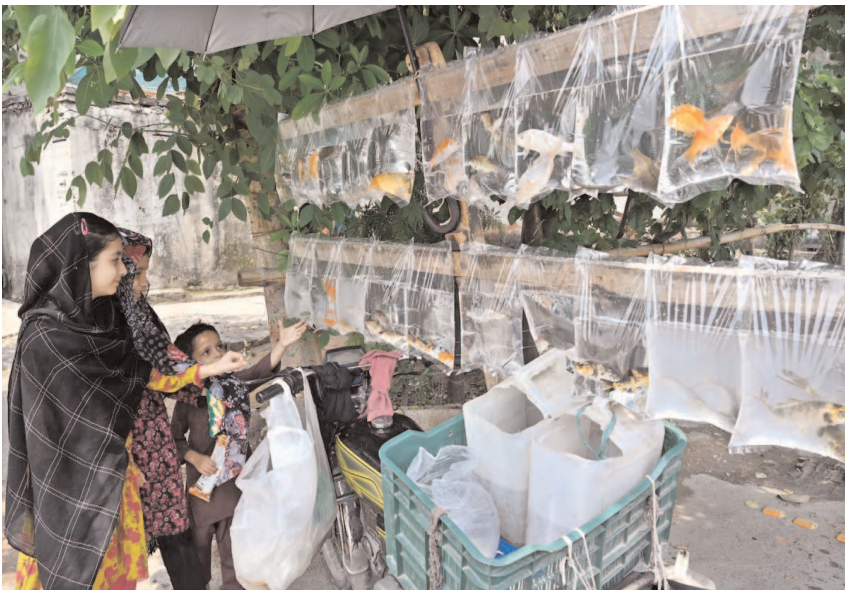
ISLAMABAD: Girls keenly watching colorful fish displayed by vendor at roadside in the Federal Capital.