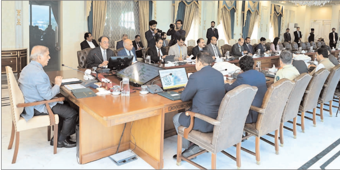
ISLAMABAD: Prime Minister Shehbaz Sharif chairing a meeting on increase in investment and capacity of federal government ministries.