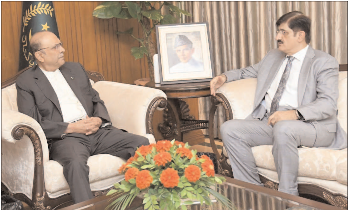
ISLAMABAD: Chief Minister Sindh, Syed Murad Ali Shah, called on President Asif Ali Zardari, at Aiwan-i-Sadr.

Three terrorists detected F.P. Report RAWALPINDI: Movement of three terrorists, trying to infiltrate Pakistan-Afghanistan border, was detected by security forces in Dir. The infiltrators were surrounded, effectively engaged and after an intense fire exchange, all three terrorists were sent to hell. Pakistan has consistently been asking Interim Afghan Government to ensure effective border management on their side of border.