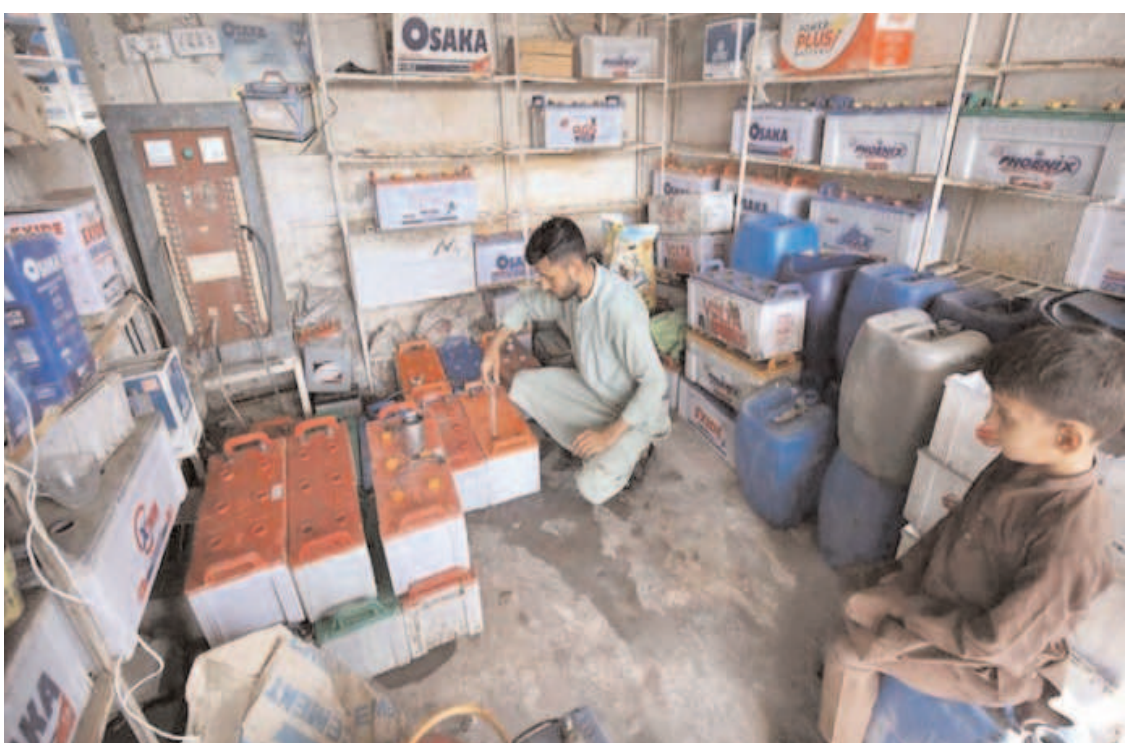
PESHAWAR: Vendor verifies UPS battery acid levels before sale at Shobha Bazar at Shobha bazar.