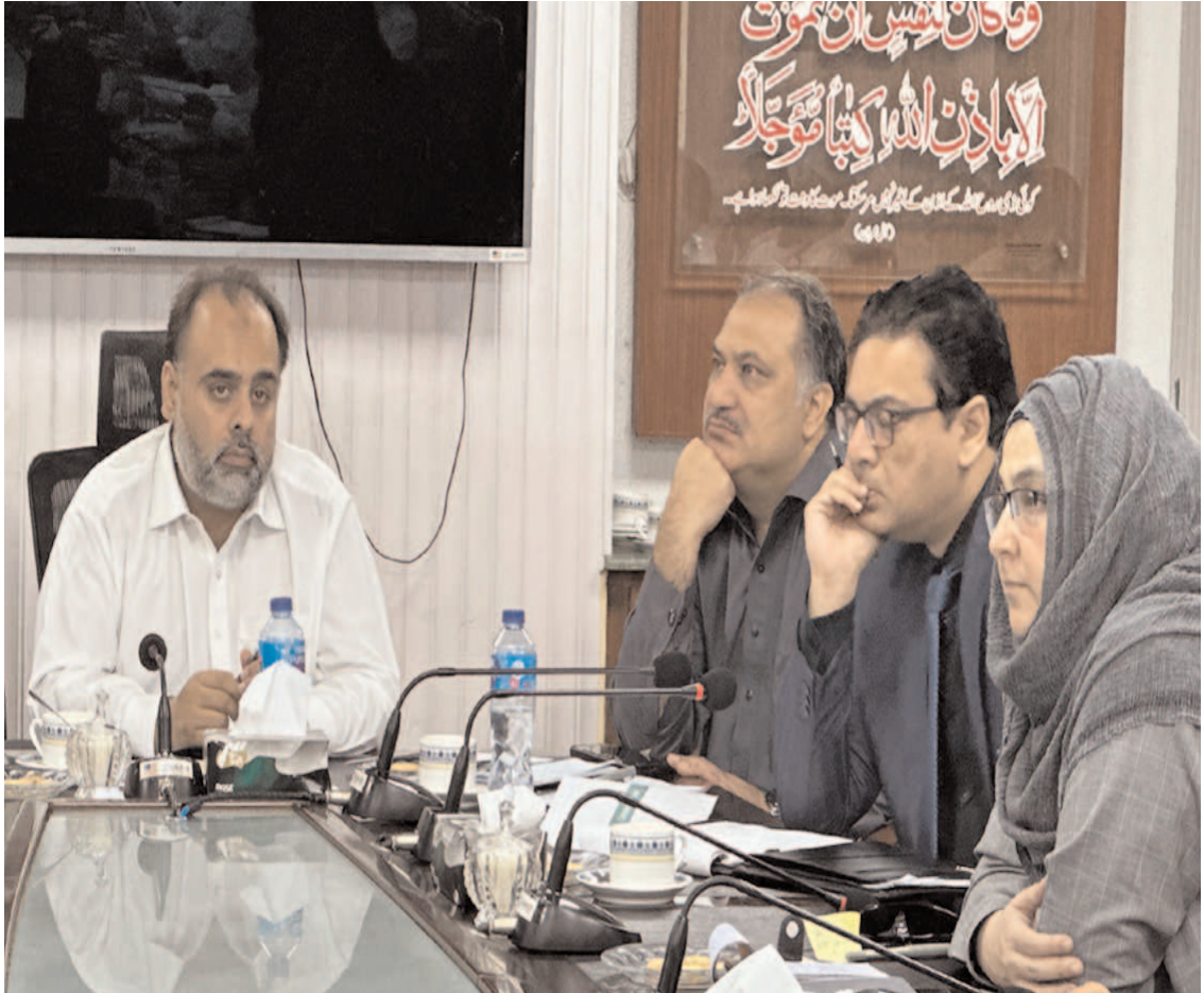
PESHAWAR: Provincial Minister for Health Syed Qasim Ali Shah presiding over a meeting on Dengue situation in province.