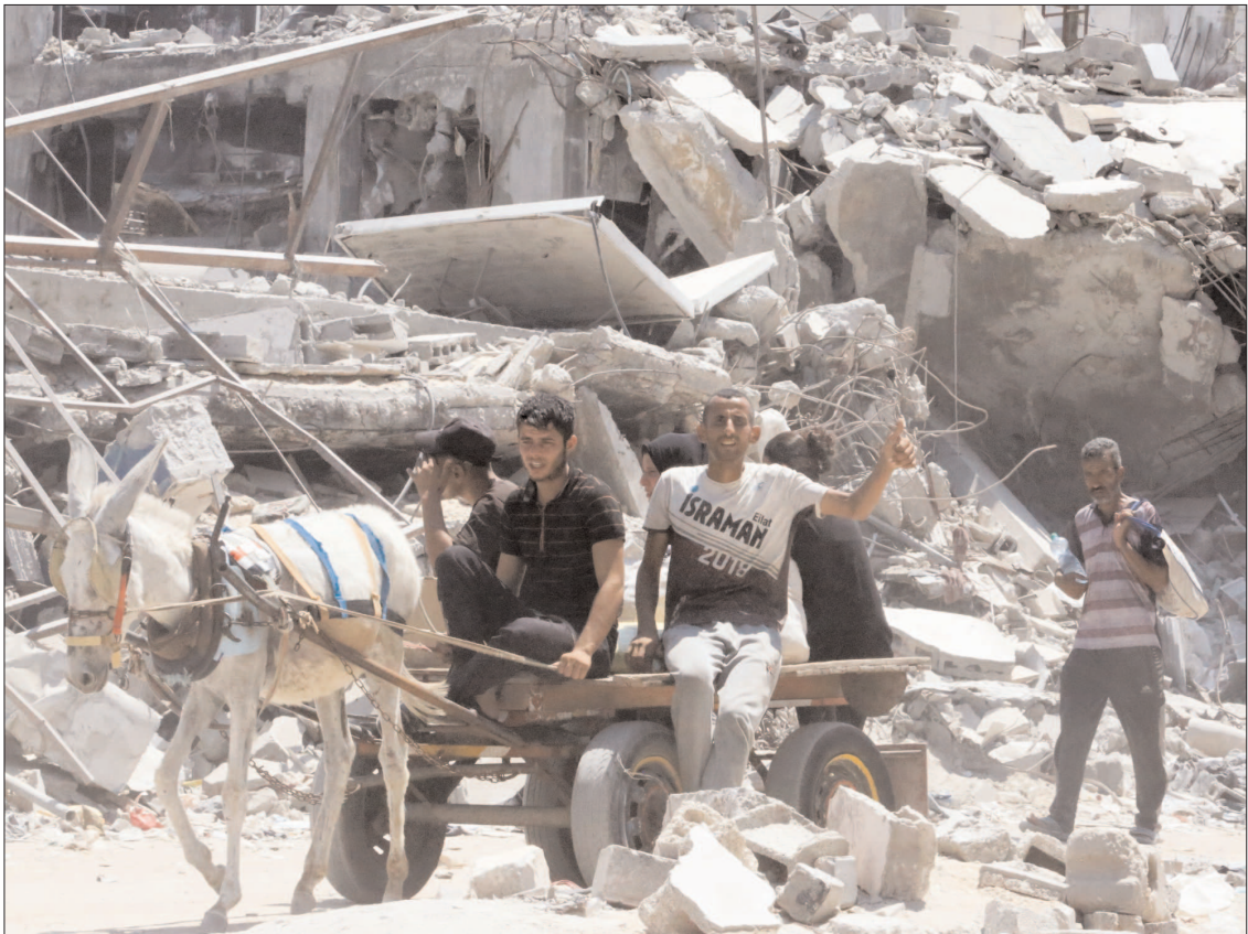
GAZA: A Palestinian family going towards their destination near destroyed building in Khan Younis.