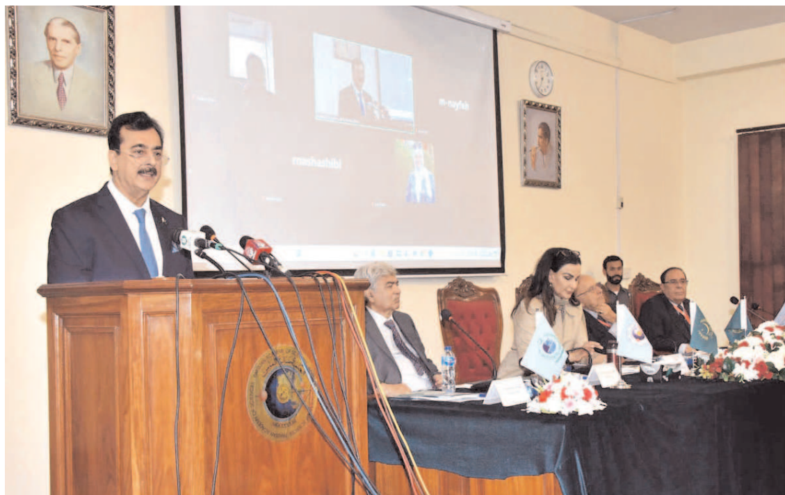
ISLAMABAD: Chairman Senate Yousuf Raza Gilani addresses as chief guest at 25th conference of the Islamic World Academy of Sciences (IAS) in Federal Capital.

The Al-Shifa President said that over the last 30 years, the trust has treated 30 million patients free of charge at Rs 13 billion including thousands of surgeries for glaucoma, retina, and cancer, he added.