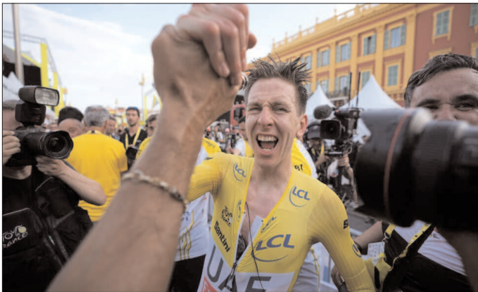
Belgian Eddy Merckx.

At the worlds in September in Zurich, the Slovenian is aiming for a triple of the world title, the Giro and Tour, only held by two men, Ireland's Stephen Roche and