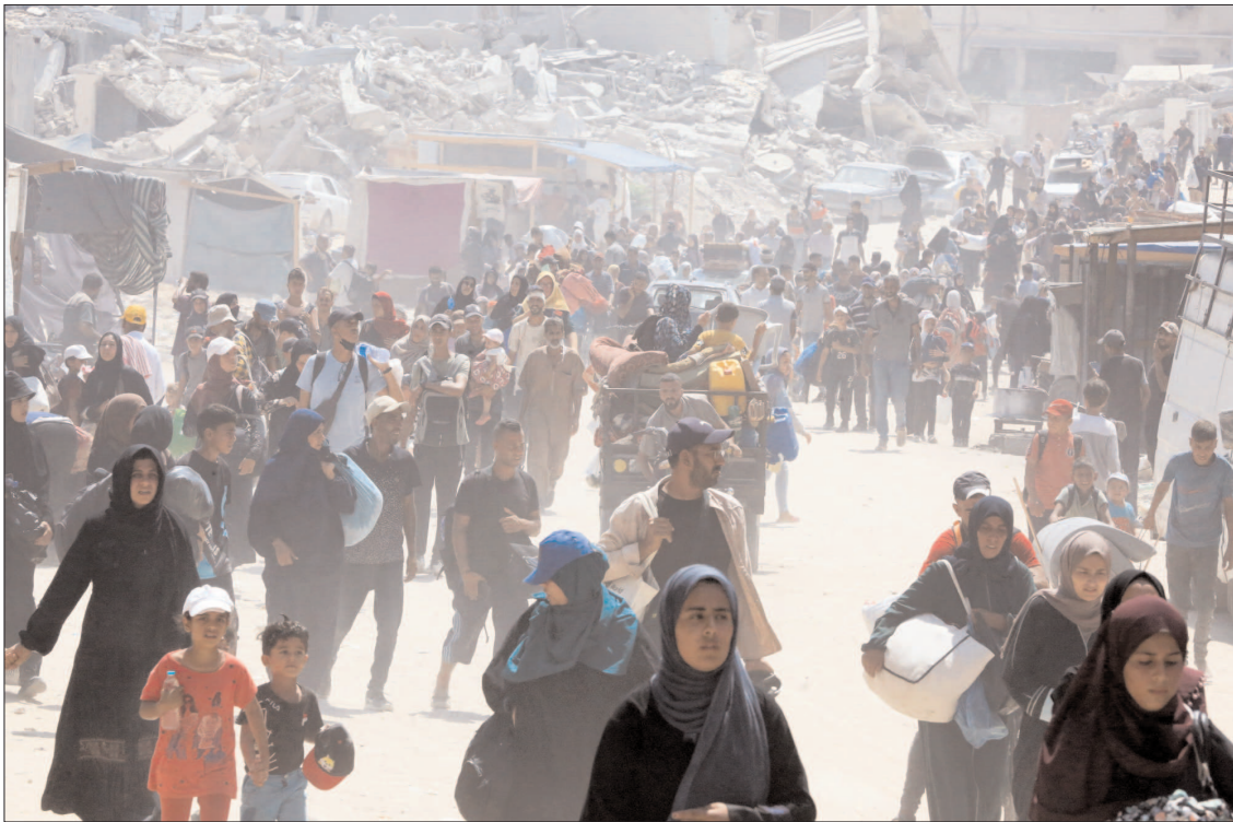
GAZA: Palestinians flee the eastern part of Khan Younis. Nearly the entire population of 2.3 million is now displaced as Israelis bombardment continue.