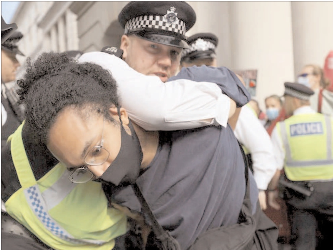
LONDON: A Police officer removing a protester from outside the Foreign, Commonwealth and Development Office as members of 'Workers for a Free Palestine' gathered in a protest against arms exports to Israel, in Britain.

Vol. XXXIXI No. 180 Regd. No. 241 MUHARRAM 18 1446 -- THURSDAY, JULY 25 2024 PESHAWAR EDITION 12 PAGES PRICE. 30