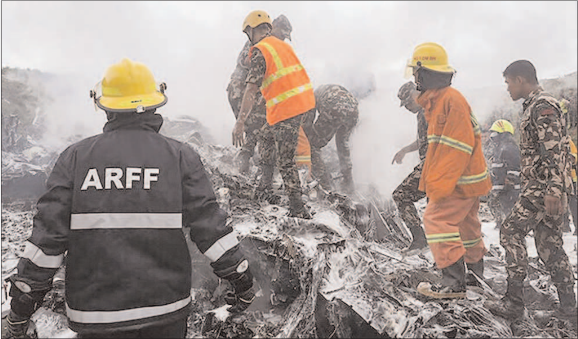
KATHMANDU: Rescuers and army personnel stand at the site after a Saurya Airlines' plane crashed during takeoff at Tribhuvan International Airport in Nepal.