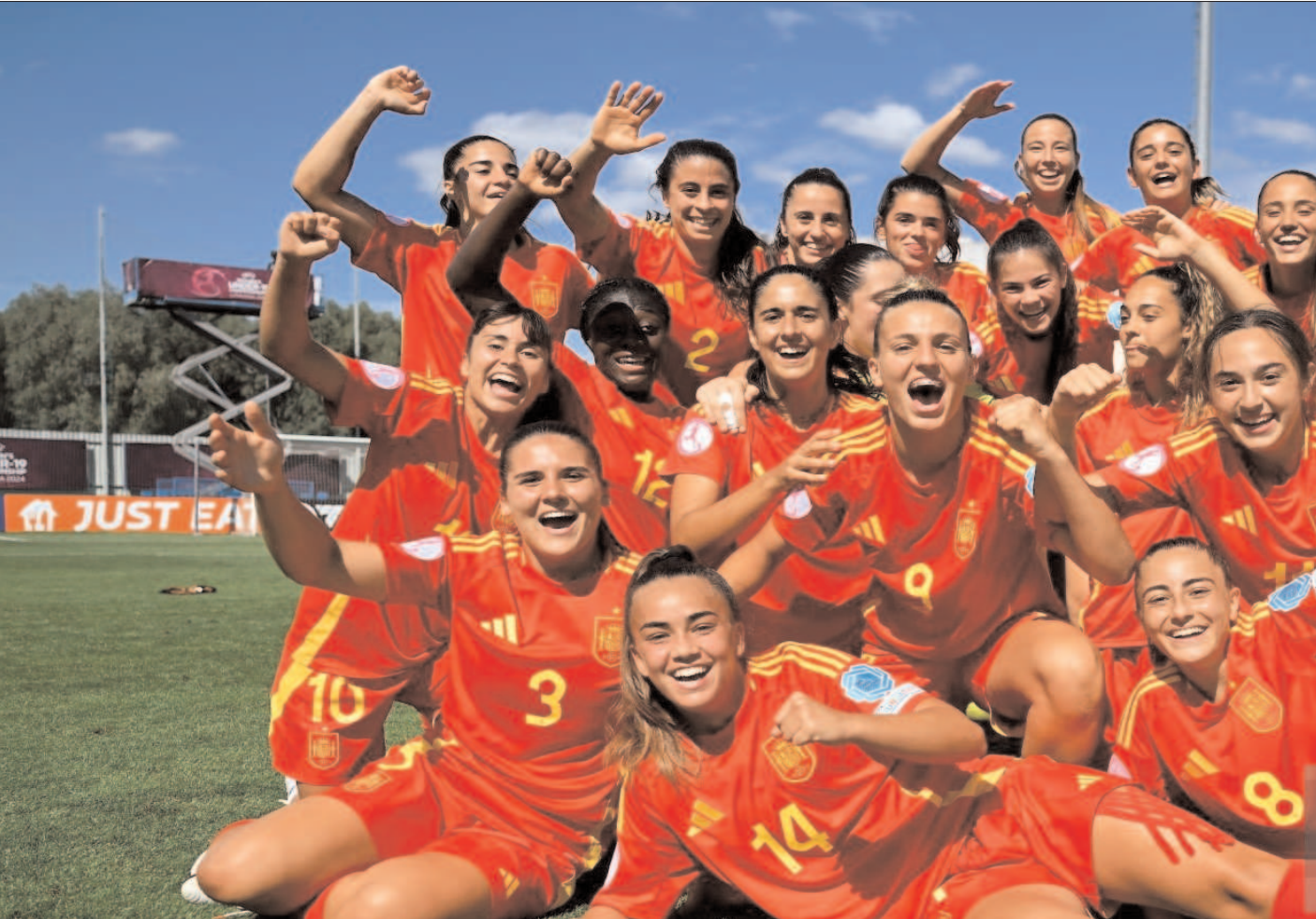
MARIJAMPOL, LITHUANIA: Spain players celebrate after their side's victory in the UEFA Women's Under-19 Championship 2023/2024 Semi-Final match between England and Spain at Futbolo stadionas Marijampolje on July 24, 2024 in Marijampol, Lithuania.

Namibia captain Gerhard Erasmus and Scotland's George Munsey are among those to move up the batting rankings following their performances in the ICC Men's Cricket World Cup League 2. Erasmus is up four places to 27th and Munsey up seven places to 41st position.