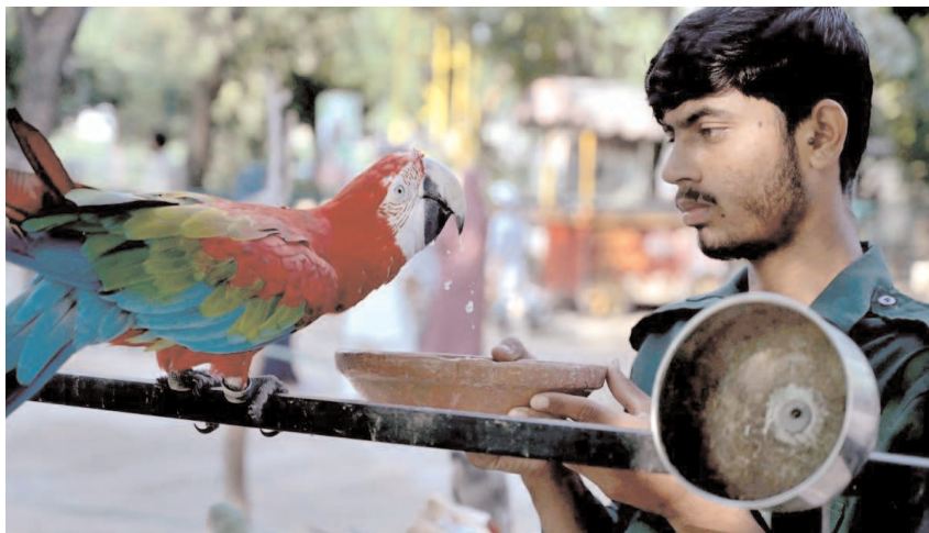
ISLAMABAD: A worker tends to a Macaw parrot during feeding time at Lake View Bird's Aviary.