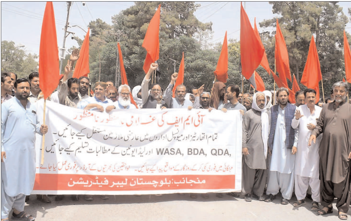
QUETTA: Activists of Balochistan Labour Federation holding a protest rally for acceptance of their demands.

CHAKWAL (INP): A man has been taken into custody after allegedly harassing a 9-year-old girl during a bus journey from Abbottabad to Chakwal. The incident was reported to the Virtual Women Police Station by the girl's mother, who detailed the harassment and provided the bus location.