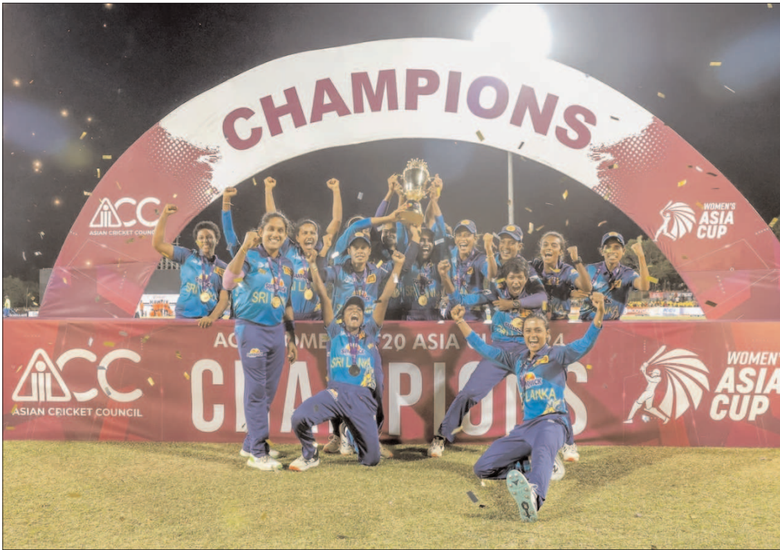
DAMBULLA: Sri Lanka players celebrate with the Asia Cup trophy.