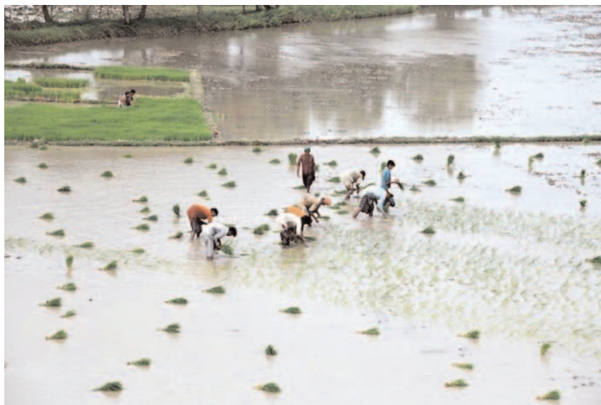
LARKANA: The farmers are busy planting the seedlings of rice crop in their field near the Bypass Road.

Later, the minister inaugurated the Water Supply Scheme by cutting the tap along with the elders of the area.