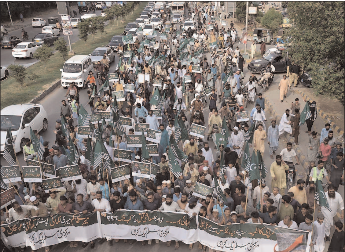
KARACHI: Pakistan Markazi Muslim League supporters holf protest rally against K-Electric.