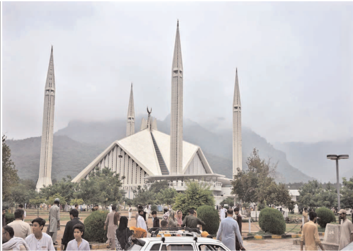
ISLAMABAD: A large number of people visiting famous Faisal Masjid to spend their holiday during cloudy weather in Federal Capital.

PHA would plant more ornamental plants in Murree to enhance the beauty of the hill station, he said and informed that colorful plants would also be planted in Murree.