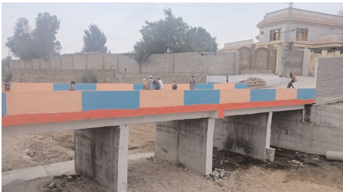
LOWER DIR: Children standing on a newly constructed bridge built by local community in Talash area.