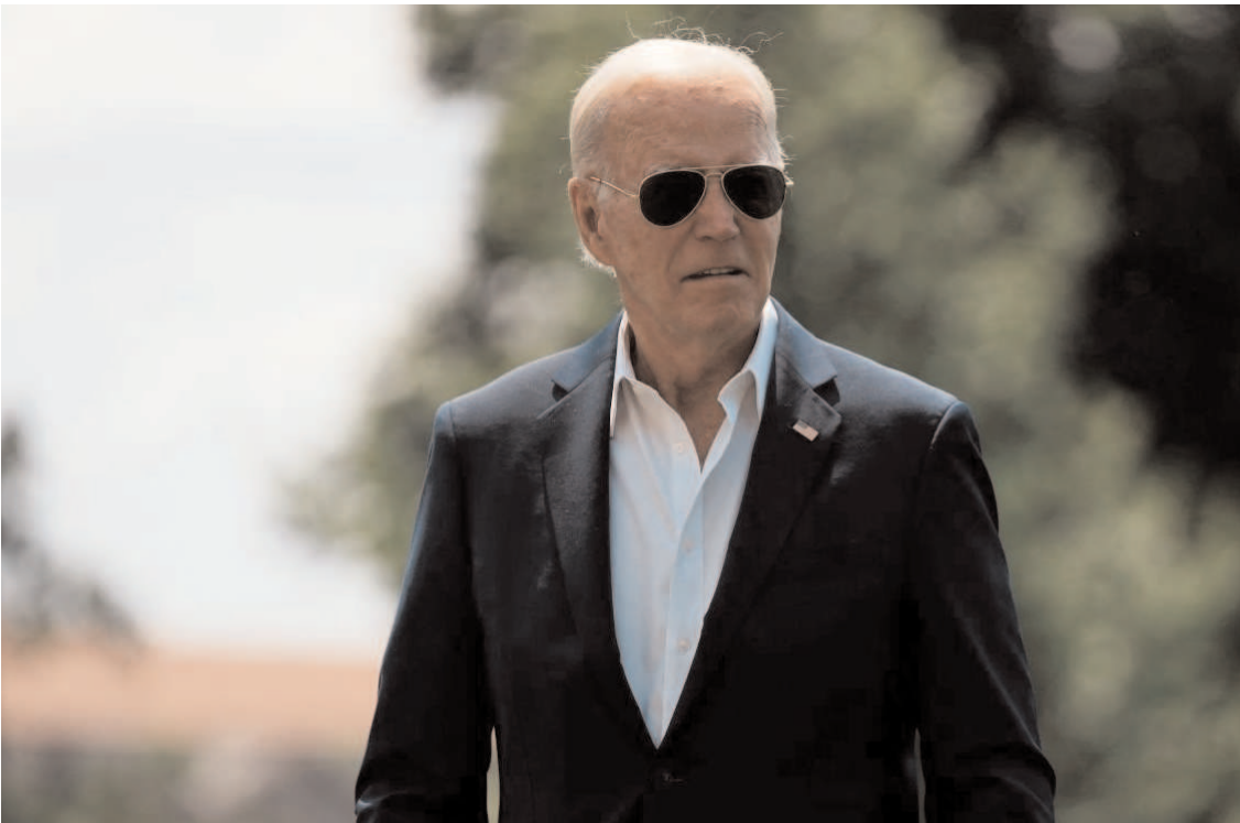
WASHINGTON: US President Joe Biden walks upon arrival at the White House in Washington, DC, on July 28, 2024 as he returns from the Camp David presidential retreat.

The General Authority for the Care of the Prophet’s Mosque seeks to apply globally approved lighting specifications, stemming from the commitment of the Custodian of the Two Holy Mosques, King Salman bin Abdulaziz Al Saud’s government, to improving the services provided by the Prophet’s Mosque.