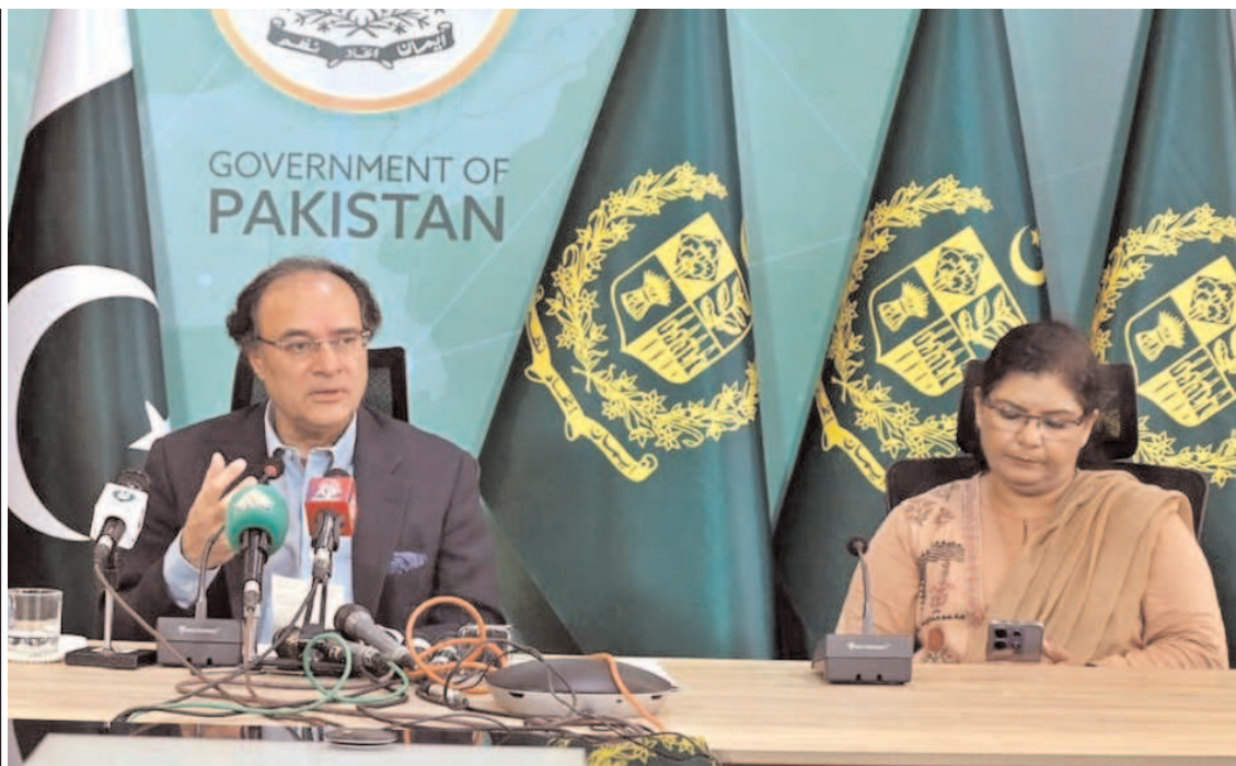
ISLAMABAD: Federal Minister for Finance and Revenue Senator Muhammad Aurangzeb addressing media persons at PTV Headquarters.

of the country have been lost due to delay in decision making in this regard. The PSMA appeals to the government to urgently grant permission of export of verified surplus stocks of 1.2MMT on 15-07-2024, expected to rise to 1.5 million tons by end November, as little time is left in forthcoming crushing season which again is going to be a surplus season and formulate a permanent and inclusive policy on export of surplus sugar so that sugar industry keep contributing foreign exchange to the country's agricultural and national economy.