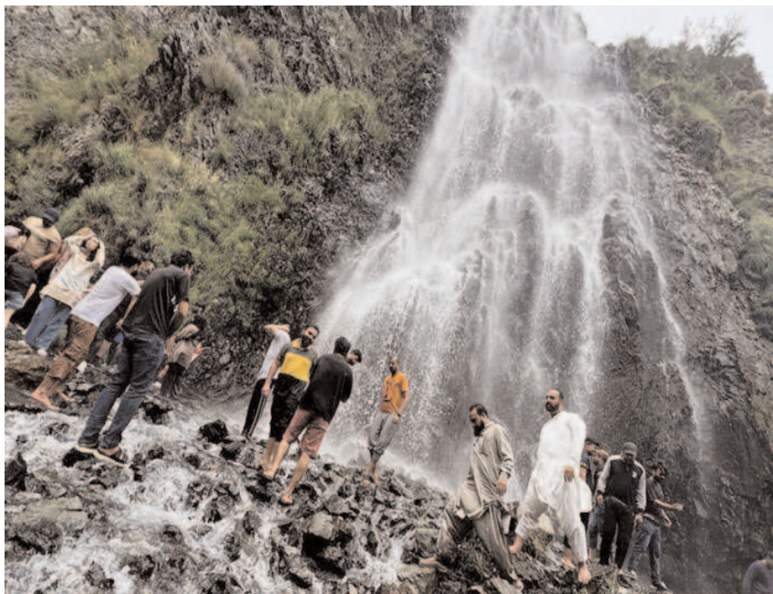
SKARDU: An attractive and eye-catching view of Manthoka Waterfall in Kharmang Valley. This waterfall is 180 feet high from the ground and located almost 80 kilometers away from downtown Skardu.

Khokhar feared that there would be food security issue in future as the farmers would not be able to cultivate wheat. He added that there would be 40 to 50 percent decline in wheat cultivation in upcoming season.