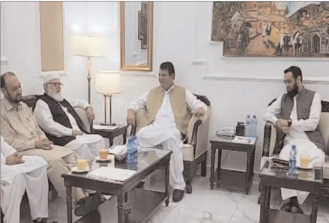
RAWALPINDI: Jamaat-e-Islami delegation meets govt delegation at Rawalpindi Commissioner's office on Sunday.

Officials from the United States, Egypt and Qatar were meeting Sunday with Israeli officials in Rome in the latest push for a deal. The head of Israel's Mossad spy agency, David Barnea, later returned home and negotiations will continue in the coming days, Netanyahu's office said.