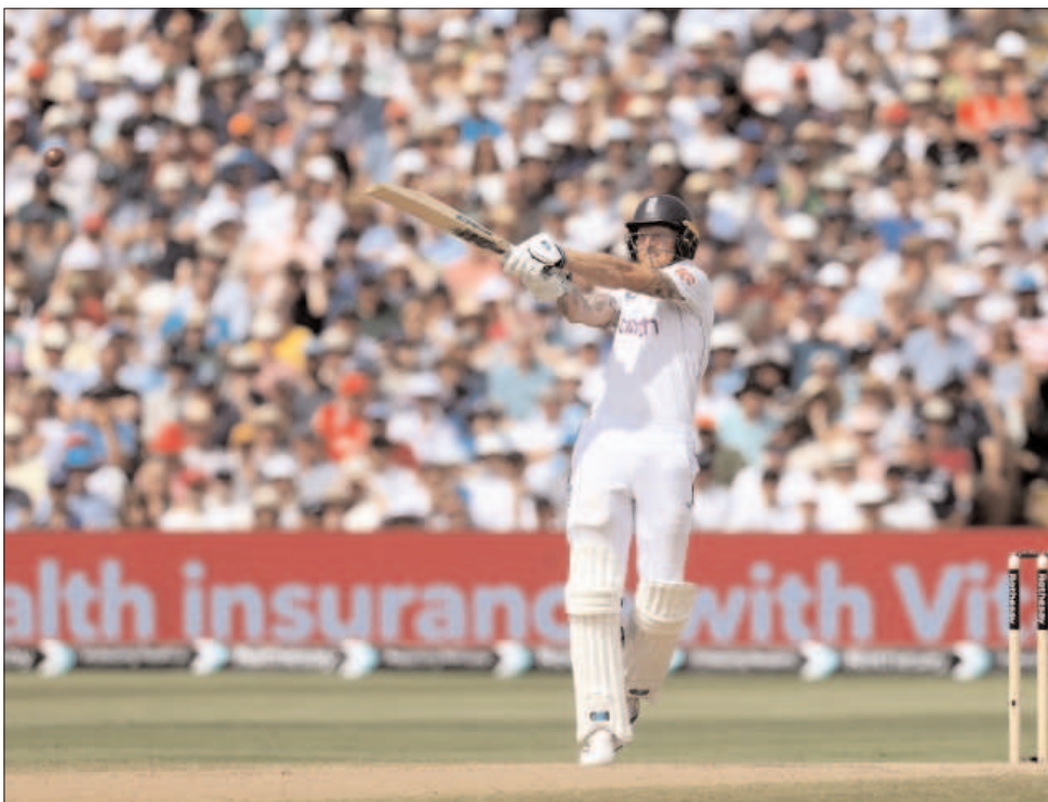
England captain Ben Stokes hammered a 24-ball half-century to take his team to a 3-0 series sweep against the West Indies