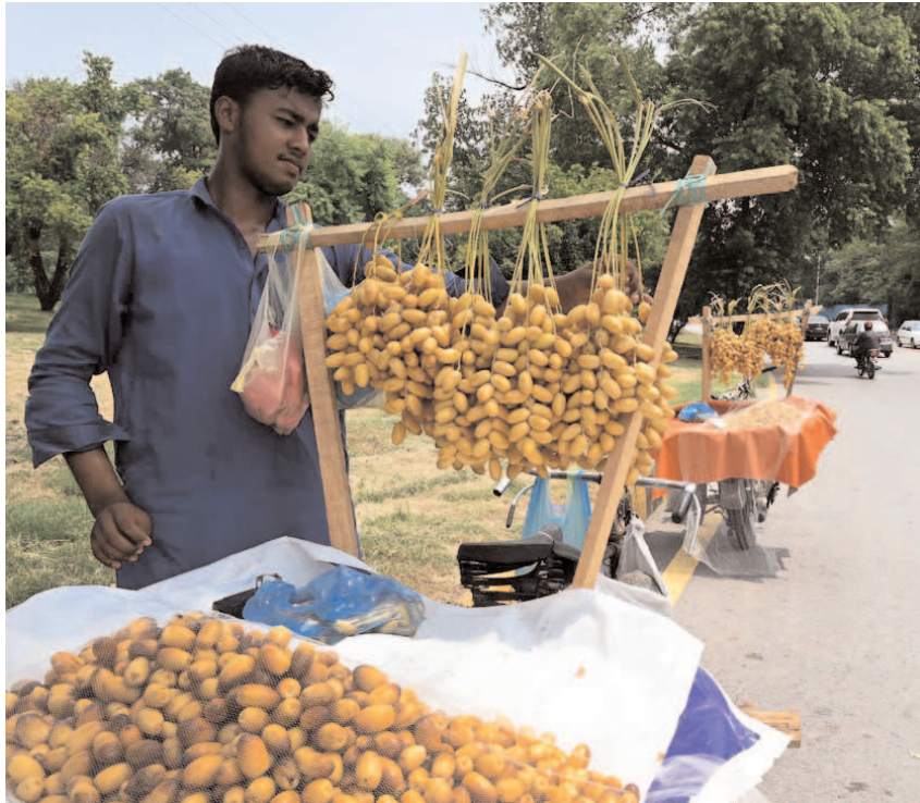
ISLAMABAD: A vendor displaying and selling fresh dates at his road side setup.

In addition, Pakistan's healthcare system faces challenges in providing adequate testing and treatment for hepatitis, said Dr Enshah Ikram at Polyclinic that many people cannot afford the high costs of treatment, and healthcare facilities in rural areas often lack the necessary resources and expertise. By supporting healthcare initiatives and advocating for policy changes, we can improve access to care and treatment for those affected by hepatitis, she added.