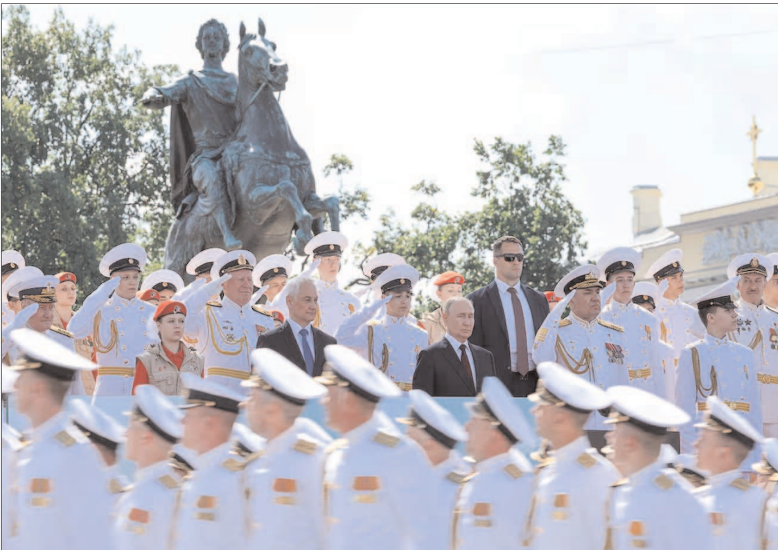
MOSCOW: Russian President Vladimir Putin witnessing Navy Day parade in Saint Petersburg on Sunday.

Trump's fundraising surged when he was convicted in late May on felony charges related to a hush-money payment to a porn star ahead of the 2016 election. An assassination attempt against him this month was also expected to spur campaign contributions.