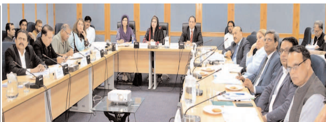
ISLAMABAD: Senator Samina Mumtaz Zehri, Chairperson Senate Functional Committee on Human Rights presiding over a meeting of the committee at Parliament Lodges.

The participants informed the chair about the literary organizations of Rawalpindi-Islamabad and their services. At the conclusion of the meeting, a painting exhibition was inaugurated by the MPA. The exhibition was organized in collaboration with the Punjab Arts Council and Rawalpindi Women University. The young artists were awarded with certificates of appreciation.