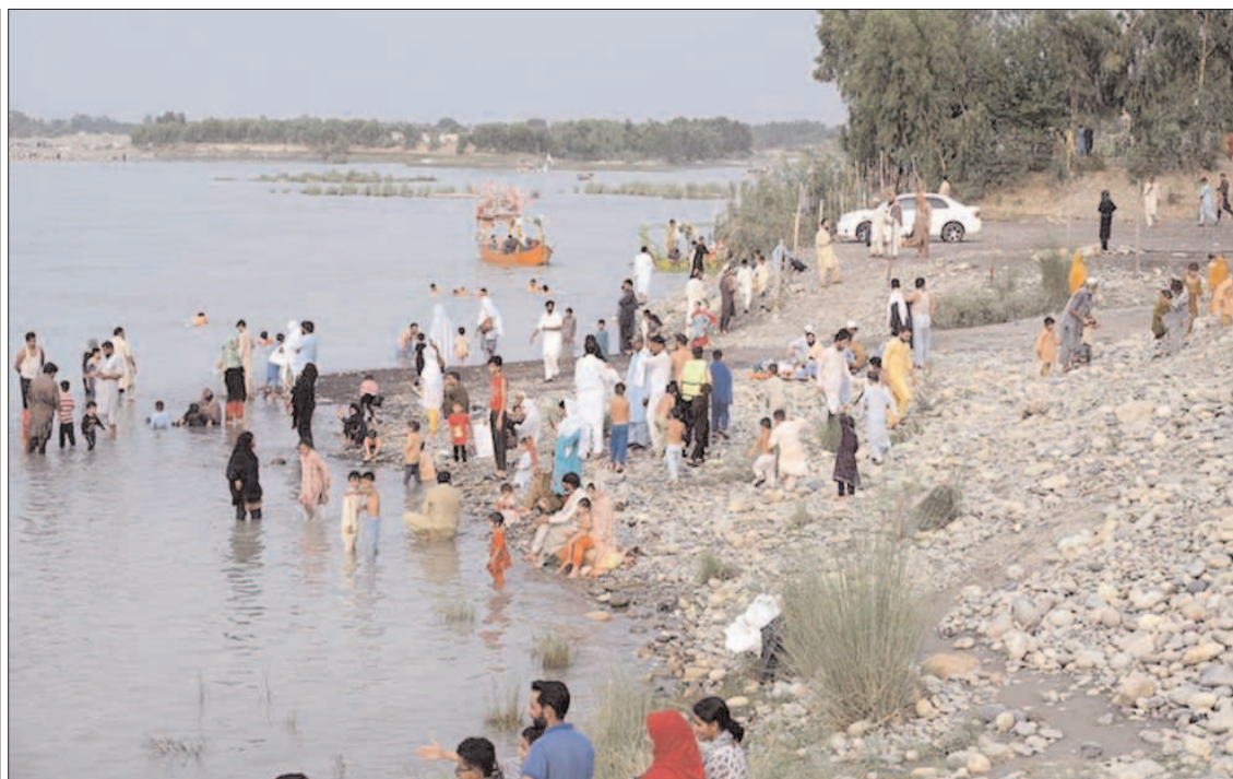
ATTOCK: A large number of people enjoyin at Attock River, Picnic Point.

The accused brutally tortured the abducted youth, made their videos sending them to heirs demanding two million rupees for their release. The police registered separate cases in all incidents at respective police stations and started efforts to arrest the culprits and rescue the abducted youth.