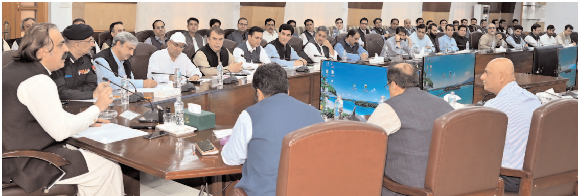
PESHAWAR: Chief Minister Khyber Pakhtunkhwa Ali Amin Khan Gandapur presiding over a meeting of Civil Administrators at Civil Secretariat.