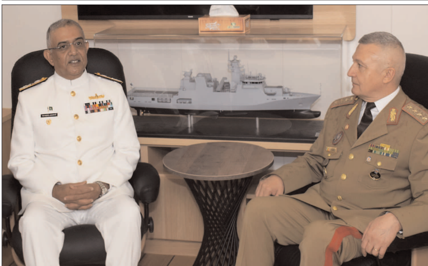
ISLAMABAD: Chief of the Naval Staff Admiral Naveed Ashraf called on Romania's Chief of Defence Staff General Gheorghita Vlad during his official visit to Romania.

Justice Mansoor Ali Shah announced the 8-5 majority verdict, setting aside the Peshawar High Court's (PHC) order wherein it had upheld the Election Commission of Pakistan's (ECP) decision denying the reserved seats to the SIC. Chief Justice of Pakistan (CJP) Qazi Faez Isa, Justice Jamal Mandokhail, Justice Naem Afghan, Justice Yahya Afridi, and Justice Ameenuddin Khan opposed the majority decision.