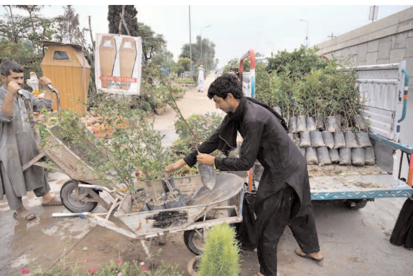
PESHAWAR: Labourers unloading plants from delivery van at local nursery in Hayatabad.