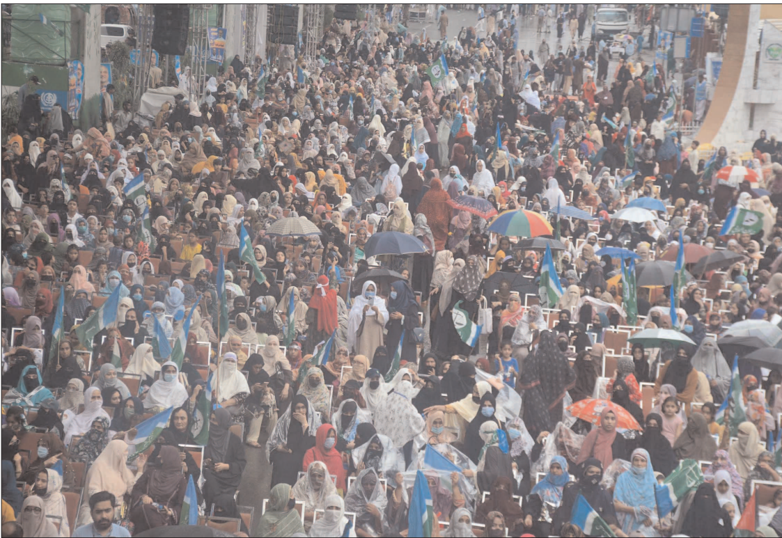
RAWALPINDI: JI sit-in continue against inflated electricity bills in Liaquat Bagh.

Saudi Arabia urged its citizens to "adhere to the decision of not traveling to Lebanon." Royal Jordanian Airlines suspended its flights to Beirut. Turkish Airlines canceled two flights to Beirut. Turkish low-cost carrier SunExpress, Turkish Airlines' AJET, Greece's Aegean Airlines and Ethiopian Airlines also canceled flights.