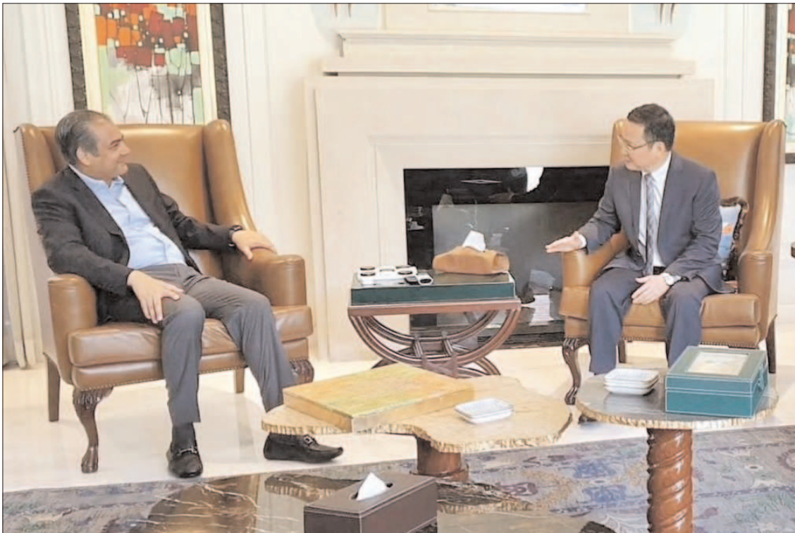
LAHORE: Interior Minister Mohsin Naqvi in a meeting with Chinese Consul General Zhao Shiren.