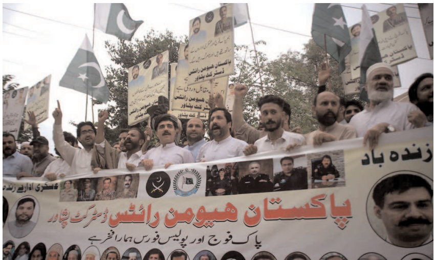
PESHAWAR: Activists of Human Rights Association chanting slogans during a protest rally.