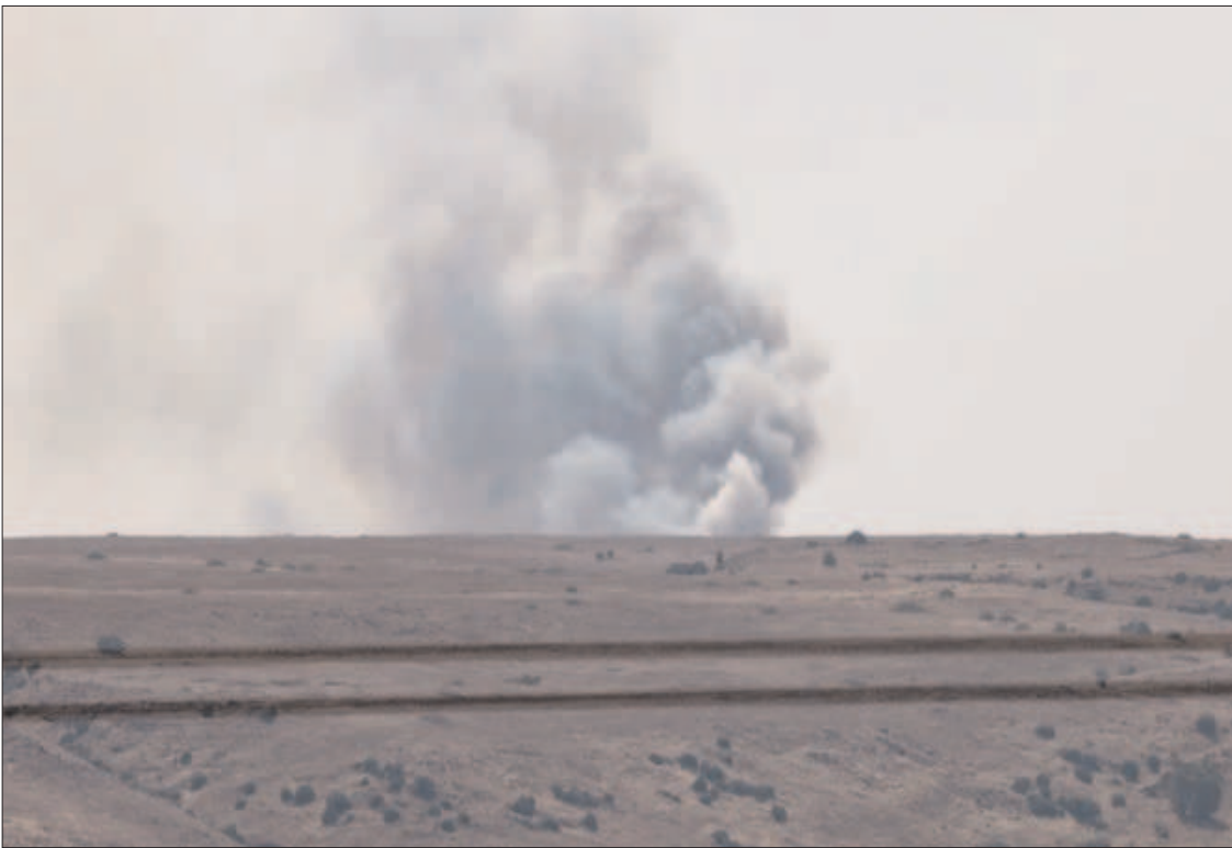
BEIRUT: Smoke billows after a hit from a rocket fired from southern Lebanon over the Upper Galilee region in northern Israel on Thursday.

"Maintaining law and order during the month of Muharram should be the top most priority of all the stakeholders", he said and added that all relevant authorities, departments and agencies would have to fulfill their respective responsibilities well in time for this purpose. Ali Amin Khan Gandapur also appealed to religious leaders as well as general public to play their proactive role in maintaining law and order and promoting sectarian harmony during the month of Muharram.