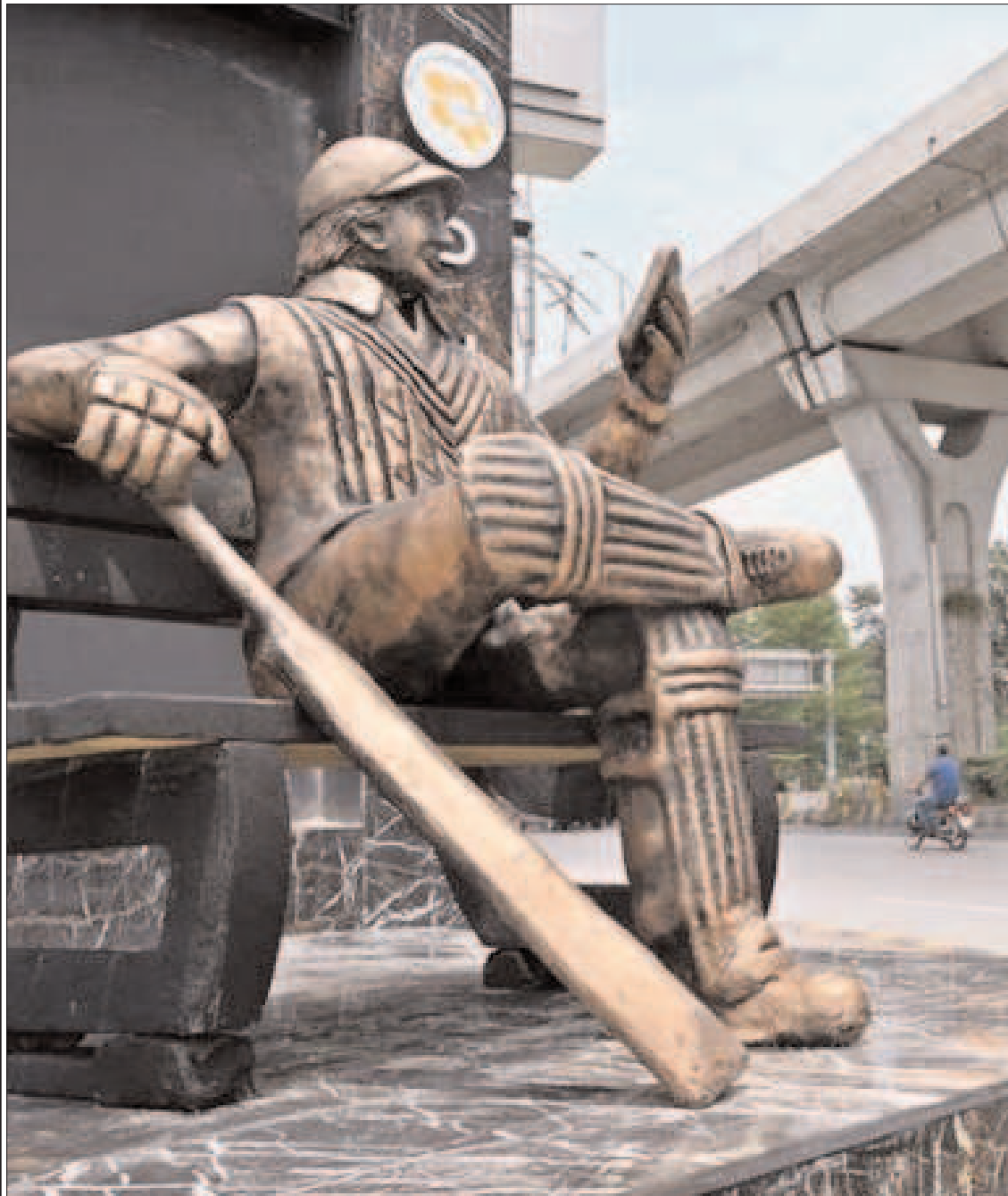
RAWALPINDI: A sculpture of cricketer installed at Shamsabad along Murree Road in connection with preparation of upcoming Asia Cup.

"My doubles record isn't exactly the longest or the most vast but I couldn't say no," the 2021 US Open champion said. "It's a once-in-a-lifetime opportunity. It's been a dream of mine since I was a young girl. "Andy's a hero to us all. It's a real gift and a real honour that he asked me." The mixed doubles is set to start on Friday, with first-round matches also being played on Saturday. The British pair have been drawn against China's Zhang Shuai and El Salvador's Marcelo Arevalo.