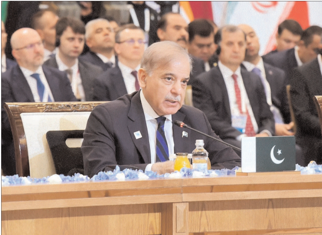
ASTANA: Prime Minister Shehbaz Sharif delivering a national statement at Shanghai Cooperation Organization Summit.