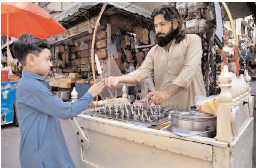
PESHAWAR: Vendor selling and displaying traditional ice cream locally called kufli to attract the customers at Sadar bazar.