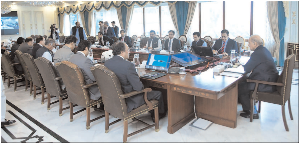
ISLAMABAD: Prime Minister Shehbaz Sharif chairing a review meeting on Digitization and Reforms of FBR.