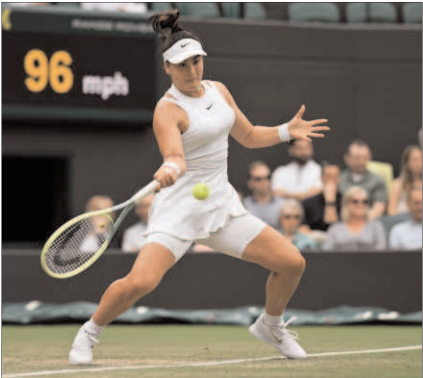
LONDON: Bianca Andreescu of Canada in action against Jasmine Paolini of Italy in the Ladies' Singles third round match during day five.