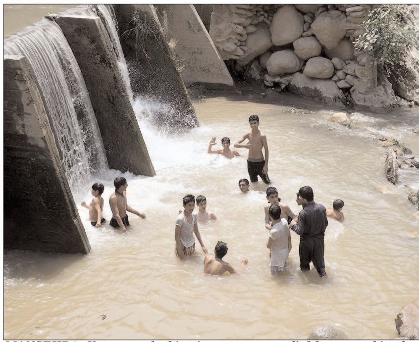
MANSEHRA: Youngsters bathing in water to get relief from scorching hot weather.

As many as 15 lakh rupees have been earmarked for the welfare of the poor, dowry for girls, students, minorities, youth, transgender, disabled and 7 lakh 50 thousand rupees have been earmarked for government payments, pension gratuity of employees, electricity and telephone bills and other things.