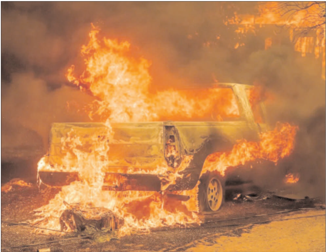
CALIFORNIA: A car burns as flames engulf a home in Oroville.