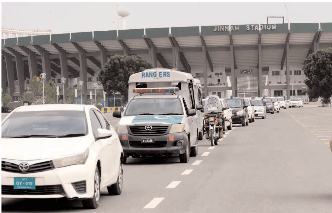
ISLAMABAD: Security Forces conducted a flag-march with an objective to maintain peace and tranquility in the Federal Capital for coming holy month of Muharram ul Haram.

ISLAMABAD (APP): Islamabad Electric Supply Company (IESCO) on Friday issued 3-day power suspension programme for Saturday, Sunday and Monday for various areas of its region due to necessary maintenance and routine development work. According to IESCO Spokesman, the power supply of different feeders and grid stations would remain suspended for the period on Saturday From 07:00 AM to 10:00 AM, Doda, Lakho Road, Commercial Market Feeder From 06:00 AM to 10:00 AM, Isolation Hospital, Raha, CM Pak Zong D-12/1&2, Zaraj 1,2, IST, Dhok Awan, Morra Nagyal.