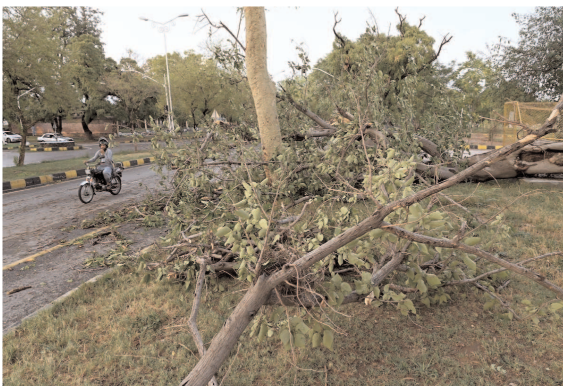
ISLAMABAD: A view of fallen trees on the roadside after heavy rain in the Federal Capital.

encroachments from the procession routes besides keeping a vigil on suspected persons and things. Entry of vehicles on the route of the processions would be blocked by erecting barricades and other hurdles, the CTO added. The CTO said, Traffic Police officials would be deployed along with district police personnel to ensure the security of the mourners. Strict disciplinary action would be taken against the delinquent officials, the CTO said.