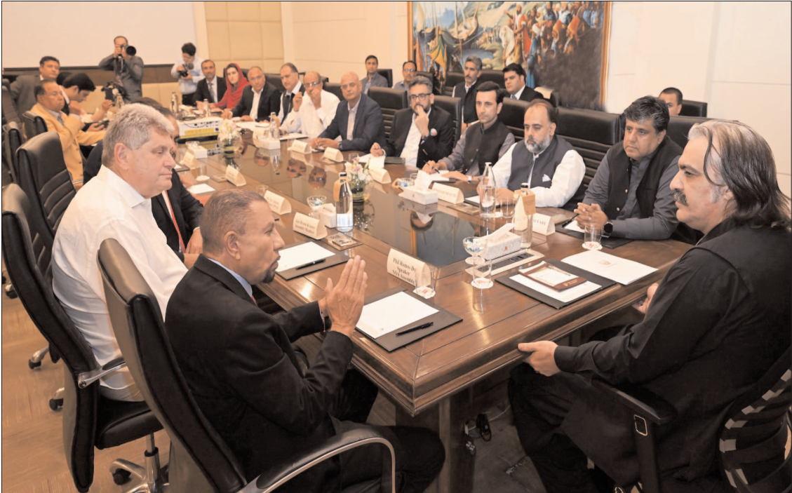
ISLAMABAD: A delegation of members of New York State Assembly and American Pakistani Public Affairs Committee, led by Deputy Speaker Phil Ramos, called on Chief Minister of Khyber Pakhtunkhwa Sardar Ali Amin Khan Gandapur.