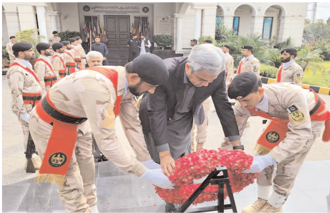
RAWALPINDI: Federal Minister for Interior and Anti-Narcotics Mohsin Naqvi laying floral wreath at the Yadgar-e-Shuhada in ANF Headquarters.