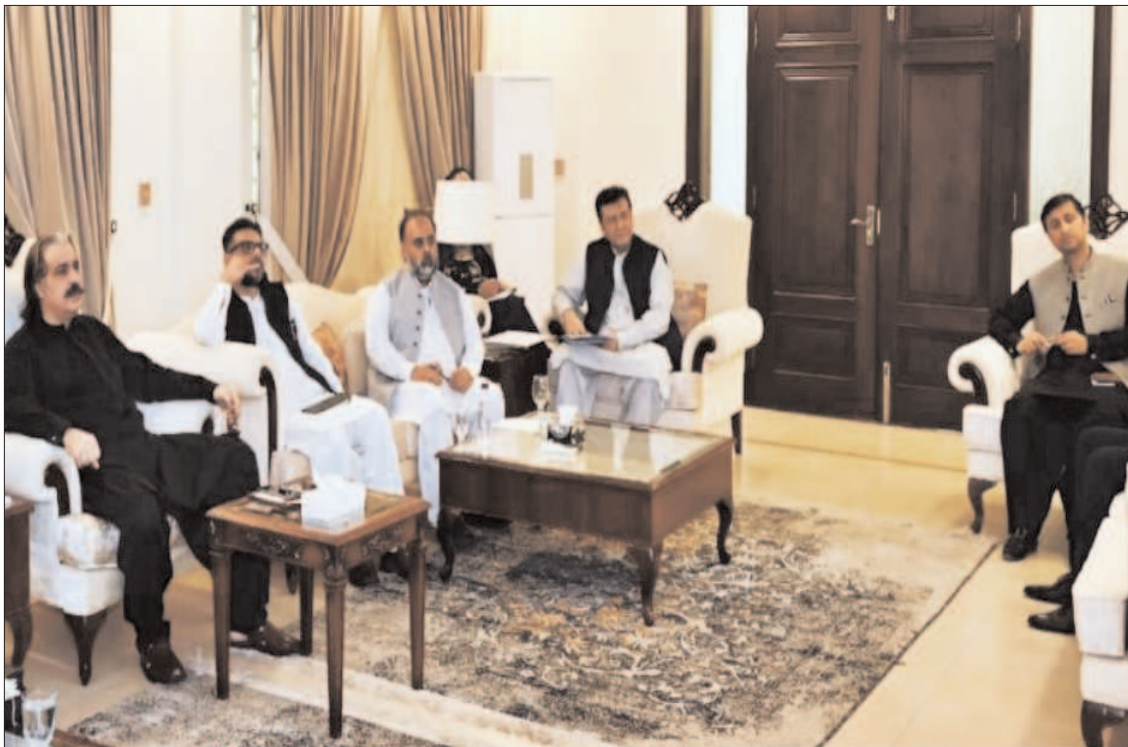
PESHAWAR: Khyber Pakhtunkhwa Chief Minister Sardar Ali Amin Khan Gandapur chairing a meeting regarding health and education sector reforms.