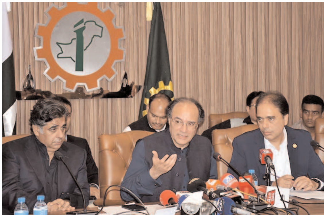
LAHORE: Federal Minister for Finance and Revenue, Muhammad Aurangzeb talking to media persons after meeting with Business community at FPCCI.

He highlighted that development of private sector in the country, ease of doing business and facilitation of investors were the top priorities of the government.