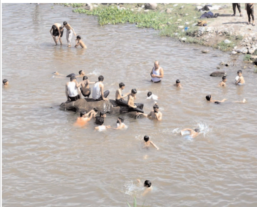
ISLAMABAD: Youngsters jumping and bathing in nullah korang to get relief from hot weather in Federal Capital.