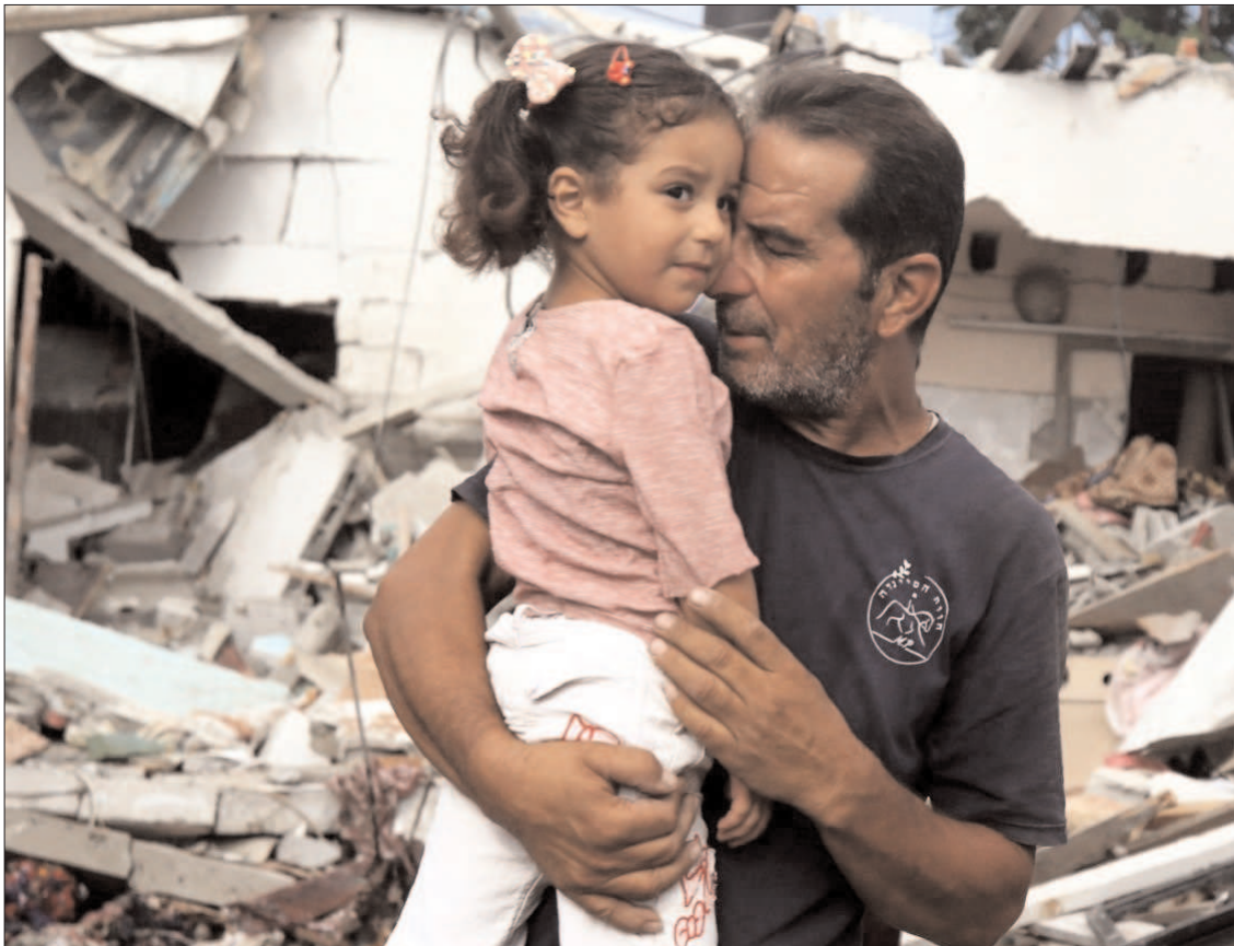
GAZA STRIP: A father holds her daughter in his lap as Palestinians assess the damage following an Israeli strike in Al-Zawayda in the central Gaza Strip on Sunday.