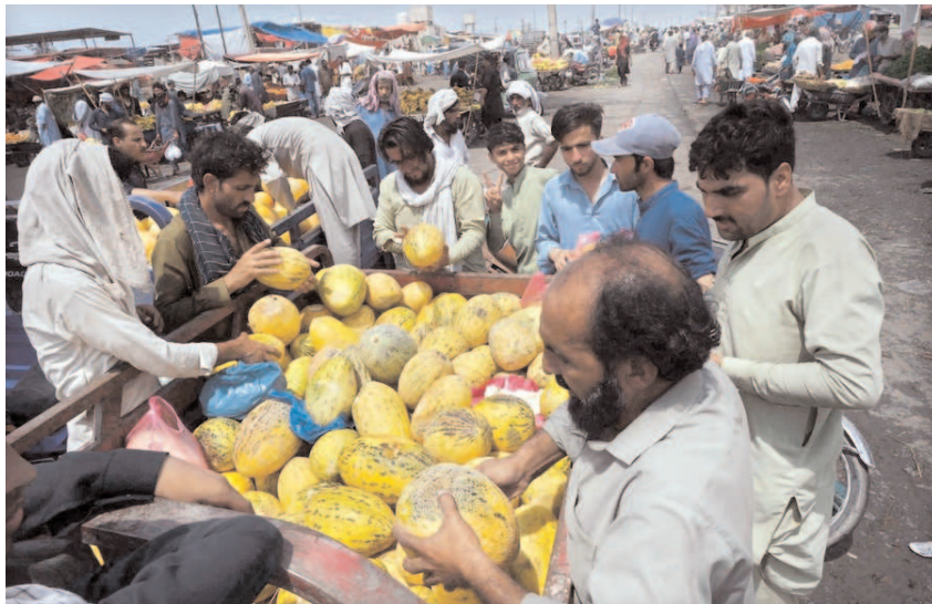
ISLAMABAD: People purchasing seasonal fruit displayed by vendor at fruit market.

Finance Minister is overseeing these efforts himself as the initiatives have been identified on his advice.