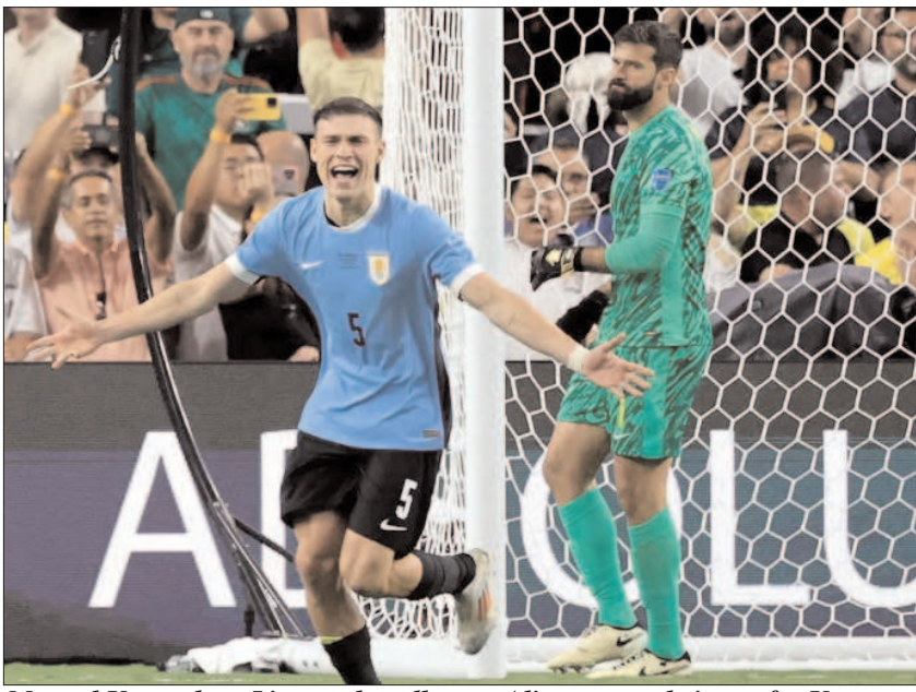
Manuel Ugarte beat Liverpool goalkeeper Alisson to seal victory for Uruguay.

Hamilton is leaving Mercedes for Ferrari after this season. "This is my last British GP with this team. I wanted to win so much for them. I love them so much. All the hard work they've been putting in." Verstappen overtook Norris in the closing laps.