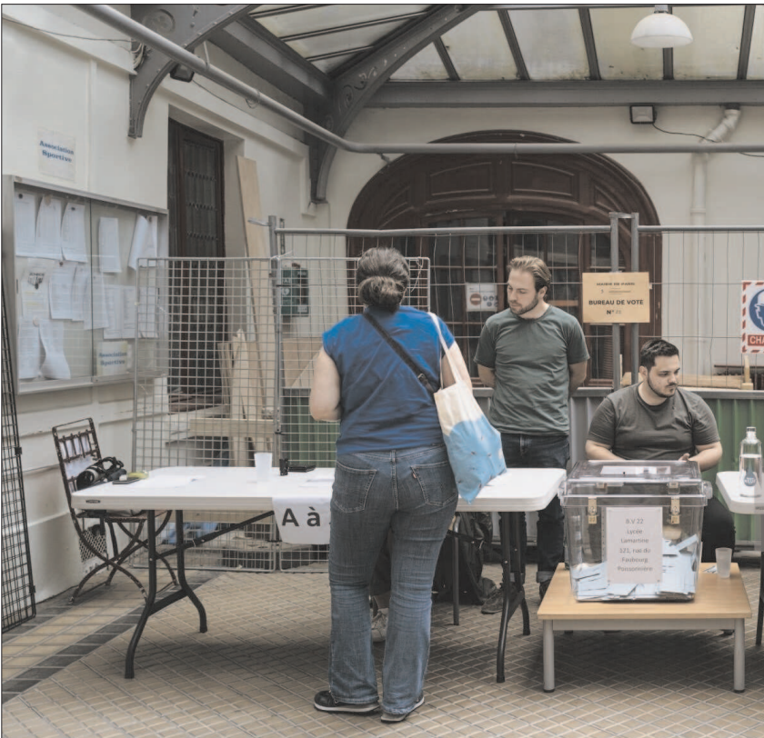
PARIS: Voters arrive at a polling station during the second round of legislative elections in Paris, France, on Sunday.

The Idlib-based "Salvation Government" of Hayat Tahrir al-Sham — a formerly al-Qaida-linked insurgent group that controls parts of northwestern Syria — issued a statement on July 1 calling on Turkey to "assume its legal and moral responsibilities to protect Syrian refugees."