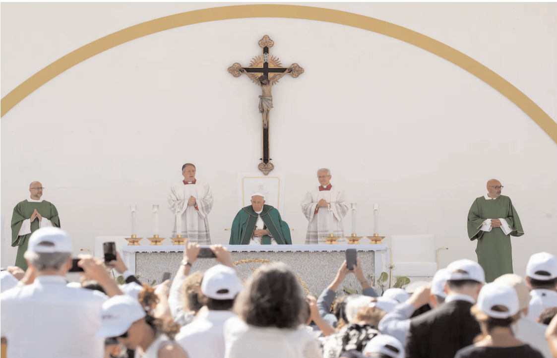
TRIESTE, ITALY: Pope Francis attends a mass at Piazza Unita d'Italia in Trieste, Italy, on Sunday.