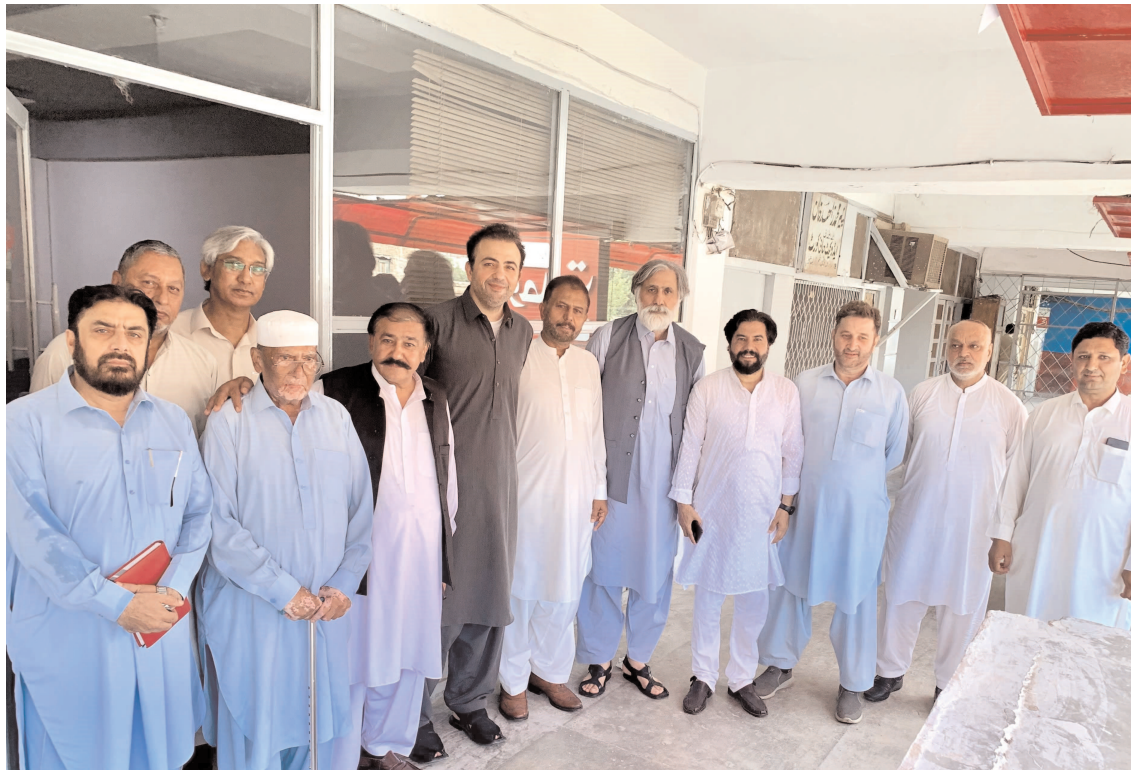
Peshawar: All Pakistan Newspapers Society (APNS) office holders in a group photo after the KP Chapter pivotal meeting.