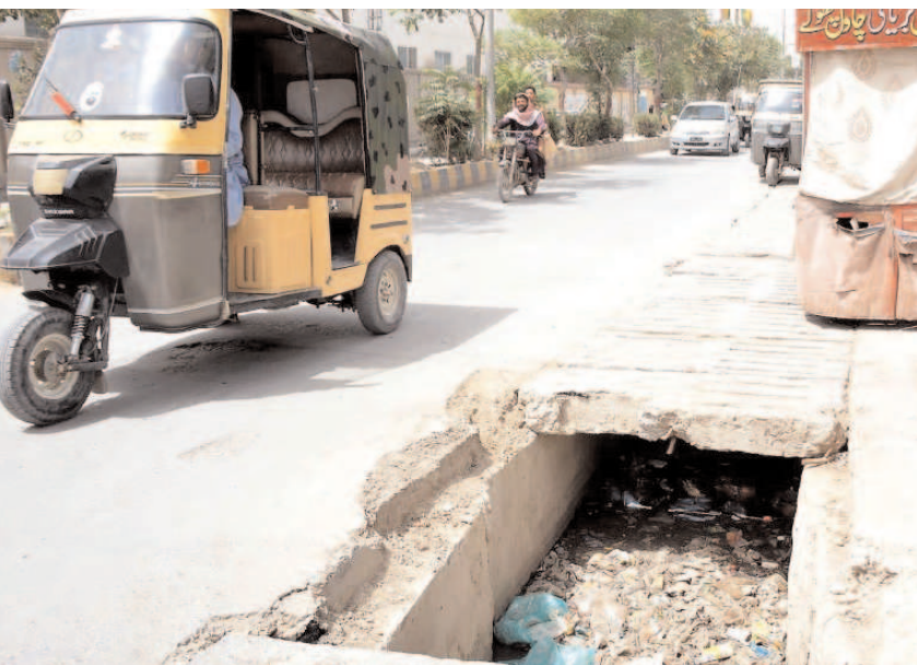
QUETTA: View of the open manhole in front of civil hospital which may cause any serious incident.