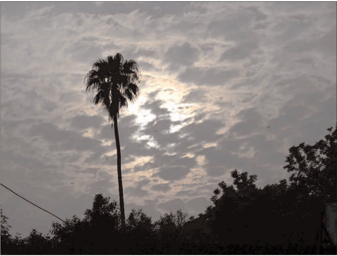
LAHORE: A beautiful view of clouds hovering over the skies of the Provincial Capital.

PTI Women Wing Karachi President Fizza Zeeshan discussed their extensive plan to plant trees in all districts of Karachi. She emphasized the need to continue the plantation drive to combat global warming, noting that cutting down trees prevents the purification of carbon dioxide in the air.