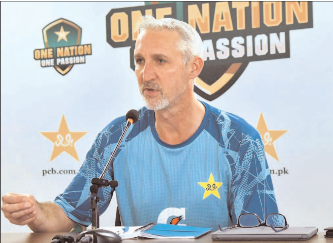
KARACHI: Pakistan Men's red-ball Head Coach Jason Gillespie addressing a press conference at the National Bank Stadium.

She has reached a Grand Slam quarter-final for the second time, but her progress was overshadowed by the emotional exit of Keys, who was still weeping as she walked off court.