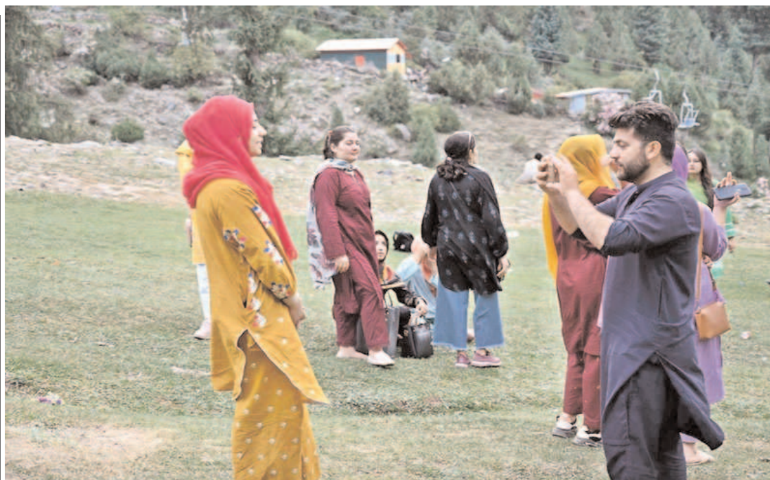
GILGIT: Tourist capturing the moment with their cell phone at Nalter Valley, a popular tourist destination, as a large number of other people have also arrived to visit the area.

Being yet another area rich in Nature's bounties, Thar and its people need special attention of the governments to protect their heritage and skills as well as explore their abilities to excel and prosper like people in other parts of the country.