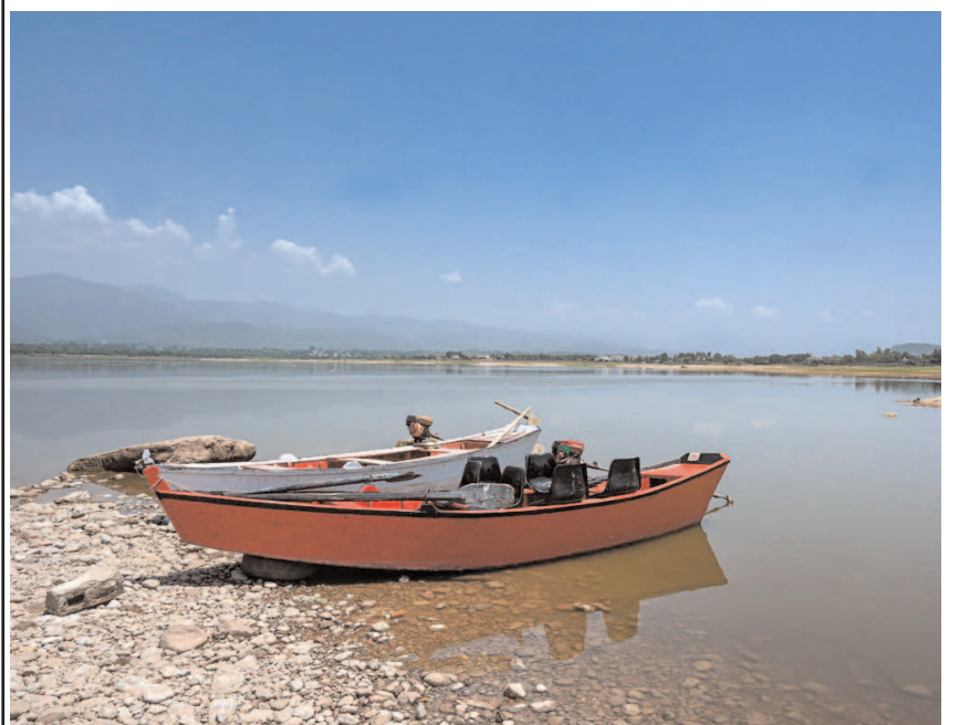
ISLAMABAD: A view of water level in Rawal Lake has decreased due to below-normal rainfall in the Federal Capital.

A copy of the Code of Conduct has been sent to all the Majlis organizers and they have been taken on board, Engineer Aamir Khattak added. Implementation of the code of conduct would be ensured at all costs, he said. Along with ensuring implementation of the loudspeakers and other restrictions, all photocopy shops have been instructed not to share any content that could spread religious hatred, he said.