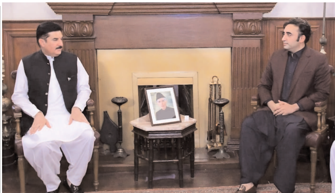
PESHAWAR: Khyber Pakhtunkhwa Governor Faisal Karim Kundi talking to PPP Chairman Bilawal Bhutto Zardari during later's visit to city.