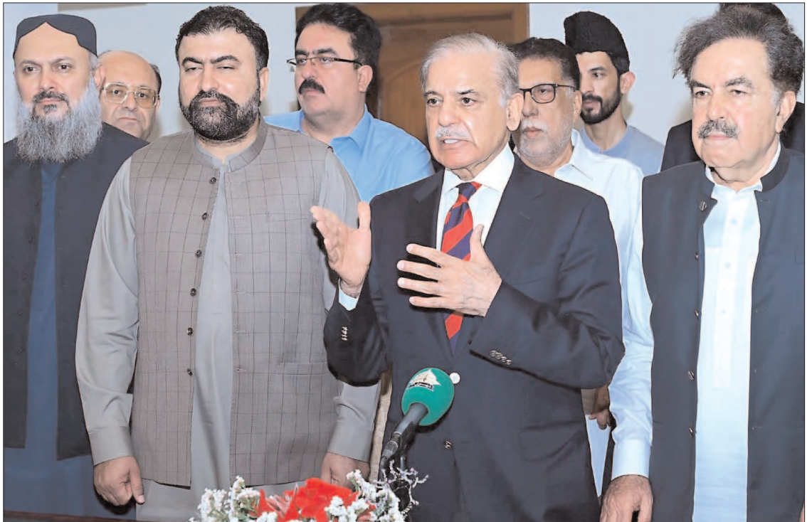
QUETTA: Prime Minister Shehbaz Sharif talking to media persons after signing of agreements to solarize agricultural tube wells of Balochistan.

The president underscored the need to revamp and improve the Indus River System Authority. He also proposed establishing a state land bank to productively utilize state-owned lands surrounding strategic canals by securing funding and investment from international financial institutions and the Pakistan Stock Exchange. The meeting was also briefed that 27 telemetry points would be established to ensure accurate data sharing regarding the availability and flow of water.