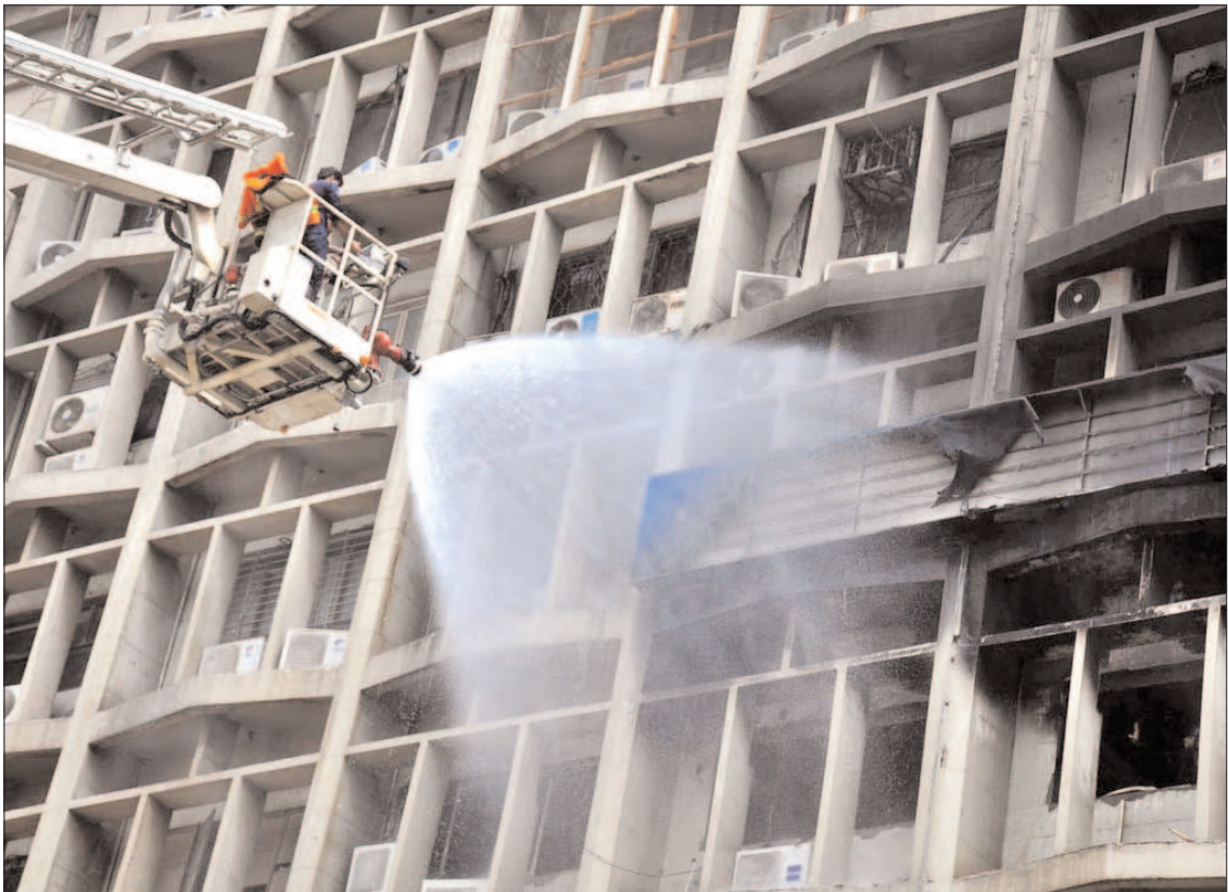
KARACHI: Firefighters used a snorkel to extinguish a fire that erupted on the fourth floor of the Pakistan Stock Exchange building.