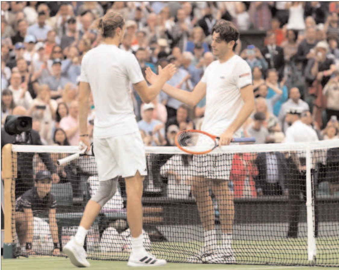
LONDON: Taylor Fritz of United States (R) meets Alexander Zverev of Germany at the net following victory in the Gentlemen's Singles fourth round match during day eight of The Championships Wimbledon.