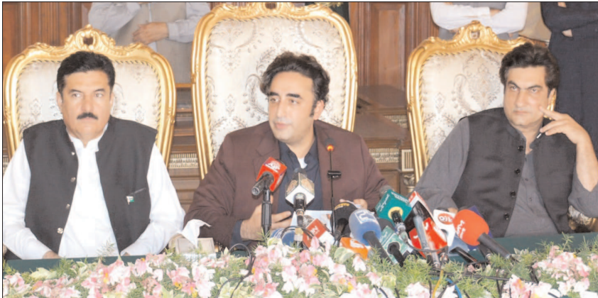
PESHAWAR: Chairman PPP Bilawal Bhutto Zardari along with Governor KP, Faisal Karim Kundi talking to media persons at Governor's House.