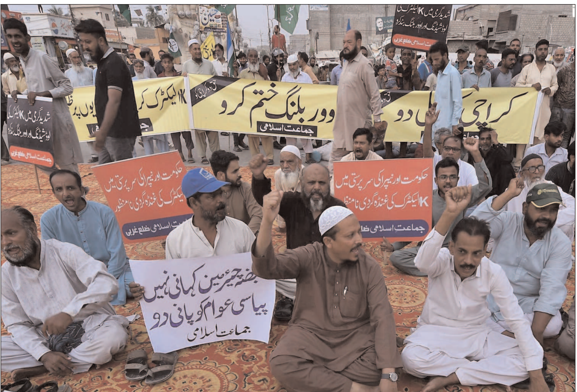
KARACHI: Activates of Jamaat e Islami hold protest against K electric at Orangi Town Islam Chowk.

national community to play its role at all levels for a just solution to this critical issue and to pressure India to adhere to United Nations resolutions. Pakistan has consistently raised the Kashmir issue on all international forums, and the Pakistani nation will continue its efforts in support of Kashmiris, he added. On this occasion, prayers for forgiveness were also offered for all Kashmiri martyrs, including Burhan Wani. Convener Ghulam Muhammad Safi, All Parties Hurriyat Conference remarked that today is observed as a day of resistance, recalling that the massive participation in Burhan Wani's funeral proved that the death of a martyr is the life of a nation. He affirmed that the Kashmiri people will never accept India's slavery and their struggle for freedom will continue unabated.