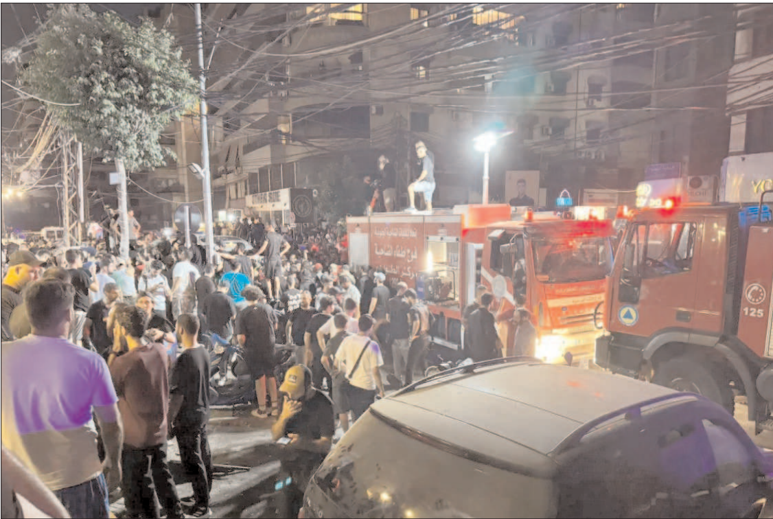
BEIRUT: People gathered at the site after Israeli bombardments in capital city of Lebanon.

There is no doubt that Ukrainian civilians have suffered the most in the ongoing war, with tens of thousands killed and cities like Mariupol completely devastated. According to the local Russian governor of Belgorod, Vyacheslav Gladkov, more than 200 residents of the region have died as a result of hostilities since 2022. More than a thousand others have been wounded, including dozens of children, a number of whom have undergone amputations, he says. The deadliest incident took place on December 30, 2023, when a barrage of rocket fire struck the city during New Year celebrations. Five children were among the 25 people killed. — Aljazeera