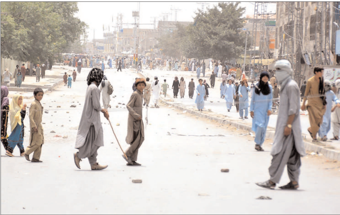
QUETTA: Activists of Baloch Yakjehti Committee block Saryab Road during a protest for acceptance of their demands.

He urged the Khyber Pakhtunkhwa government to conduct a comprehensive survey of the damages due the rains and to ensure that financial assistance reaches the victims promptly and without discrimination. He emphasized the importance of taking proactive measures to prevent landslides and other accidents during the monsoon season.