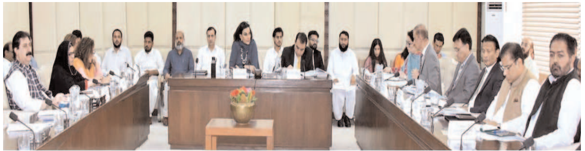
ISLAMABAD: Senator Sherry Rehman, Chairperson Senate Standing Committee on Climate Change presiding over a meeting of the committee at Parliament House.

The municipality department would monitor outsourcing system digitally including biometric attendance, vehicle tracking management system, vehicle weighing at dumping site, digital fleet monitoring and container clearance through geo-tagging and prompt resolution of the complaints, the DC informed.