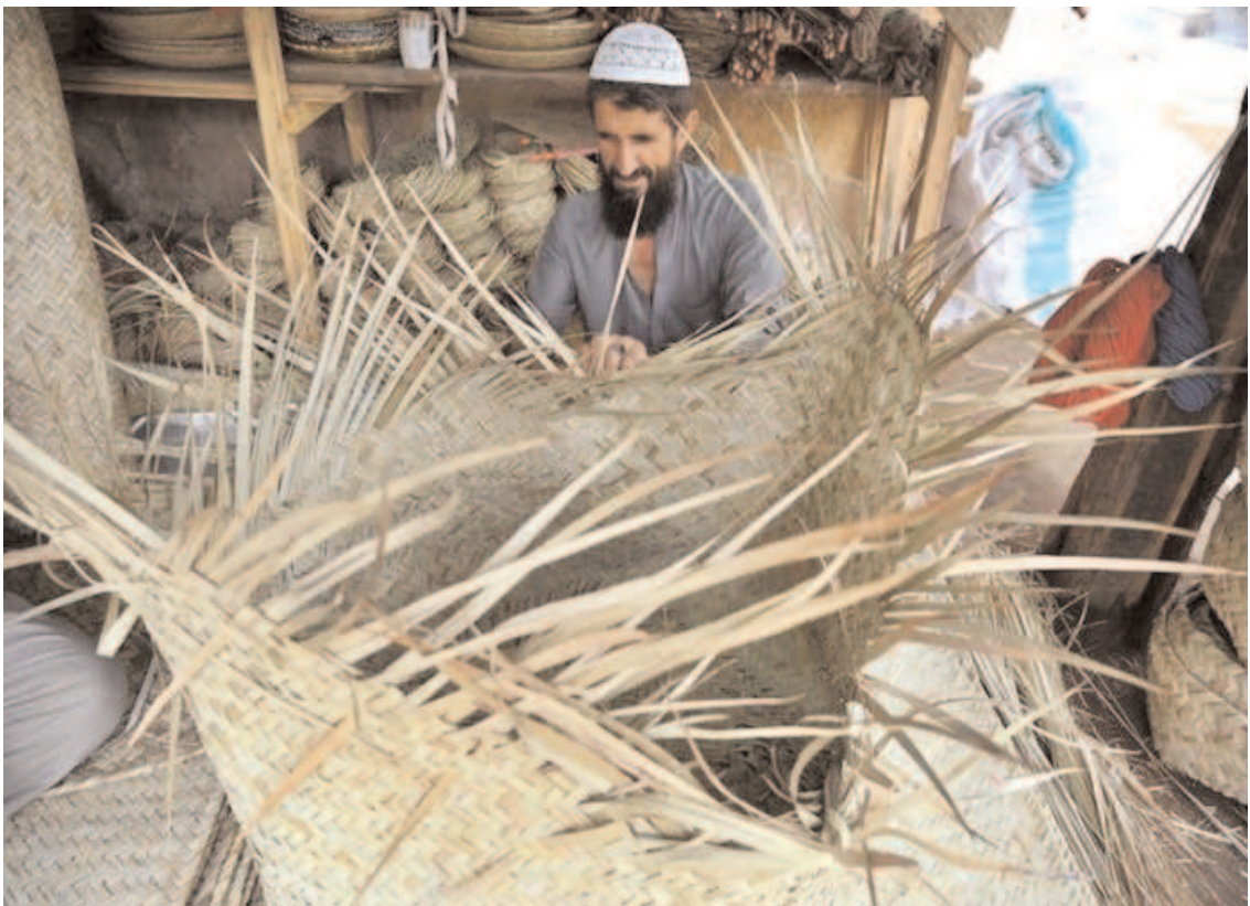
PESHAWAR: An man is busy making a large basket with date palm leaves at his workplace.