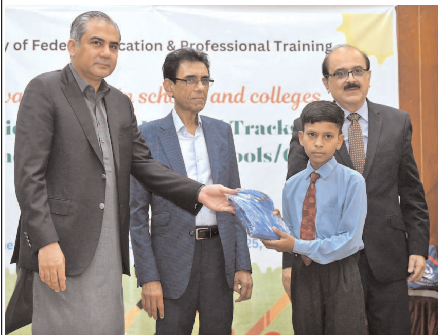
ISLAMABAD: Interior Minister and Chairman PCB Syed Mohsin Raza Naqvi and Federal Minister for Education and Professional Training, Dr. Khalid Maqbool Siddiqui distributing Sports Kits and Track Suits among the students during distribution ceremony at Islamabad Model College for Girls (IMCG), F-6/2.

The Ambassador underscored the significance of agriculture exports in fortifying Pakistan's economy and highlighted various projects under the China-Pakistan Economic Corridor (CPEC), including the Gwader airport. Senator Saleem Mandviwala was also present.