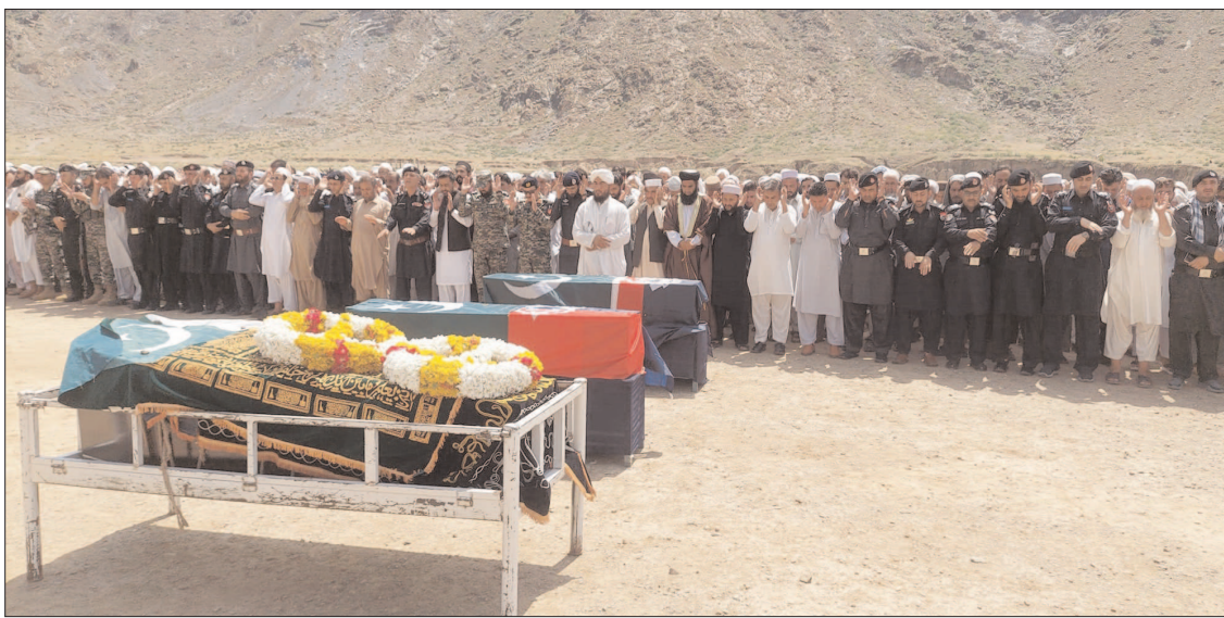
LANDI KOTAL: People offering funeral prayer of two police officials and passerby, shot dead by unknown armed persons.

The operational cost for one connection is two thousand four hundred (2400) rupees per month, but the company is only collecting two hundred and ten (210) rupees from consumers while the provincial government provides a subsidy of two thousand two hundred (2200) rupees per connection. He emphasized to ensure the use of safe drinking water in protecting the citizens from many water borne diseases.