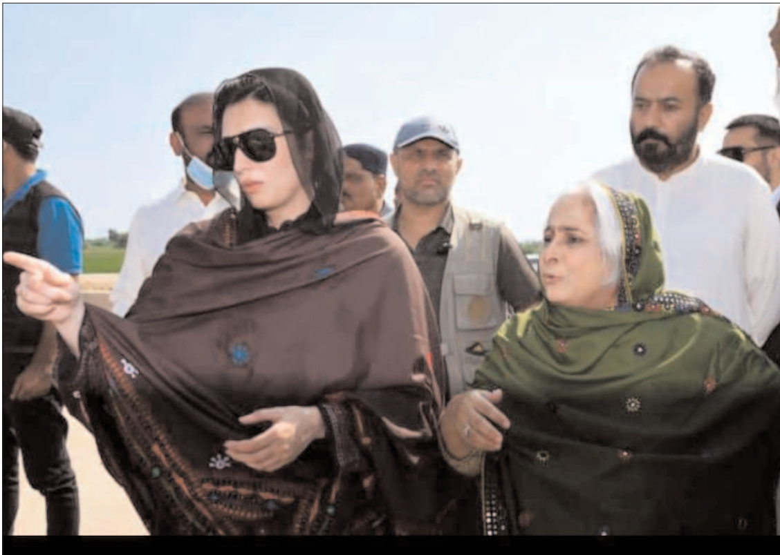
NAWABSHAH: MNA Asifa Zardari alongwith other officials visiting different areas of Nawabshah and city drain system.