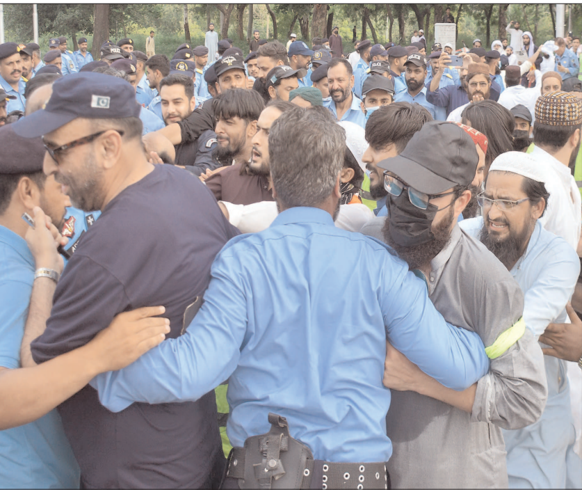
ISLAMABAD: Police officials trying to stop activists of Sunni Ulema Council during a protest in favour of their demands.

PHC restrained the federal government from taking any action against the petitioners and issued a notice to the government, seeking a response after hearing arguments while adjourned further hearings.