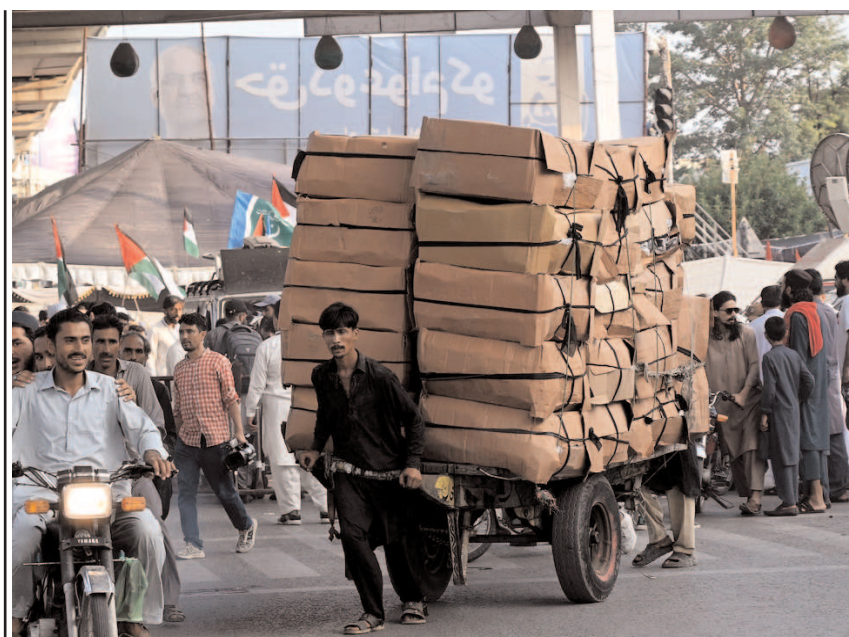
RAWALPINDI: A labourer on the way pulling a heavily loaded handcart to deliver the stuff to shops at Liaquat Bagh.

The CDA has strictly prohibited tree cutting in Islamabad, and FIRs will be lodged against those who violate this rule.