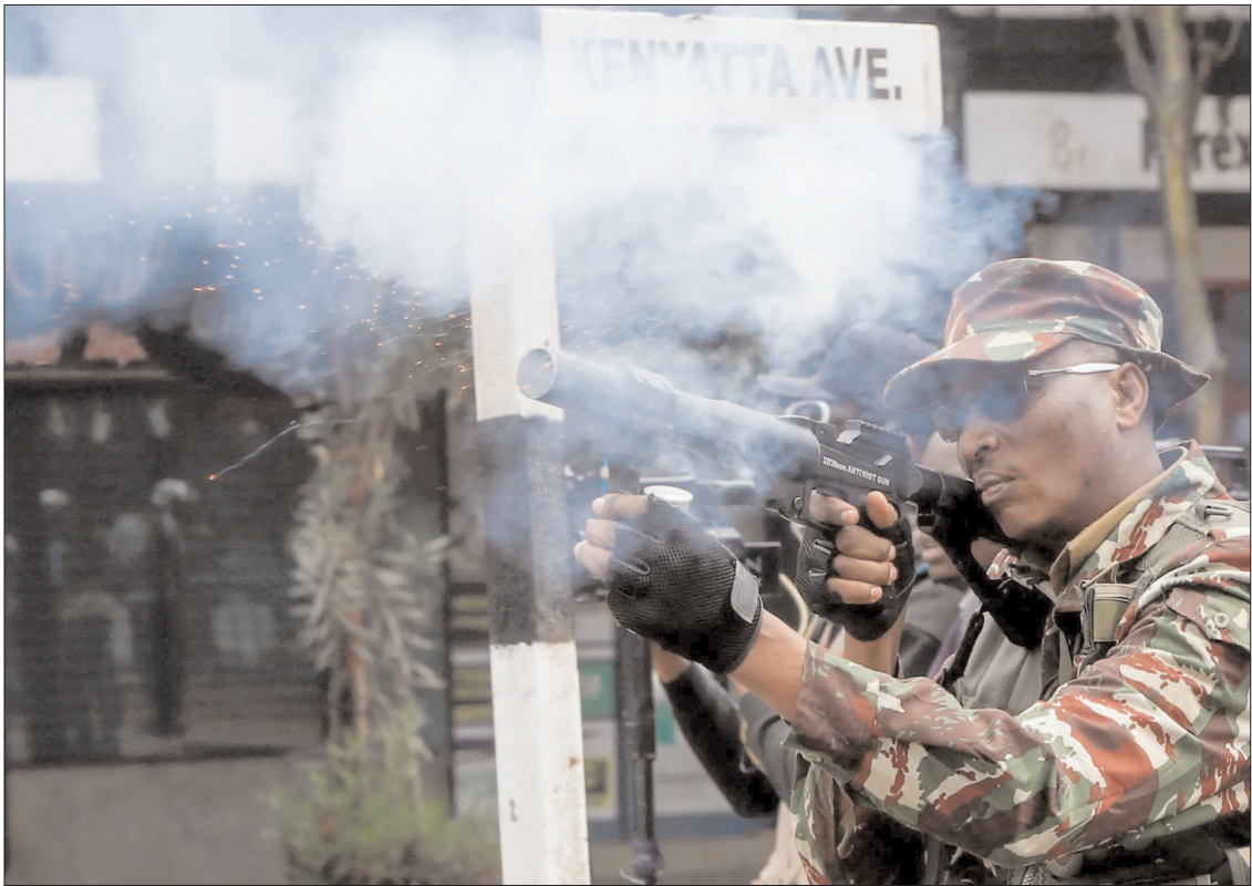
NAIROBI: A police officer fires tear gas during a protest in Kenya.