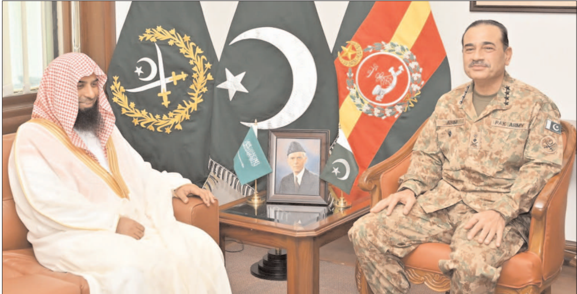
ISLAMABAD: Imam Masjid Al-Nabawi, Sheikh Salah bin Mohammad Al-Budair reciting before starting of National Assembly session.