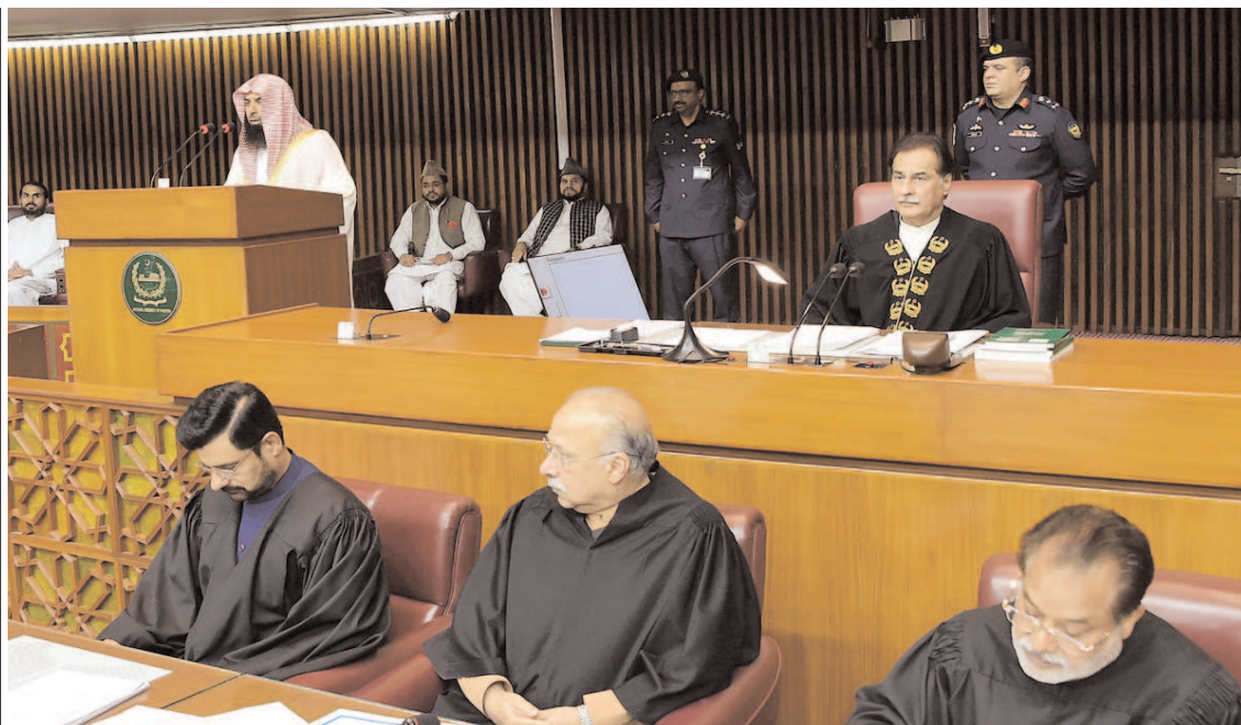
ISLAMABAD: National Assembly Session starts with recitation of Imam Masjid Al-Nabvi (S.A.W) Sheikh Dr. Salah Mohammad M Al- Budair at Parliament House.

Additionally, the Assistant Commissioner (AC) Shalimar held a meeting with representatives of various societies to discuss the situation. The meeting covered rescue operations, the deployment of de-watering sets, and the availability of life jackets and evacuation protocols.