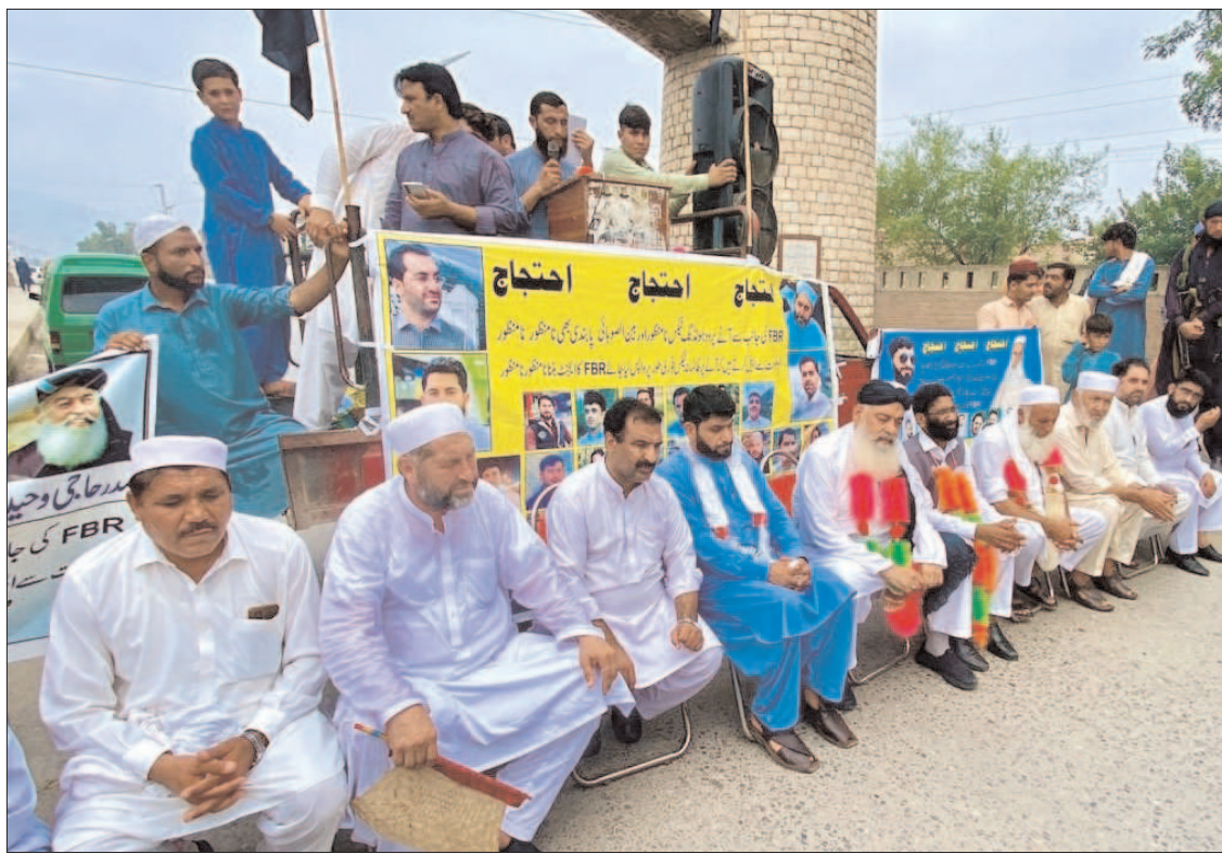
JAMRUD: Flour dealers holding a protest at Bab-e-Khyber for acceptance of their demands.