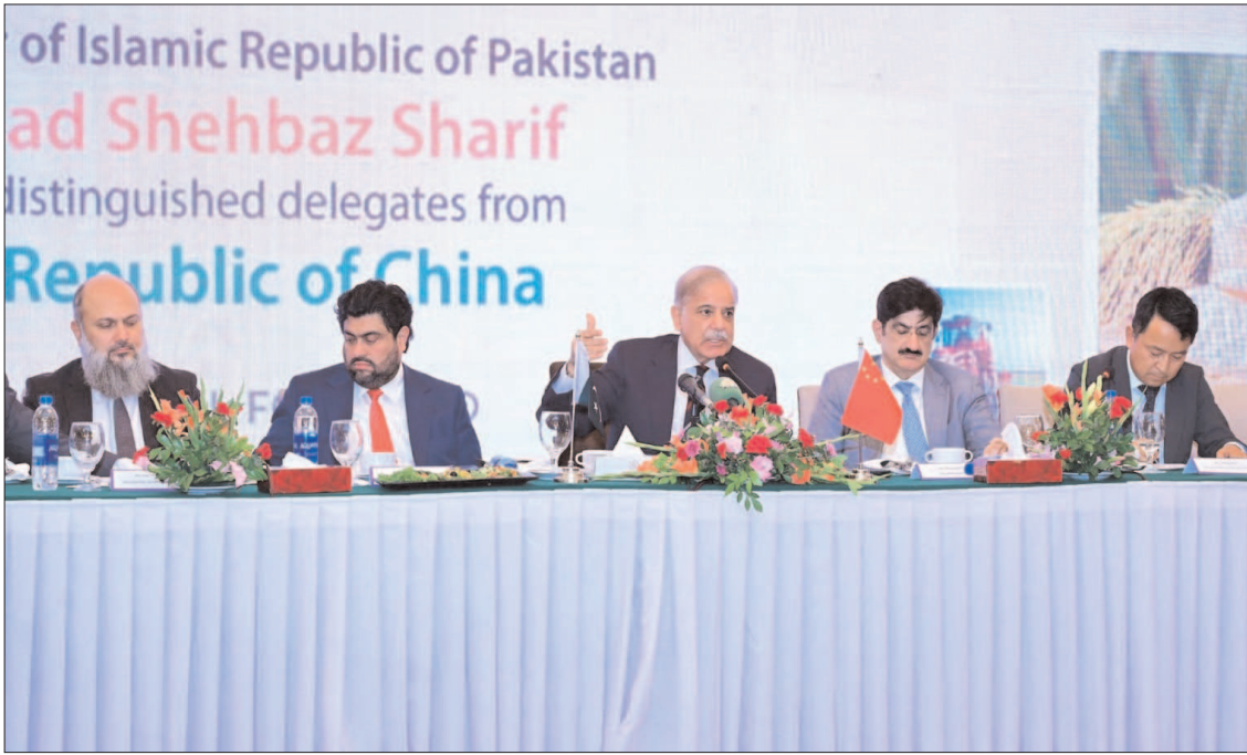
KARACHI: Prime Minister Shehbaz Sharif addressing business delegates from China.

Vol. XXXIXI No. 196 Regd. No. 241 SAFAR 04 1446 -- SATURDAY, AUGUST 10 2024 PESHAWAR EDITION 12 PAGES PRICE. 30