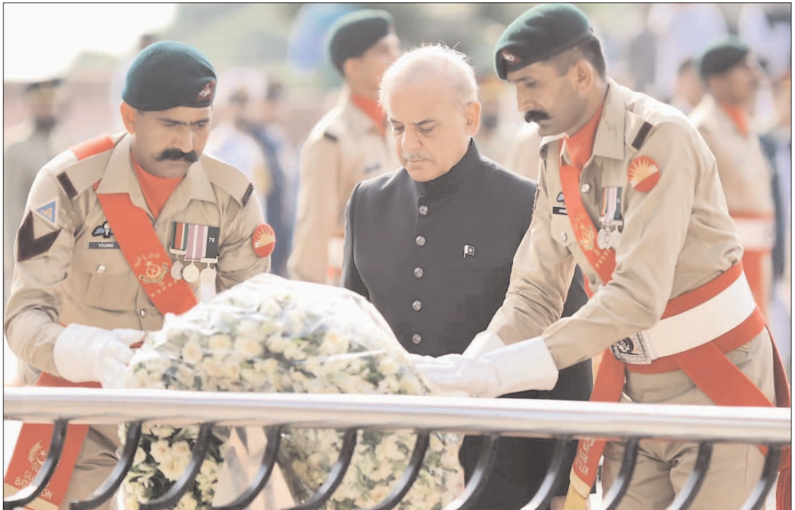
ISLAMABAD: Prime Minister Shehbaz Sharif laying a floral wreath at the Yadgar-e-Shuhada in Pakistan Monument on the 78th Independence Day.

Prime Minister Muhammad Shehbaz Sharif also hoisted the national flag in a National Flag Hoisting Ceremony held at the Pakistan Monument in connection with 77th Pakistan Independence Day celebrations. The ceremony was also attended by national Olympic hero Arshad Nadeem and Chairman Senate Yusuf Raza Gilani. The prime minister laid a floral wreath at the Pakistan Monument to pay tribute to the country's founding fathers and national heroes.