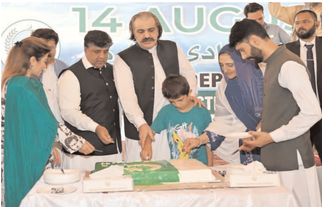
PESHAWAR: Khyber Pakhtunkhwa Chief Minister Sardar Ali Amin Khan Gandapur cutting the cake to mark the Independence Day celebrations.

Later, Olympic gold medalist Arshad Nadeem met with athletes from various sports in the province alongside Governor Faisal Karim Kundi, sharing his experiences of success, hard work, and the emotional and professional training needed to compete in the Olympics. He encouraged the athletes by emphasizing that hard work and dedication are essential for success in any field, and urged the young athletes to continue their efforts with diligence, assuring them that God would reward them for their hard work.