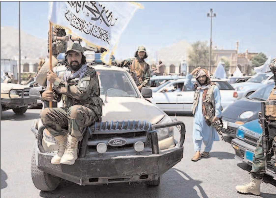
KABUL: Taliban security personnel ride in a convoy to celebrate the third anniversary of Taliban takeover of Afghanistan.