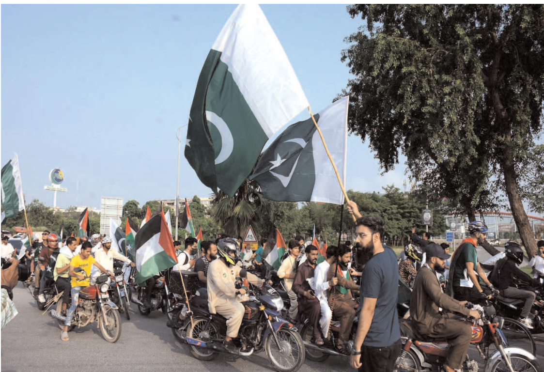
ISLAMABAD: Safe Gaza campaign activists hold rally on the occasion of Pakistan Independence Day.

This collective approach, she hopes, will foster a sense of community and ownership, ensuring that the benefits of tree plantation are felt for generations to come.