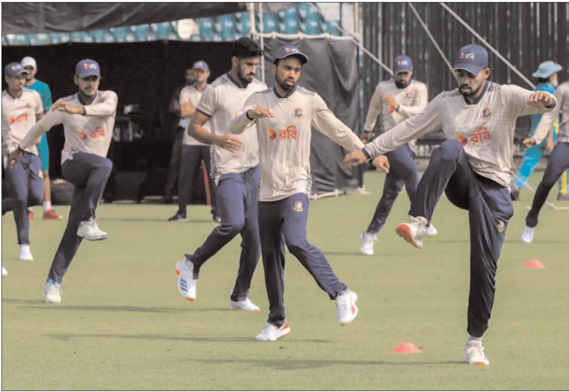
LAHORE: Bangladesh's players train at the Gaddafi Stadium.