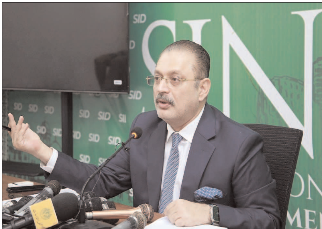
KARACHI: Sindh Senior Minister Sharjeel Inam Memon addressing a press briefing after meeting of Sindh Cabinet.

Wahab added that while the Punjab Chief Minister had announced a tax on garbage collection in the province, any similar initiative in Karachi faced criticism. The mayor also enjoyed a ride on the train installed in Funland.