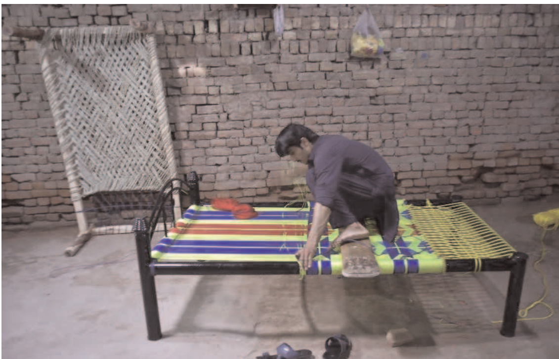
PESHAWAR: A worker busy in knitting charpoy, a traditional bed, at his workplace in Dabgari bazaar.