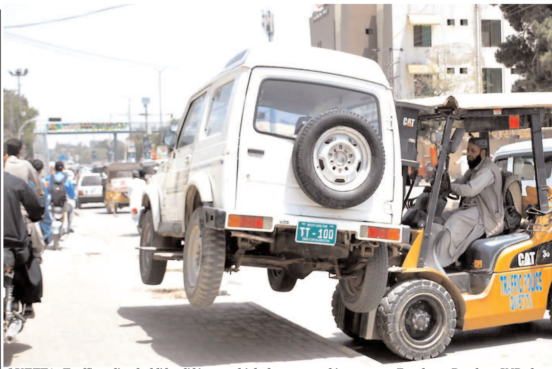
QUETTA: Traffic police forklifter lifting a vehicle from no-parking area att Zarghoon Road.