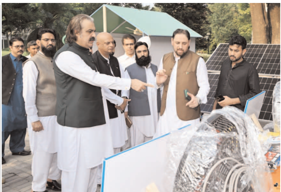
PESHAWAR: Khyber Pakhtunkhwa Chief Minister Sardar Ali Amin Khan Gandapur looking at the model design of Solar Scheme.