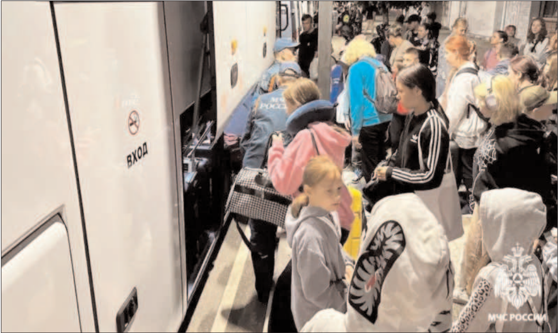
MOSCOW: Image showS Russian citizens arriving at a railway station to travel to temporary accommodation centres in the Nevinnomyssk, Mineralnye Vody and Shpakovsky municipalities.