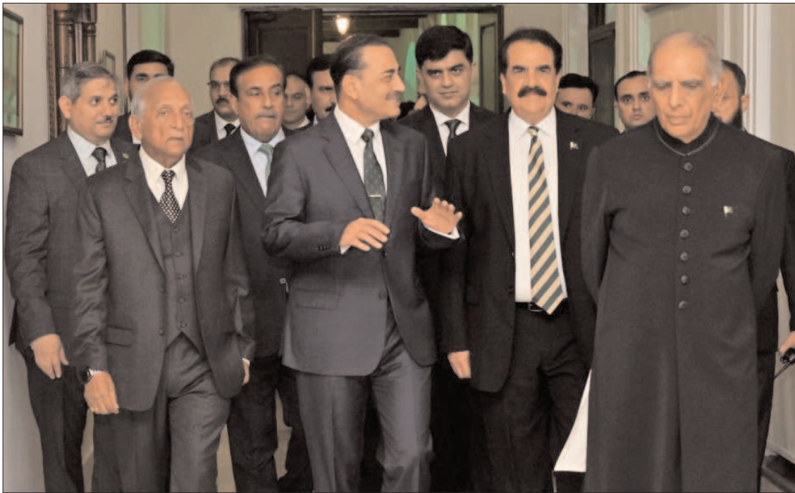
RAWALPINDI: Chief of Army Staff General Syed Asim Munir arriving at a ceremony held in honour of Army veterans. He is accompanied with former Chiefs General (Retd) Ashfaq Pervez Kayani and General (retid) Raheel Sharif.