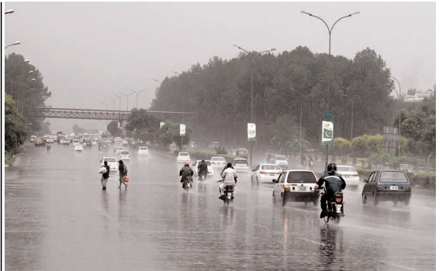
ISLAMABAD: Vehicles and bikers make their way through heavy rain at Zero Point in Federal Capital.

For the next 24 hours, FFD, Lahore has predicted scattered thunderstorm rain of Moderate Intensity with isolated Heavy Falls over Punjab (Faisalabad, Sahiwal, Multan & Bahawalpur Divisions), Sindh