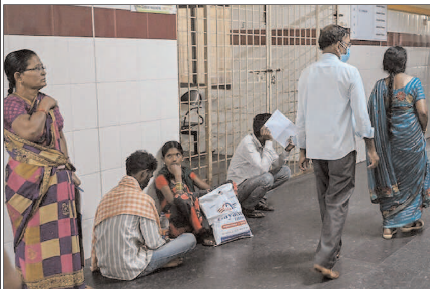
HYDERABAD: People waiting for their turn at a government hospital during a nationwide doctors' strike against the rape and murder of their colleague.

The West Bank-based Palestinian foreign ministry described the attack as "organized state terrorism." The European Union's top diplomat, Josep Borrell, said he would propose sanctions against Israeli government "enablers" of Jewish settler violence.