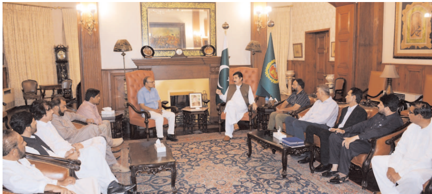
PESHAWAR: Pakistan Sports Writers Federation delegation meeting with Governor Khyber Pakhtunkhwa Faisal Karim Kundi at Governor's House.