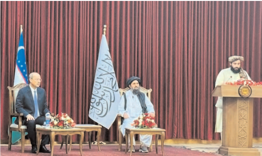
KABUL (Ariana News): Five trade and investment agreements were signed between Kabul and Tashkent during the visit of Uzbekistan's prime minister to Kabul on Saturday, officials said.

KABUL (Ariana News): Prime Minister of the Islamic Emirate of Afghanistan (IEA), Mullah Mohammad Hassan Akhund, met with the United Arab Emirates' President Sheikh Mohammed bin Zayed Al Nahyan during his visit for medical checkup, it was announced. During the meeting, UAE's president said that his country supports "brotherly" Afghanistan in its rebuilding, according to IEA's spokesman Zabihullah Mujahid.