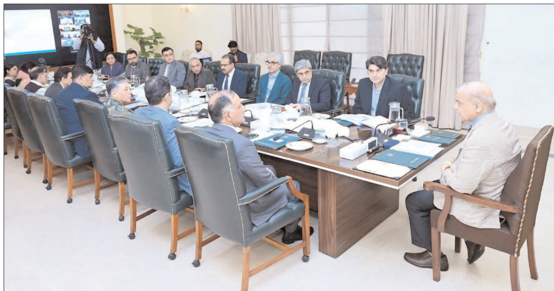
ISLAMABAD: Prime Minister Shehbaz Sharif chairing a meeting on measures against spread of Monkeypox virus.

LAHORE: Just like the case in the past, India has once again resorted to water aggression as it has opened the spillways of River Ravi and River Chenab without prior warning, inundating thousands of villages and millions of acres of land in Punjab. At a time when the country is struggling to cope with the losses caused due to heavy monsoon rains, the release of water has further exacerbated the situation.