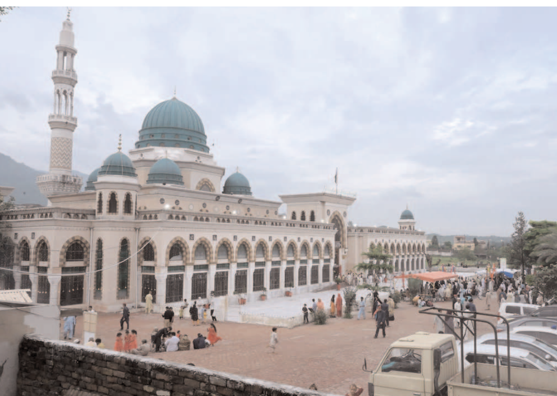
ISLAMABAD: The last day of annual Urs of the 17th century mystic, Shah Abdul Latif Bari Imam.

Sasta model bazaars have been set up in Haidari Chowk, Allama Iqbal Park and Committee Chowk in Rawalpindi city from where people are getting control rate and standard items, he said.