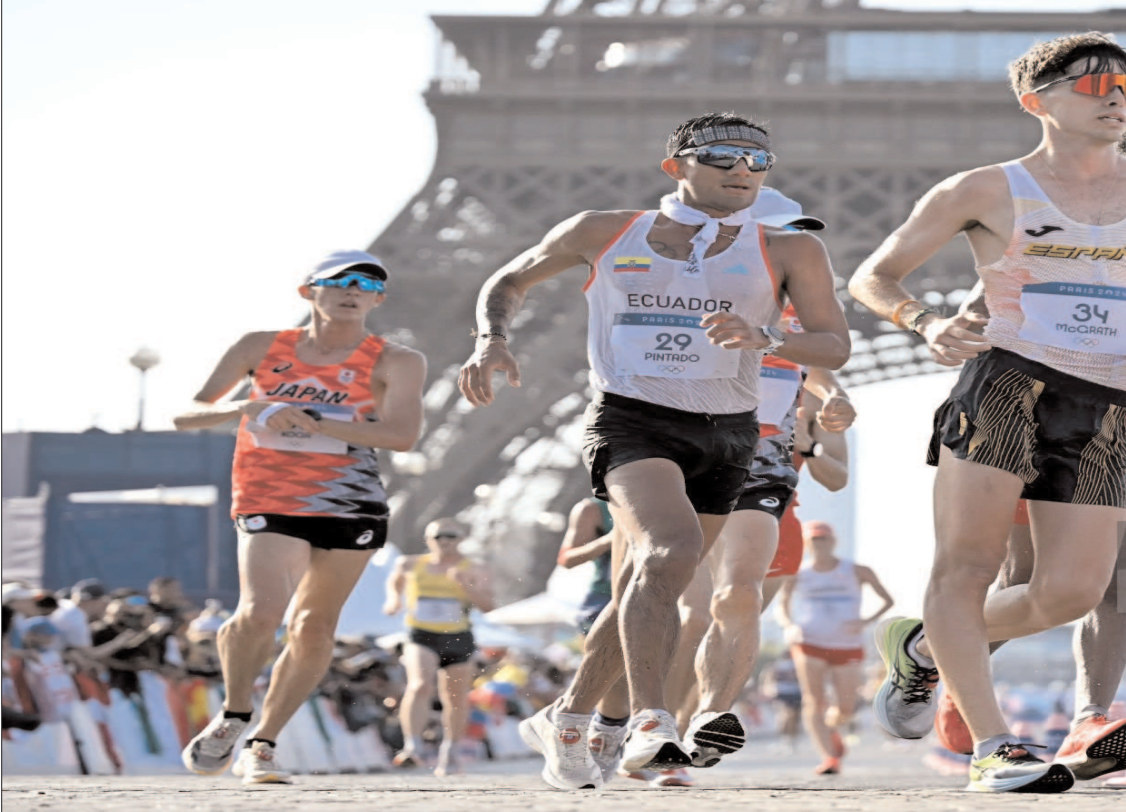
PARIS: Ecuador's Brian Daniel Pintado (#29) in the men's 20km race walk of the athletics event at the Paris 2024 Olympic Games at Trocadero in Paris on Thursday.