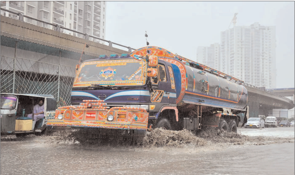
KARACHI: Motorists on their way at a road during accumulated rainwater after the heavy monsoon rain.