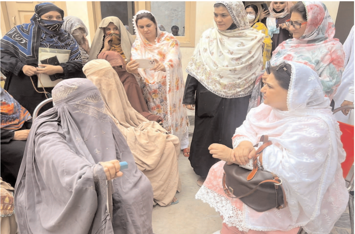
PESHAWAR: Senator Rubina Khalid Chairperson Benazir Income Support Programme (BISP), talking to women during his visit to Peshawar Tehsil office.