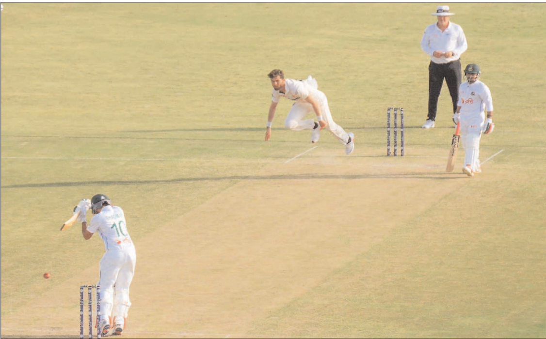
RAWALPINDI: Shaheen Shah Afridi bowls against Bangladesh on the second day of the first Test match at Rawalpindi Cricket Stadium.