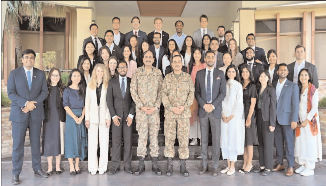
RAWALPINDI: General Syed Asim Munir, Chief of Army Staff in a group photo with a delegation of 44 students from Harvard Business School (HBS) Trek-2024 at General Headquarters.