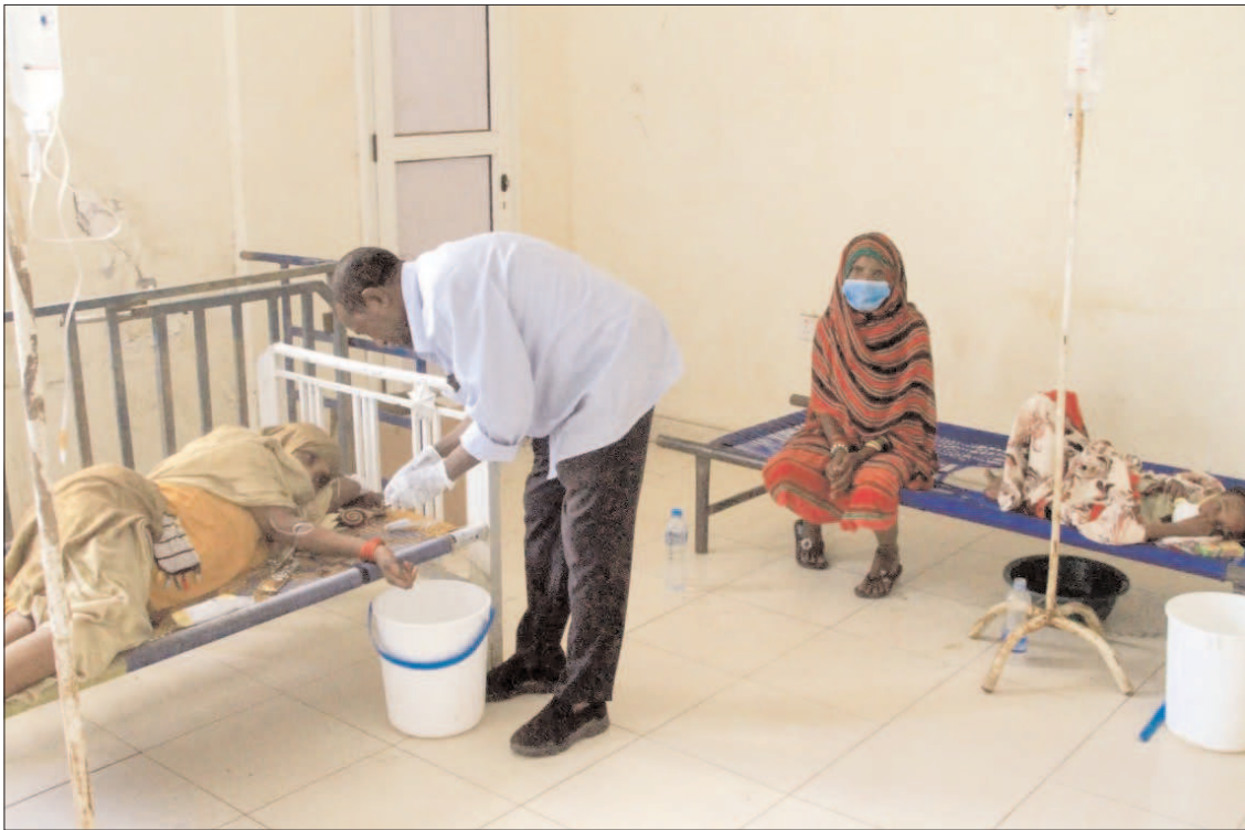
KHARTOUM: Cholera patients receiving treatment at a rural isolation centre in Wad al-Hilu in Kassala state, eastern Sudan.