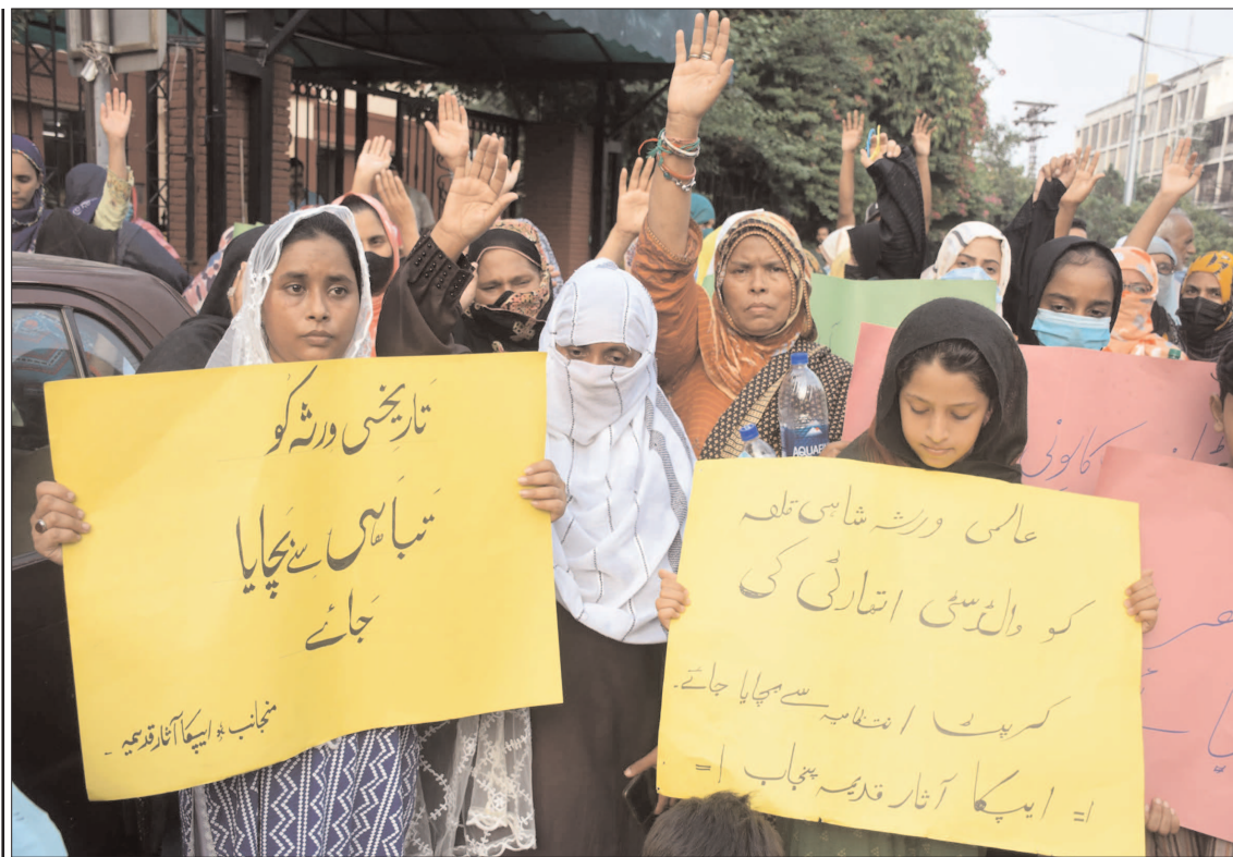
LAHORE: Employees of Department of Archeology holding a protest against demolition of their houses in front of Press Club.

During 2020-21 when the pandemic of COVID-19 wreaked havoc, the Sindh government released Rs104 million and established a 90-bed facility at JPMC. In 2021-22, the government released Rs104 million for operation costs for 90 bed COVID-19 facility, released a Rs240 million grant-in-aid to the Patients Aid Foundation and purchased essential equipment for the JPMC surgical complex.