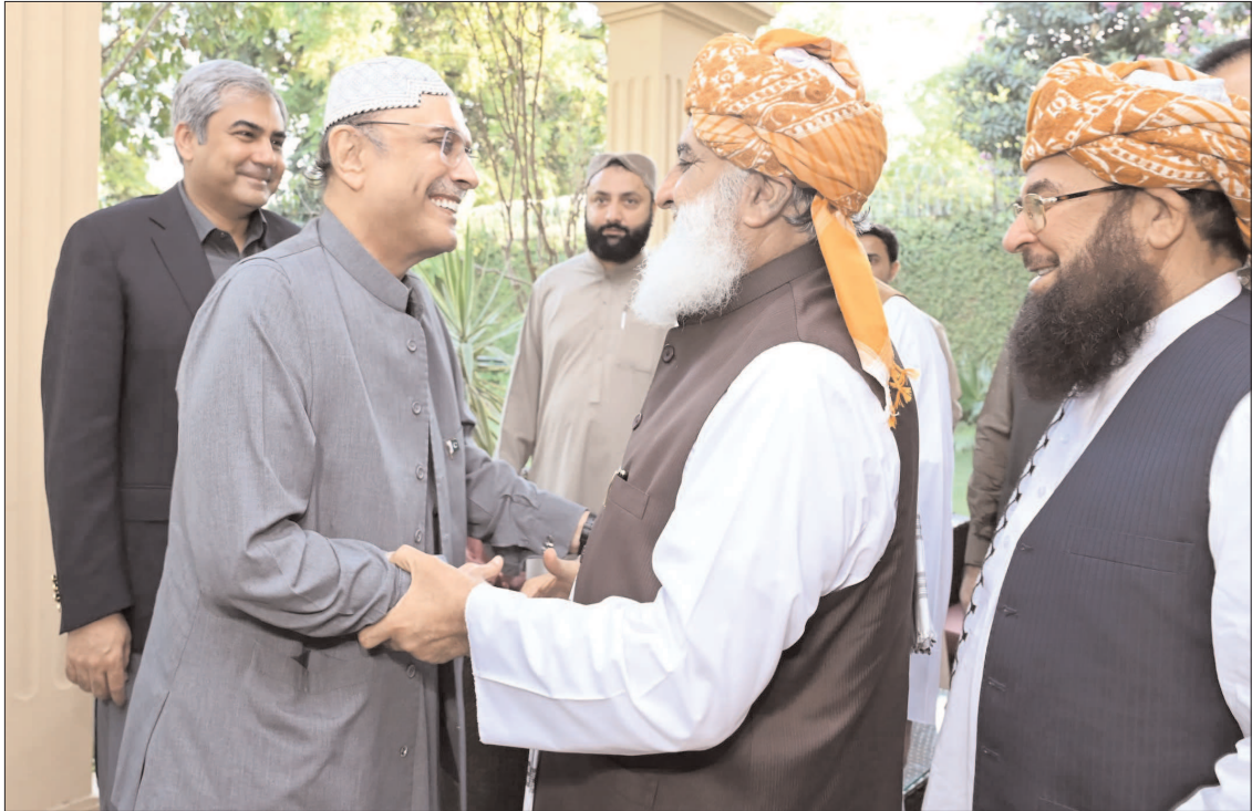
ISLAMABAD: President Asif Ali Zardari along with Federal Interior Minister Mohsin Naqvi has reached the residence of JUI-F Chief, Maulana Fazlur Rahman's residence.