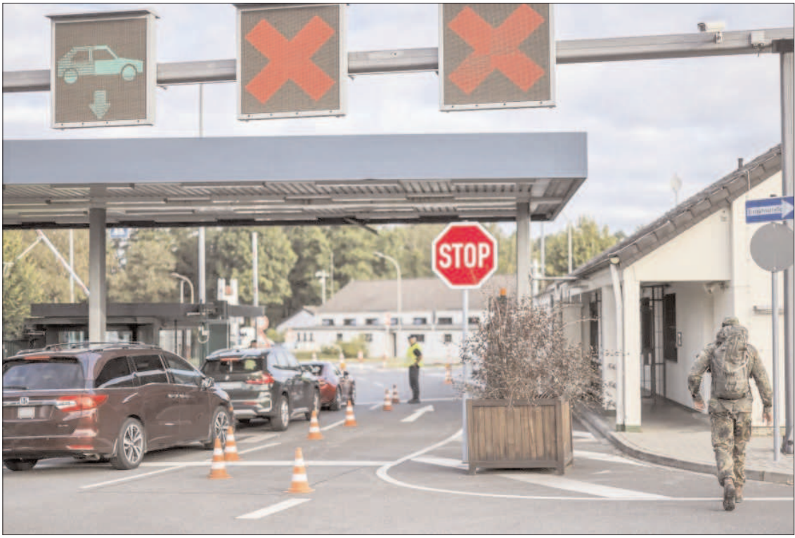
BERLIN: Soldiers checking the entrance to NATO air base, in Geilenkirchen, Germany.