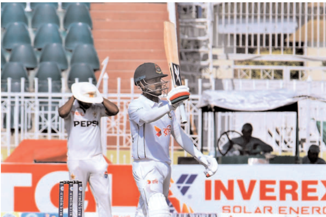
RAWALPINDI: Bangladesh batsman Mehidy Hasan Miraz celebrates after scoring a half-century during fourth day of 1st Test Cricket Match playing between Pakistan and Bangladesh at Pindi Cricket Stadium.