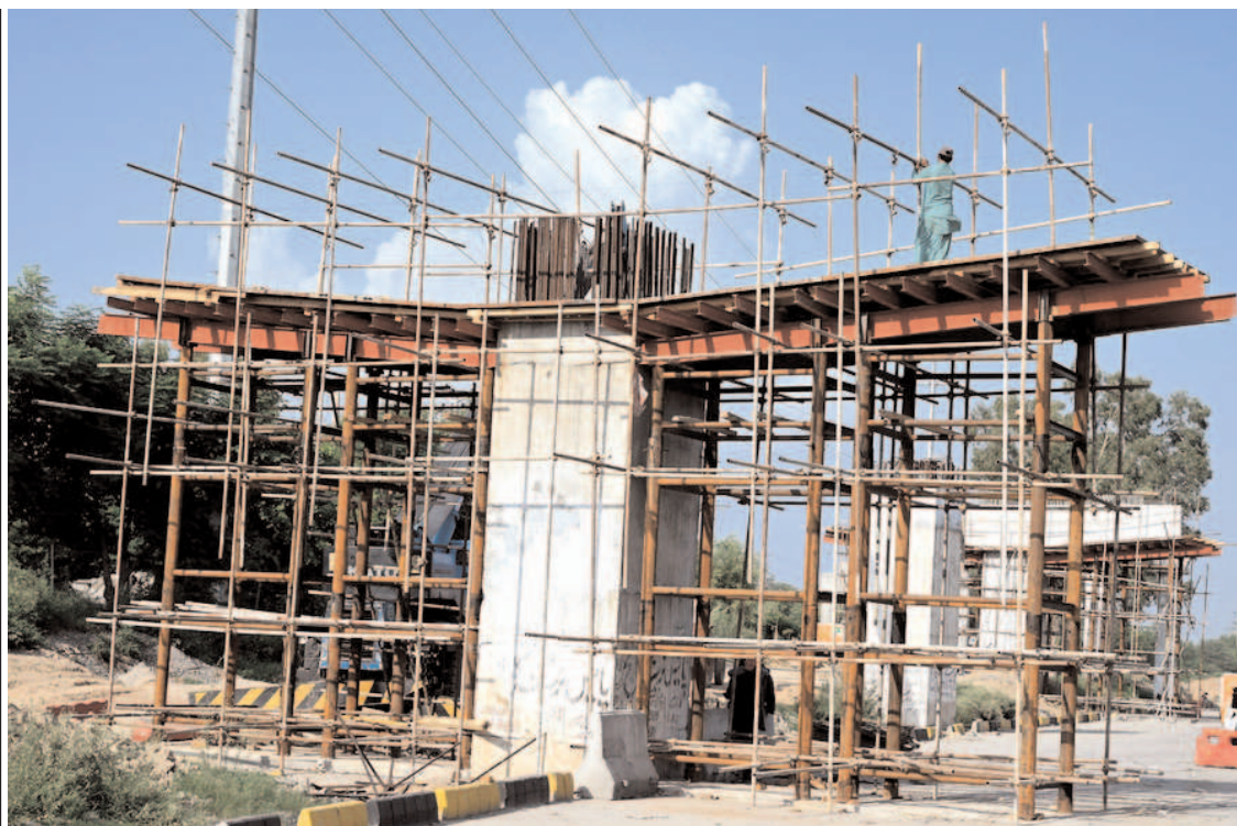
ISLAMABAD: Workers busy in work at under construction 10th Avenue flyover.