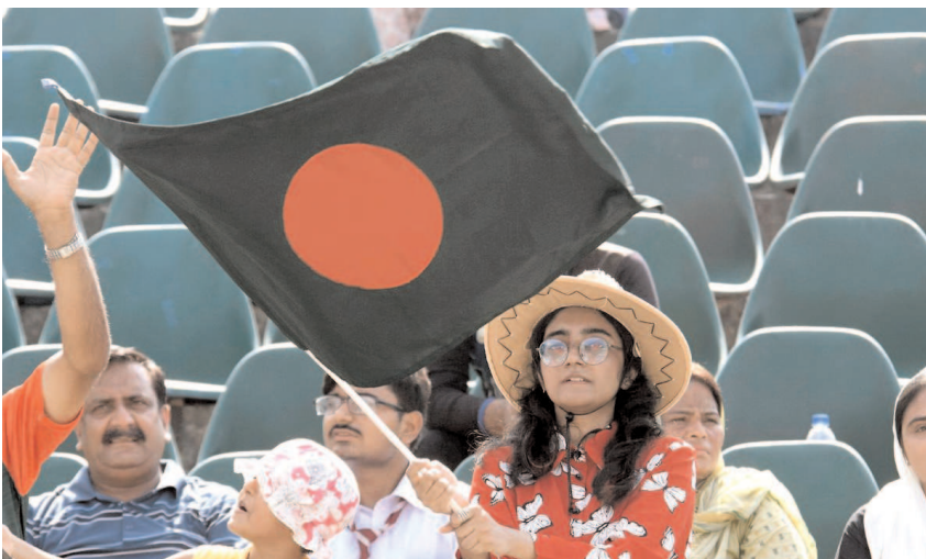
RAWALPINDI: Bangladesh cricket team's supporters waves flag of Bangladesh during fourth day of 1st Test Cricket Match at Pindi Cricket Stadium.

Although South Africa gave themselves some chance with the removal of Hope and skipper Rozman Powell (7) the outcome was never in doubt as the home side passed the target with 13 balls to spare.