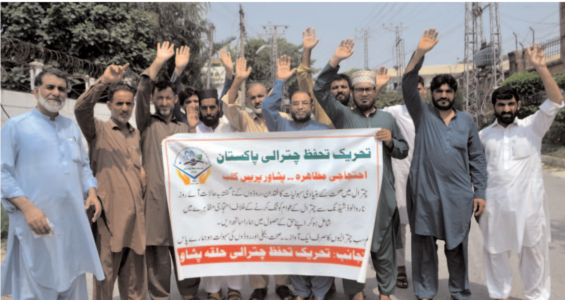
PESHAWAR: Activists of Tehreek-e-Tahafooz Chitral Pakistan chanting slogans during a protest in favour of their rights.