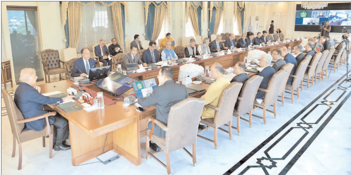
ISLAMABAD: Prime Minister Shehbaz Sharif chairing a review meeting regarding Electronic Procurement, e-Pak Acquisition and Disposal System/e-PADS.