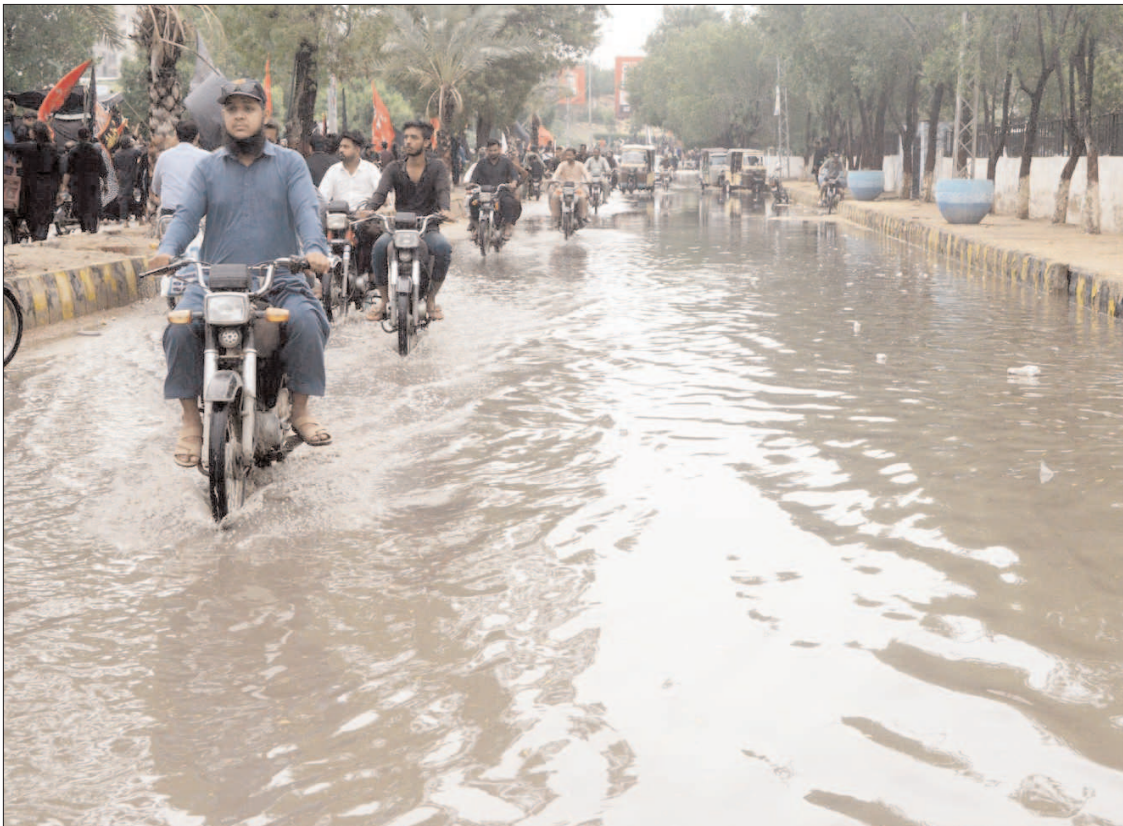
HYDERABAD: A view of accumulated rainwater after heavy rains in City.