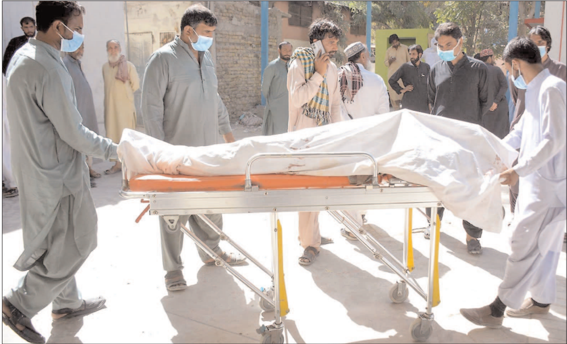
QUETTA: Rescue workers shifting body of Bolan and Kalat incidents victim to civil hospital.