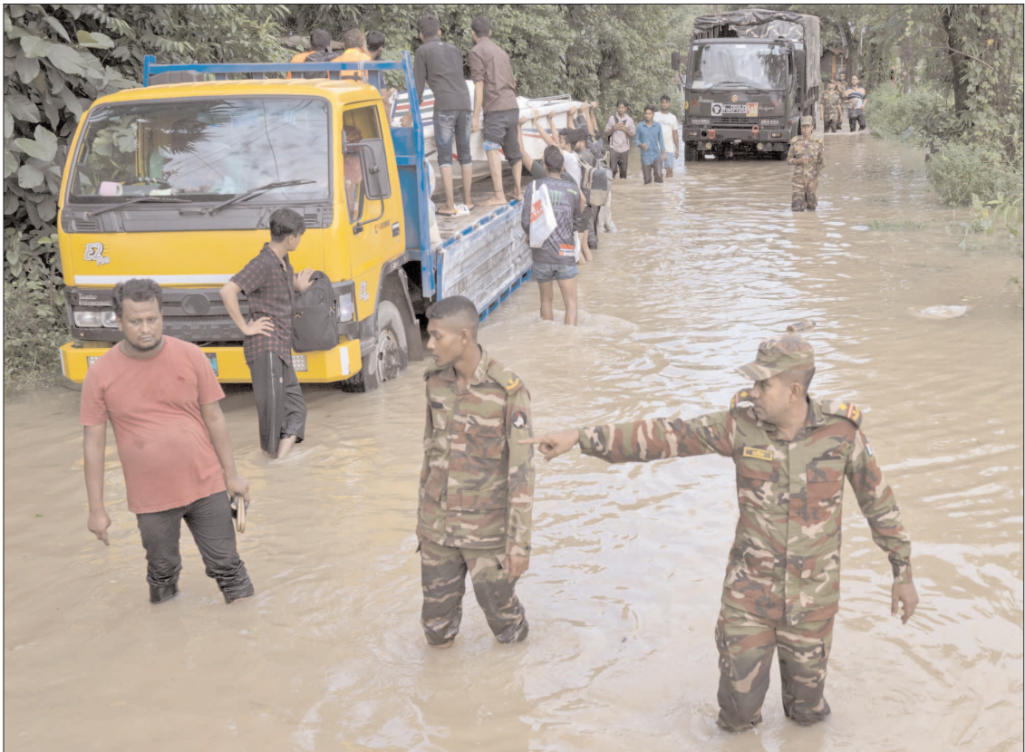
DHAKA: Bangladesh army personnel direct rescue operations for people stranded in flooded residential areas in Feni.