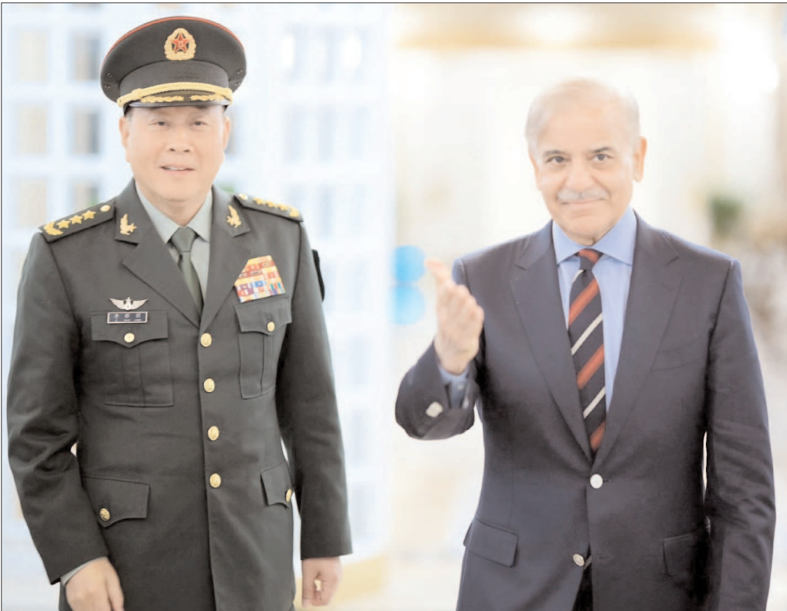
ISLAMABAD: General Li Qiamong, PLA Ground Forces Commander of China called on Prime Minister, Shehbaz Sharif.