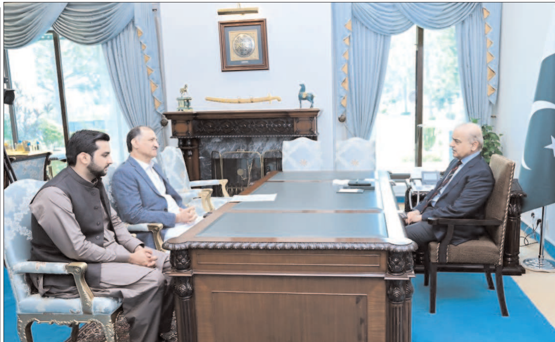
ISLAMABAD: Pakistan's squash legend Jansher Khan called on Prime Minister Muhammad Shehbaz Sharif at PM Office.