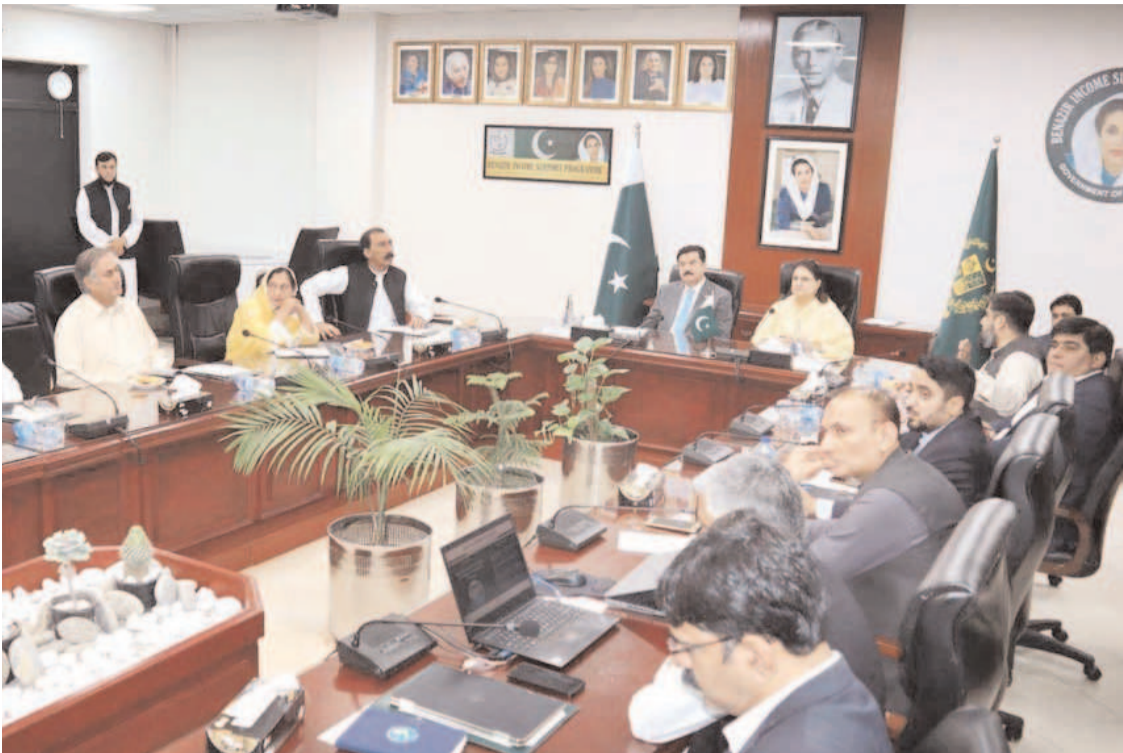
ISLAMABAD: Chairperson Benazir Income Support Programme Senator Rubina Khalid briefs Governor Khyber Pakhtunkhwa Faisal Karim Kundi on BISP's newly launched initiatives at BISP headquarters.

ISLAMABAD (APP): The Islamabad Capital Territory (ICT) administration have announced that the spillways of Rawal Dam will be opened on Tuesday at 4 pm. This measure is being taken as a precaution due to rising water levels in the dam, said the spokesman of ICT administration. Residents living near urban river channels are advised to avoid these areas to stay safe. Those in low-lying regions should ensure they follow all safety measures to protect themselves and their property. In the event of an emergency, the public is encouraged to contact the district administration by dialing 16. Livestock owners are also being told to move their animals to higher ground without delay. The district administration is closely monitoring river channels and bridges, with strict oversight continuing to ensure public safety. All necessary preparations have been made to handle potential flooding, according to the administration.