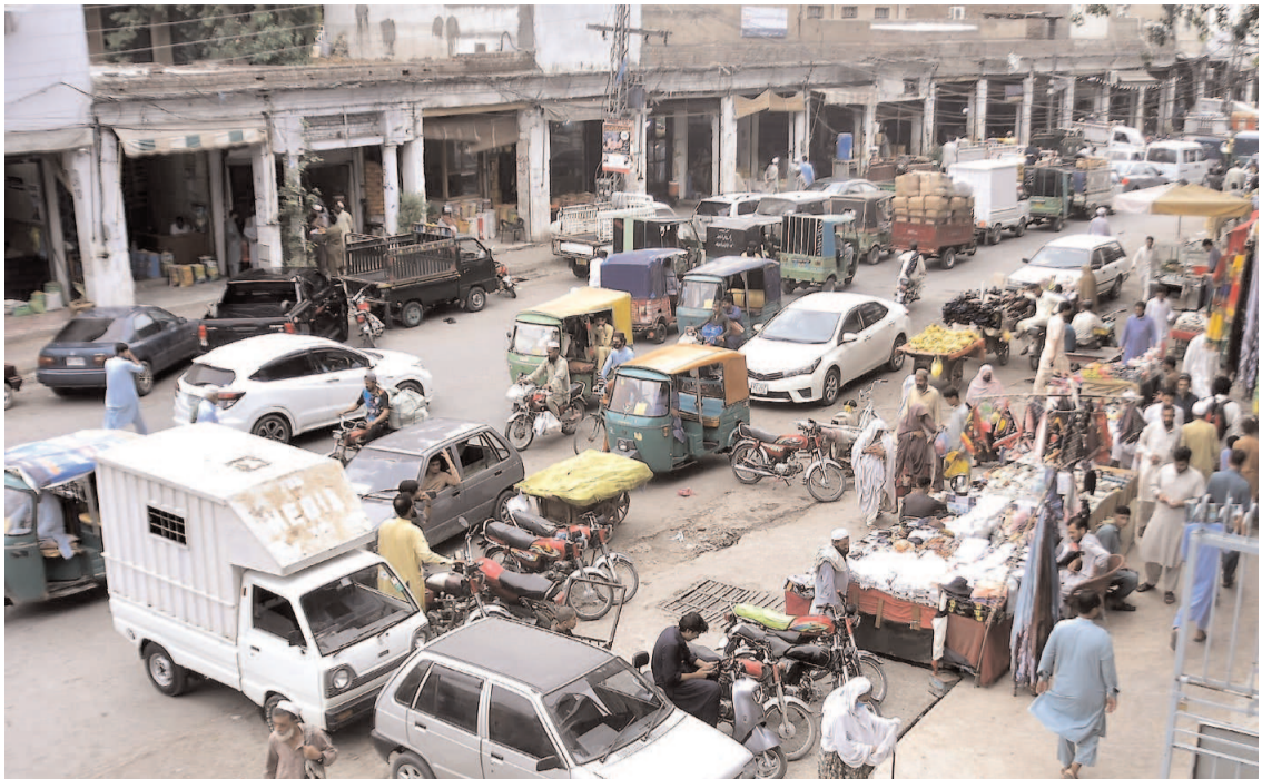
PESHAWAR: Picture shows traffic congestion on busy Ashraf Road. Such views are routine on roads of Khyber Pakhtunkhwa's Capital City.

He added that the Population Welfare Department should remain in constant contact with the public to address this issue responsibly and encourage them to participate. Moreover, non-governmental organizations should share their data with the provincial government.