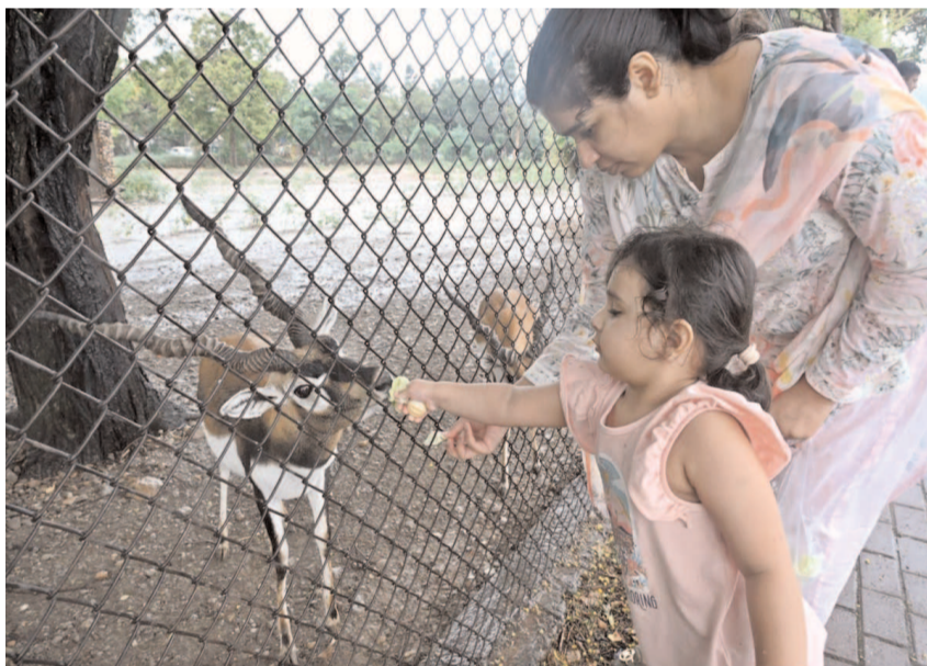
ISLAMABAD: A girl along with her mother feeding to deer in a local park in Federal Capital.

He stated that the building will be sealed pending the investigation. The injured workers are currently receiving medical treatment in a hospital in the federal capital.