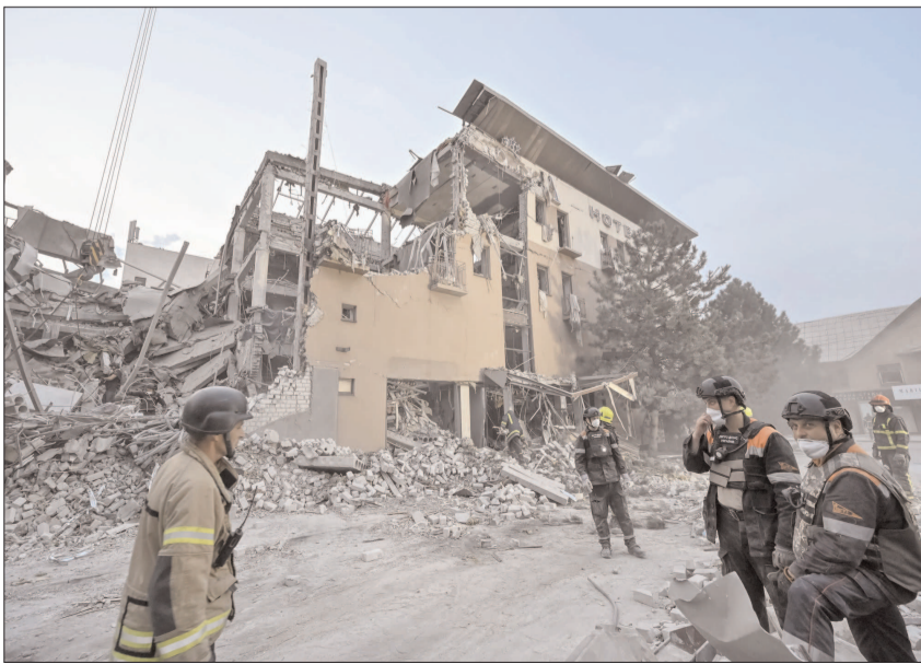
KYIV: Rescue workers busy in relief work in Kryvyi Rih area of Ukraine, after it was hit by a Russian missile.

Zelenskyy, who held a news conference on Tuesday, said Ukraine planned to present a plan on how to end the war with Russia to Biden as well as Democratic and Republican presidential candidates Kamala Harris and Donald Trump. He said the war would eventually end through dialogue but Kyiv had to be in a powerful position at a summit that it hopes to convene this year to advance its vision of peace. — Aljazeera