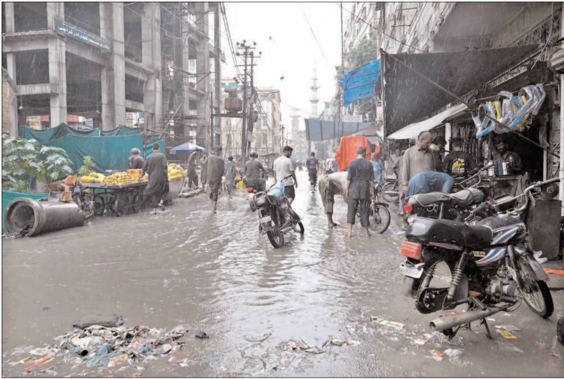
KARACHI: A view of stagnant rain water at old city area during monsoon rain in the metropolis.