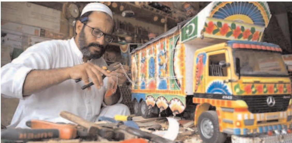
PESHAWAR: A craftsman is giving final touches to a decoration item 'truck' at his workplace near the Dabgari area.

slaughterhouse is fully operational within the designated time, providing convenience to those involved in the livestock sector. He added that the provincial government of Khyber Pakhtunkhwa is taking comprehensive measures to provide facilities to the public and those associated with various sectors, including livestock.