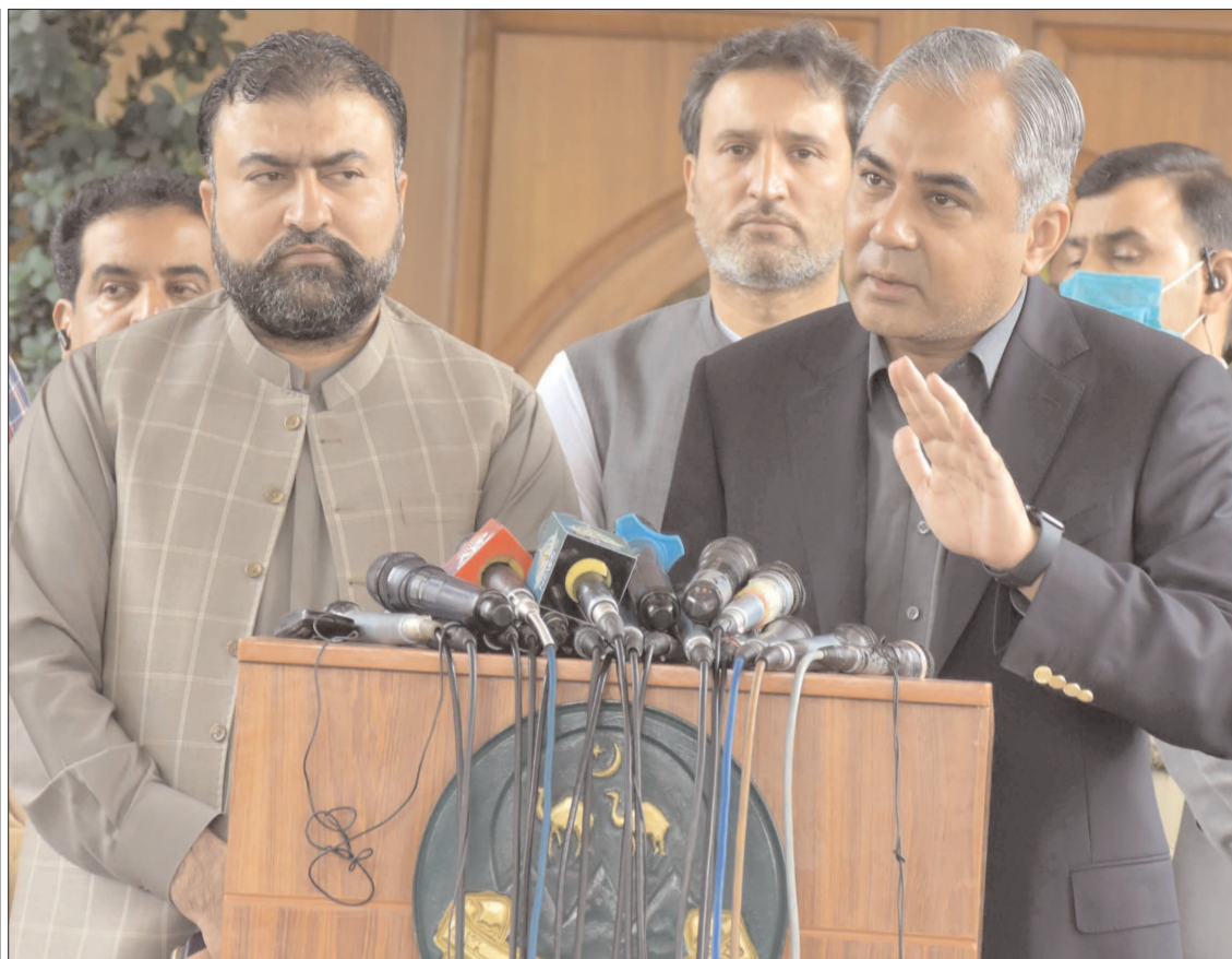
QUETTA: Federal Minister for Interior, Mohsin Naqvi and Chief Minister of Balochistan, Mir Sarfraz Bugti addressing a press conference.

District Emergency Rescue Officer, Sanaullah taught students about life-saving techniques and procedures to meet emergencies. The students were told about fire safety drills, safety plan during calamities, first aid and resuscitation methods and fracture management.