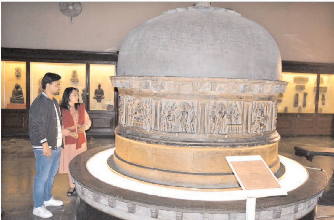
LAHORE: Students visiting rare historical cultural artwork and sculptures in the Historical Lahore Museum.