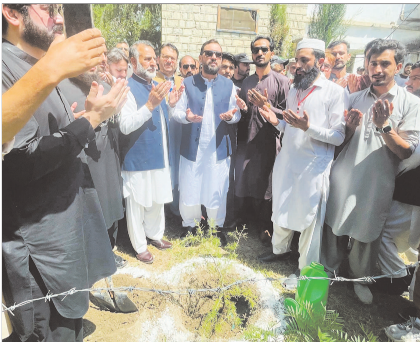
UPPER DIR: KP Minister for Higher Education, Meena Khan Afridi sapling a plant during his visit to Government Degree College.

Enroll more and more in public schools, further he said that in the last few years, with the better strategy of the education department and the hard work and cooperation of the teachers, there has been a big increase in the enrollment of government schools, which they are happy about. He further said that soon the basic problems faced in government schools will be solved on a priority basis so that the architects of the future can serve the country and the nation with free and quality education.