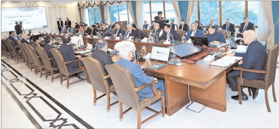
ISLAMABAD: Prime Minister, Shehbaz Sharif chairing a meeting of federal cabinet.

Khan also emphasised that the certificate provided for 39 candidates was applicable to all candidates. He expressing confidence that local body elections would occur on time, with PTI expected to achieve a clean sweep if they do.