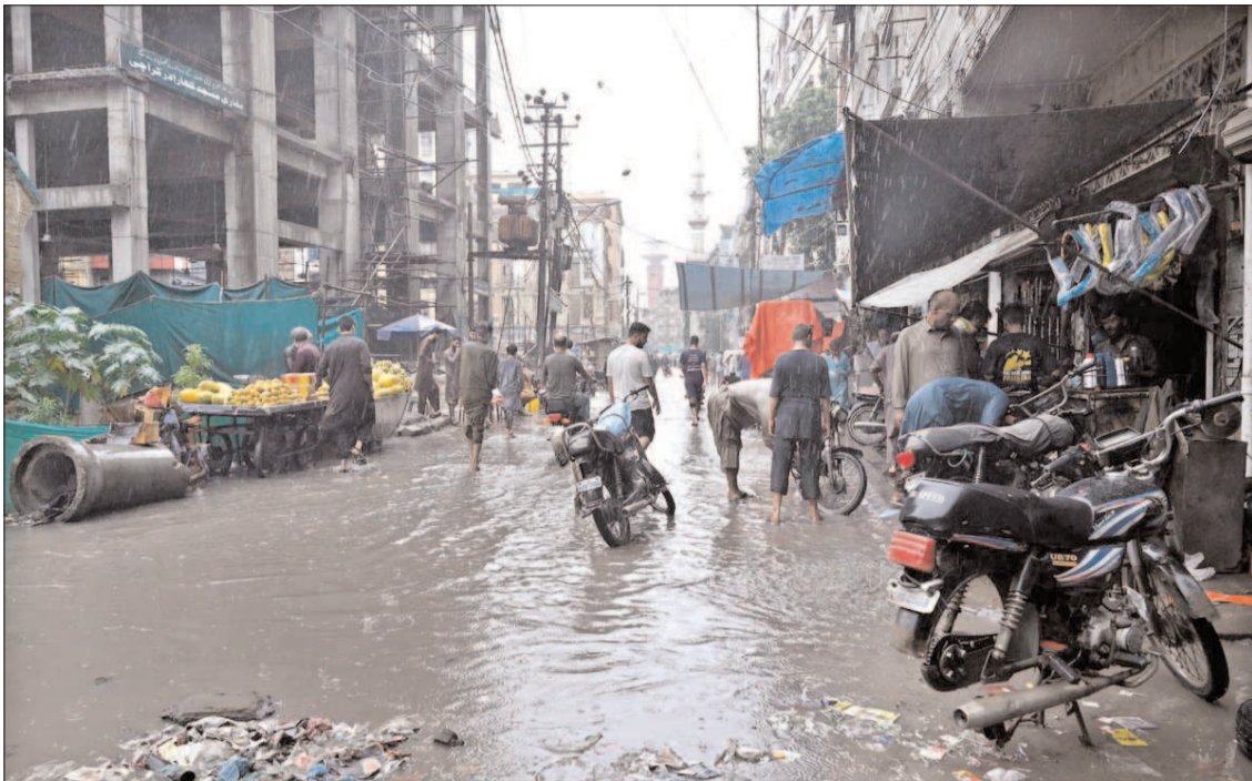
KARACHI: A view of stagnant rain water at old city area during monsoon rain in the metropolis.