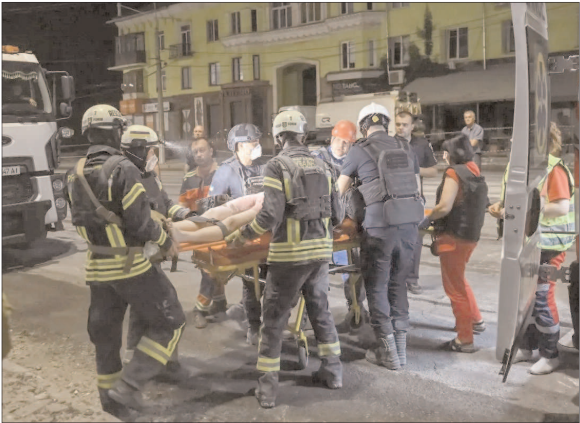
KYIV: Rescue and medical workers treat a wounded resident at the site of a Russian strike in Kryvyi Rih, Ukraine.