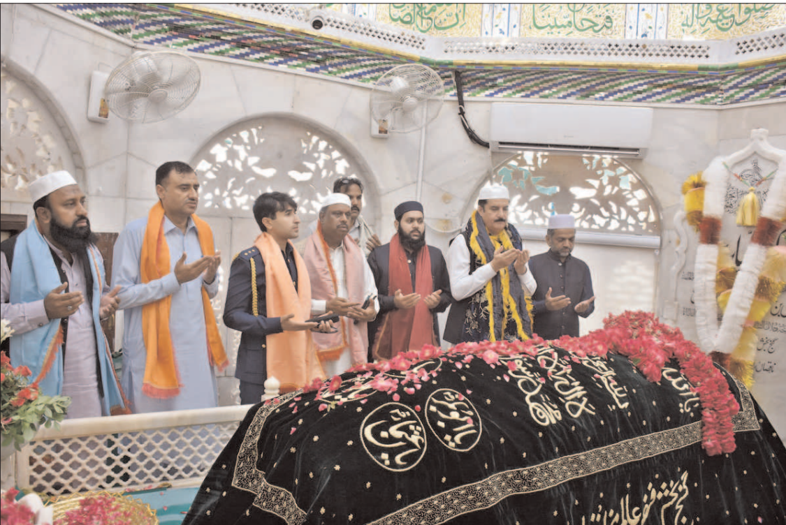
LAHORE: Governor Khyber Pakhtunkhwa Faisal Karim Kundi offering dua at the shrine of Hazrat Data Ganj Bakhsh Ali Hajveri.

These properties included private schools, grocery shops, property offices, tailor shops, motorcycle shops, catering centers, and steel stores. Prior to the operation, several notices were issued to the owners of these properties. DG LDA, Tahir Farooq, reiterated that the crackdown on illegal constructions and commercial fee defaulters will continue without any discrimination.