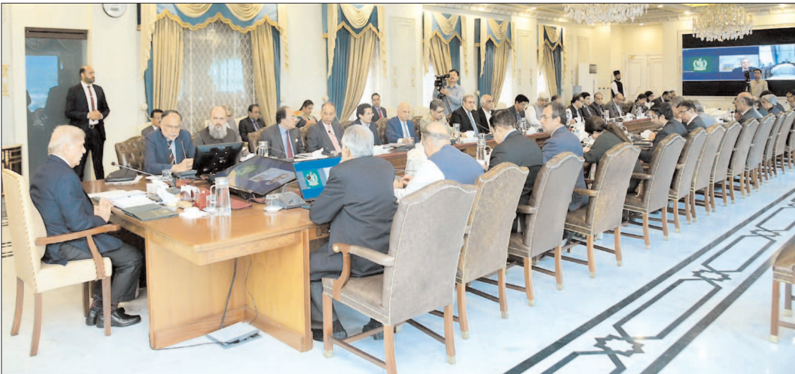
ISLAMABAD: Prime Minister Shehbaz Sharif chairing a review meeting regarding economic growth and investment.

Vol. XXXIXI No. 215 Regd. No. 241 SAFAR 23 1446 -- THURSDAY, AUGUST 29 2024 PESHAWAR EDITION 12 PAGES PRICE. 30