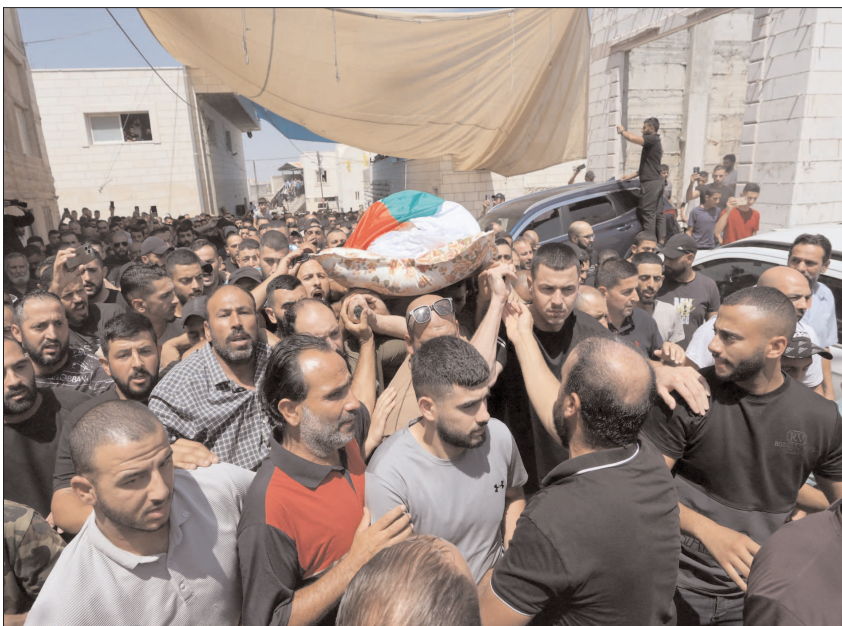
WEST BANK: Mourners carrying the body of a 40-year-old Palestinian who was killed in an attack by Israeli settlers, during his funeral near Bethlehem.