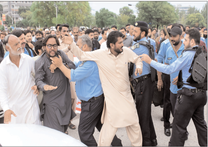
ISLAMABAD: Employees of PWD scuffle with police during a sit-in in favour of their demands.

It said that the upgrade to Caa2 from Caa3 rating also applied to the backed foreign currency senior unsecured ratings for The Pakistan Global Sukuk Programme Co Ltd. The associated payment obligations were, in their view, direct obligations of the Government of Pakistan, it said adding, that the outlook for The Pakistan Global Sukuk Programme Co Ltd was positive.