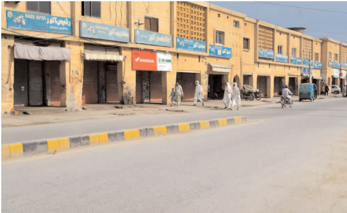
PESHAWAR: View of a deserted City market as traders observed shutdown strike against increasing electricity bills.