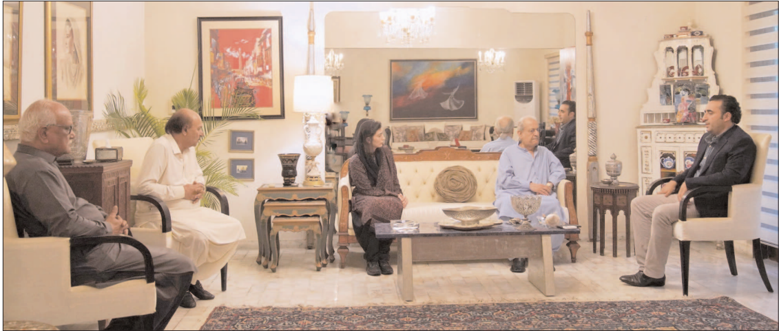
ISLAMABAD: Chairman PPP Bilawal Bhutto Zardari and MNA Bibi Aseefa Bhutto Zardari visit residence of senior PPP leader Senator Mian Raza Rabbani to offer condolences on passing of his sister