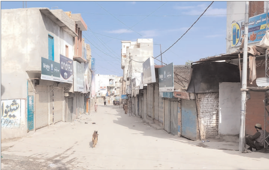
LANDI KOTAL: Shops closed due to nationwide shutter down strike of traders' against high electricity tariff and unjust taxes.