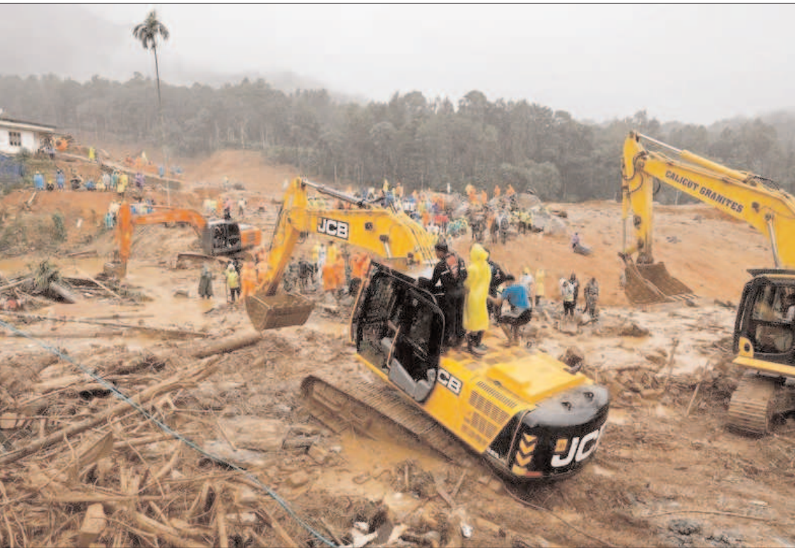
CHOOALMALA: Search operations are carried out after landslides hit Mundakkai village in Wayanad district in southern state of Kerala, India.

At the time, the president vowed that his executive order would "help us gain control of our border". He added that "doing nothing is not an option". Government data shows that the number of migrants stopped at the US-Mexico border had dropped even before the order. Border Patrol recorded 141,000 apprehensions in February, 137,000 in March, 129,000 in April, 118,000 in May and 84,000 in June. The figures do not include official border crossings, where the Biden administration has been processing around 1,500 migrants each day through a smart-phone app that schedules appointments between migrants and US border agents.