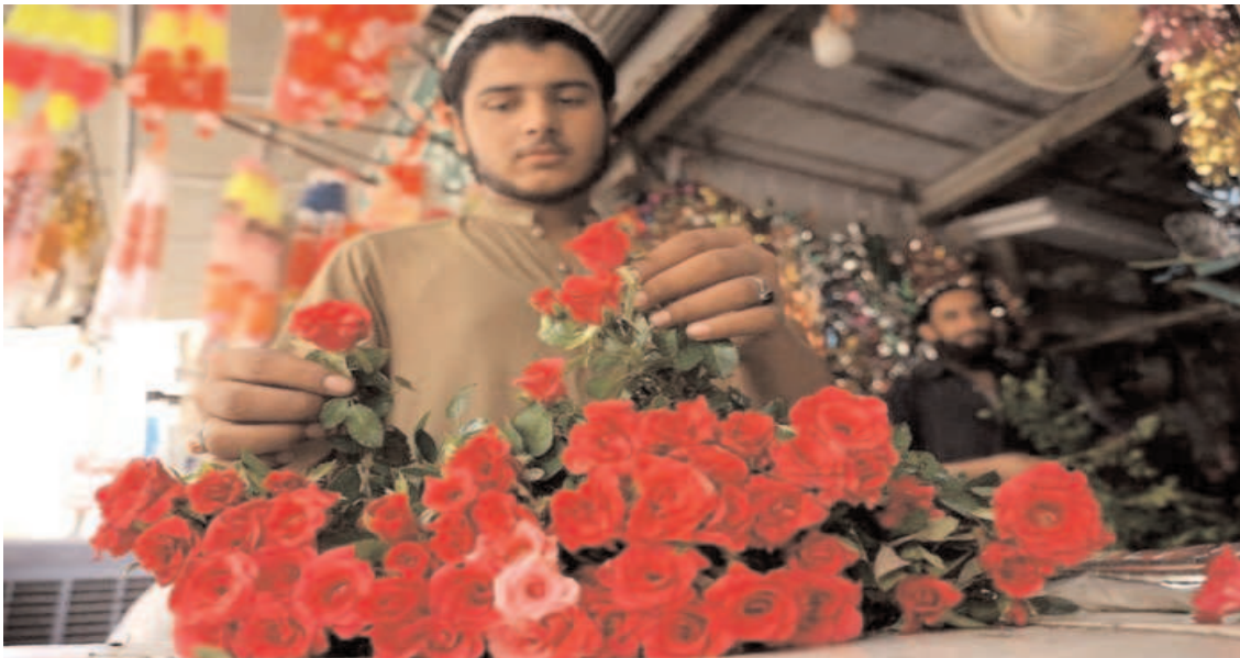
PESHAWAR: A vendor picks red roses to create bouquets at Fawara Chowk.