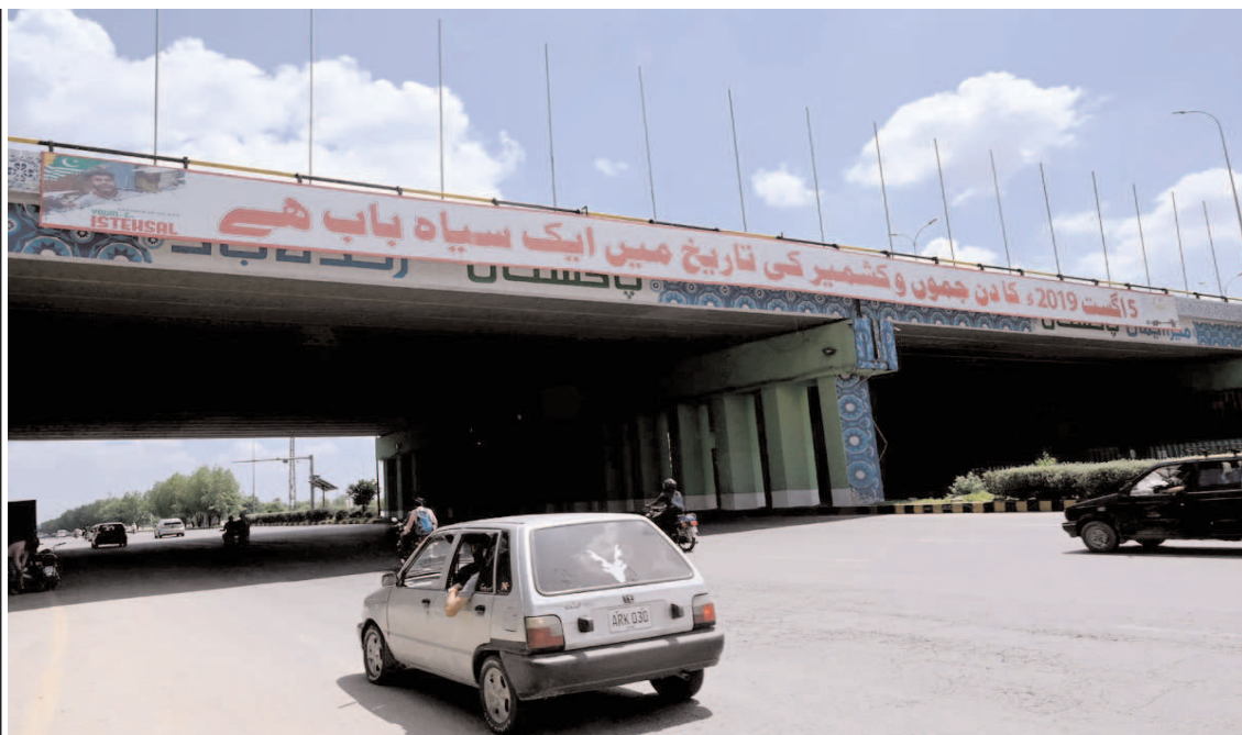
ISLAMAAD: A large banner hangs over the Zero Point Bridge in Federal Capital, observing a commemorative 5 August 2019 as a Black Day in the history of Jammu and Kashmir.

Citizens are urged to cooperate with police and report any suspicious activity or information through the emergency helpline "Pucar-15" or the "ICT-15".