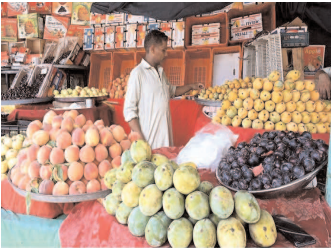
ISLAMABAD: A vendor arranges and displays colorful seasonal fruits each fruit attracts customers with its fresh appeal at H-9 weekly bazaar in Federal Capital.

The central bank, however, opened the door to reducing borrowing costs as soon as its next meeting in September. Financial markets are also expecting rate cuts in November and December.