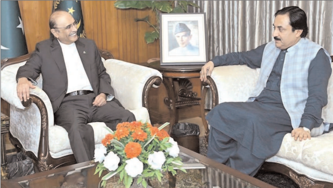
ISLAMABAD: Acting Chairman Senate, Syedaal Khan, called on President Asif Ali Zardari, at Aiwan-e-Sadr.

Last month, three colliers died and four others were injured in an explosion that rocked a coal mine in Khyber Pakhtunkhwa's District Kohat. KP police informed media men that the rescue and other law-enforcement agencies teams were rushed to the accident site.