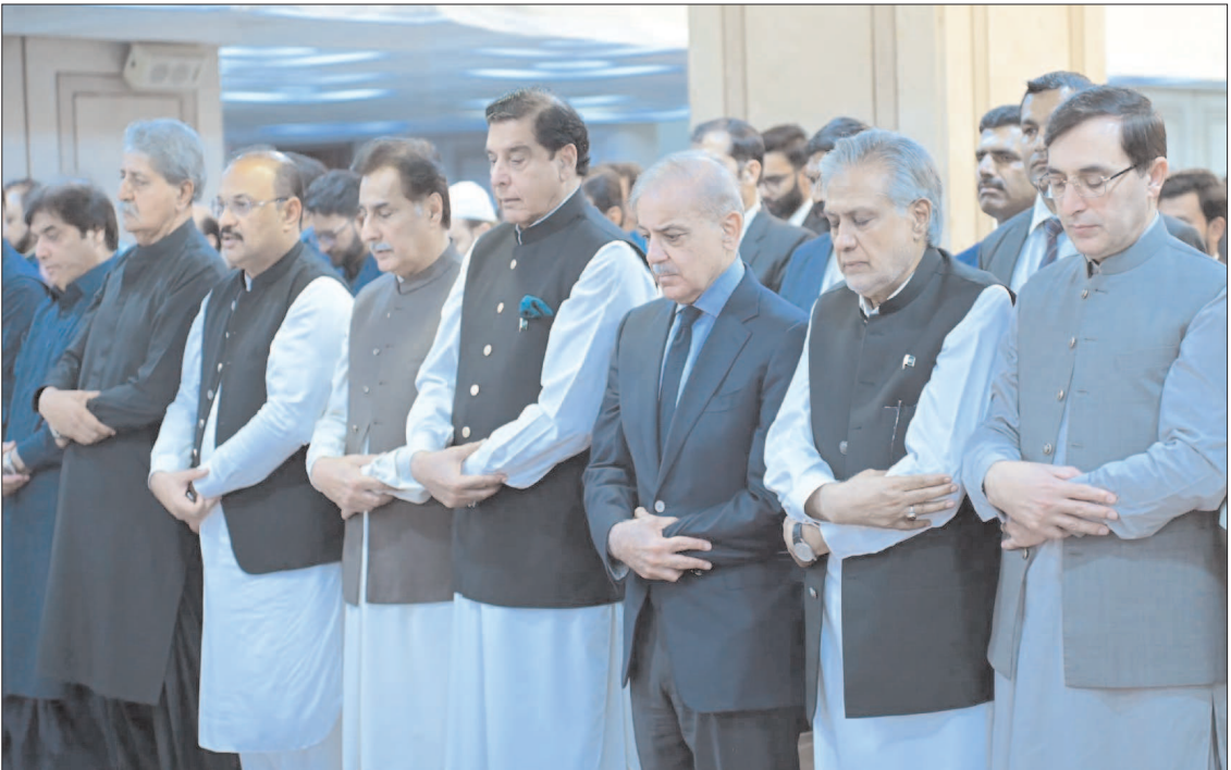
ISLAMABAD: Prime Minister Shehbaz Sharif and parliamentarians offering funeral prayer of Ismail Haniyeh.

Earlier, Sharif informed the Cabinet that the government, allied parties, the foreign office, the deputy prime minister, as well as China and Russia, had all strongly condemned the brutal assassination of Ismael Haniyeh. He emphasized that this horrific act should shake the conscience of global organizations. During Friday prayers, funeral prayers in absentia were to be offered for the departed soul of Ismael Haniyeh across mosques in the country, including in the mosque at the prime minister's residence.